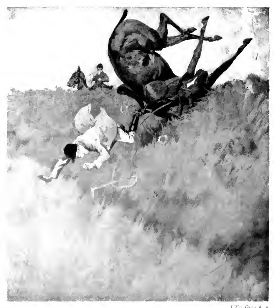
"THE HORSE TURNED A COMPLETE SOMERSAULT"