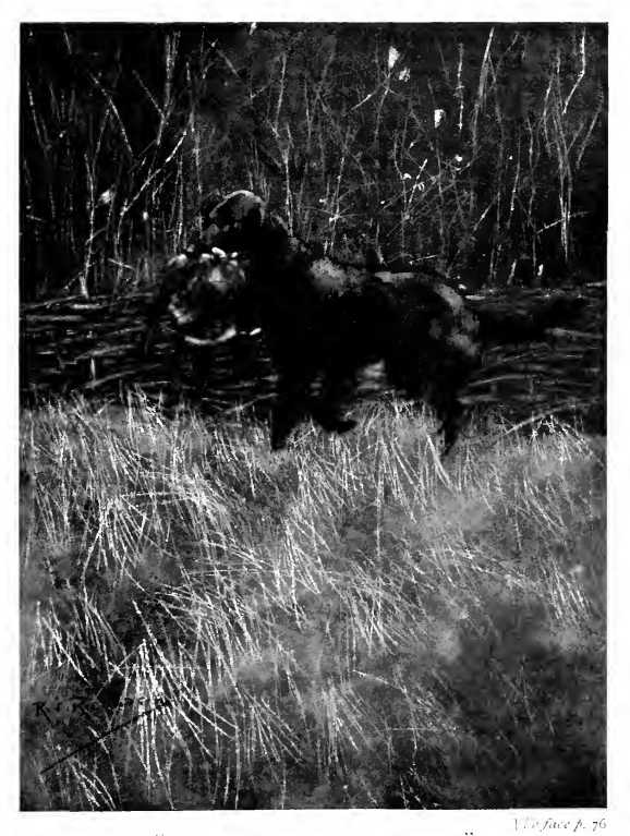
"JET: A GOOD TYPE OF REIRIEVER"