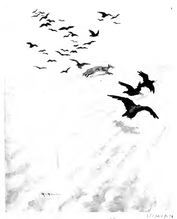
"YONDER HE GOES!"