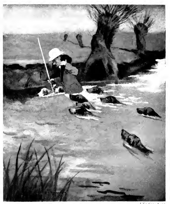
"CARRYING THE OTTER ASHORE"