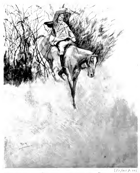
"A BULLFINCH AND A DROP"