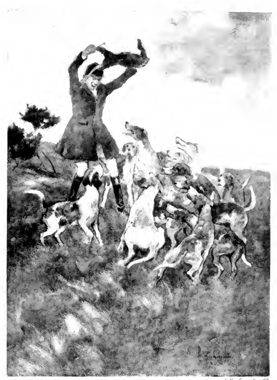
"KILLED IN THE OPEN"