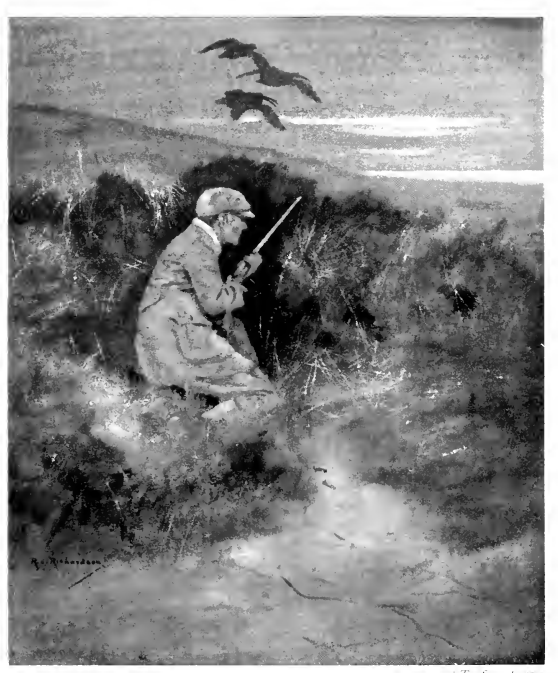
"PEEP O' DAY ON THE SALTINGS"