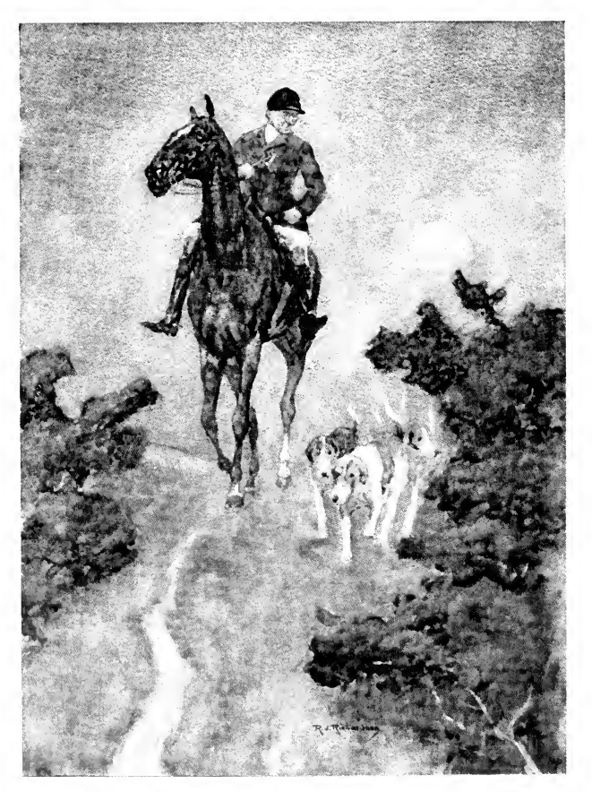
ALL N. L. D. & Manual