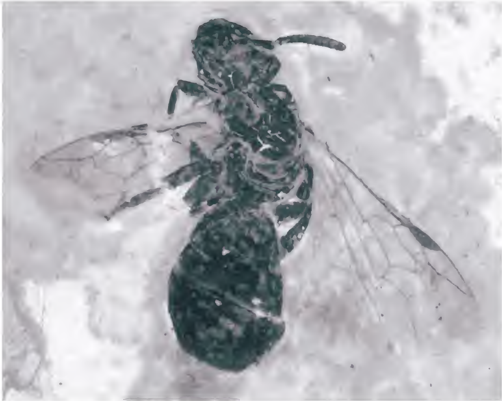
Fig. 2. Photomicrograph of holotype of Halictus petrefactus , new species (MPZ-98/423). Total length of specimen = 8.2 mm.

times vein width (i.e., 1m-cu and 2m-cu [recurrent veins] enter separate submarginal cells); 2rs-m arcuate; pterostigma elongate, length about three times width, border inside marginal cell convex; apex of marginal cell acute, minutely separated from wing margin; first submarginal cell elongate, nearly as long as combined lengths of second and third submarginal cells; second submarginal cell shorter than third submarginal cell, trapezoidal shape, posterior and anterior borders not parallel, posterior border diverging apically toward 1m-cu, anterior border slightly shorter than that of anterior border of third submarginal cell; third submarginal cell with posterior border nearly 1.5 times length of anterior border. Hind wing as depicted in figure 3; only a few hamuli observable (three just distad separation of R, two near termination of costa). Wing veins black, membrane hyaline. Legs black except tarsi (where preserved and evident) apparently dark brown; metafemoral scopa present (setae