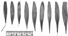
Figure 1. Samara variation in Fraxinus profunda .