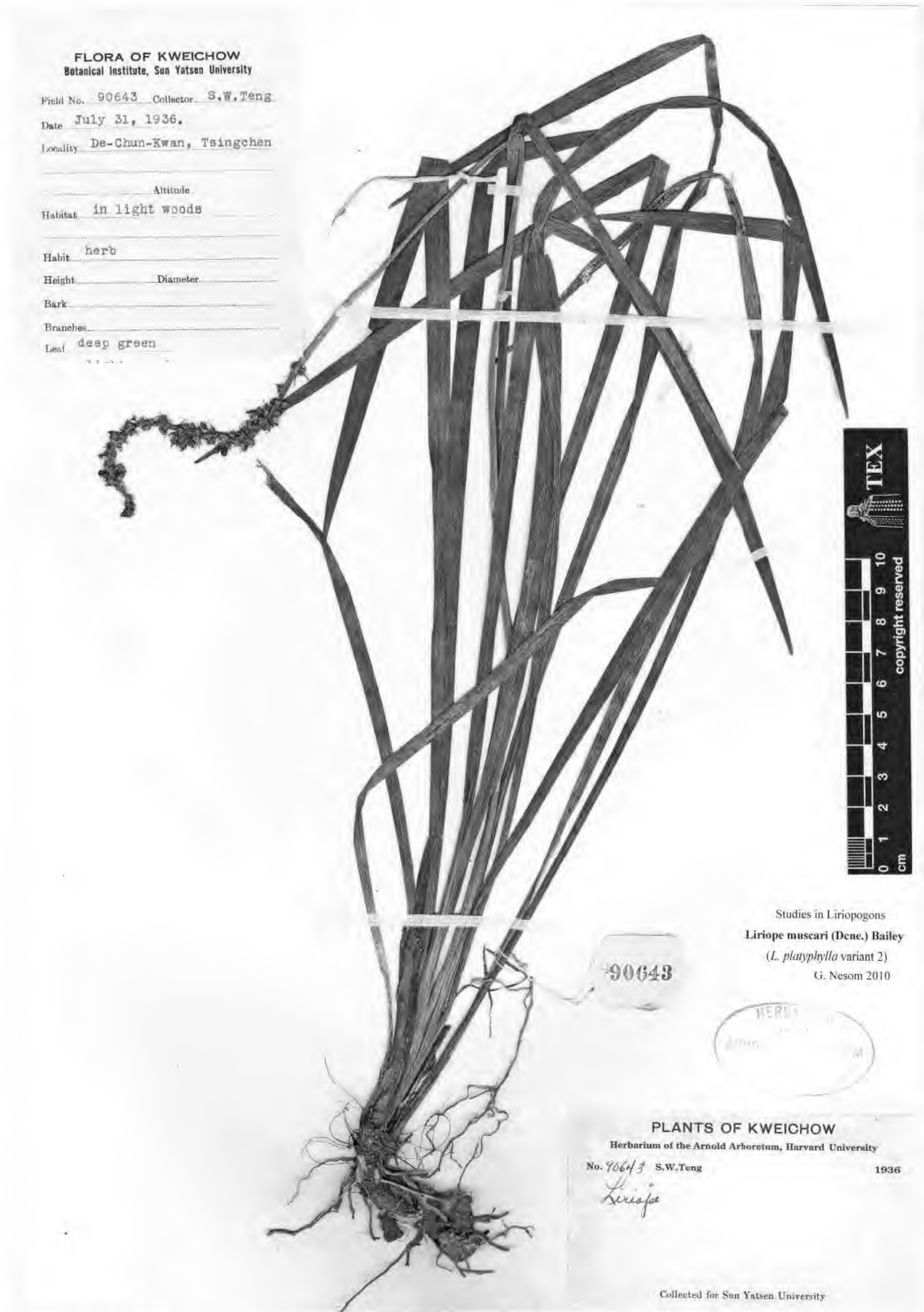
Figure 8. Liriope muscari sensu lato, variant of “platyphylla” expression (see comments in text).