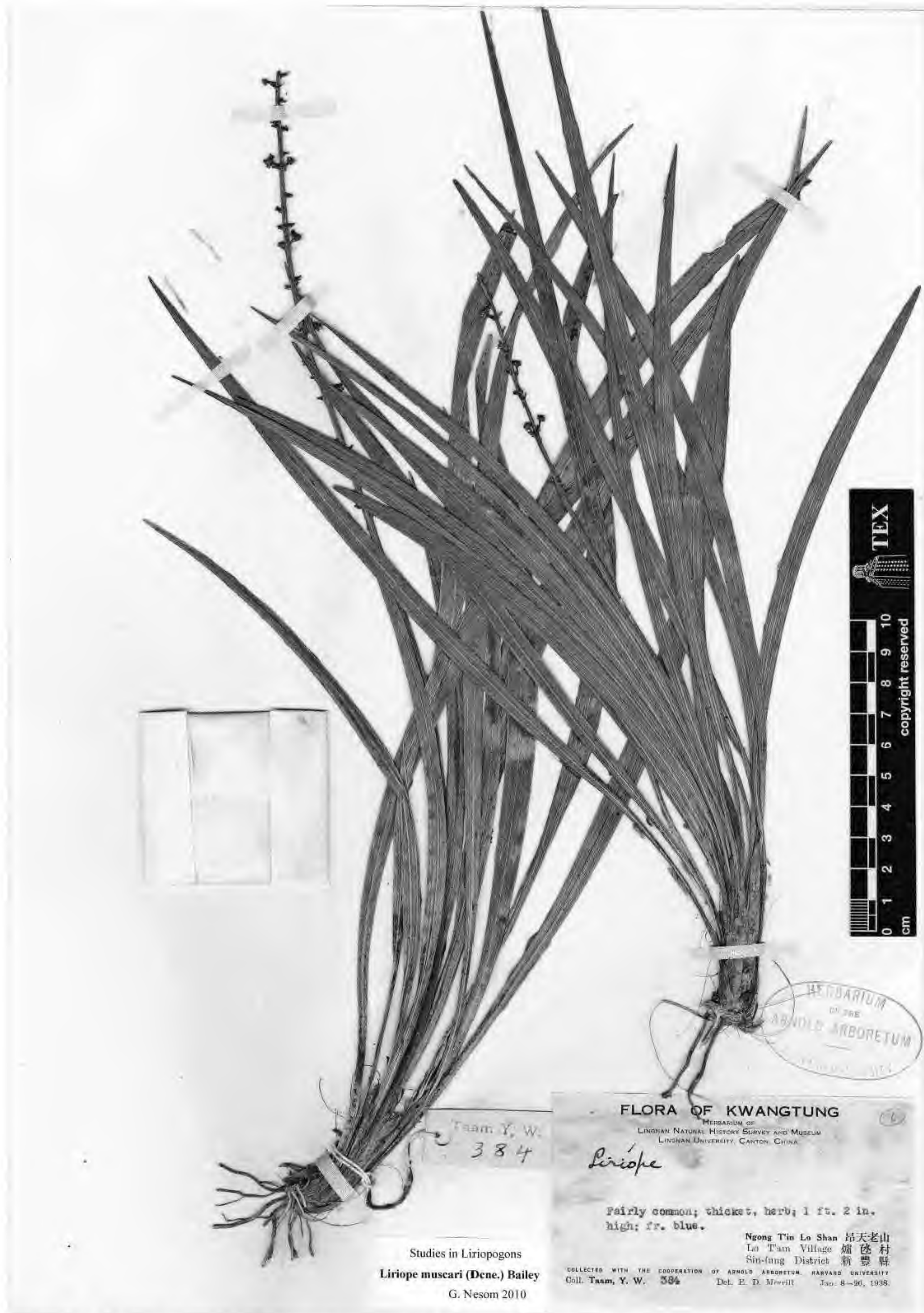
Figure 4. Liriope muscari , typical expression. Base apparently strictly caespitose.