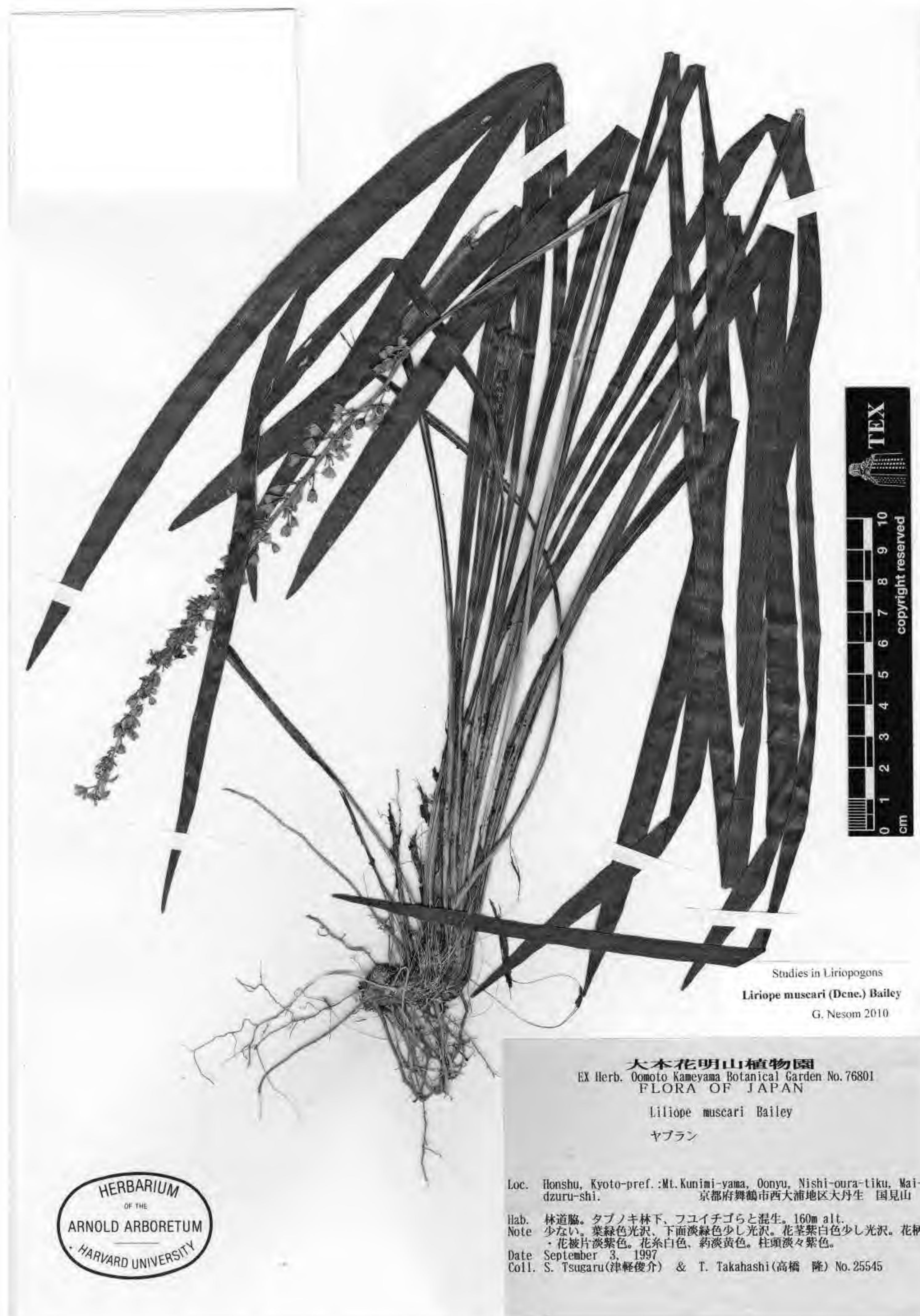
Figure 3. Liriope muscari , typical expression. Note the short, thickened rhizome, apparently more commonly characteristic of this species in Japan than elsewhere.