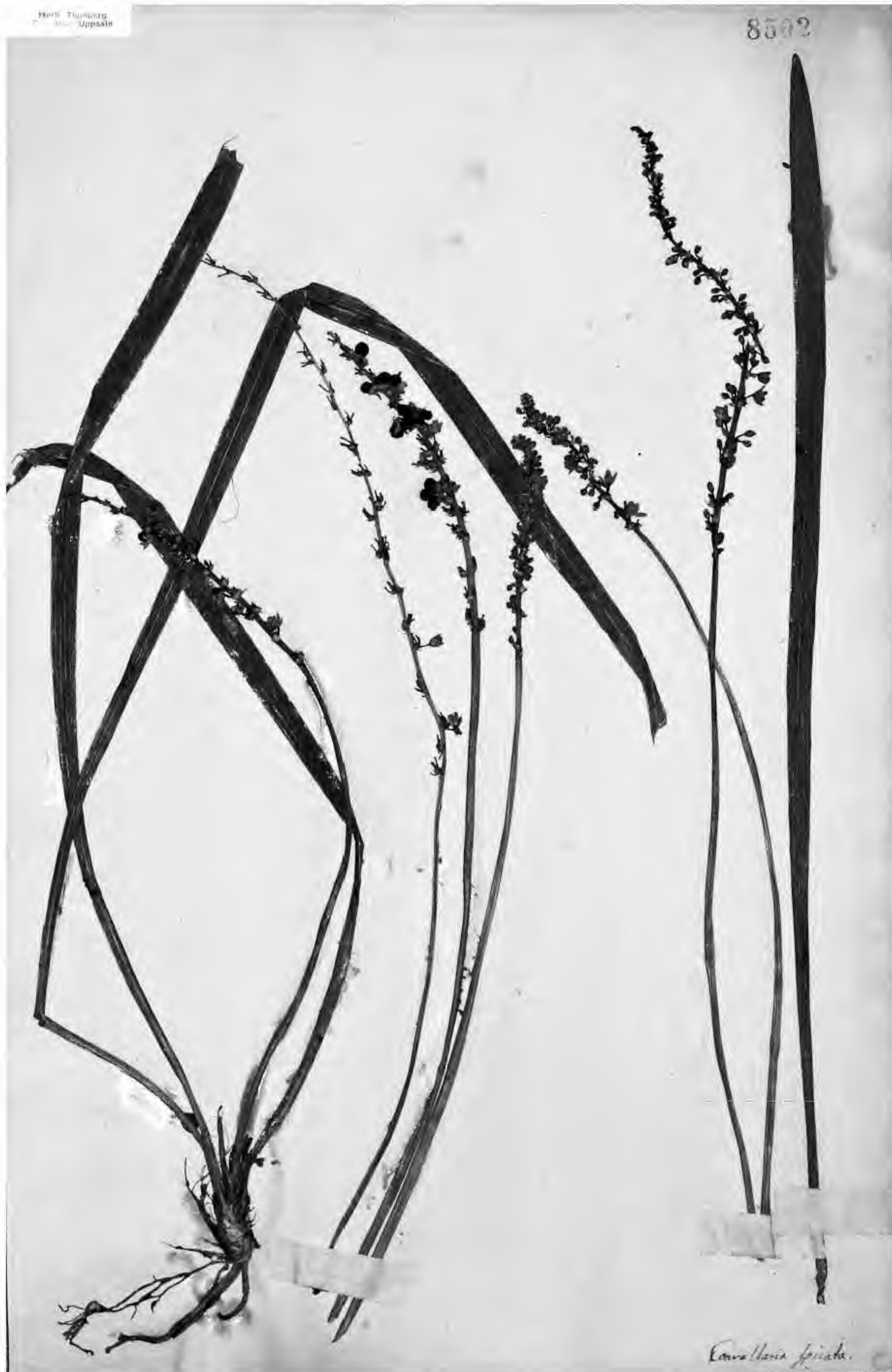
Figure 1. Holotype of Convallaria spicata Thunb. at UPS. Identified here as Liriope muscari (Dcne.) L.H. Bailey.