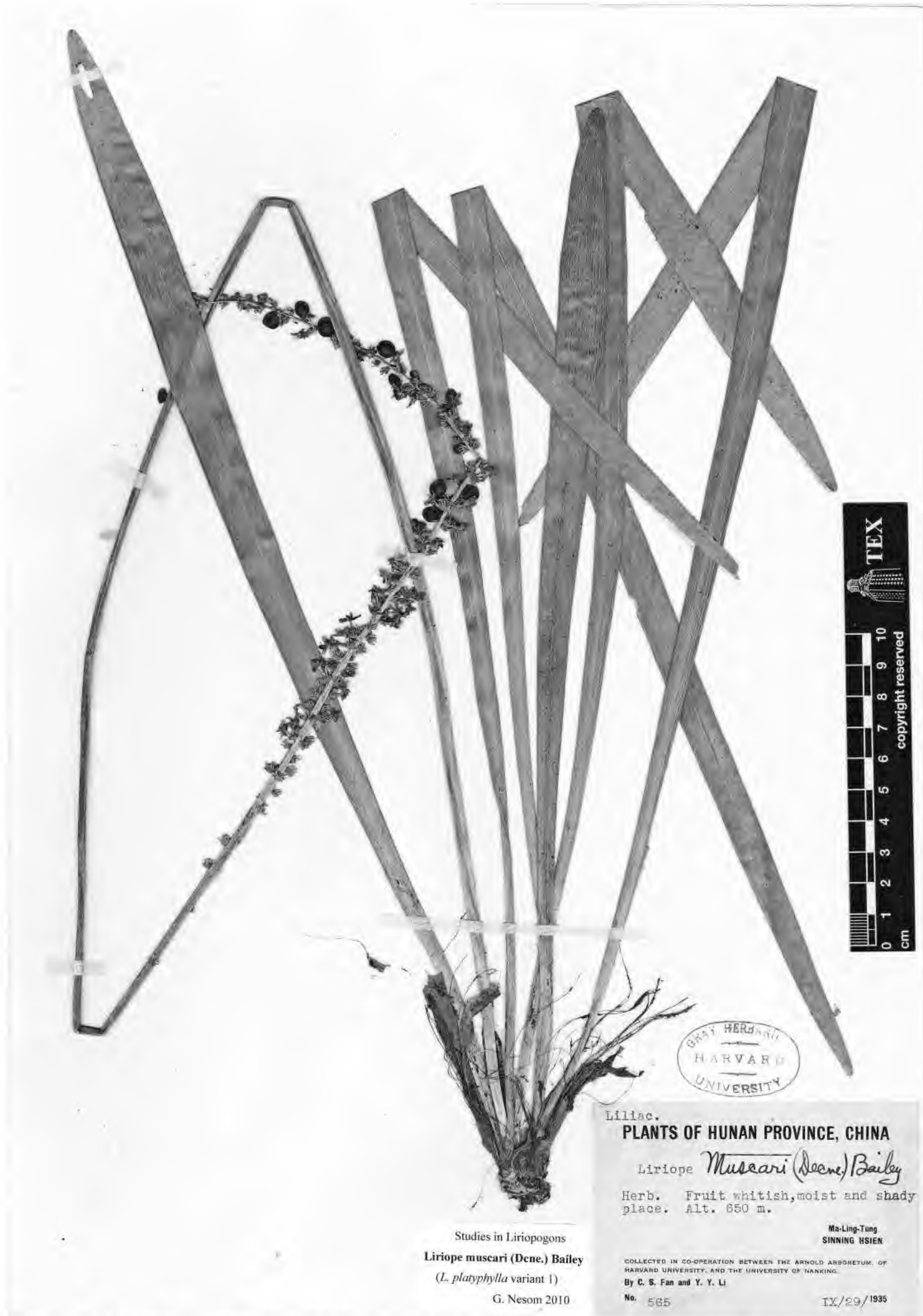
Figure 6. Liriope muscari sensu lato, “platyphylla” expression (see comments in text).