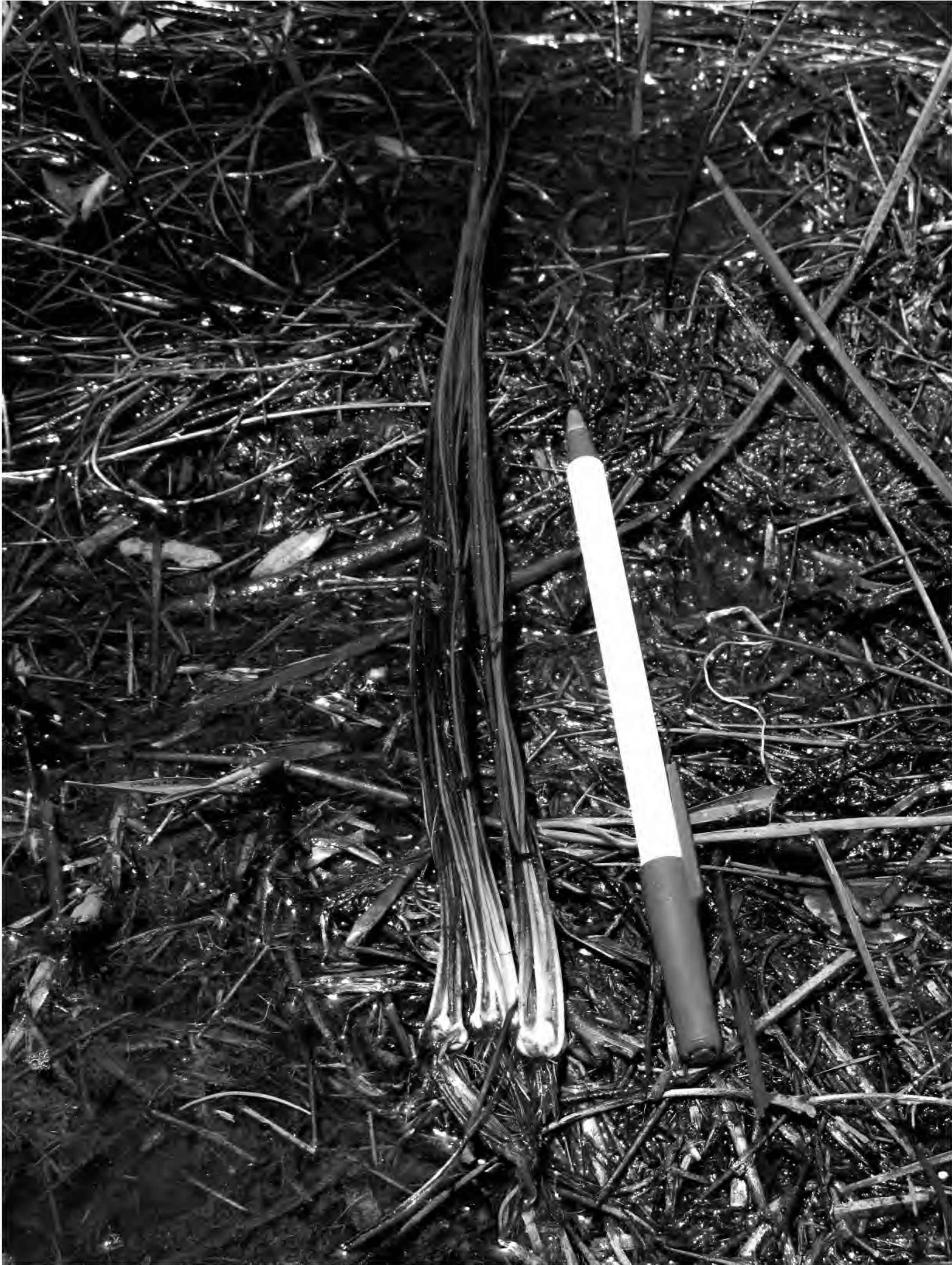
Figure 2. Isoetes texana (Singhurst 18336, holotype, BAYLU) immediately after collection. The pen is 18 cm long.