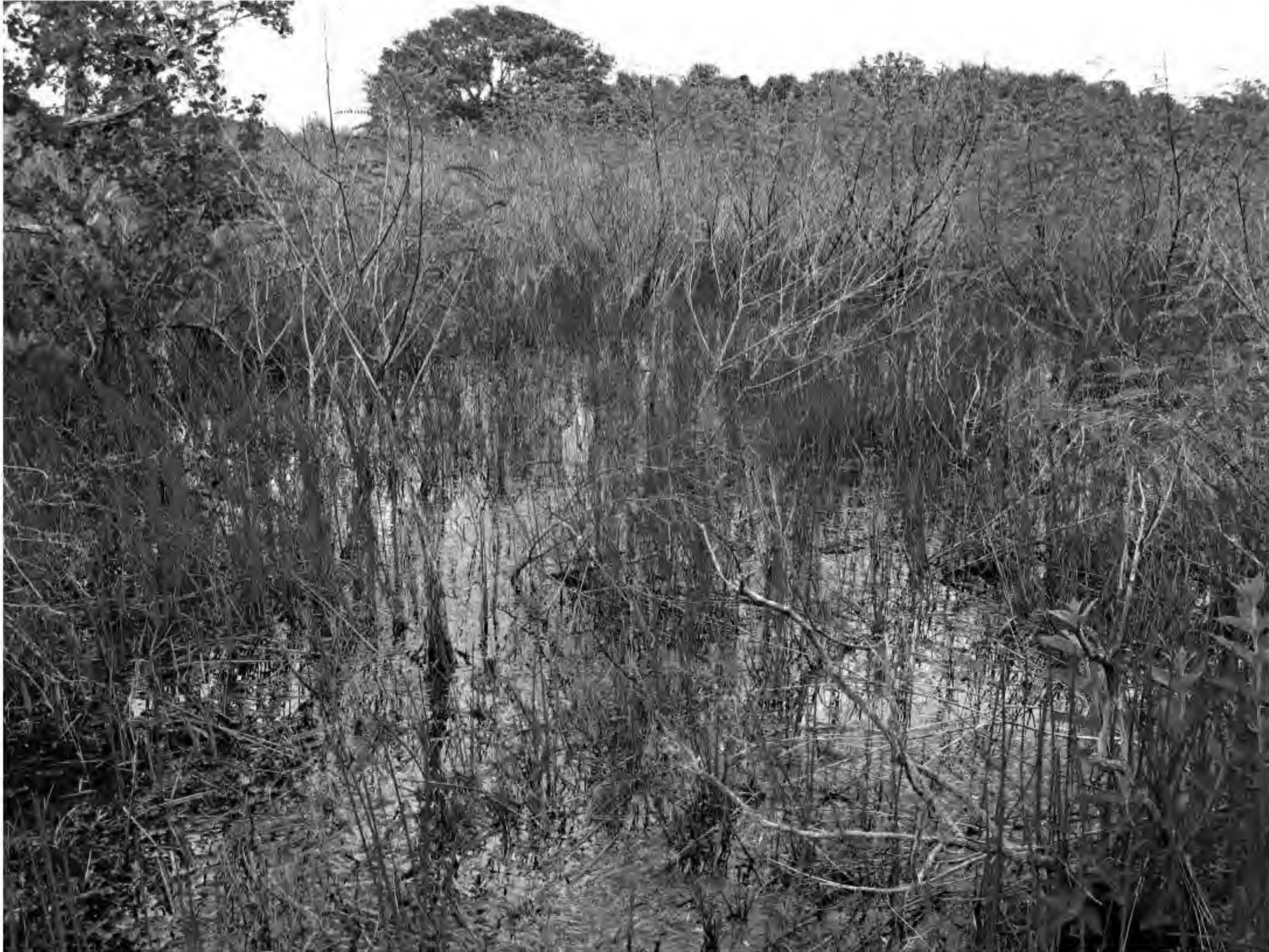
Figure 4. Freshwater depression pond at the type locality on the Falcon Point Ranch in Calhoun County.

Presently, Isoetes texana is known only from Aransas and Calhoun counties. It is limited to freshwater ponds and interdunal swales in neutral to moderately alkaline sands of Pleistocene and to Holocene barrier islands in the Gulf Coastal Bend of southern Texas. The vegetation is dominated by Rhynchospora spp., Fuirena spp., Eleocharis spp., and Cyperus spp. The dominant species include Fuirena scirpoidea , Fuirena longa , Rhynchospora microcarpa , and Rhynchospora divergens . Other characteristic and common species include Rhynchospora nitens , Cyperus oxylepis , Cyperus polystachyos var. texensis , Eleocharis geniculata (= Eleocharis caribaea ), Eleocharis flavescens , Eleocharis montevidensis , Eleocharis parvula , Xyris jupicai , Agalinis fasciculata , Bacopa monnieri , Buchnera americana (= Buchnera floridana ), Oldenlandia uniflora (= Hedyotis uniflora var. fasciculata ), Spiranthes vernalis , Drosera brevifolia , and Utricularia subulata . This plant community association occupies sandy depressions of variable hydrology. Some ponds draw down and desiccate in drier periods, but Isoetes texana seems restricted to those that hold water throughout the year (based upon limited observations). Structure varies with depth of water (or depth to water table) and frequency of inundation, and composition ranges from a sparse cover of tufted annuals to complete coverage by rhizomatous perennials.