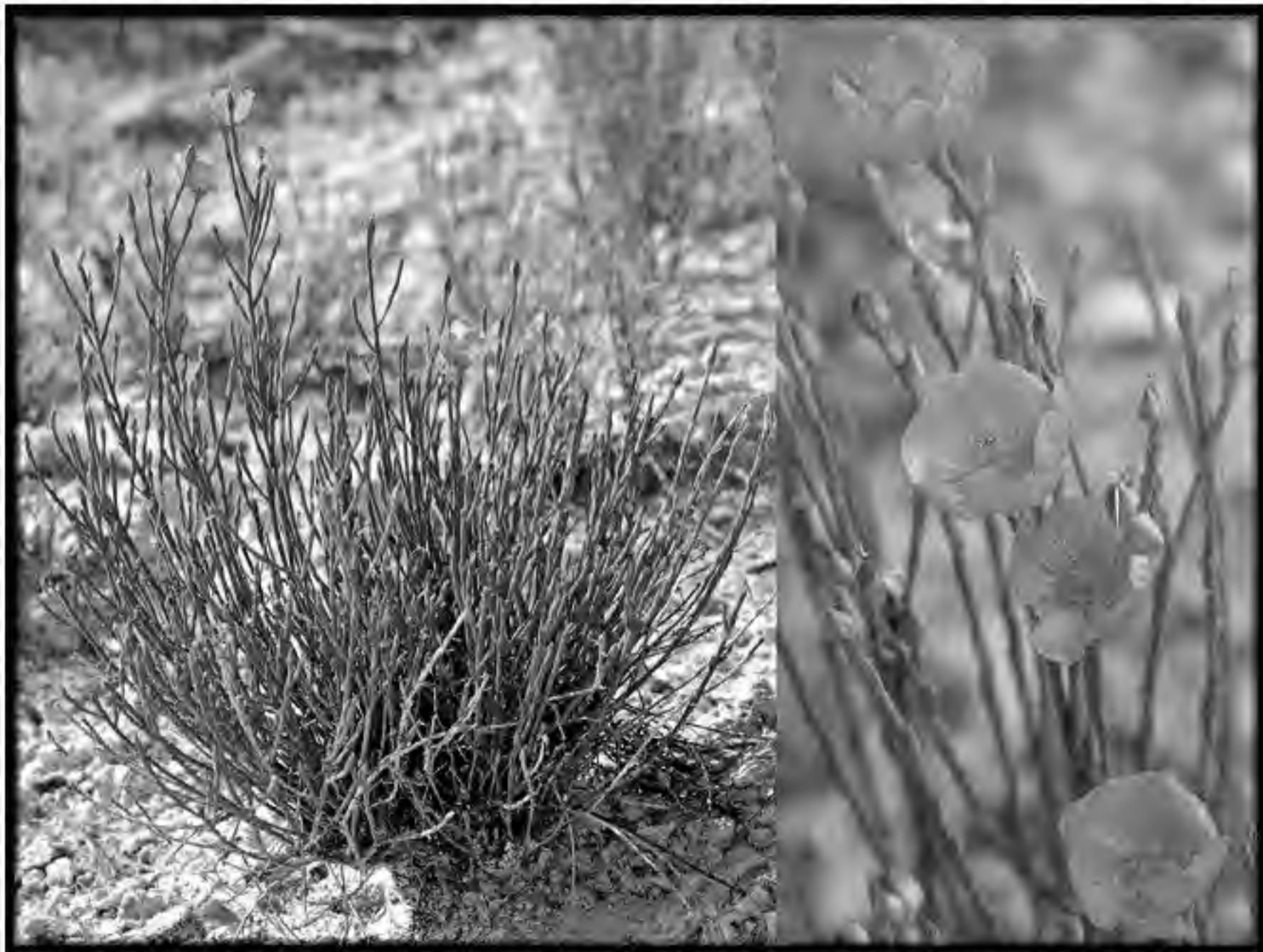
Figure 3. Linum allredii habit and flowers, Yeso Hills, Eddy County, New Mexico, 31 July 2008.

The ability to reproduce asexually by sprouting shoots from lateral roots up to 3 dm away from a parent plant is unique to Linum allredii in Linum series Rigida . Perennial habit in the species of this series is rare and the other perennials do not root sprout. Asexual reproduction in L. allredii is interesting but not considered diagnostic because it is more a capability than a tendency. Most individuals remain solitary while only a few sprout multiple clones from lateral roots in response to environmental influences such as soil structure or surface erosion. Approximately 20% of a sample of 106 plants studied at the type locality exhibited surface evidence of distant sprouting and caudex development along lateral roots.