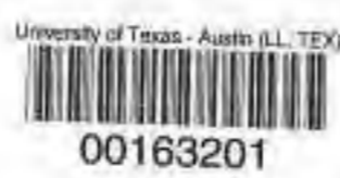
Figure 1. Osmorhiza geohintonii (holotype: TEX).