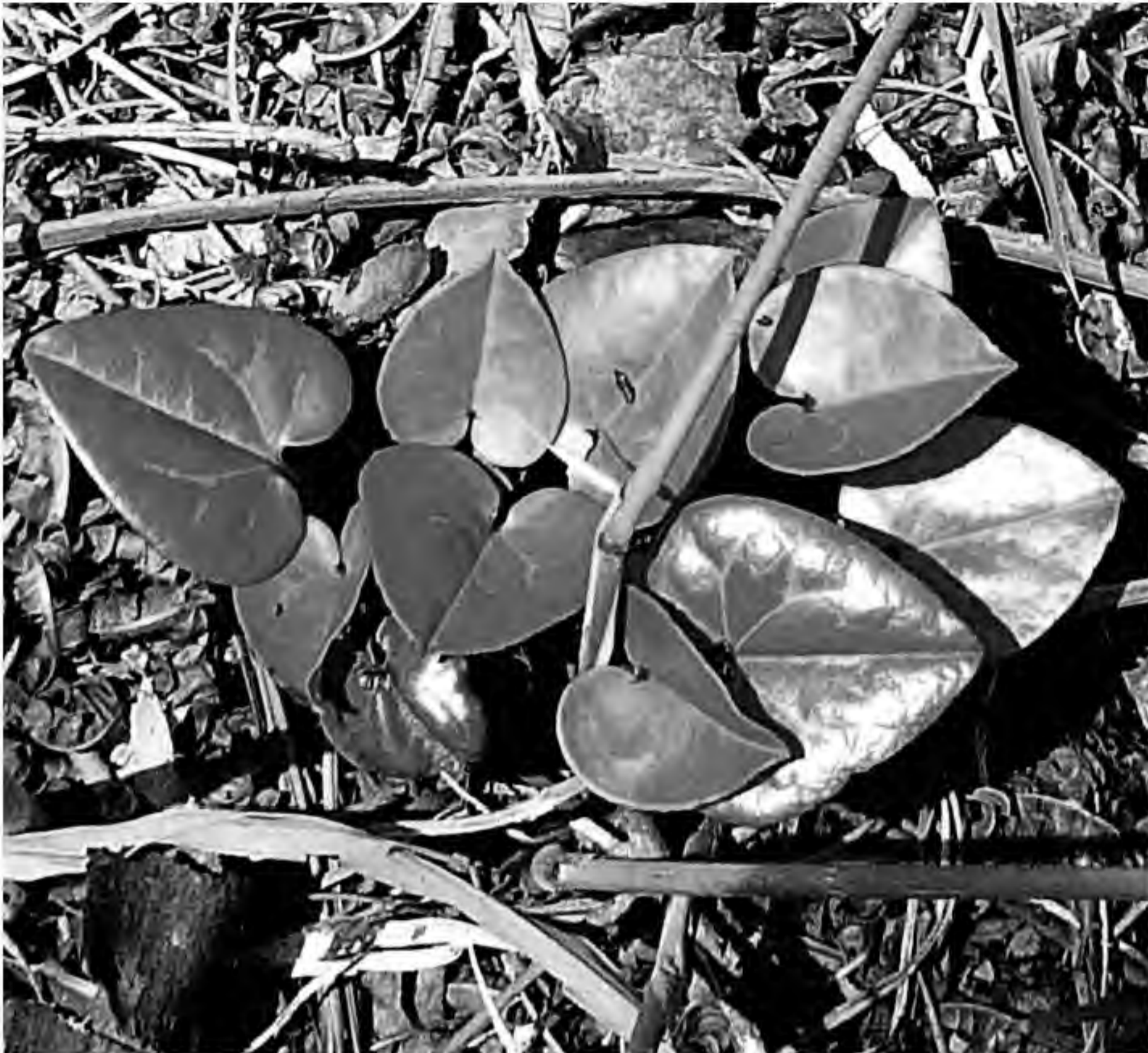
Figure 1. Hexastylis sorriei leaves emerging from soil after a fire (note lack of variegation).

Hexastylis sorriei is noteworthy in its ability to withstand and prosper in an ecotonal habitats exposed to frequent, hot fires. Here, the Sandhills Heartleaf grows with Nyssa biflora , Acer rubrum , [rarely with Chamaecyparis thyoides , Osmunda cinnamomea , Clethra alnifolia , Ilex glabra , Ilex coriacea , Lyonia lucida , Cyrilla racemiflora , Fothergilla gardenii , Magnolia virginiana , Persea palustris , Sarracenia rubra , Sarracenia purpurea , Sphagnum spp., and, very rarely, Dionaea muscipula (the latter only in North Carolina). The first year after fire, Hexastylis sorriei sprouts and flowers. The second year after fire, as its habitat gradually becomes more crowded with stems of other species, it produces fewer leaves and flowers. After several years without fire, most plants have only one or two leaves and flowers are very hard to find. Some historic locations where fire has been absent for decades have no plants at all today. Even with fire, it produces smaller clumps than most species of Hexastylis — a “large” clump of H. sorriei has about 8 leaves and 4 flowers, while in other species of Hexastylis , healthy clumps often have around 20 leaves and nearly as many flowers. Hexastylis sorriei can generally be said to be rare and local. Fort Bragg and Camp Mackall, where annual burning is widespread, are the only locations where the Sandhills Heartleaf can be said to be common.