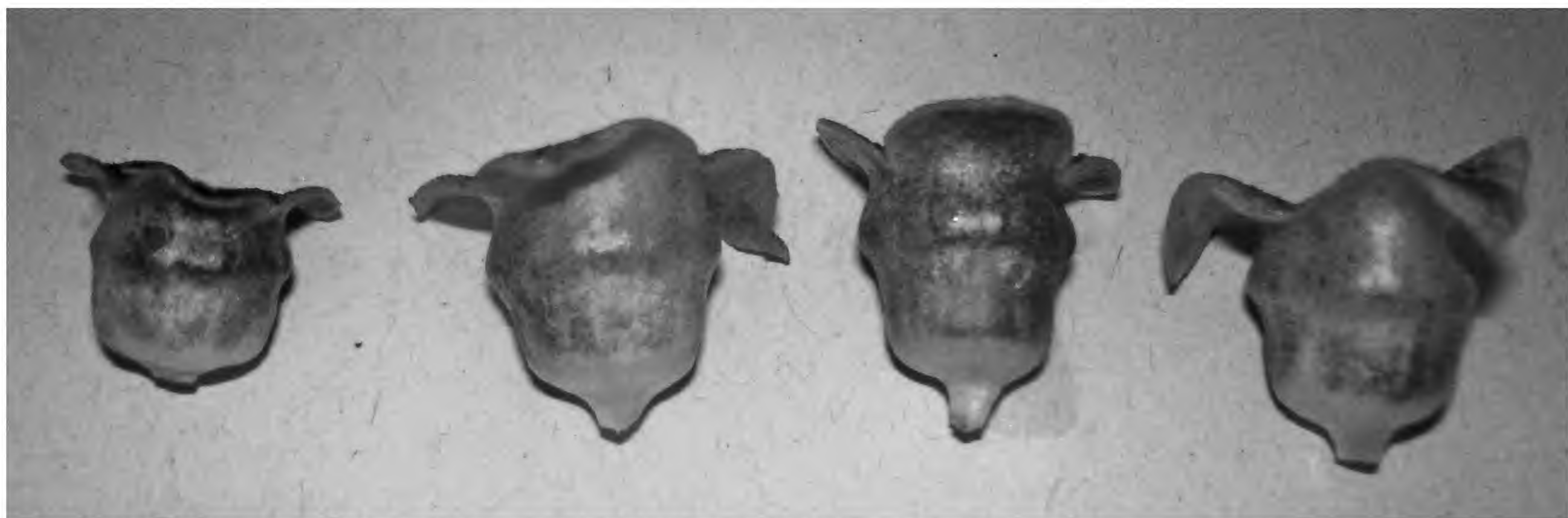
Figure 3. Flowers of Hexastylis sorriei Gaddy.