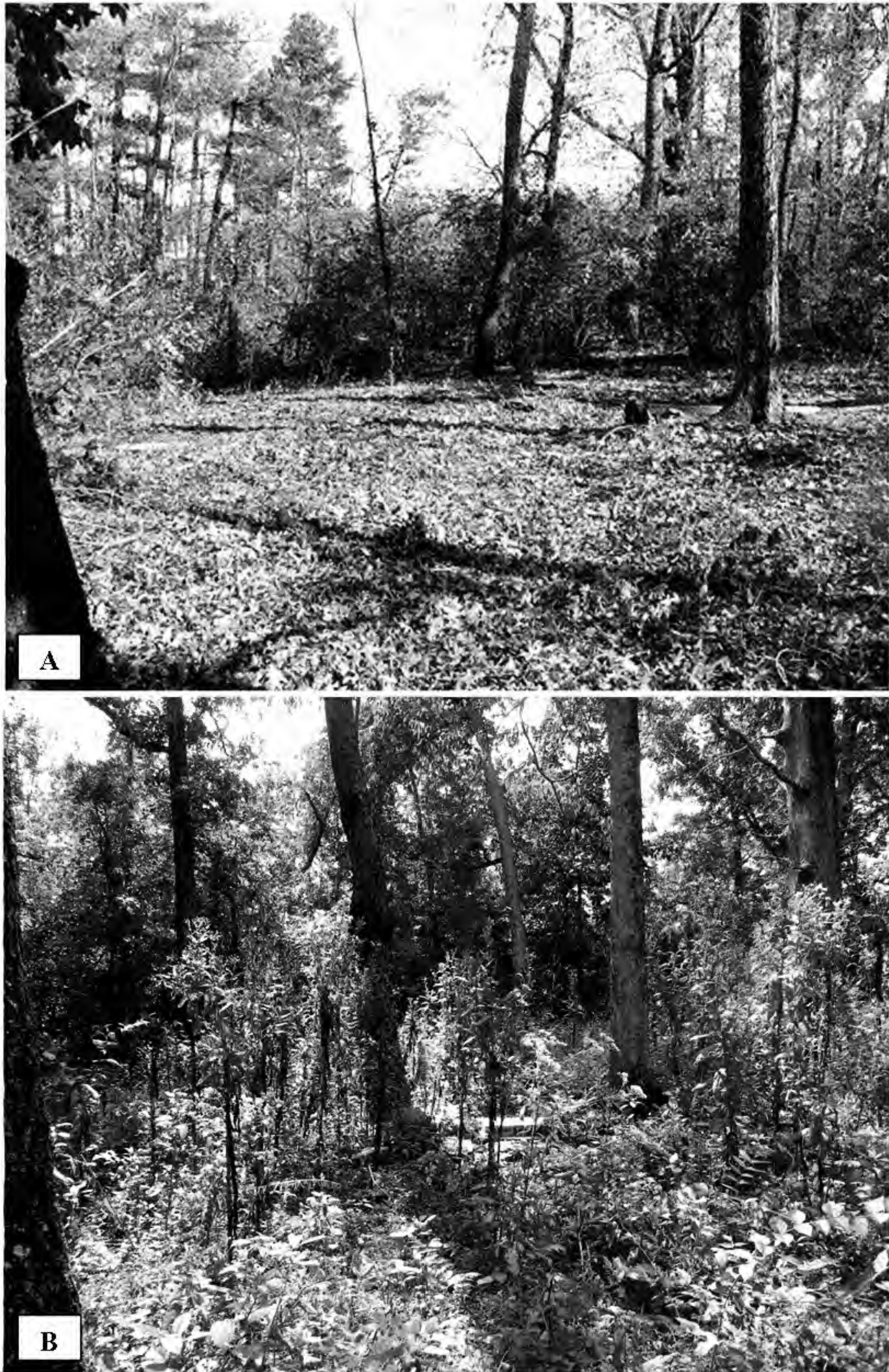
Figure 2. Cemetery test macroplot. (A) After removal of Lonicera maackii on September 10, 2010, and (B) secondary successional plant colonization on September 17, 2011.