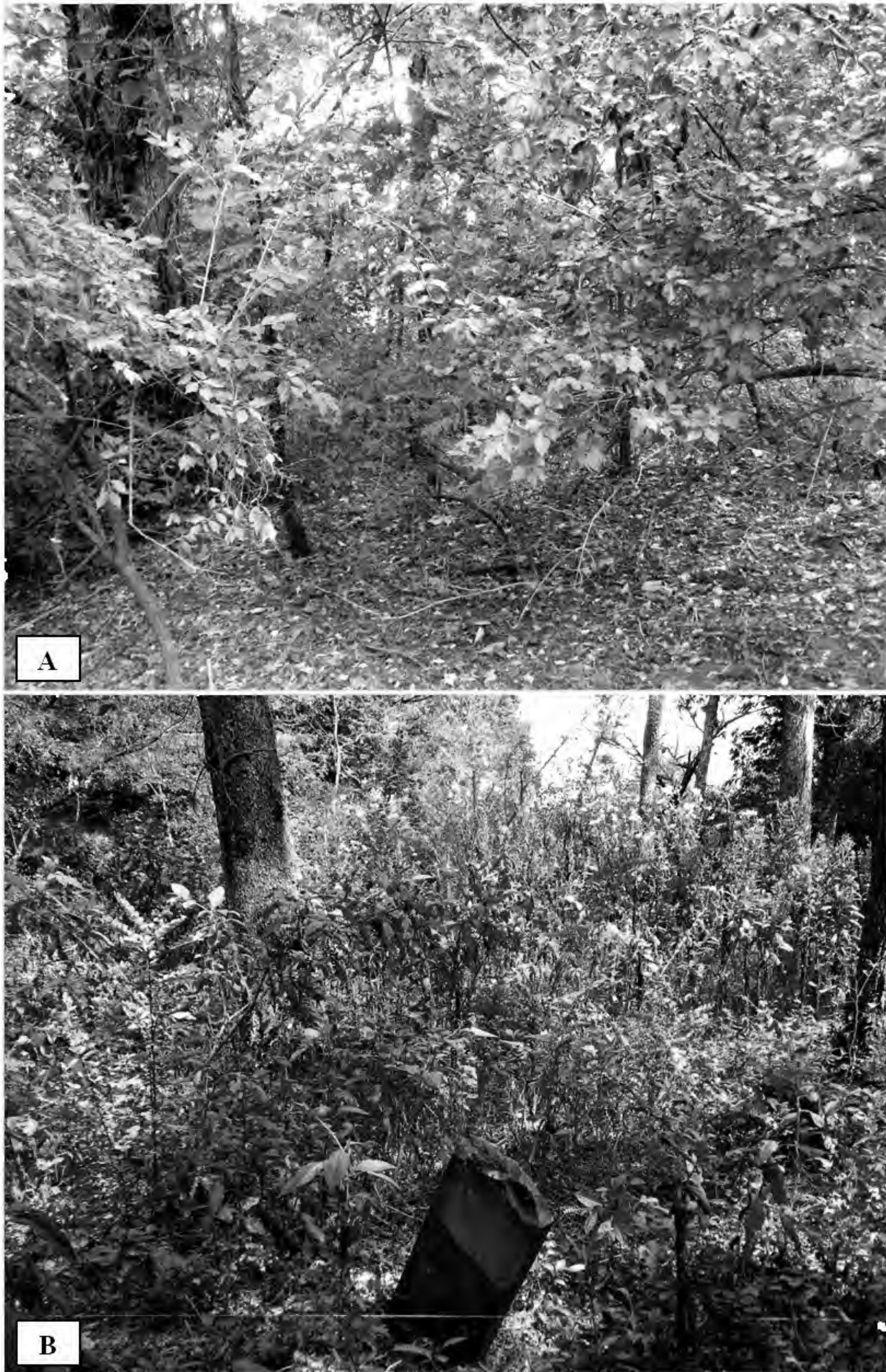
Figure 3. (A) Margin of the Amur Honeysuckle reference macroplot with a scarcity of plants within the herb layer, and (B) margin of the Cemetery test macroplot with a substantial herb layer. Images were taken on September 17, 2011.