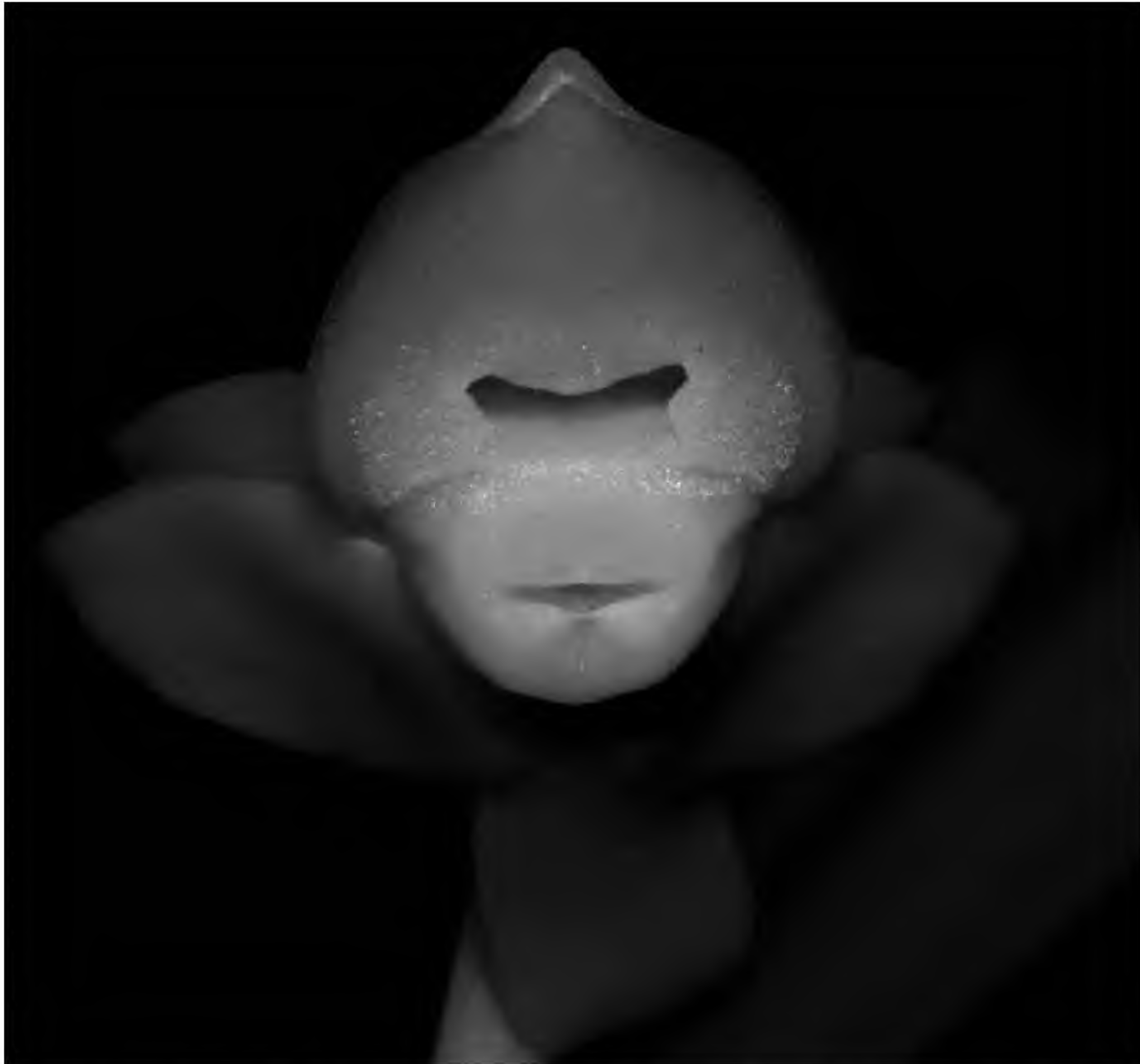
Figure 2. Dressleria morenoi . Close up of flower; note the wide sepals.