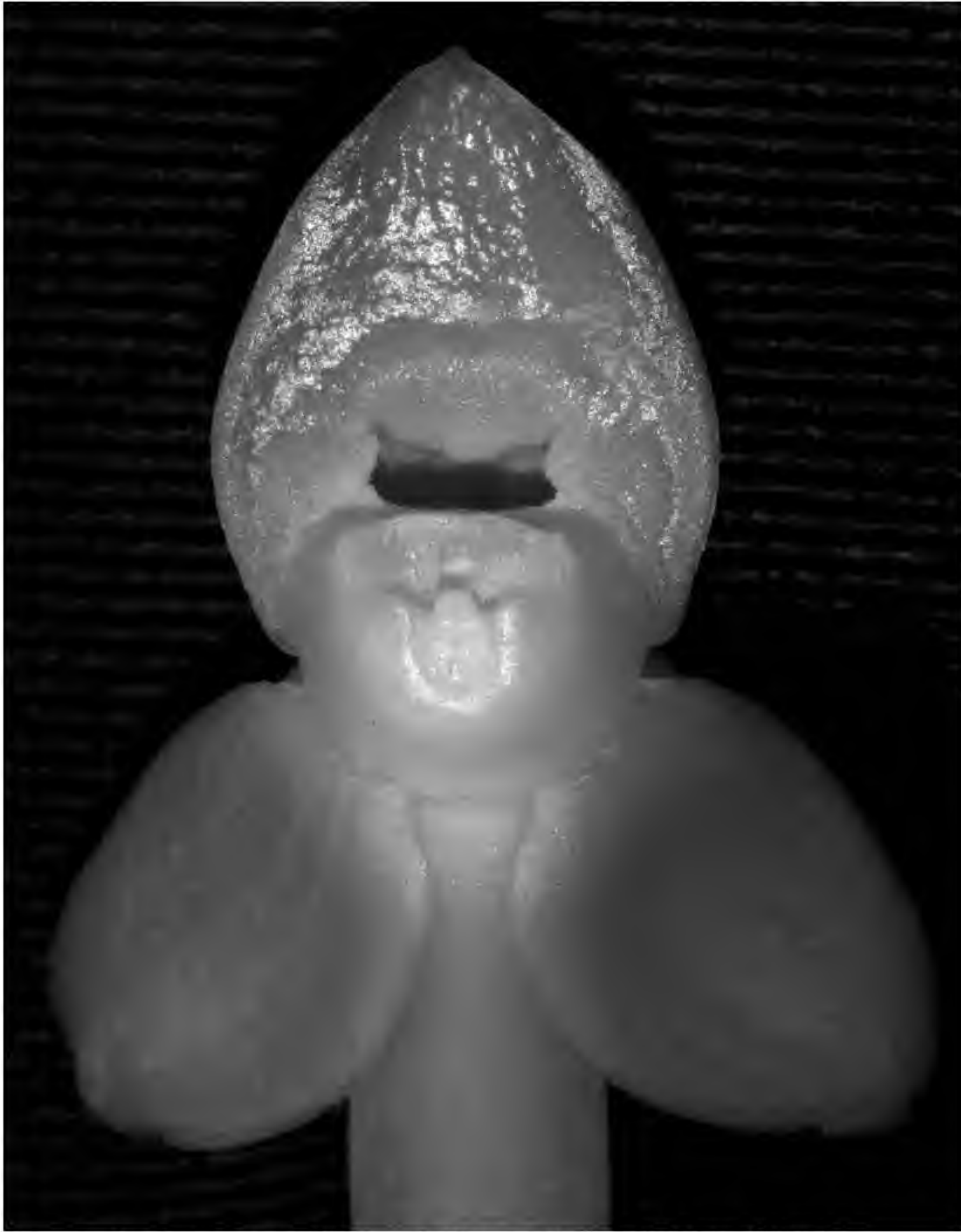
Figure 4. Dressleria morenoi. Close up of callus mound.