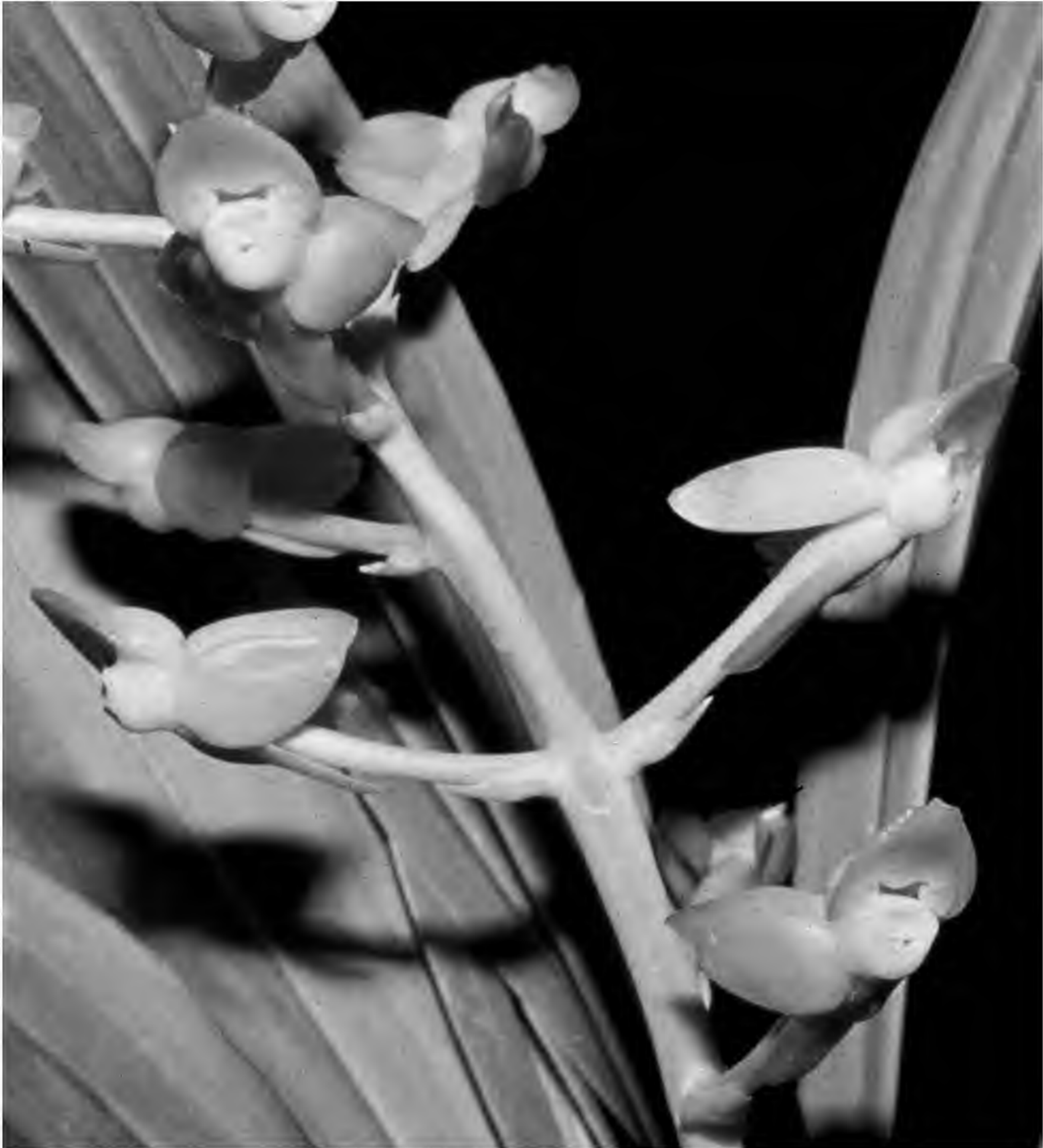
Figure 1. Dressleria morenoi .

Known only from the Pacific slope west of Cali, Colombia. The only additional specimen is represented by the photograph (Hills 2012) of a previous collection from the same area made more than 10 years ago.