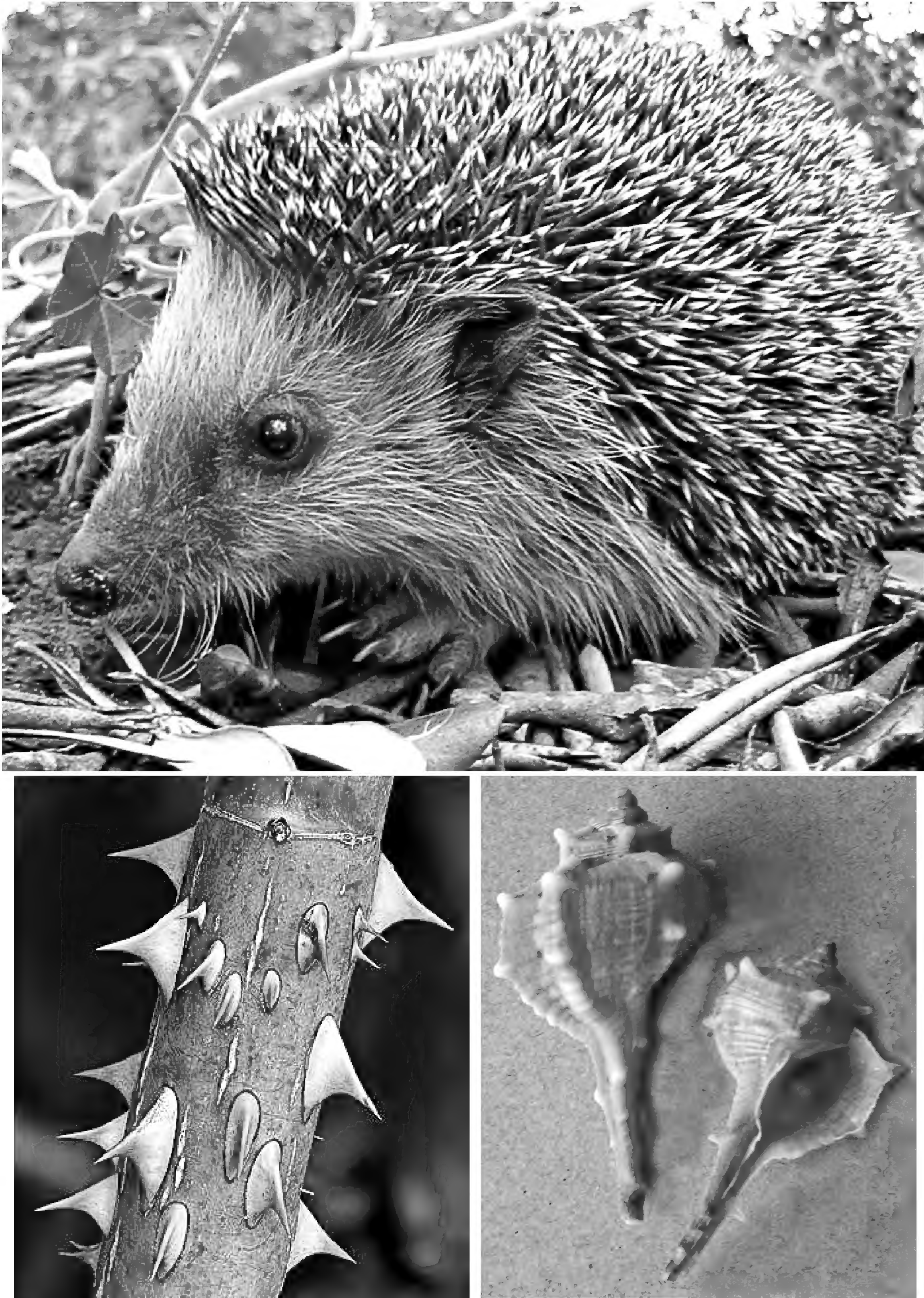
Figure 1. A. Echinete surface; European hedgehog, Erinaceus europaeus ; B. Aculeate surface; prickles of Rosa stem; C. Muricate surface; individuals of purple dye-murex, Bolinus brandaris (originally Murex brandaris L.)