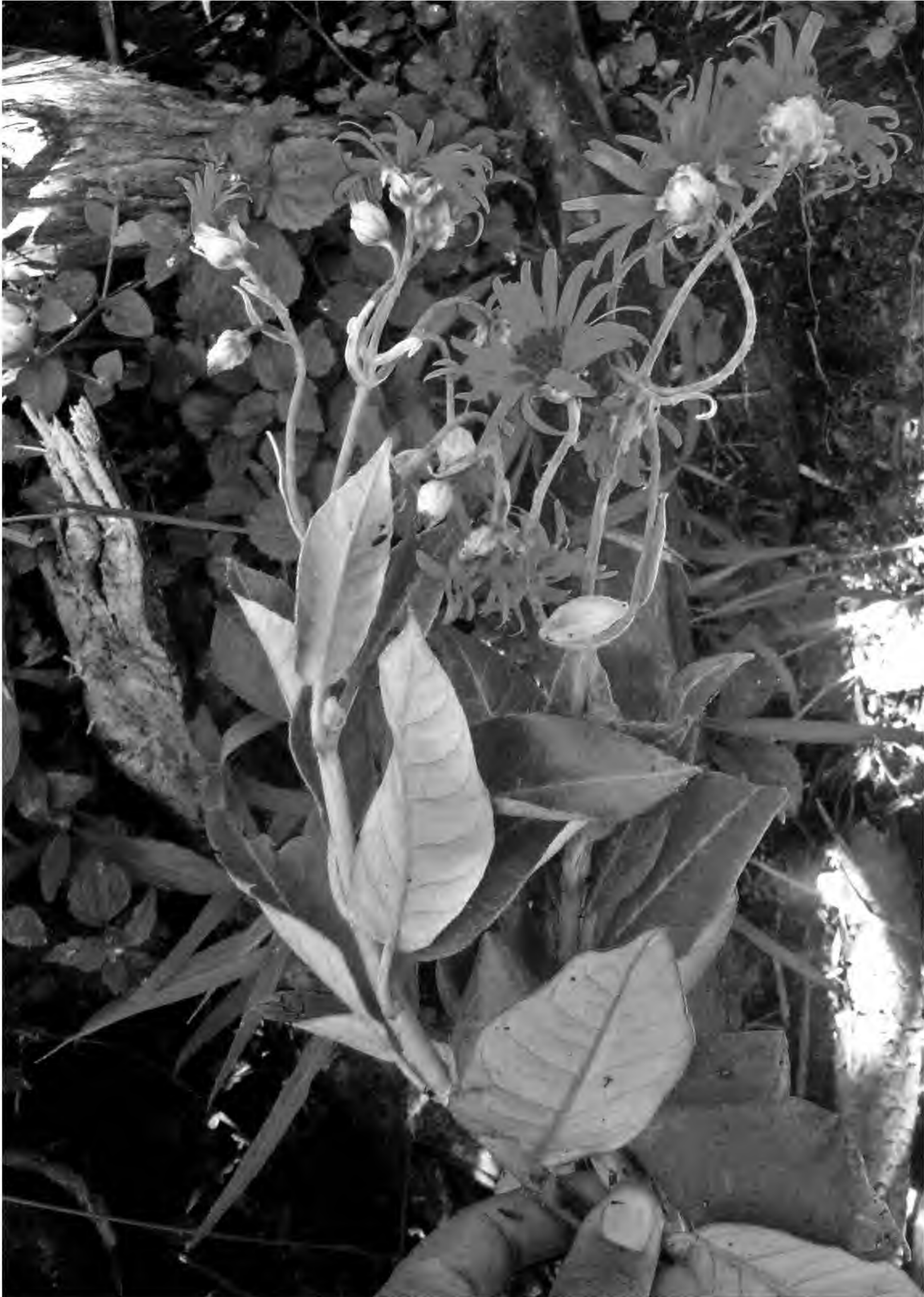
Figure 2. Munnozia ortiziae Pruski. Distal portion of stem showing the discolored leaves and the subequal to obcordate, tomentose-sericeous phyllaries ( Castillo 346 ).