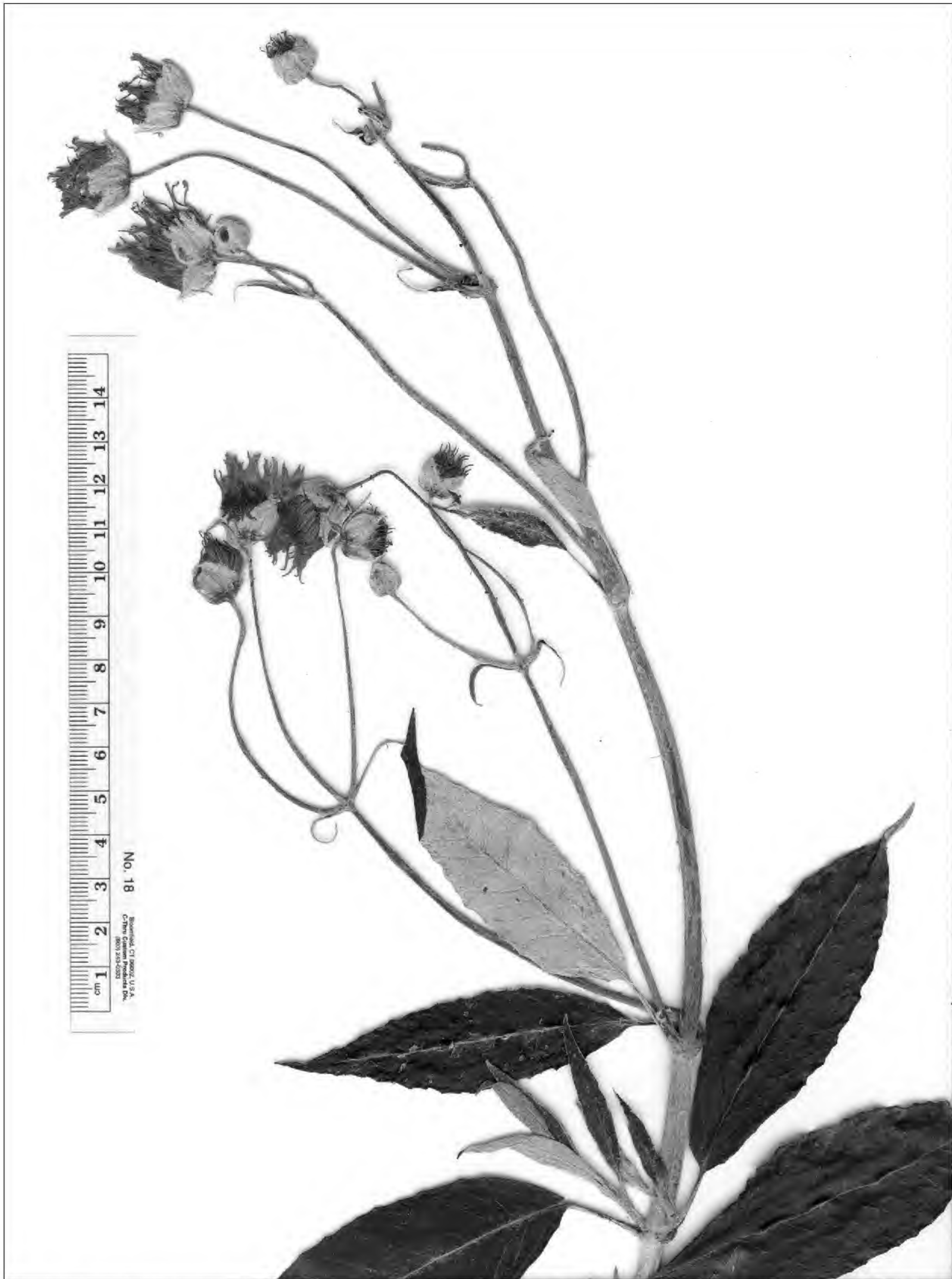
Figure 1. Munnozia ortiziae Pruski. Photograph of a paratype (van der Werff et al. 23417, MO) showing the opposite discolorous leaves and subequal to obgrade tomentose-sericeous phyllaries.