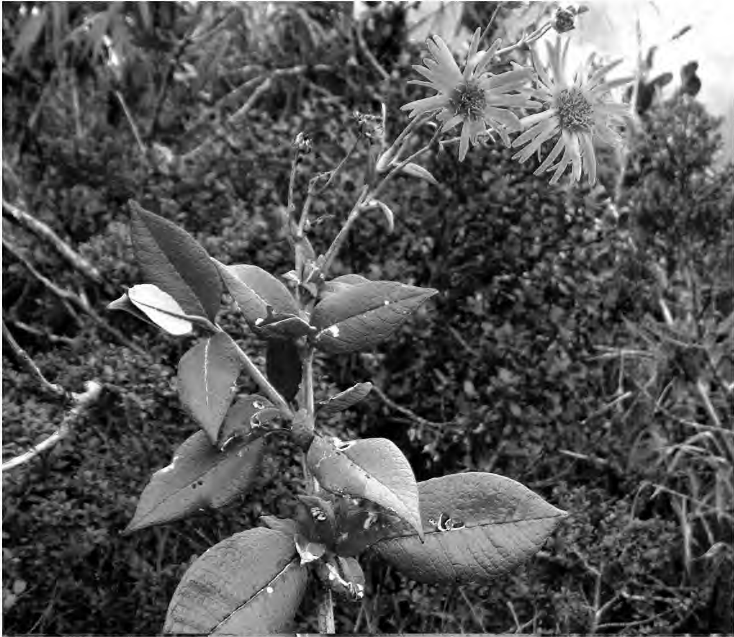
Figure 3. Munnozia ortiziae Pruski. Habit (Monteagudo et al. 13801).