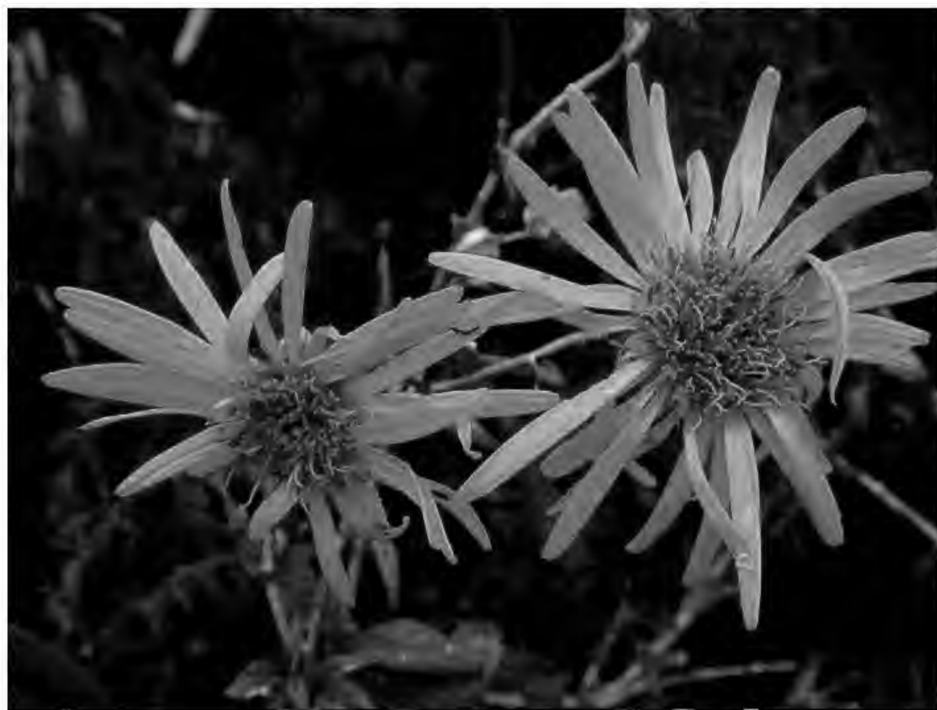
Figure 4. Munnozia ortiziae Pruski. Close-up of two capitula (Monteagudo et al. 13801).