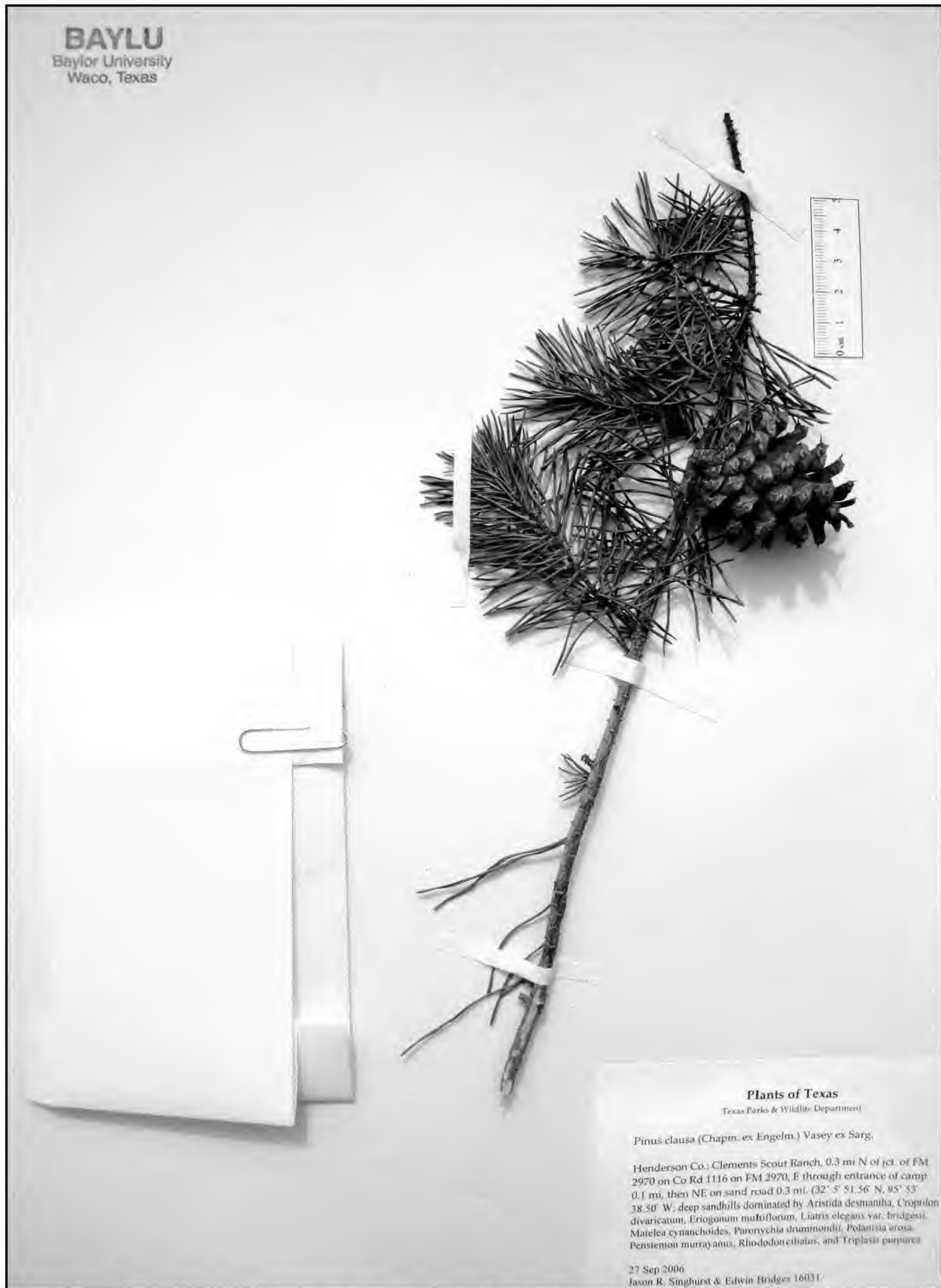
Figure 3. Pinus clausa . Henderson Co., Texas (Singhurst & Bridges 16031, BAYLU).