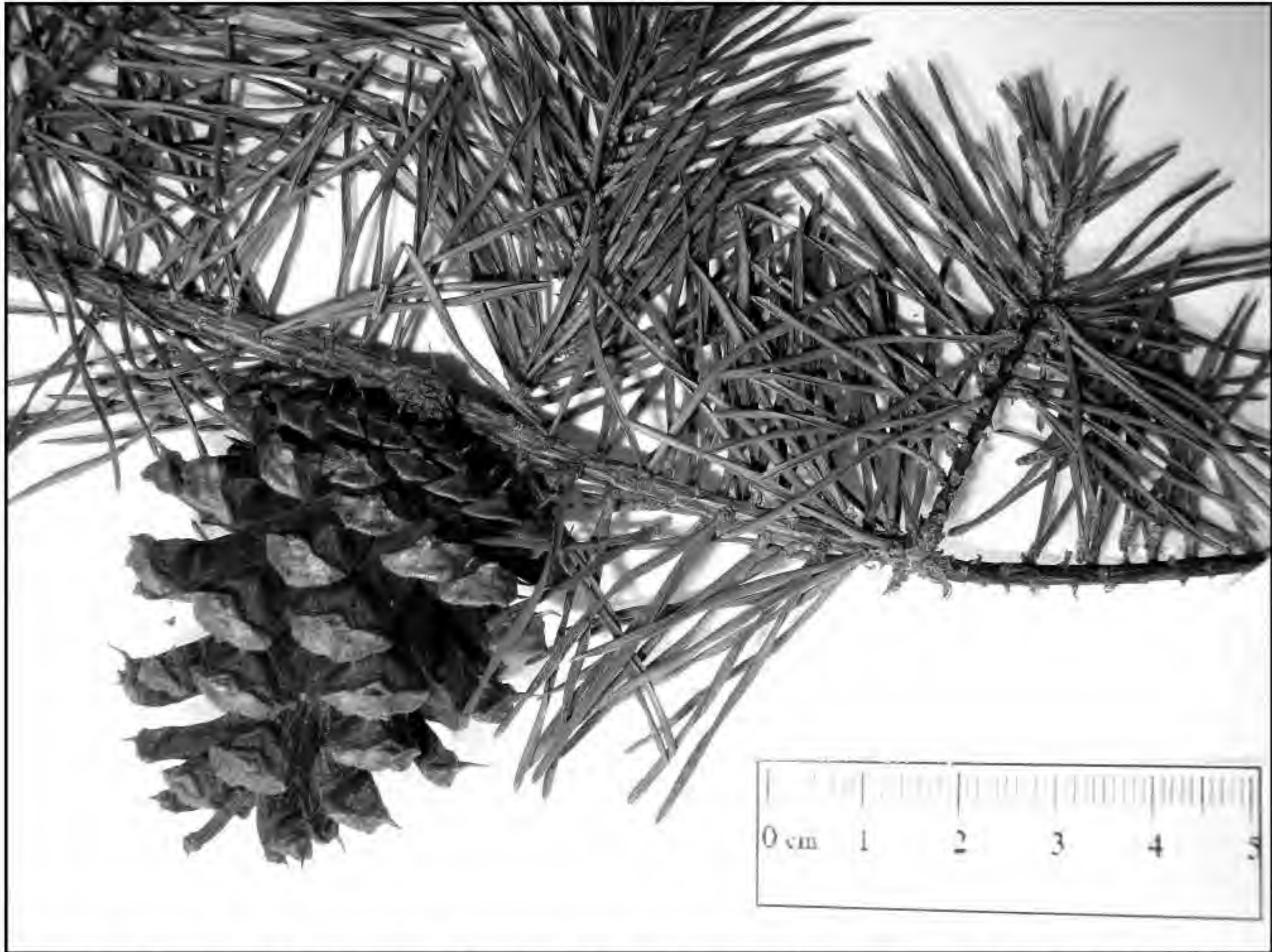
Figure 1. Close-up of Pinus clausa . Voucher with serotinous ovulate cone. (Singhurst & Bridges 16031, BAYLU).

The specimen is from the Post Oak Savanna and area of deep sands located to the west of the Pineywoods of deep east Texas. This savanna can generally be characterized as a Quercus stellata — Q. marilandica overstory and an understory of grass, chiefly Schizachyrium scoparium (in Diggs et al. 2006). At this locale Quercus incana was a common overstory species. The area of occurrence was void of other woody plants and dominated by Aristida desmantha , Croptilon divaricatum , Eriogonum multiflorum , Liatris elegans subsp. bridgeii , Matelea cynanchoides , Paronychia drummondii , Polanisia erosa , Penstemon murrayanus , Rhododon ciliatus , and Triplasis purpurea .