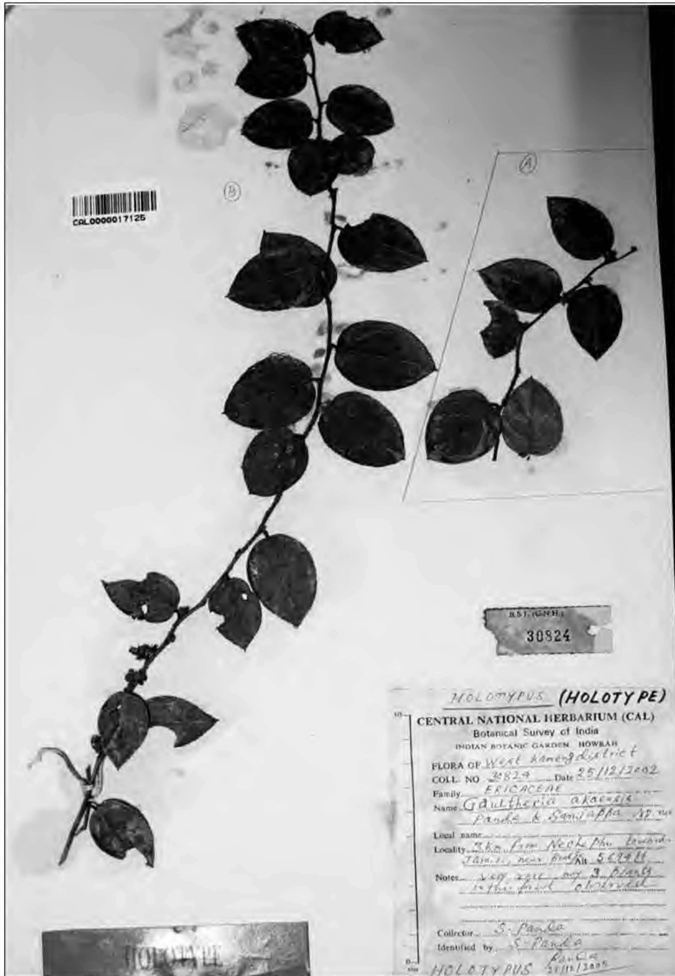
Figure 1. Holotype of Gaultheria akaensis Panda & Sanjappa (CAL). Arunachal population