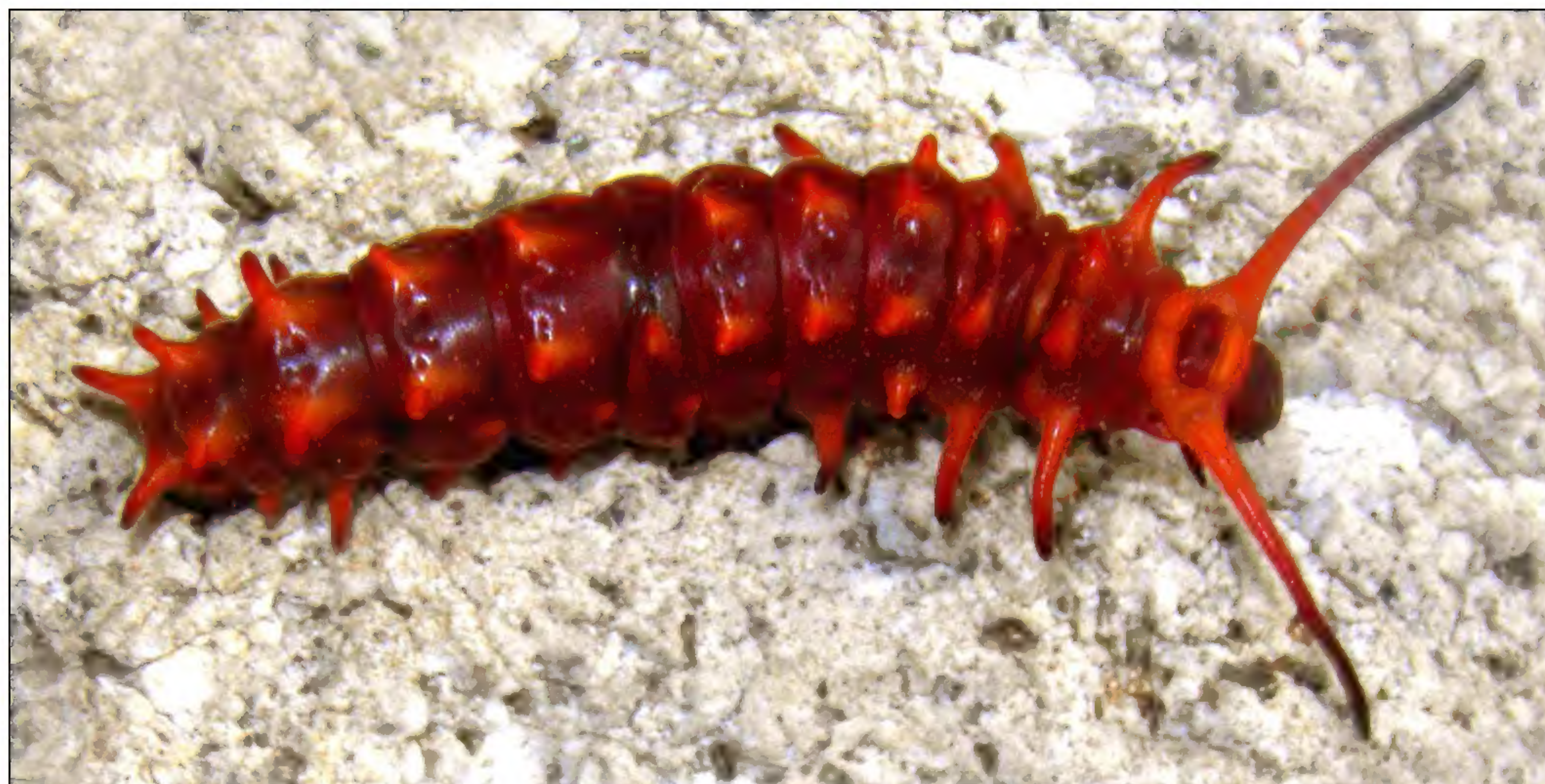
Figure 4. Battus philenor caterpillar. Near Yocogigua, Sonora, Mexico, 14 September 2012.

Caterpillars of the pipevine swallowtail butterfly ( Battus philenor , Fig. 4) feed on Aristolochia , including A. watsonii . These caterpillars sequester aristolochic acid from the plants, which renders the larvae as well as the butterflies toxic to birds.