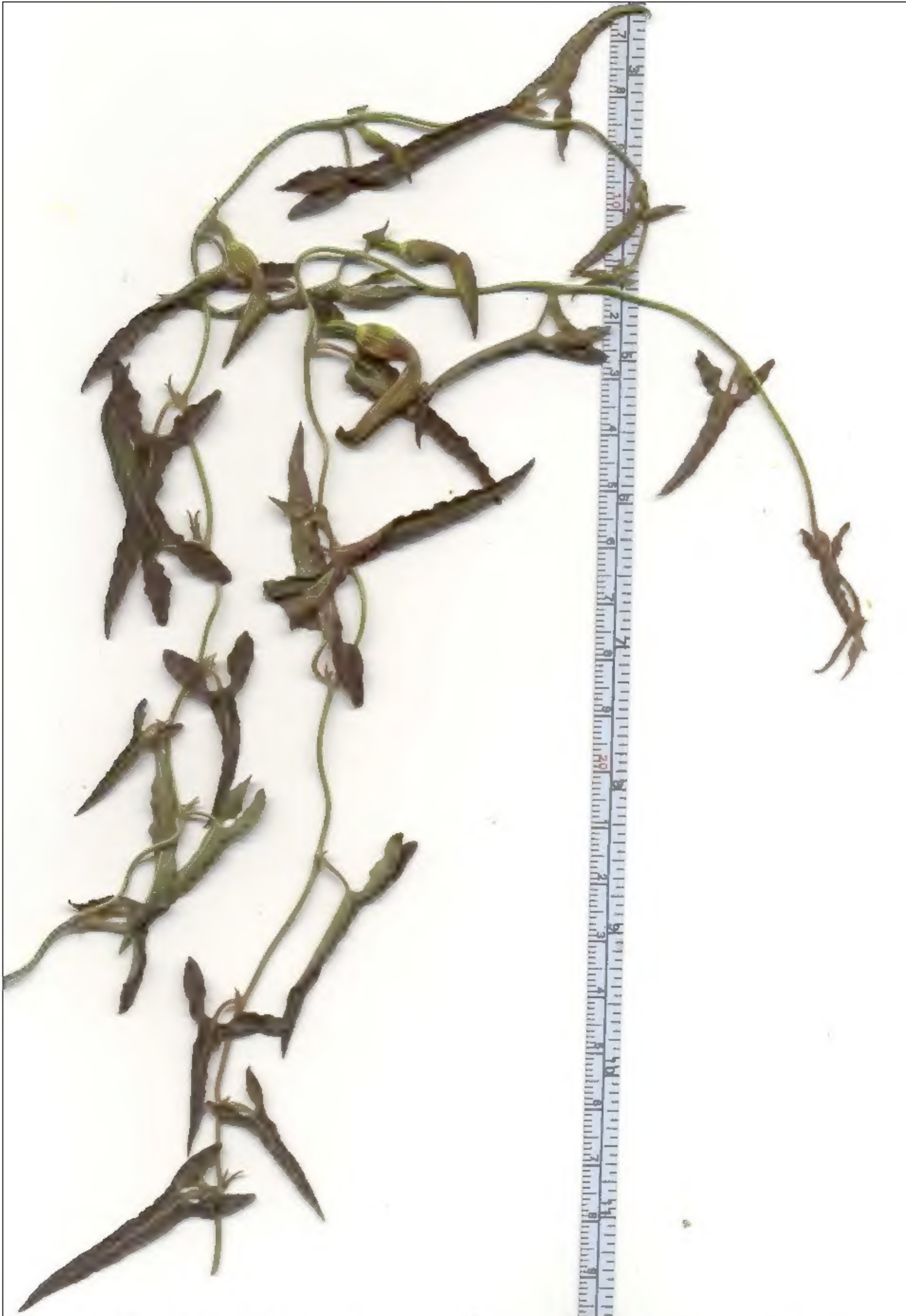
Figure 2. Aristolochia watsonii . Hwy 85 near Organ Pipe CNM visitor center, 28 Aug 2008.