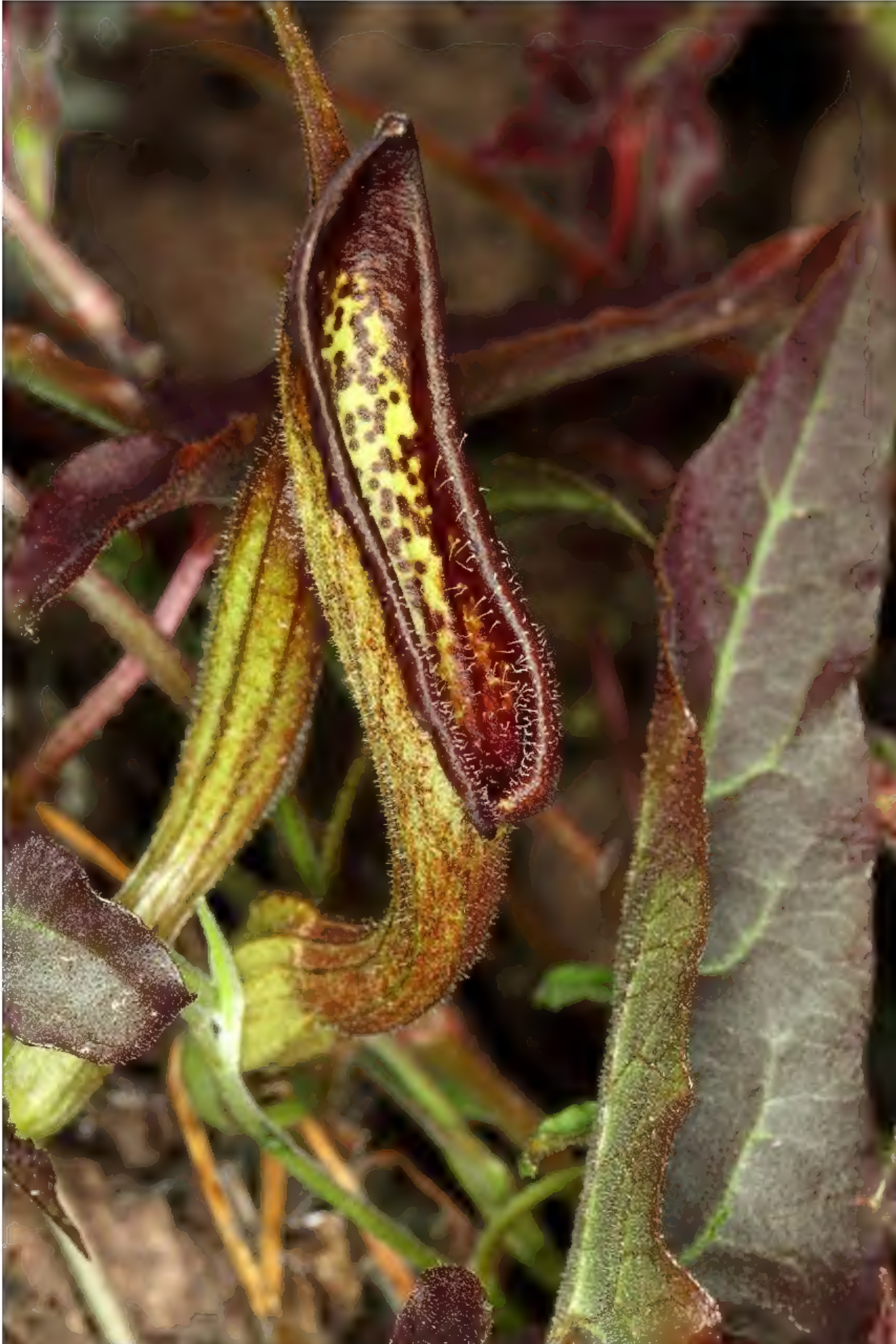
Figure 3. Aristolochia watsonii . Near Cliff, New Mexico, 19 Apr 2010.