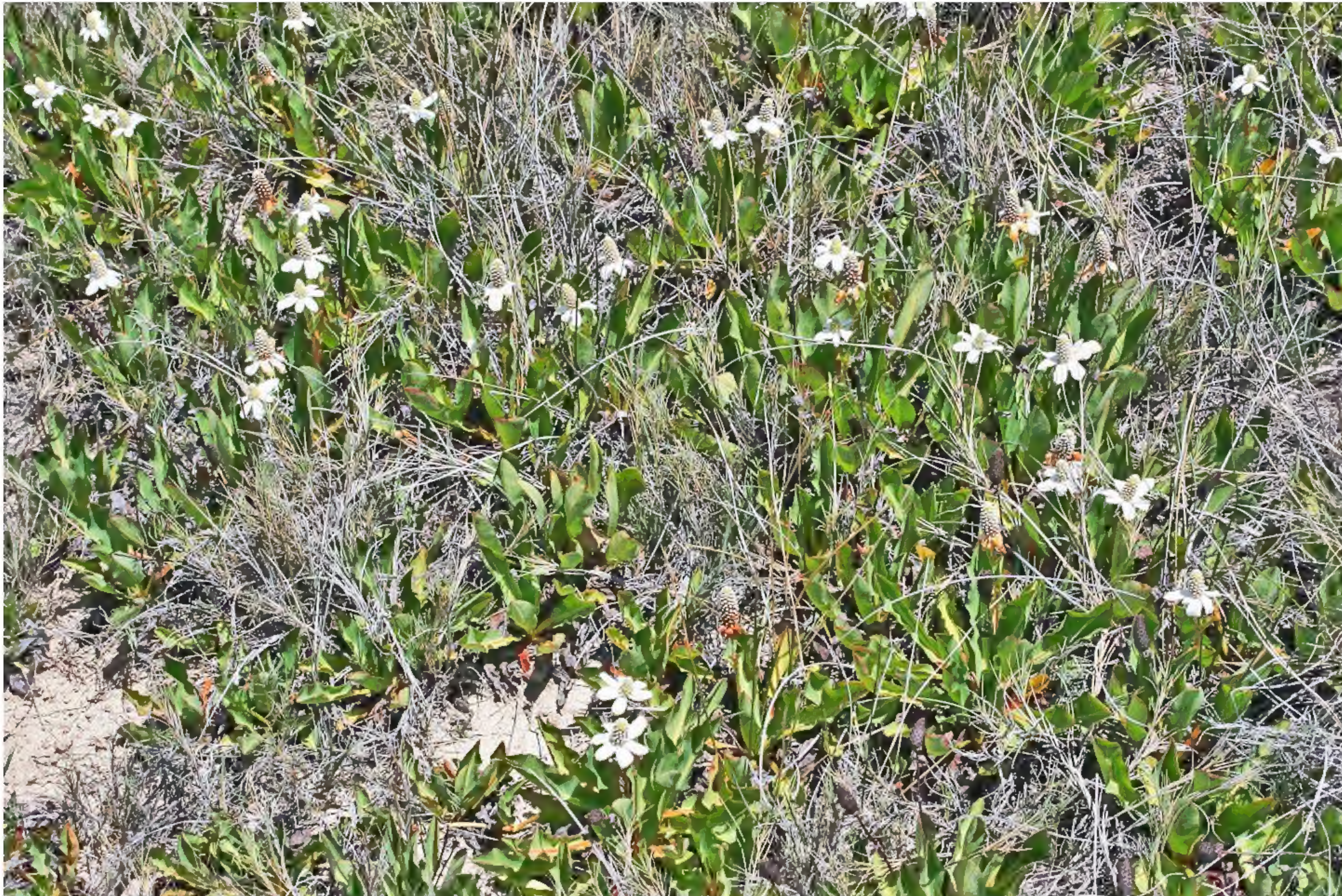
Figure 5. Anemopsis californica , at Quitobaquito, growing with Distichlis spicata , 5 May 2008.

The Saururaceae includes 4 genera and 6 species of herbaceous perennials native to Asia and North America. These plants are characterized in part by tannin and ethereal oil cells in the parenchyma tissue, which may account for the long and varied medicinal uses. Anemopsis is monotypic.