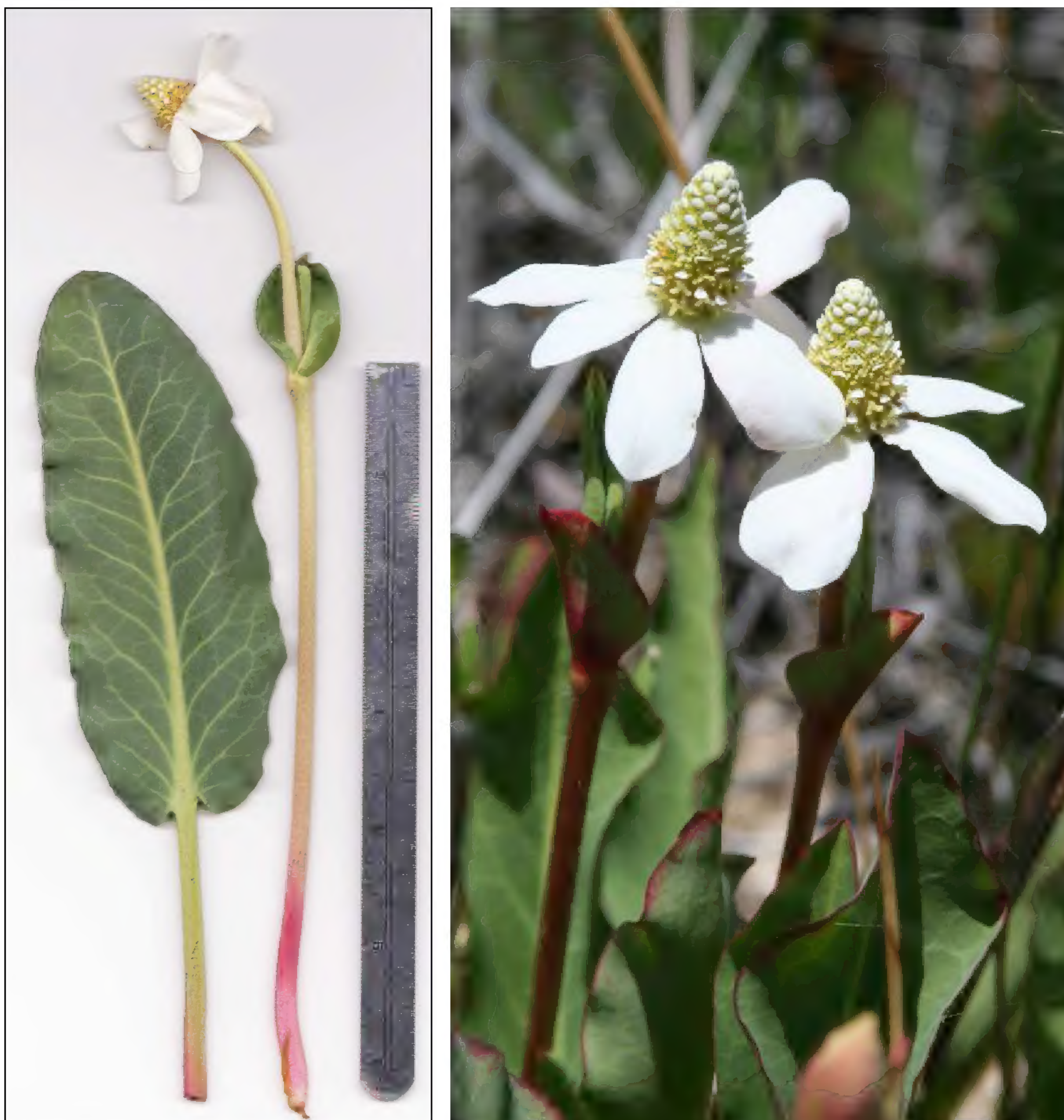
Figure 6. Anemopsis californica , at Quitobaquito; photos by Sue Rutman. A. Leaf and flowering stem with a reduced leaf and inflorescence, 3 May 2008. B. Inflorescences, 5 May 2008.

Semi-saline and alkaline soils of wetlands in southwestern USA and northwestern Mexico.