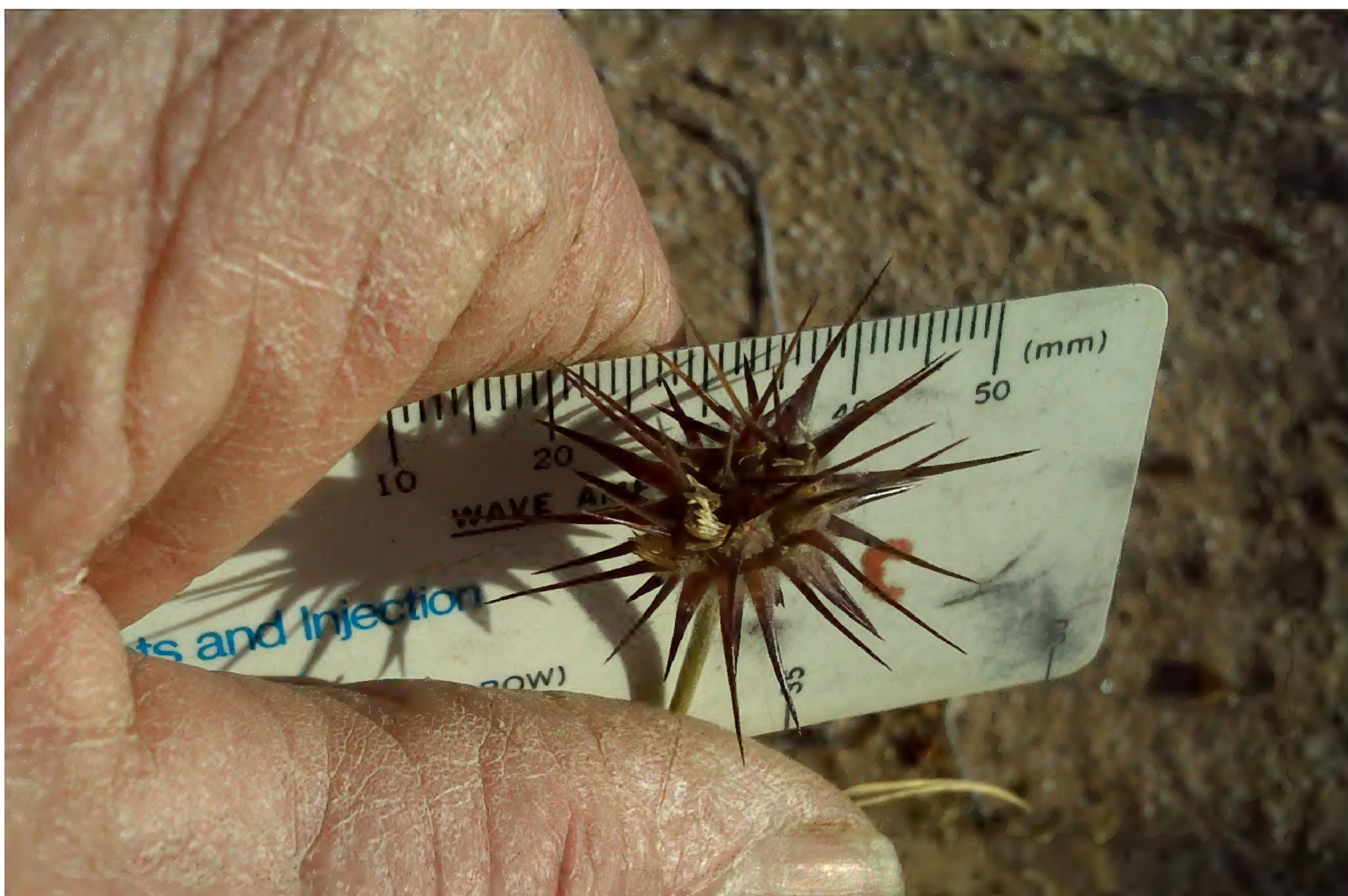
Figure 5. Cenchrus palmeri , from the collection site. Photo by J. Malusa, 19 January 2013.