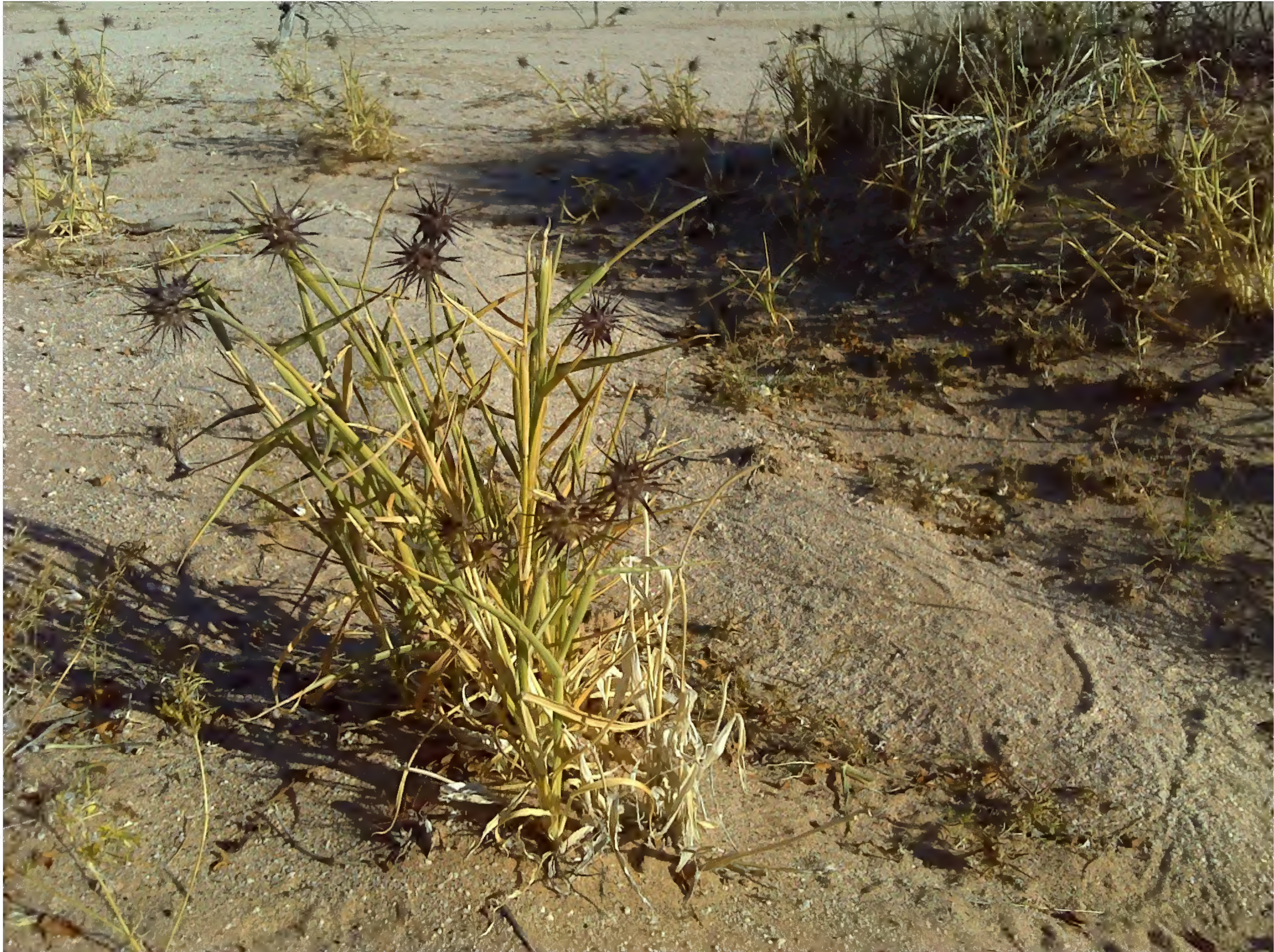
Figure 4. Cenchrus palmeri at the collection site. Photo by J. Malusa, 19 January 2013.