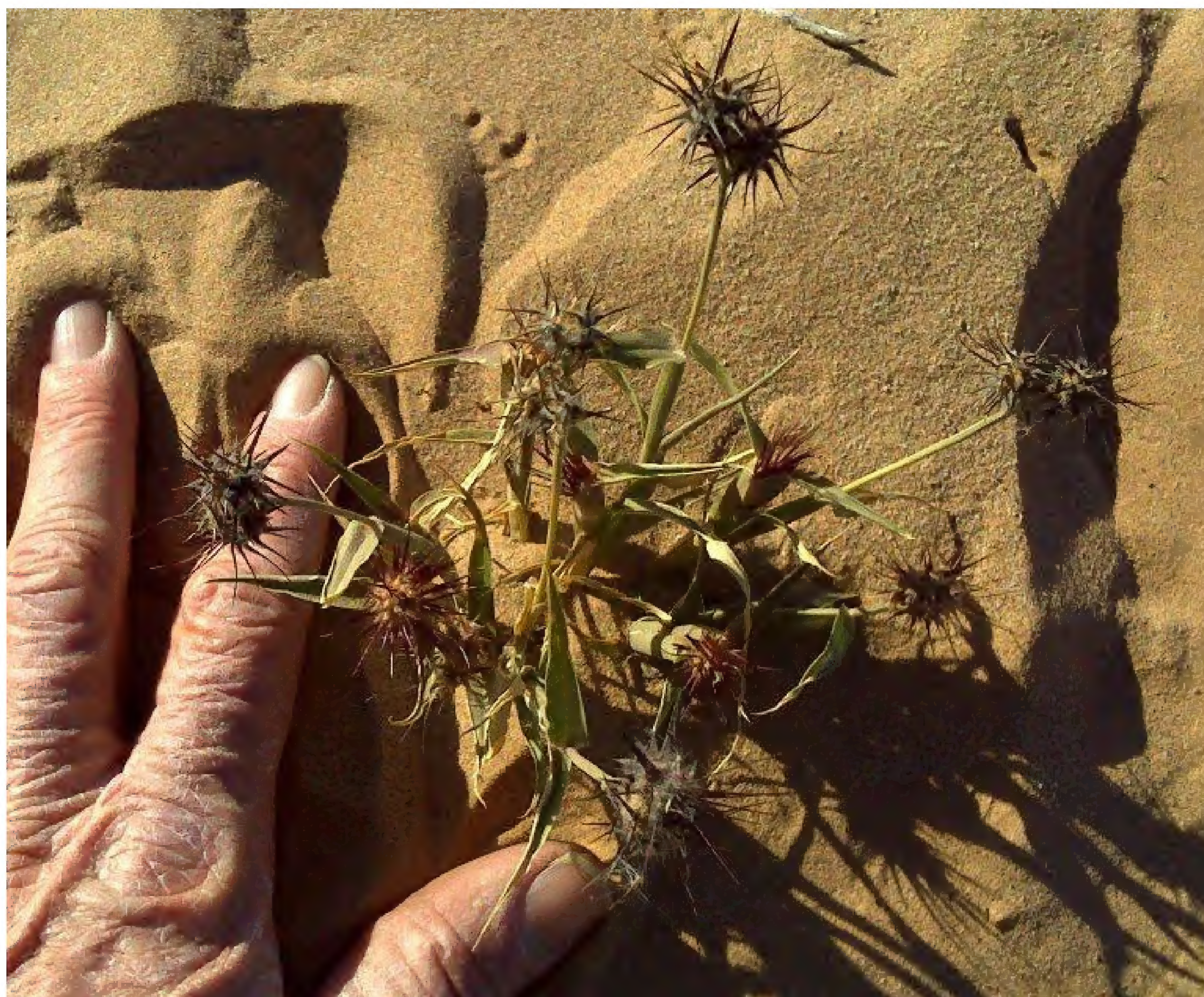
Figure 2. Cenchrus palmeri , the sole specimen at the site near the Yuma Dunes, not collected. Photo by J. Malusa, 5 January 2013.

are likely vectors. Crossing at night, they often attach piece of carpet to their shoes and Cenchrus burs might well cling to the carpet pieces and fabric shoes. Similarly, the burs are also transported by vehicle tires (Fig. 3), as was the case at the Arizona collection site.