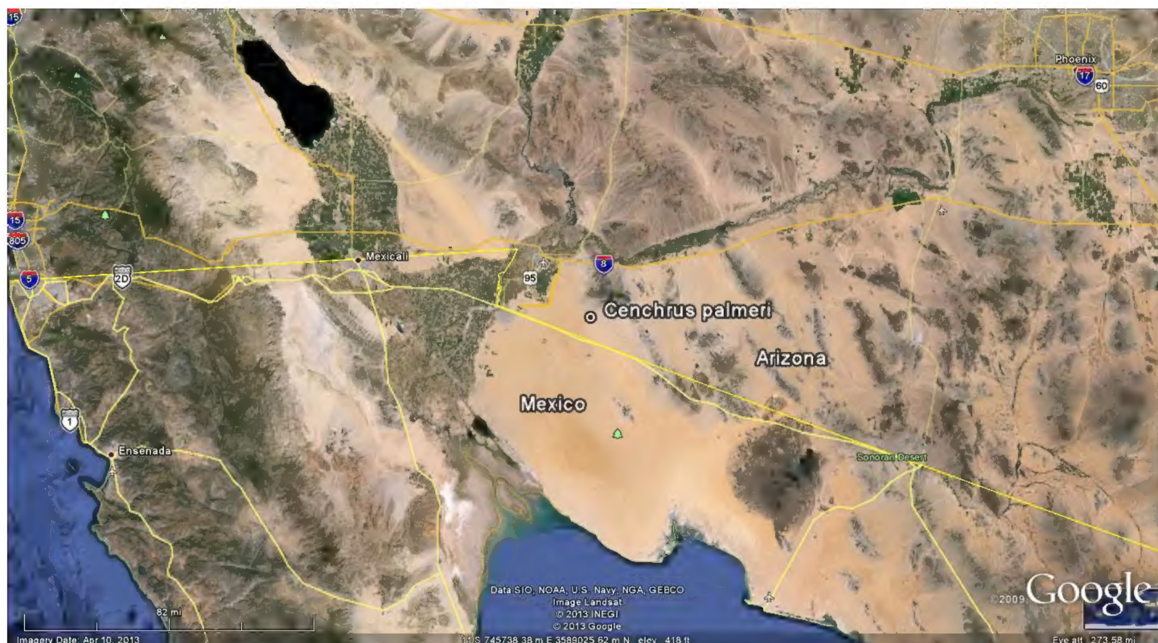
Figure 1. Location of Cenchrus palmeri in Arizona.

(3) 11 mi S of Foothills area of Yuma, Arizona on MCAS-Yuma Barry M. Goldwater Range; found growing on both sides of the road 1 mi N of first USA collection locality (Malusa & Sundt, 19 Jan 2013); sandy soil; UTM Zone 11, WGS 84 11S 07 45 790 E, 35 95 957 N, 4 Sep 2013, D. Maslen s.n. (Bureau of Land Management Yuma Field Office Herbarium, and ARIZ 415467).