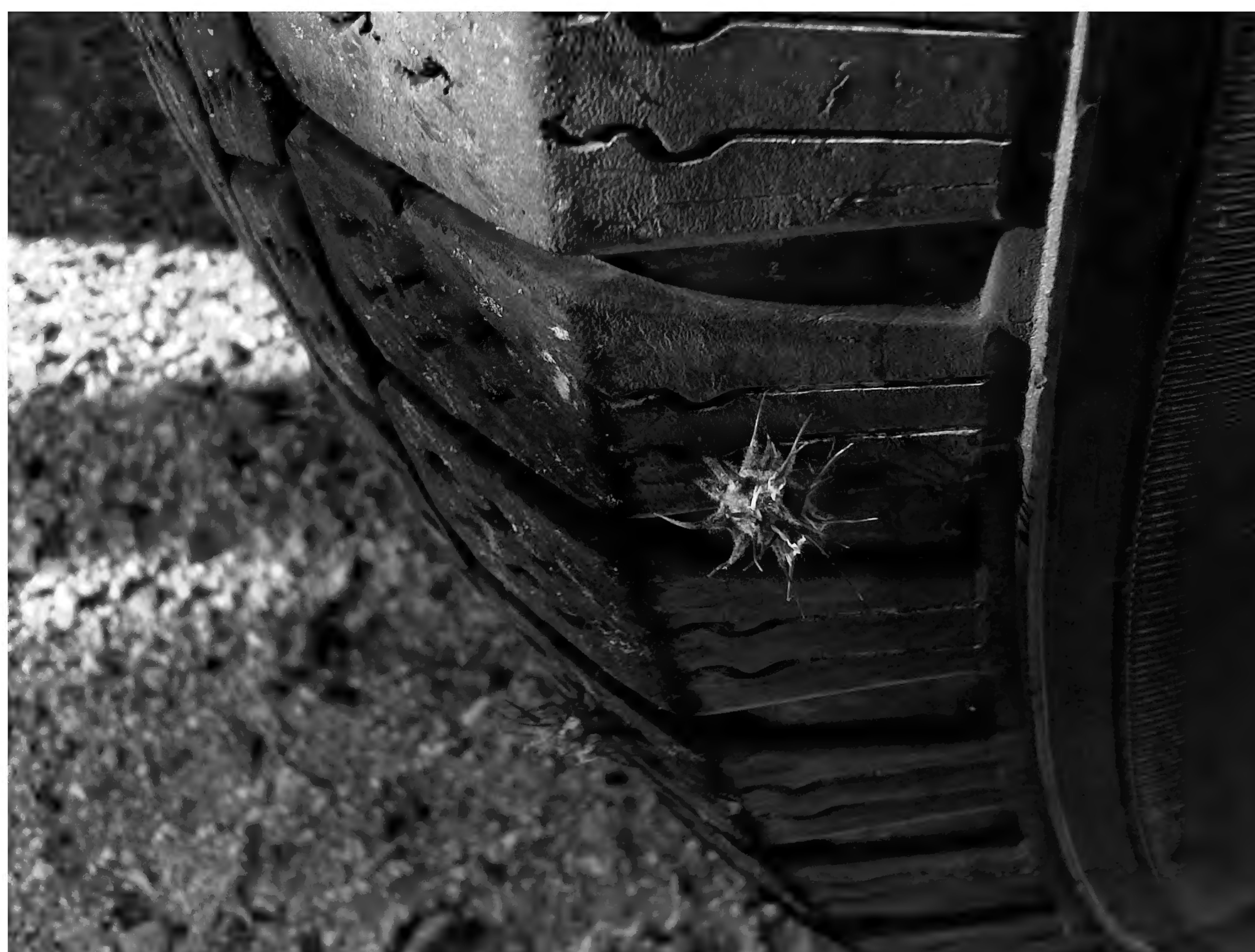
Figure 3. Cenchrus palmeri bur, at the collection site. Photo by J. Malusa, 19 January 2013.