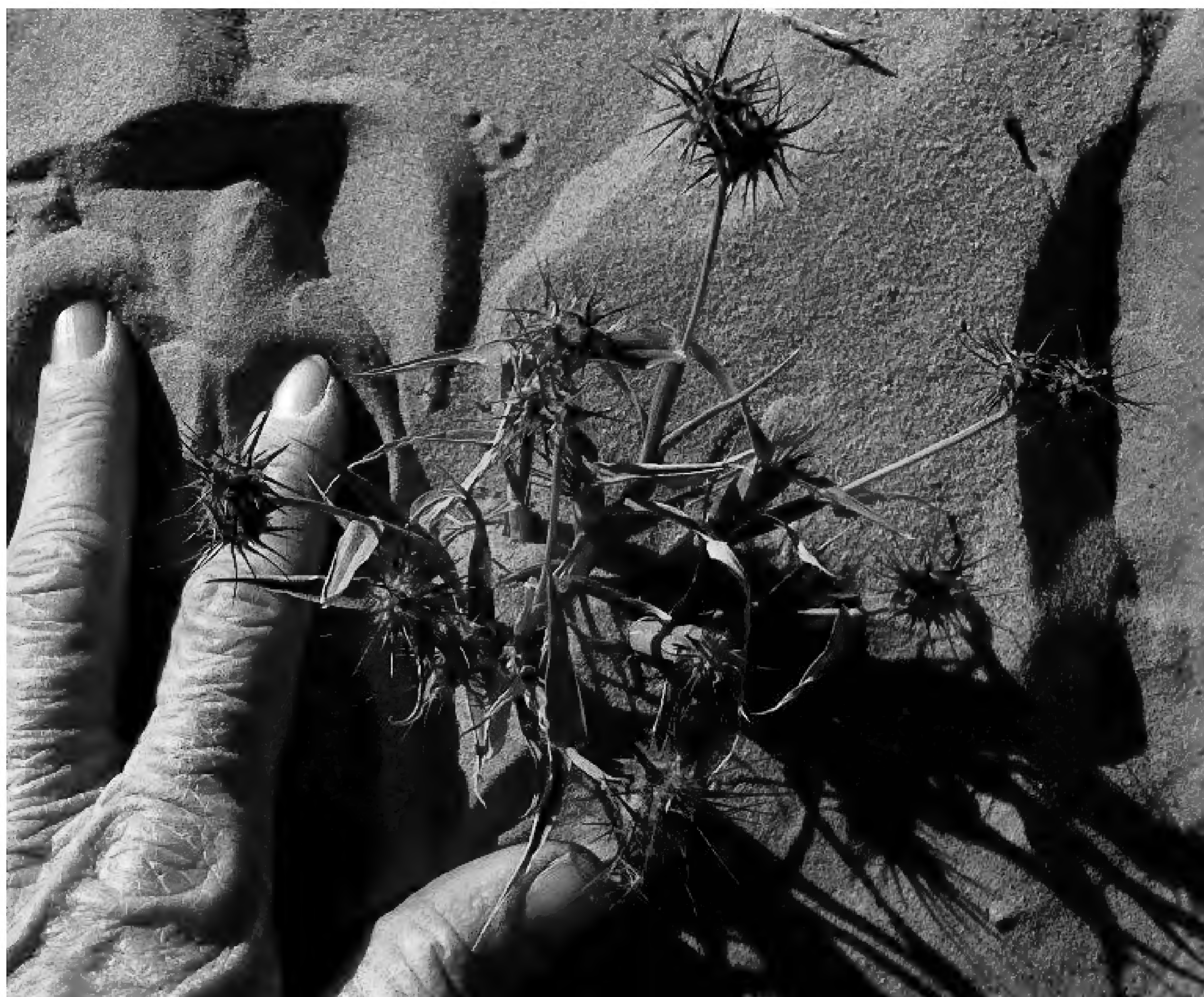
Figure 2. Cenchrus palmeri , the sole specimen at the site near the Yuma Dunes, not collected. Photo by J. Malusa, 5 January 2013.

are likely vectors. Crossing at night, they often attach piece of carpet to their shoes and Cenchrus burs might well cling to the carpet pieces and fabric shoes. Similarly, the burs are also transported by vehicle tires (Fig. 3), as was the case at the Arizona collection site.