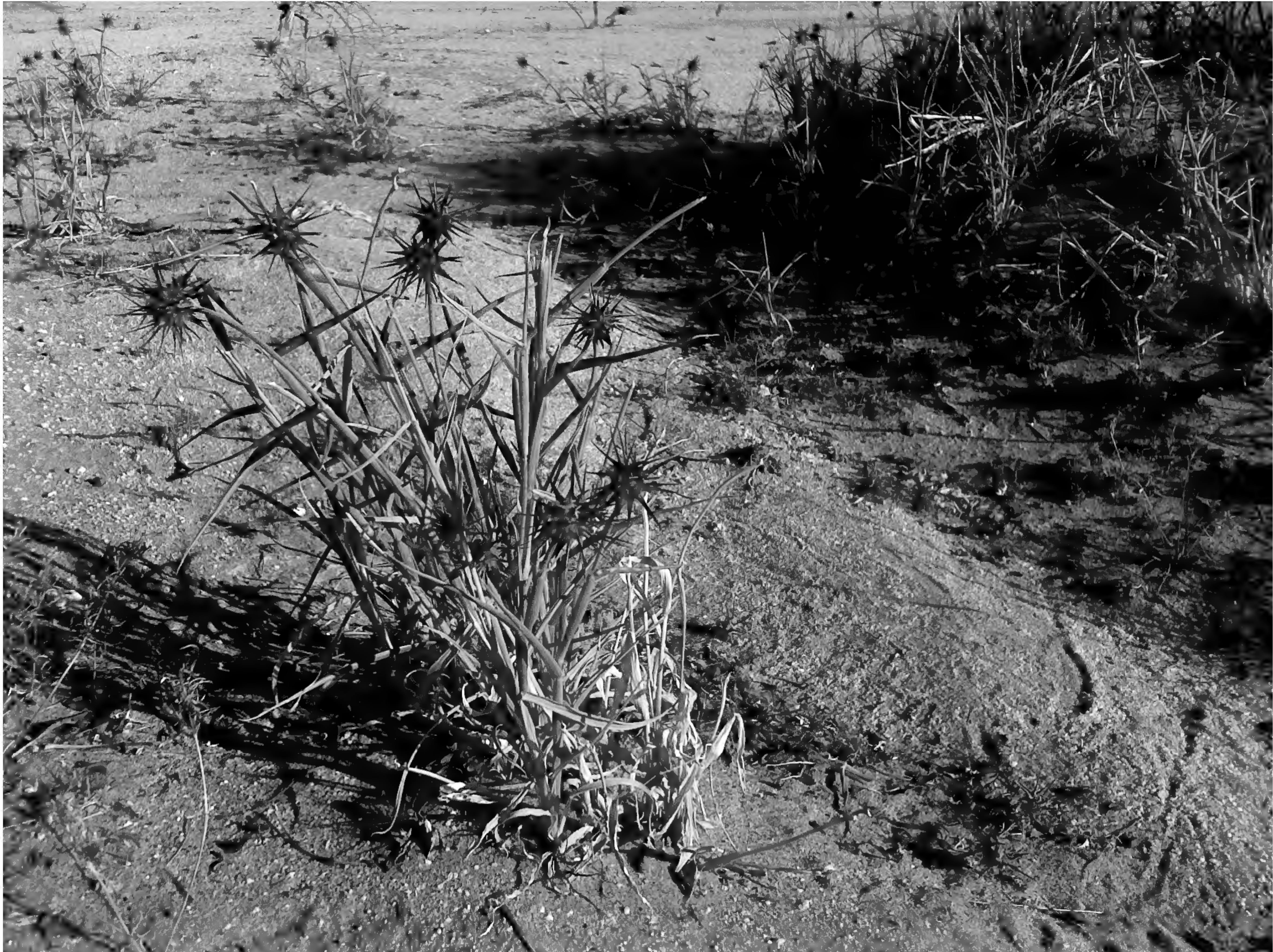
Figure 4. Cenchrus palmeri at the collection site. Photo by J. Malusa, 19 January 2013.