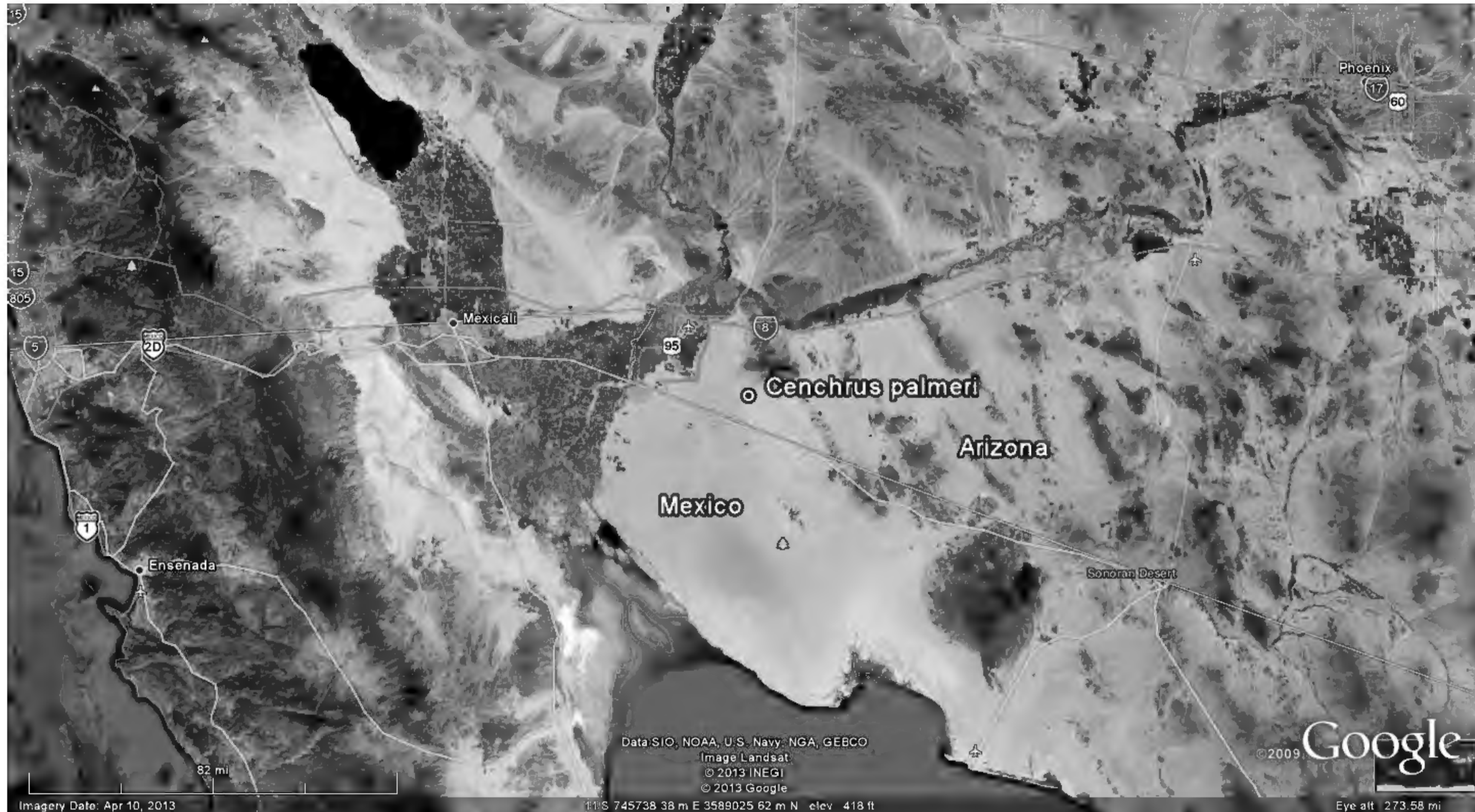
Figure 1. Location of Cenchrus palmeri in Arizona.

(3) 11 mi S of Foothills area of Yuma, Arizona on MCAS-Yuma Barry M. Goldwater Range; found growing on both sides of the road 1 mi N of first USA collection locality (Malusa & Sundt, 19 Jan 2013); sandy soil; UTM Zone 11, WGS 84 11S 07 45 790 E, 35 95 957 N, 4 Sep 2013, D. Maslen s.n. (Bureau of Land Management Yuma Field Office Herbarium, and ARIZ 415467).