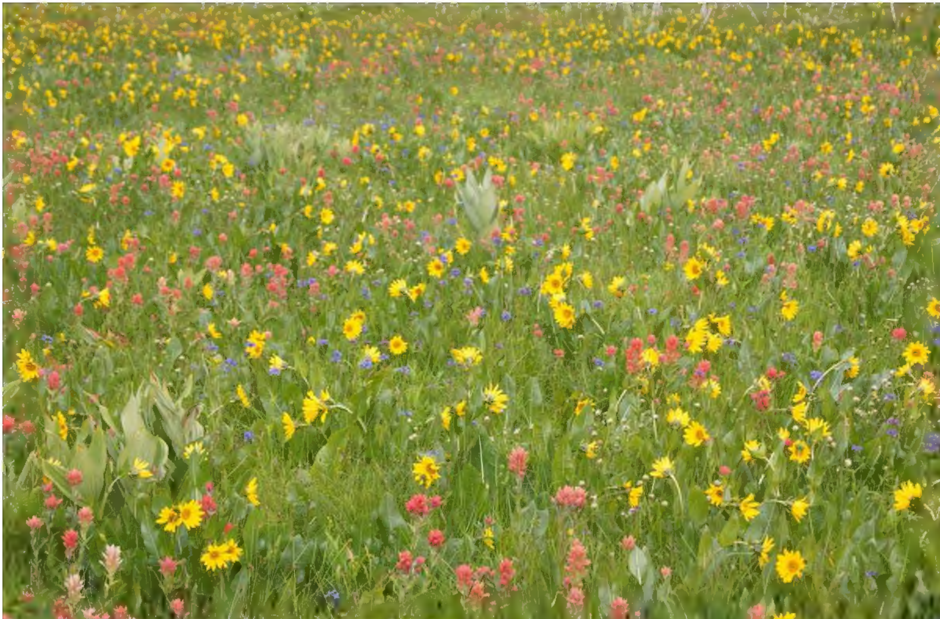
Figure 8. Lomatium knokei habitat at the type locality.