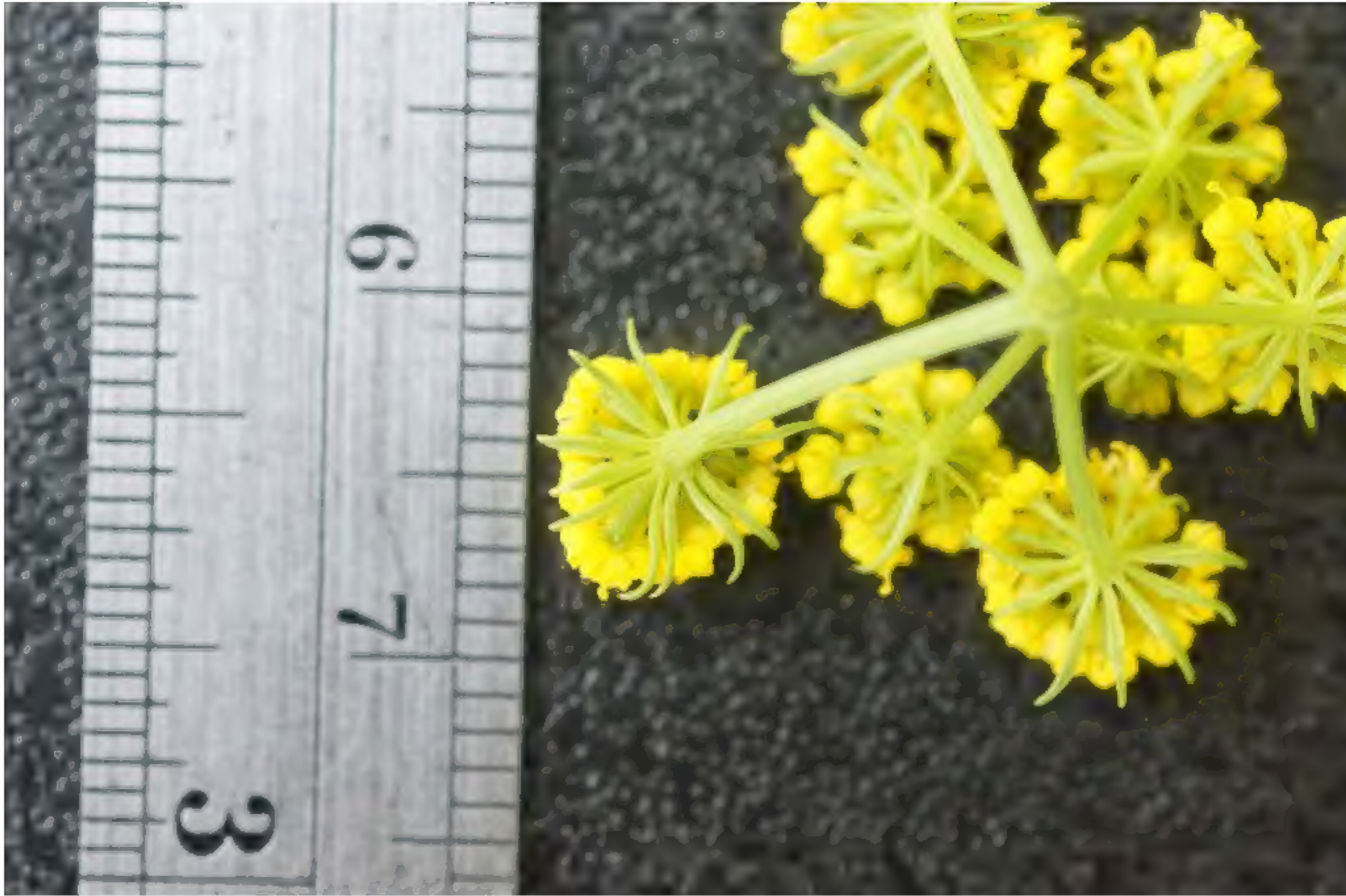
Figure 5. Lomatium knokei inflorescence showing well-developed involucre bracts.