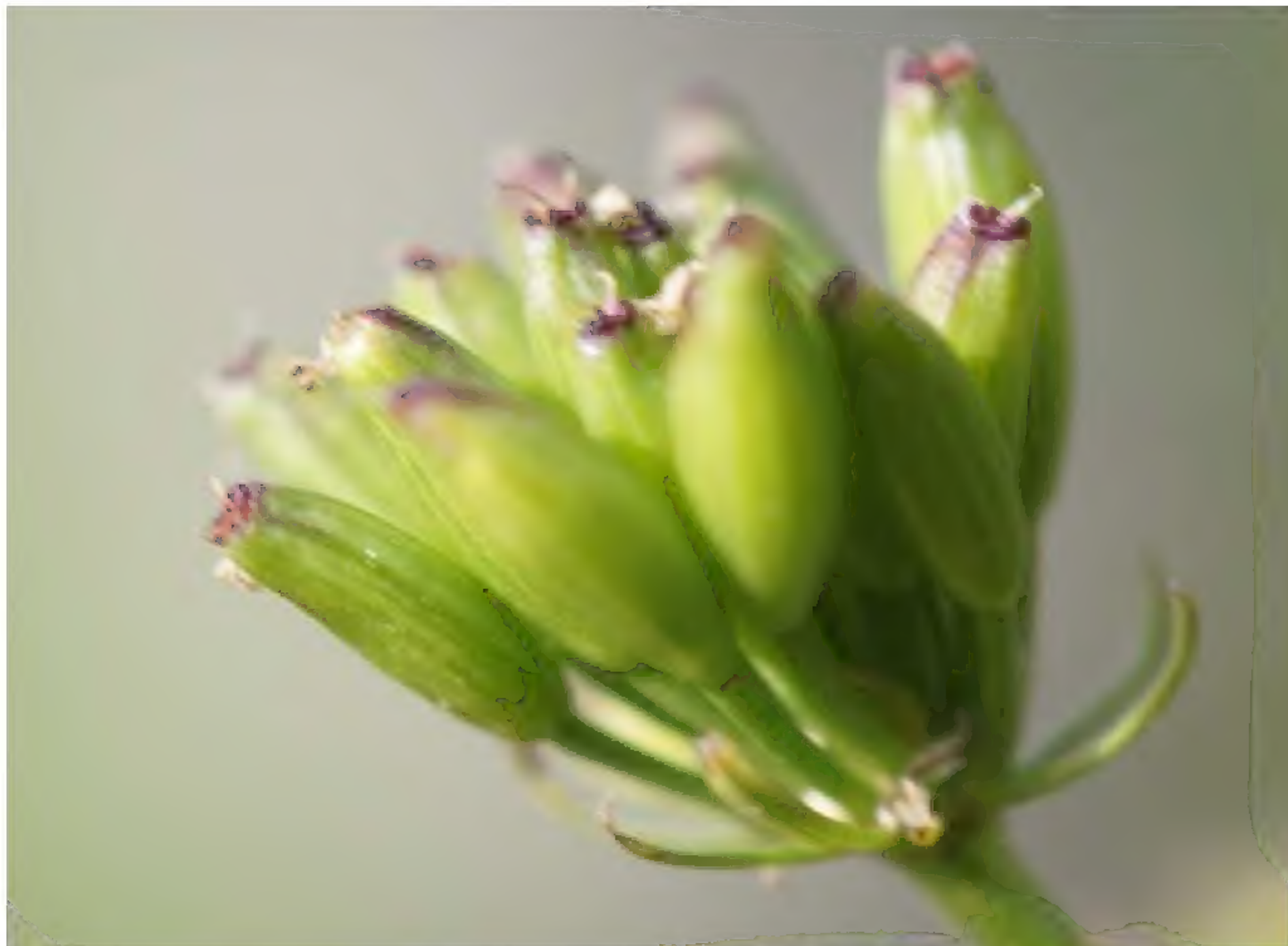
Figure 6. Lomatium knokei maturing infructescence umbellet. See illustration for typical scale.