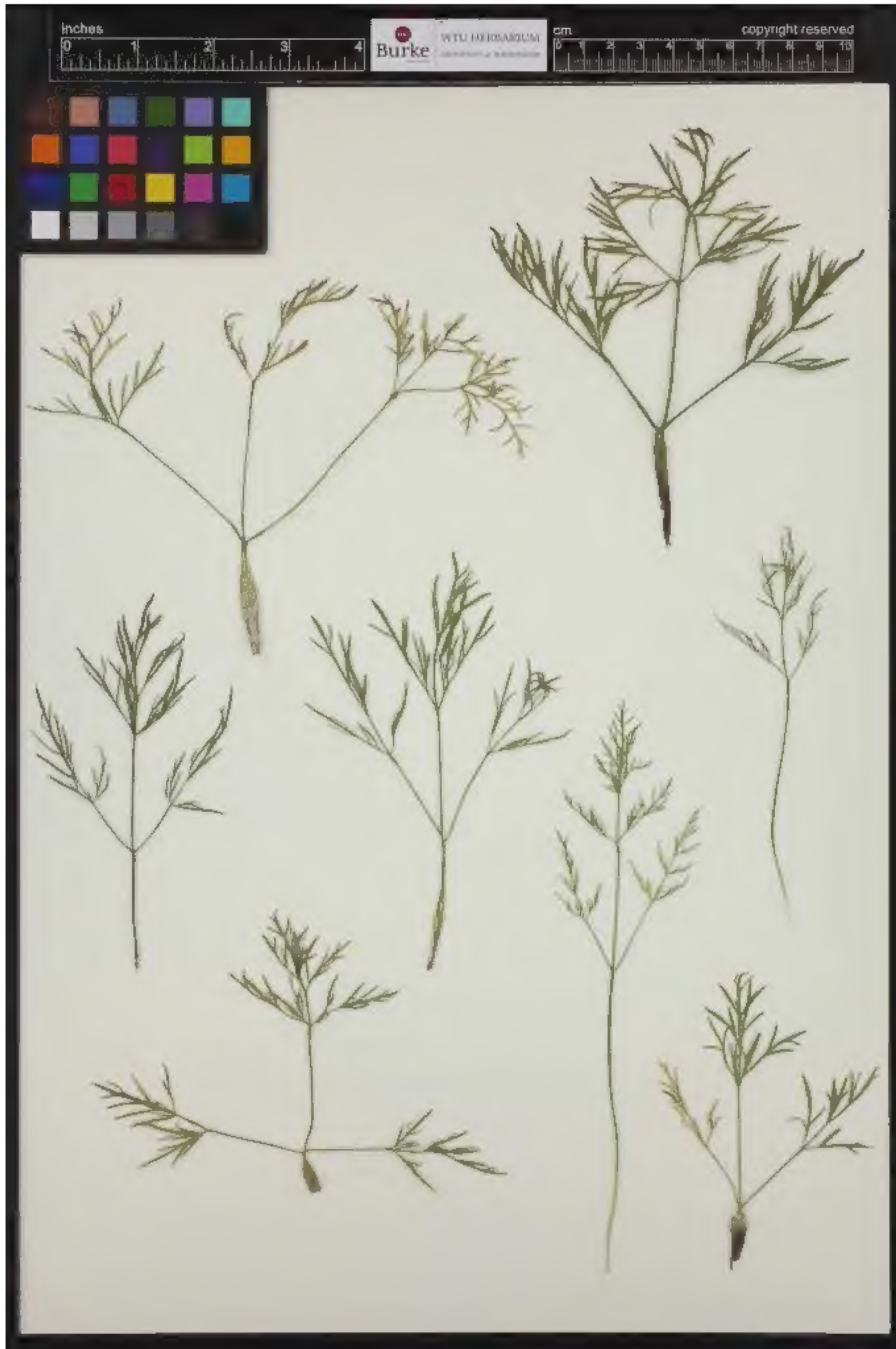
Figure 3. Lomatium knokei leaves depicting the range of variation of leaf morphology typical for the species. Those leaves shown with broad petiole bases are primary while those lacking this feature are axial leaves that arise from inside the broad petiole bases of the primary leaves.