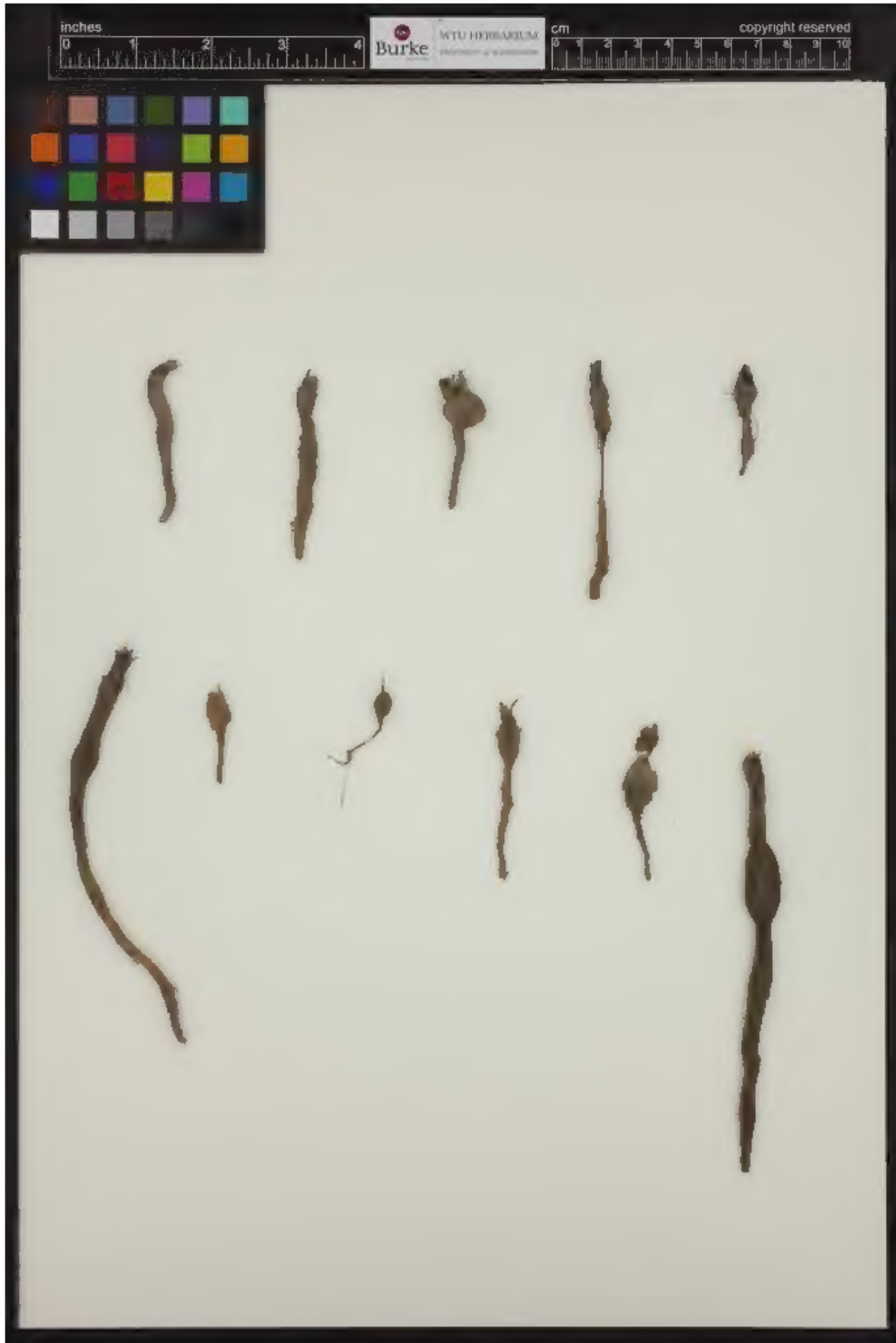
Figure 4. Lomatium knokei roots depicting the range of variation of morphology typical for the species. Note the tuberous swelling immediately beneath the root crown on the majority of the specimens.