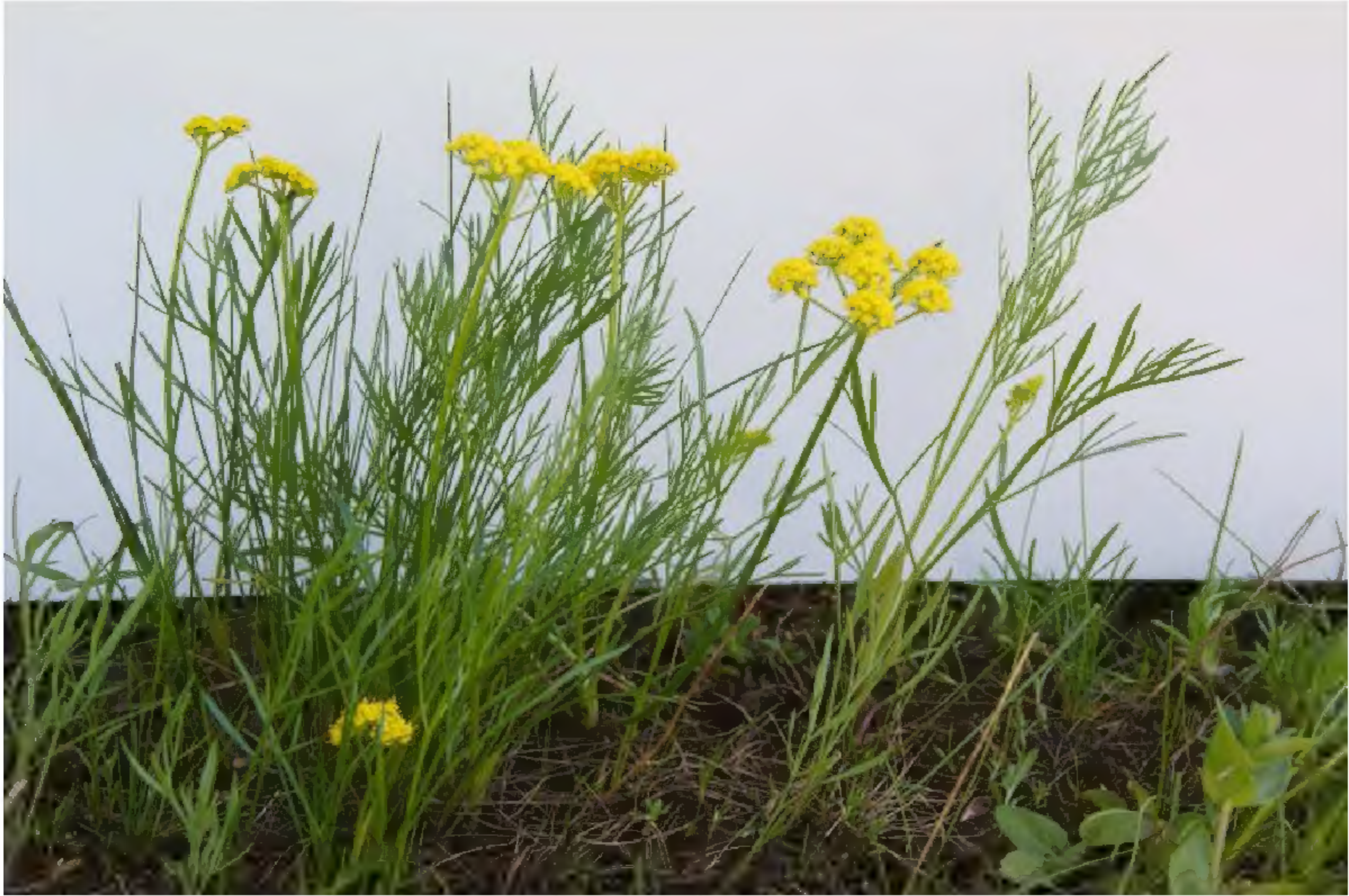
Figure 7. Lomatium knokei mature plants in situ at anthesis. Plants are approximately 20 to 25 cm in height in this view.