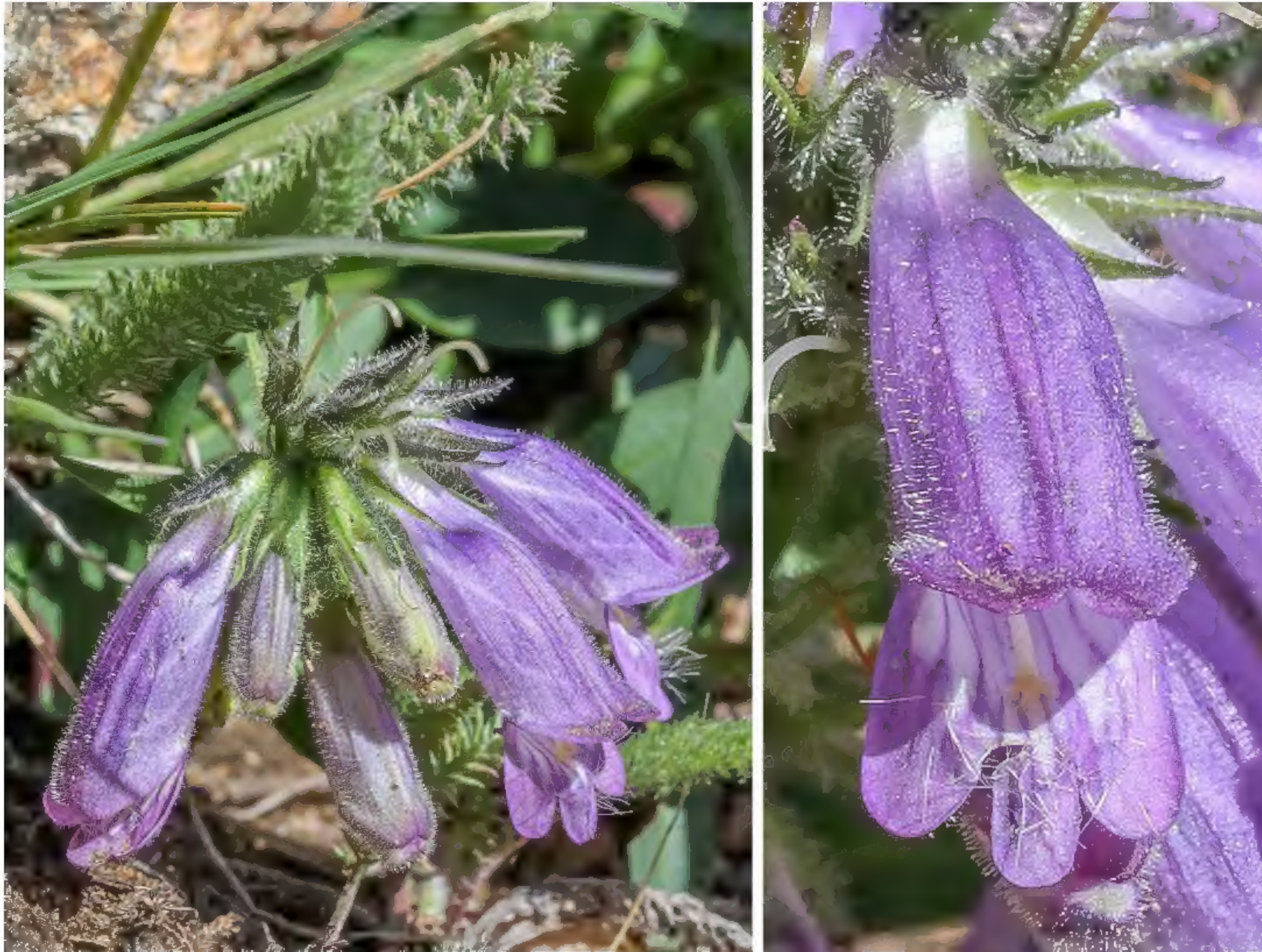
Figure 2. Flower and inflorescence of Penstemon bleaklyi .