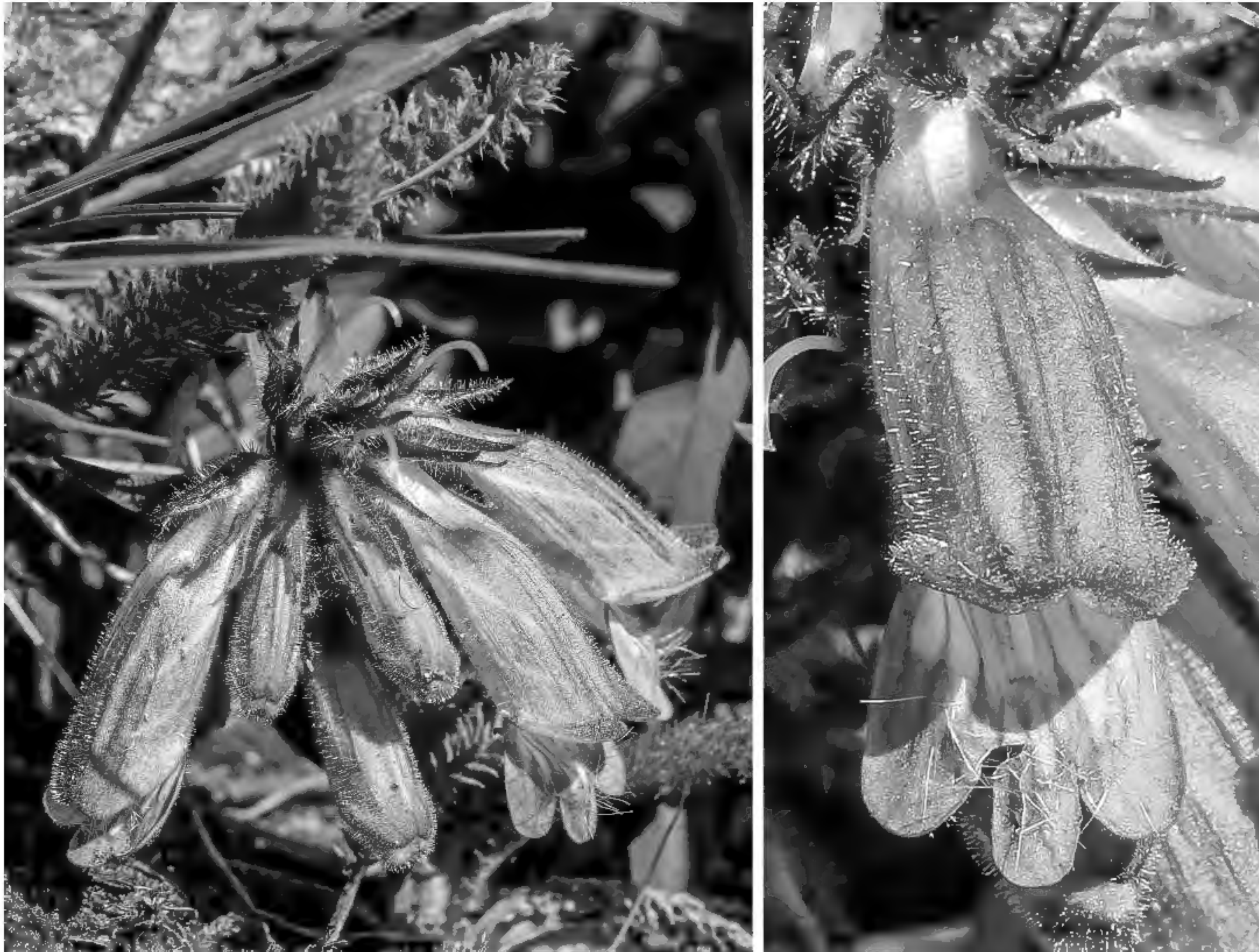
Figure 2. Flower and inflorescence of Penstemon bleaklyi .