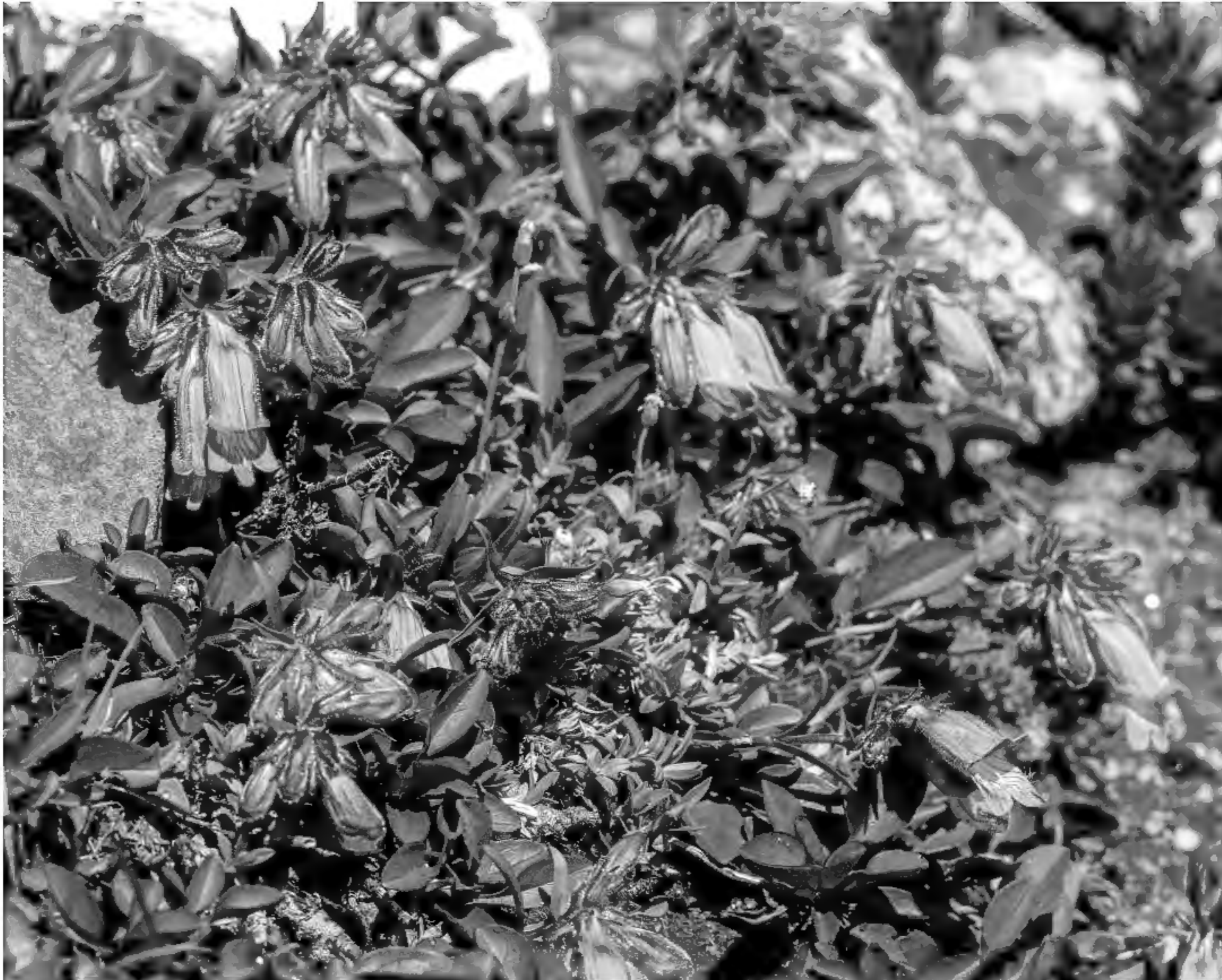
Figure 1. Habit of Penstemon bleaklyi .

Paratypes. USA. New Mexico. Taos Co.: Vermejo Park, ca. 2 mi S of State Line Peak along boundary between Vermejo Park and Rio Costilla, 36.95681° N, 105.3209° W, 12,566 ft. elev, 18 Jul 2012, Heil, Hyder, and Martinez 34213 (SJNM); Rio Costilla Land Grant, Culebra Range, crest of ridge on S side of an unnamed cirque, 2.2 air mi NNW of Big Costilla Peak and 3.3 air mi SSW of State Line Peak, 36.95158° N, 105.3183° W, 12,620 ft. elev, 19 Jul 2012, Heil, Hyder, and Martinez 34276 (SJNM).