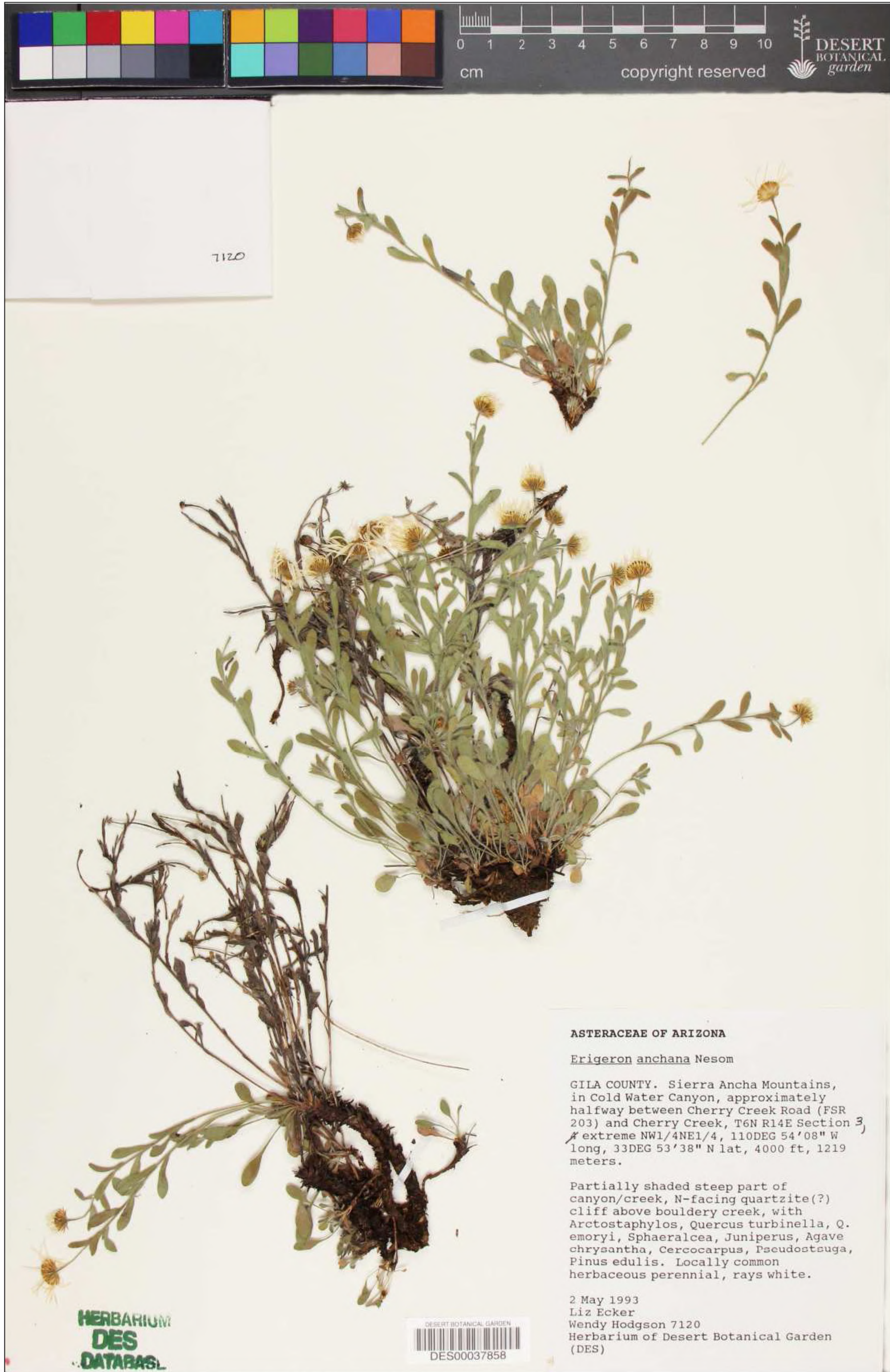
Figure 4. Erigeron hodgsoniae , Hodgson 7120, DES.