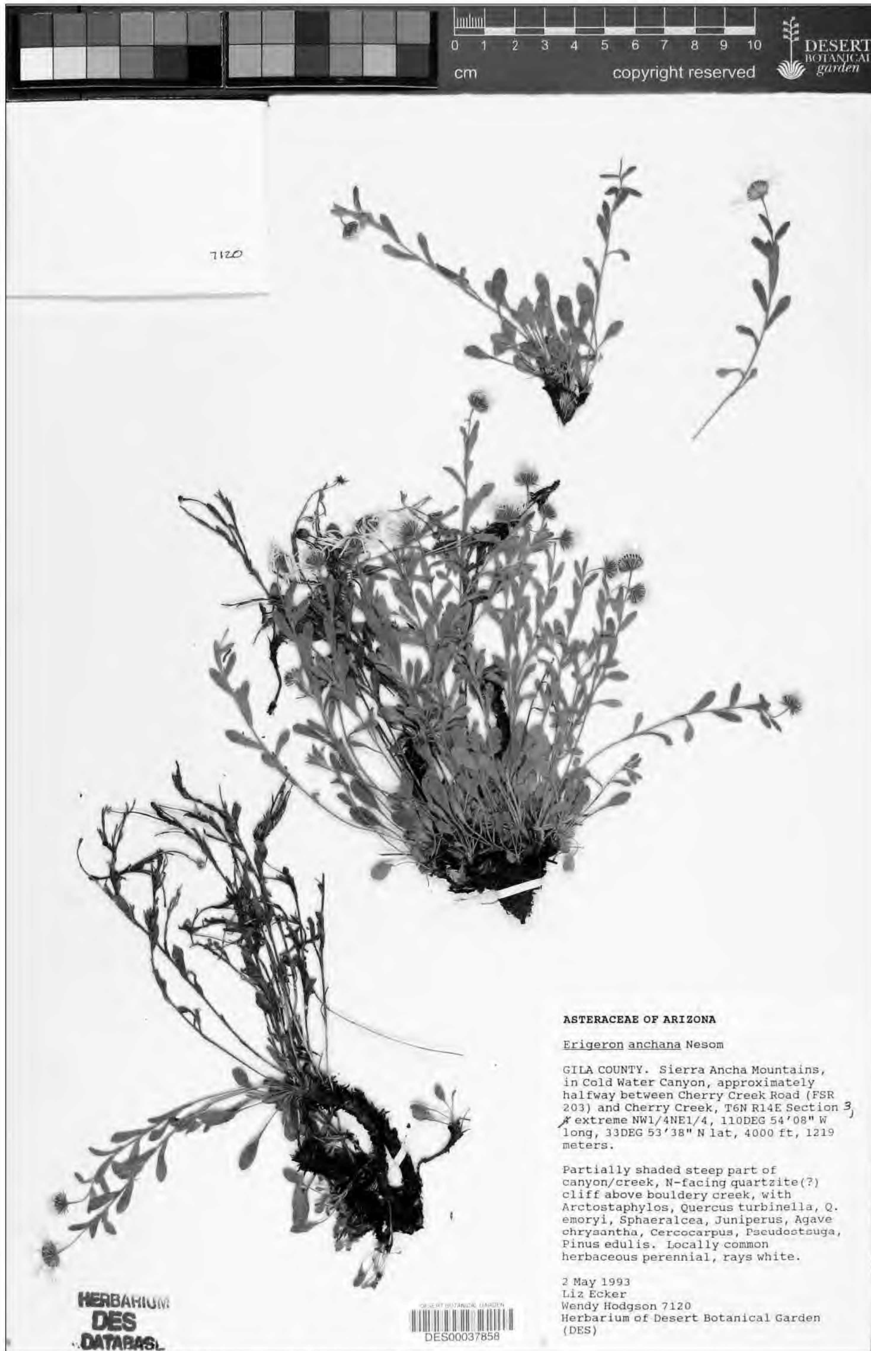
Figure 4. Erigeron hodgsoniae , Hodgson 7120, DES.