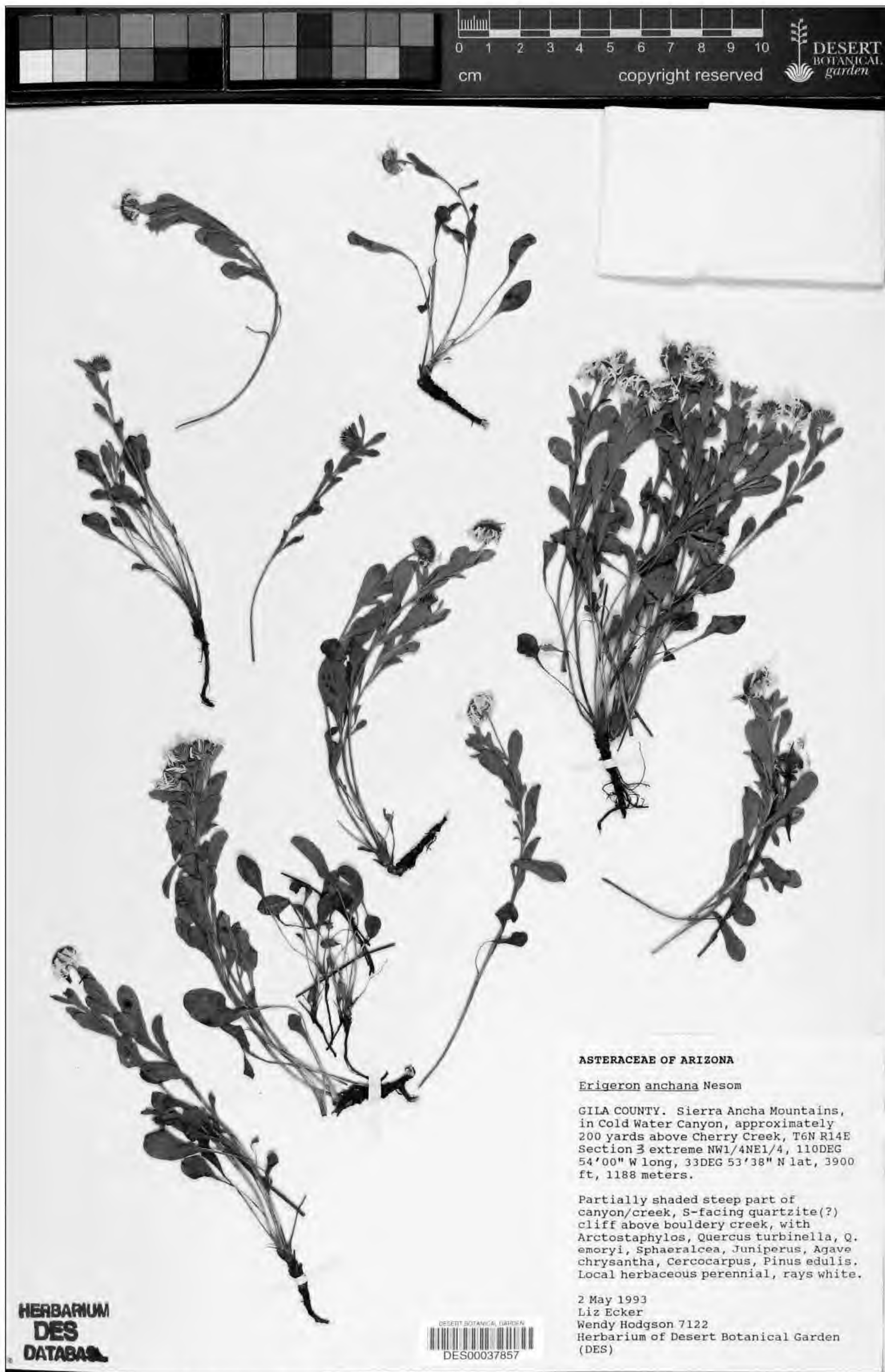
Figure 3. Erigeron hodgsoniae , Hodgson 7122, DES.