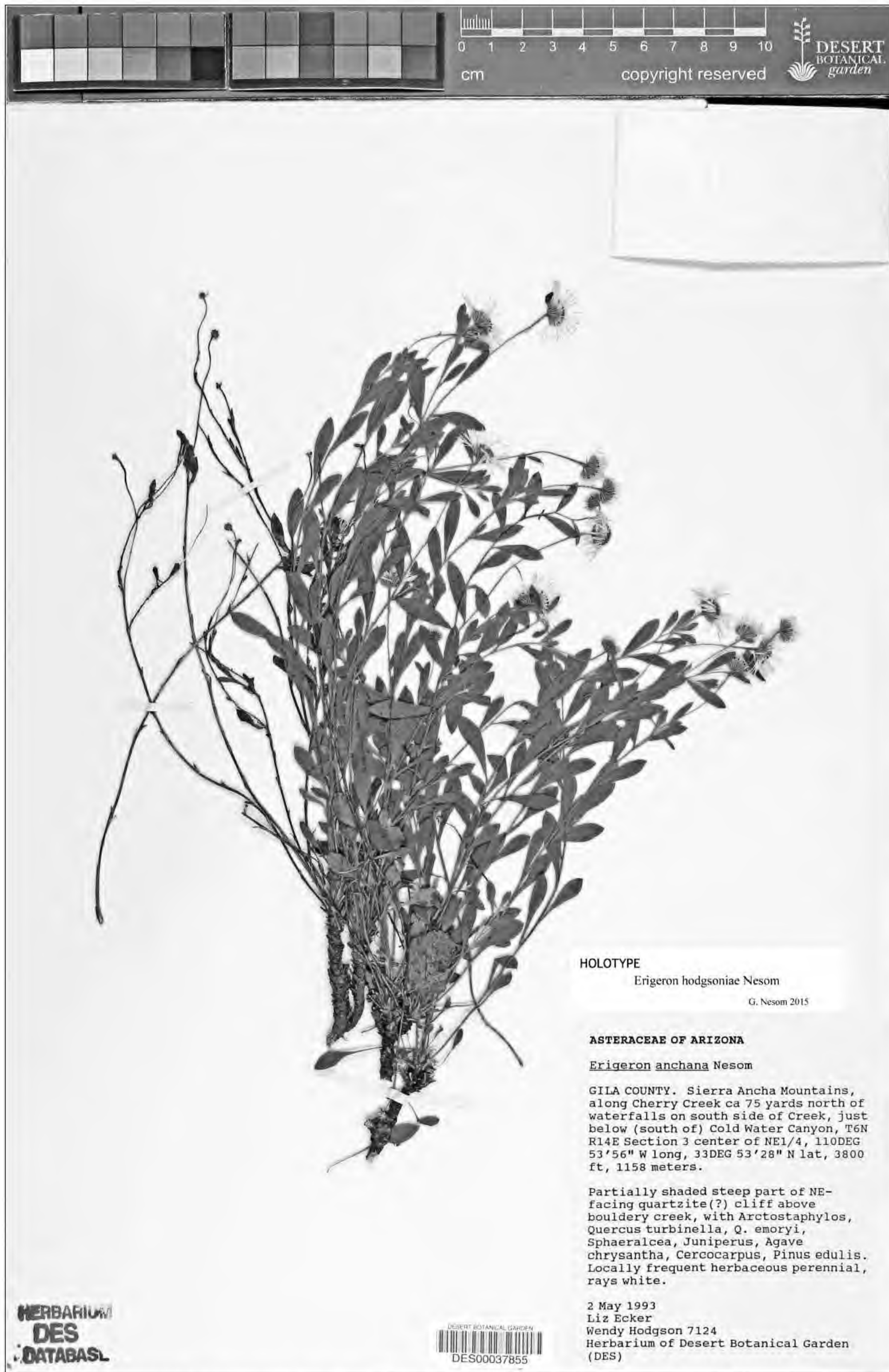
Figure 2. Holotype of Erigeron hodgsoniae , DES.