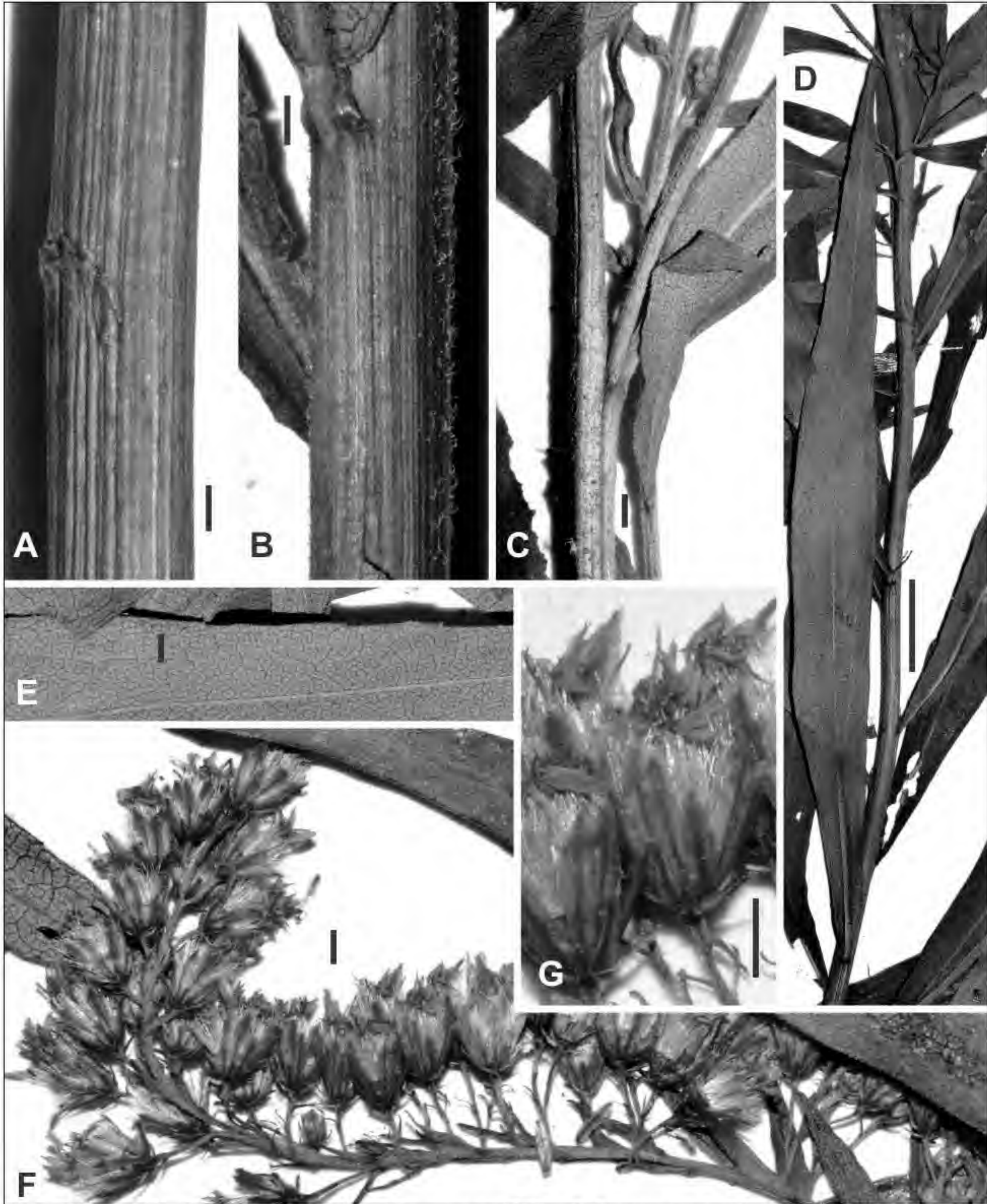
Figure 2. Details of Solidago brendiae , Stearns s.n. (VT). A. Lower stem. B. Mid stems. C. Stem in inflorescence. D. Upper stem leaf, adaxial surface. E. Upper stem leaf, adaxial surface, mid margin with small serrations. F. Lower inflorescence branch. G. Heads. Scale bars: = 1 mm in A-C and E-G; = 1 cm in D