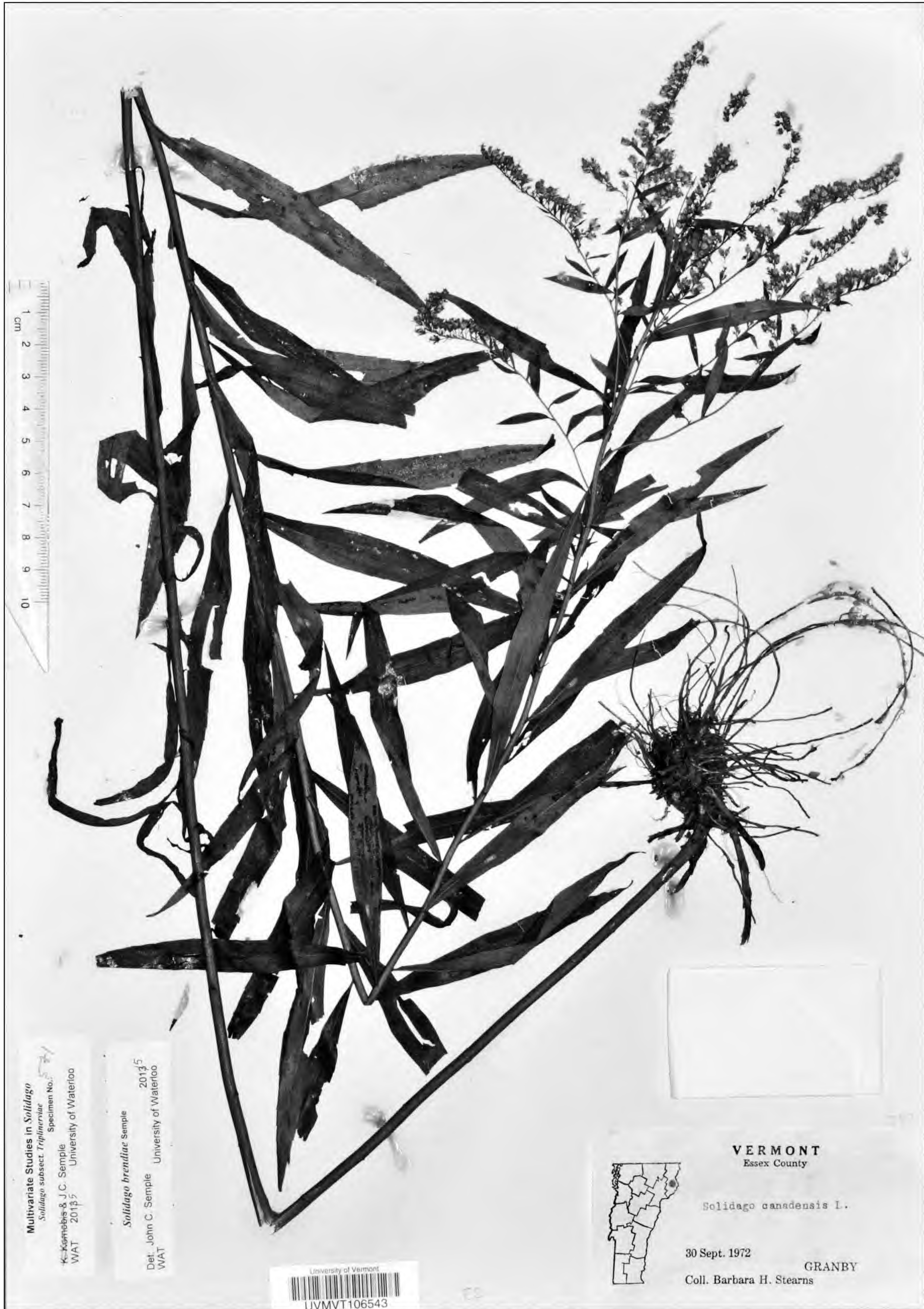
Figure 1. Solidago brendiae from Granby, Vermont: Stearns s.n. (VT).