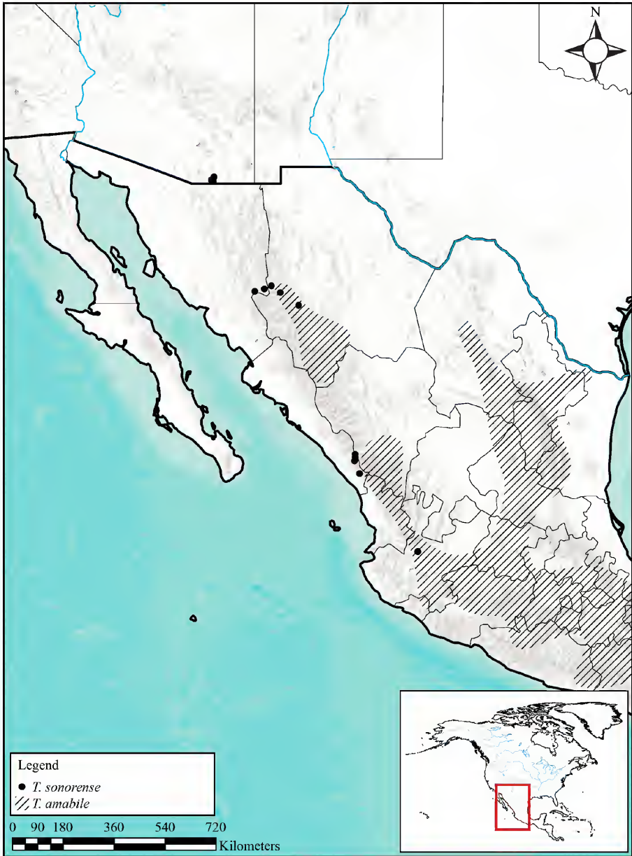
Figure 2. Distribution of Trifolium sonoreense compared with the general range of T. amabile .