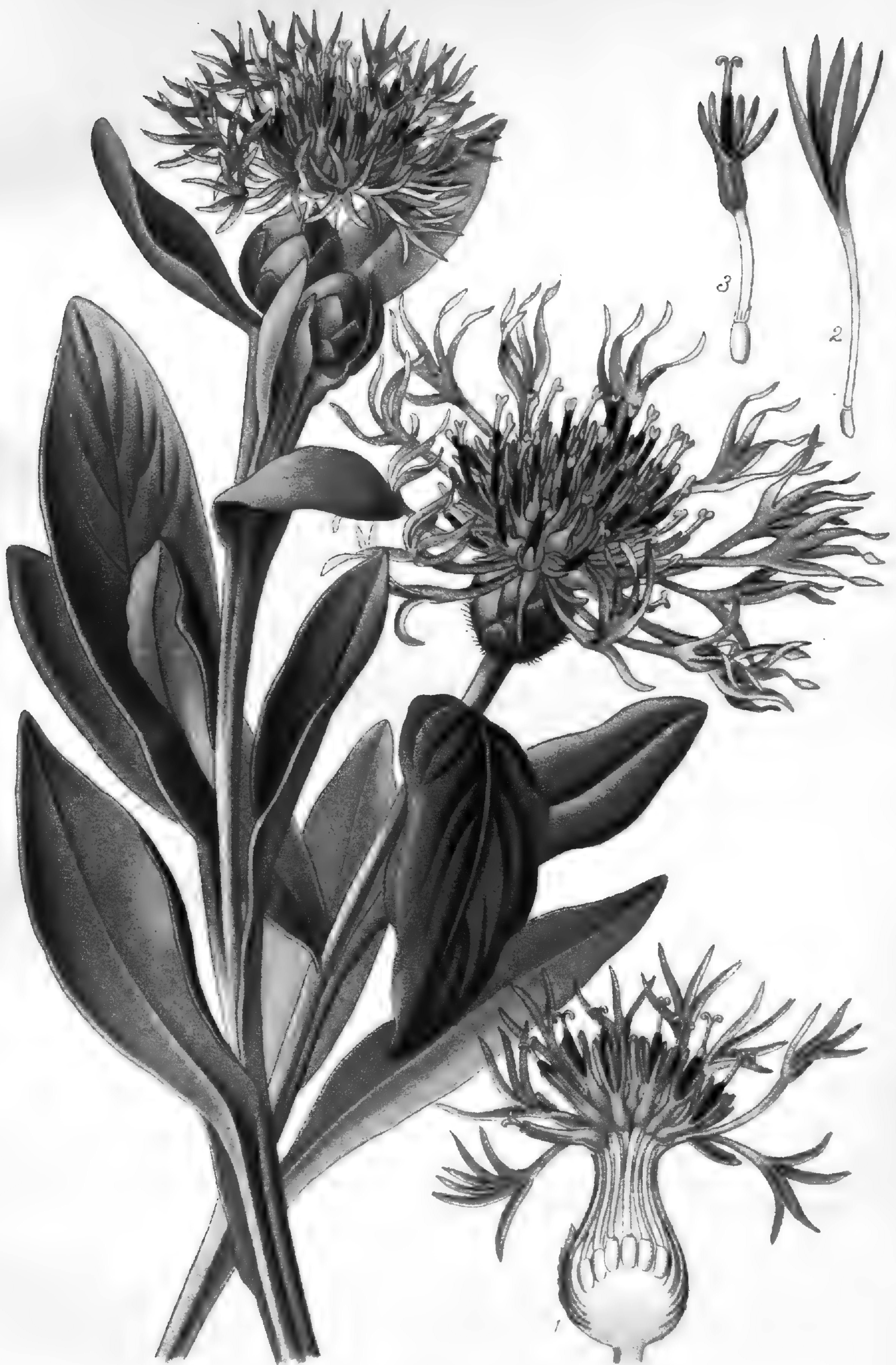
MOUNTAIN CORNFLOWER (CENTAUREA MONTANA)