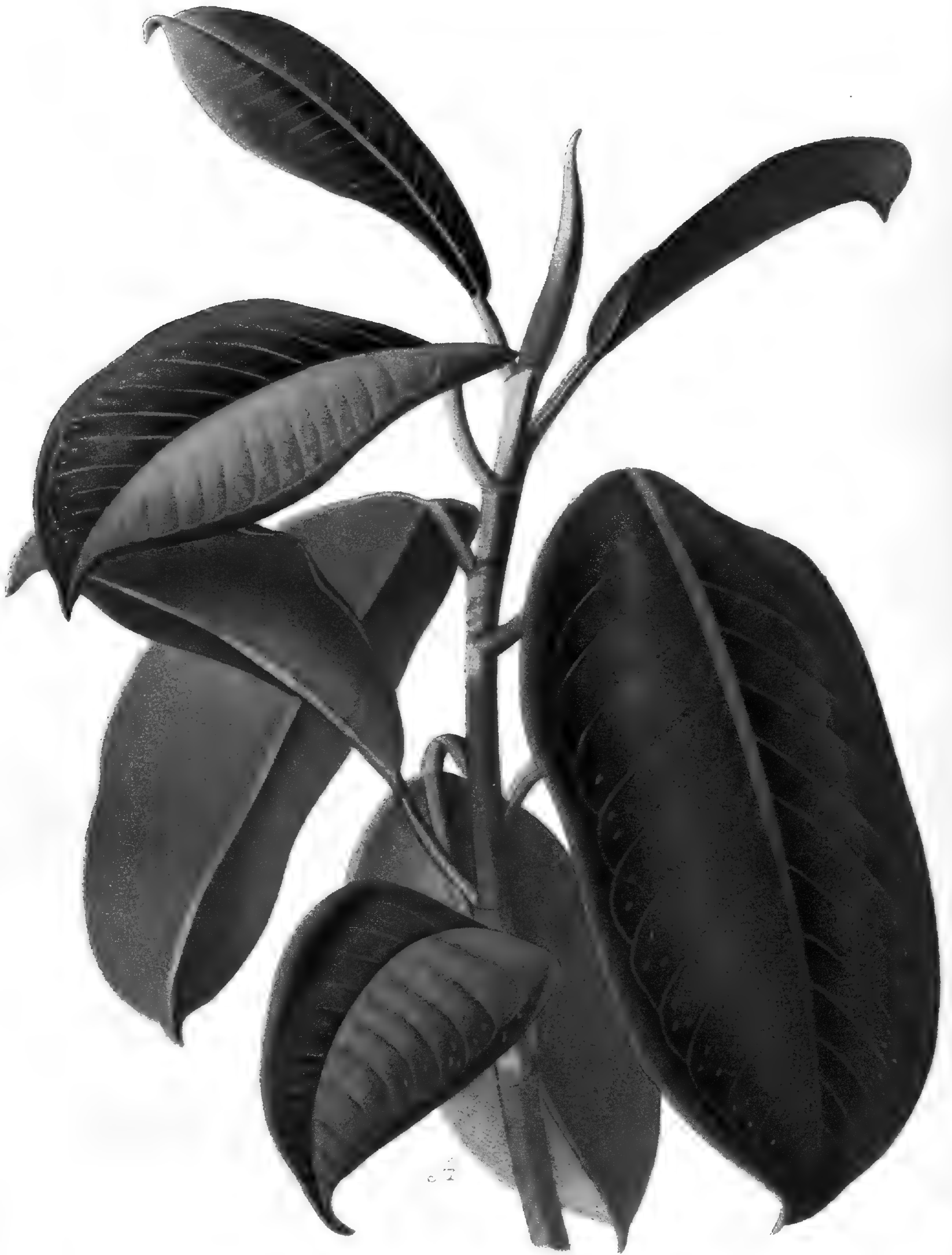
INDIA-RUBBER PLANT ( FICUS ELASTICA )