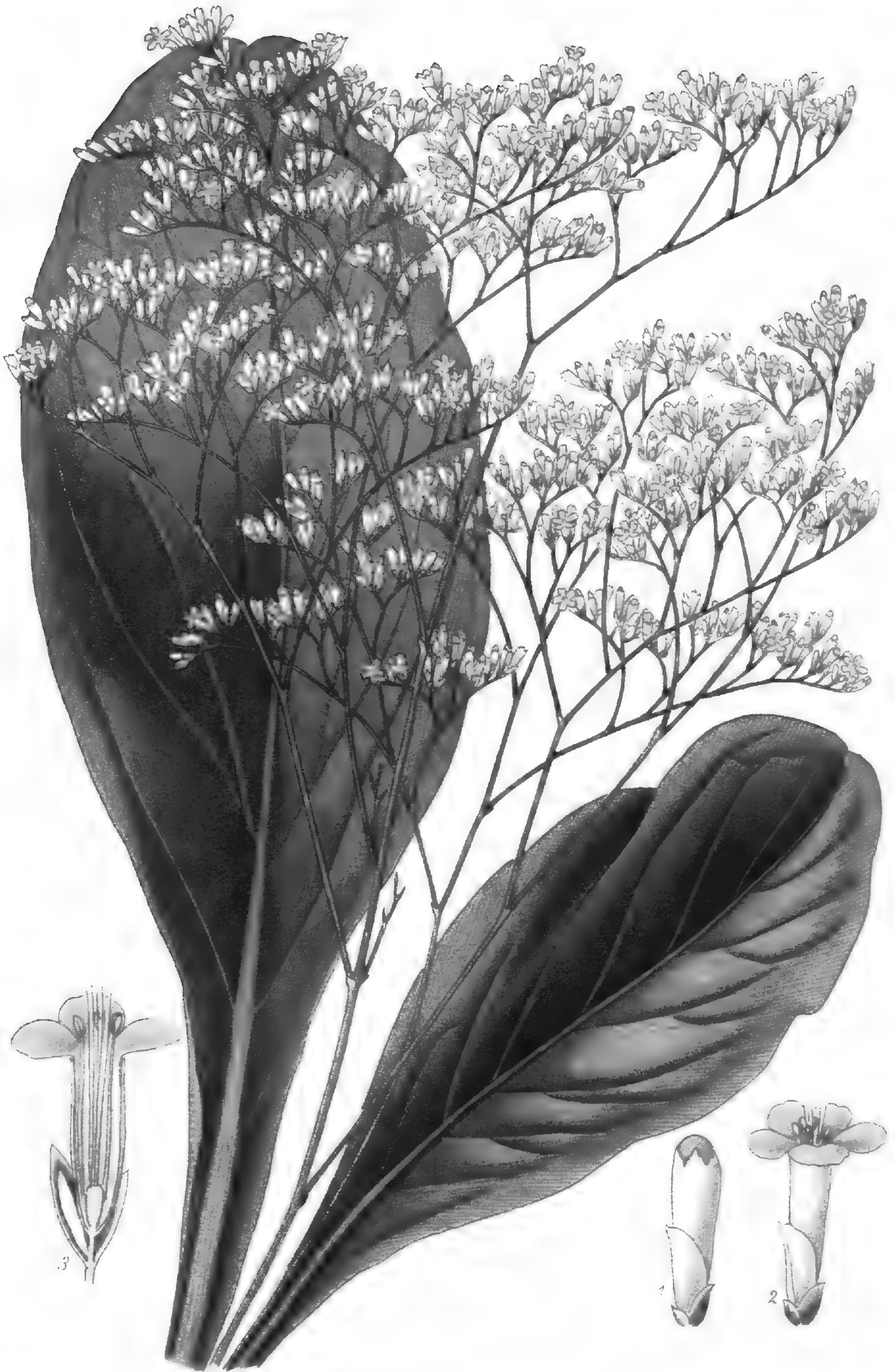
SEA LAVENDER ( STATICE LATIFOLIA )