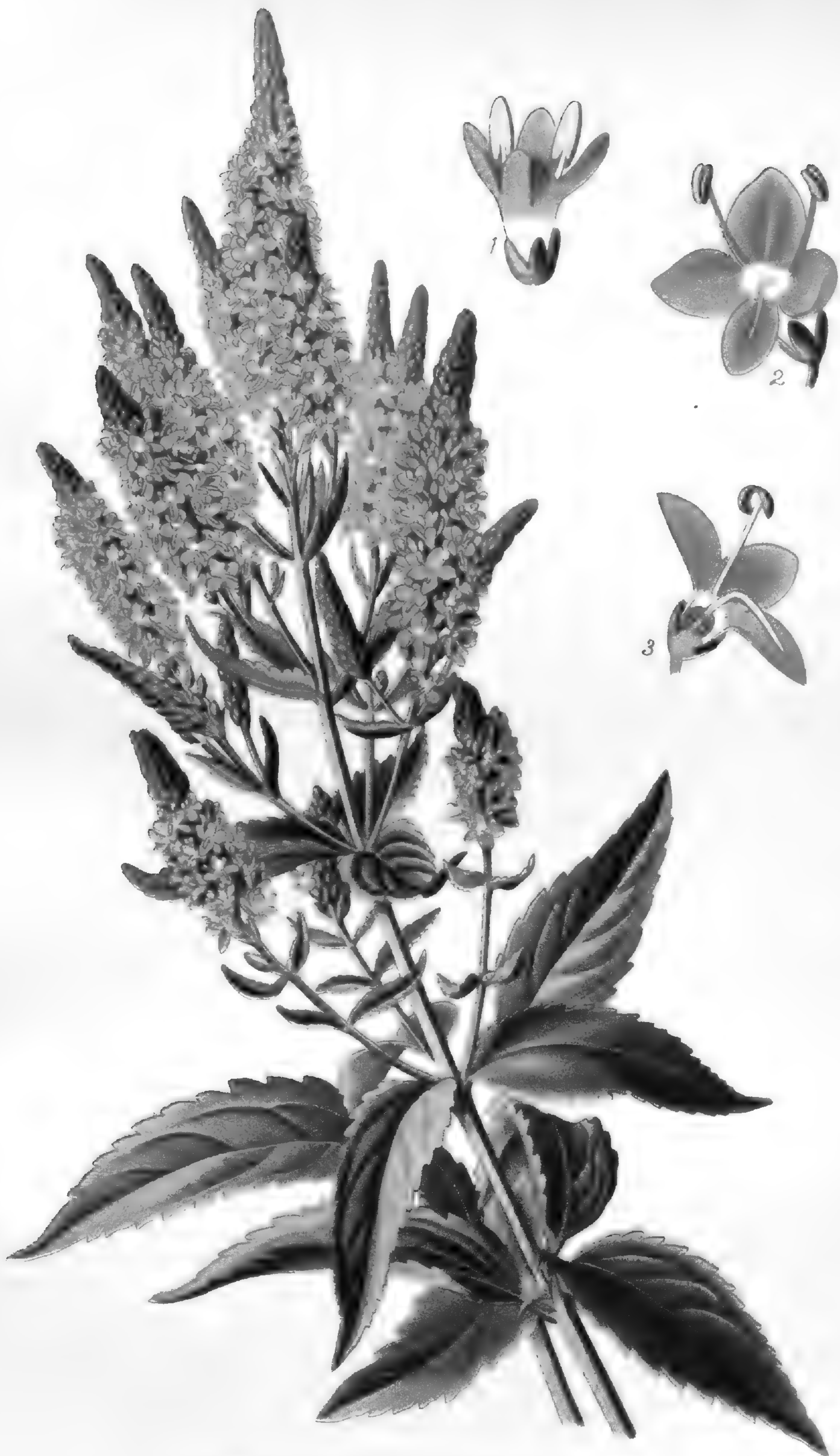
LONG-LEAVED SPEEDWELL ( VERONICA LONGIFOLIA )