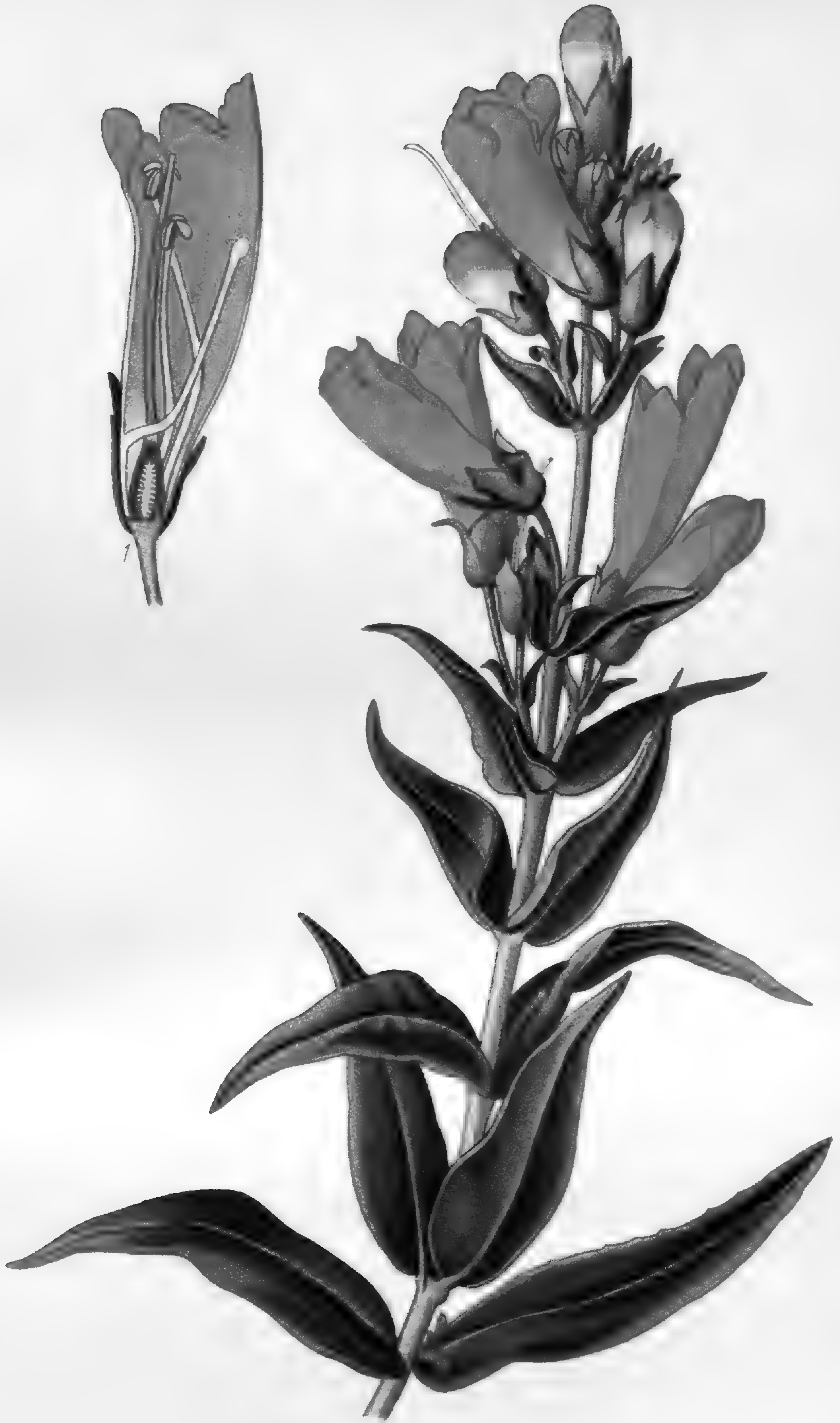
BEARD-TONGUE (PENTSTEMON HARTWEGI)