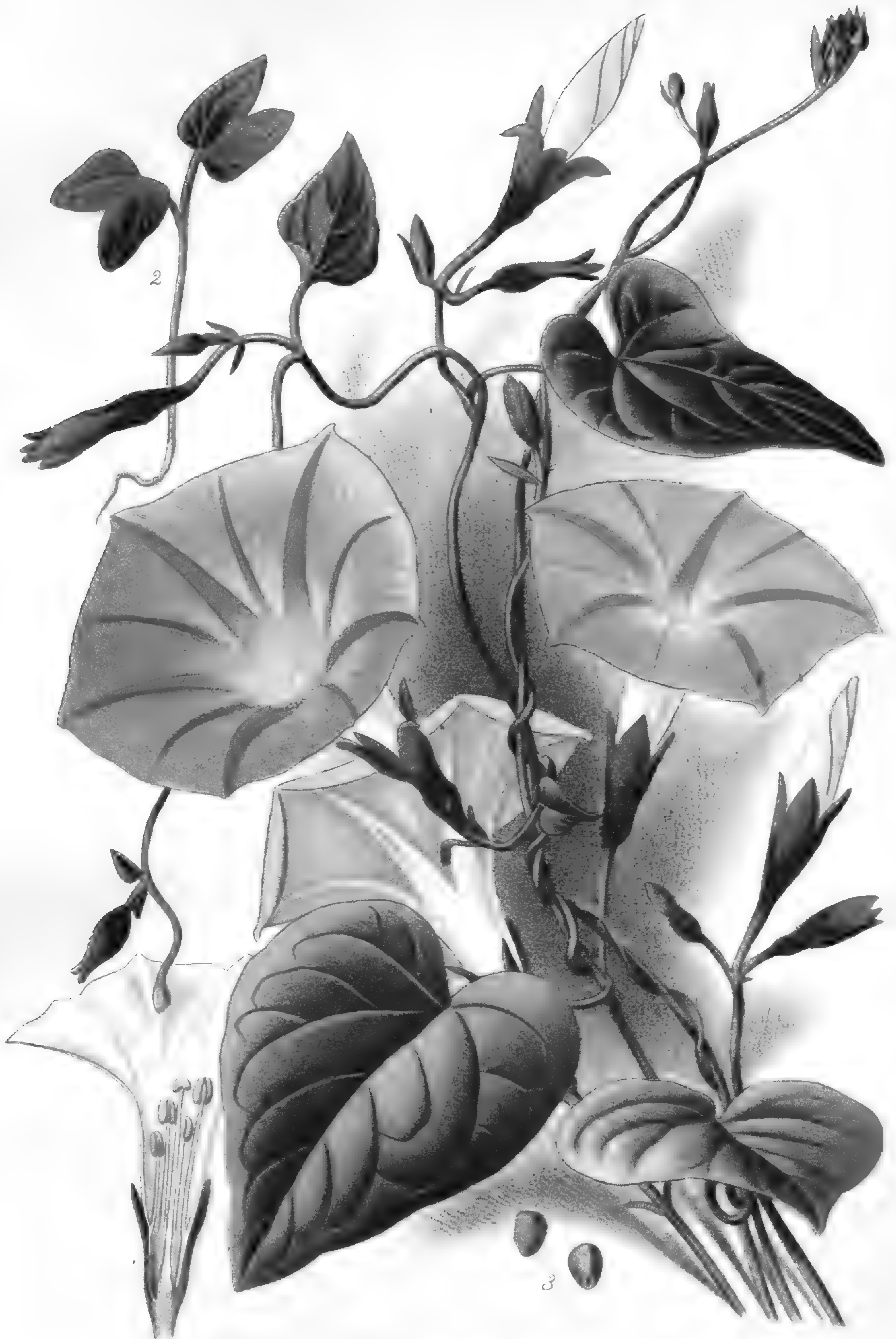
CONVOLVULUS, OR MORNING GLORY ( IPOMÆA PURPUREA )