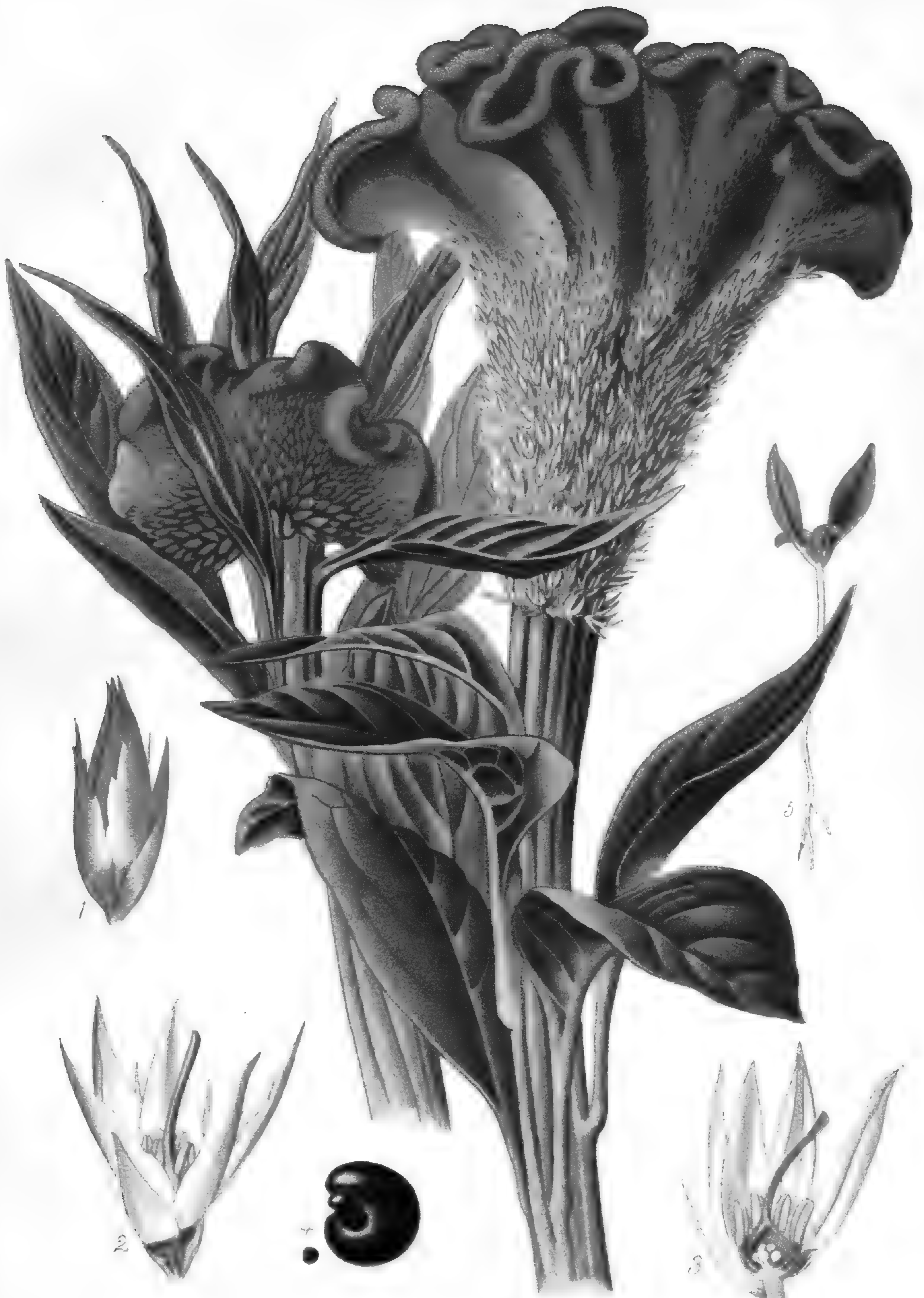
COCK'S-COMB (CELOSIA CRISTATA)