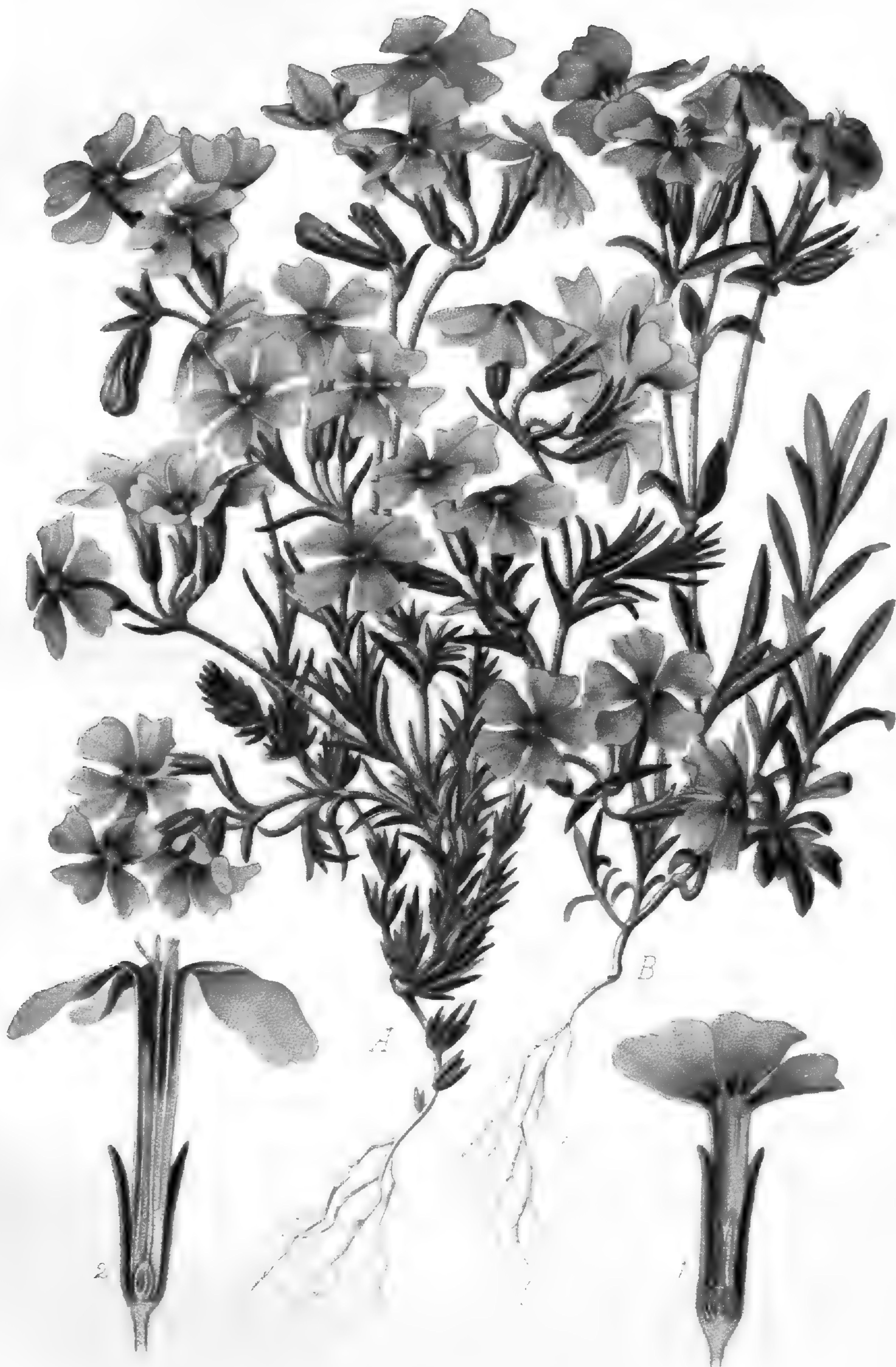
PHLOX SUBULATA and var.