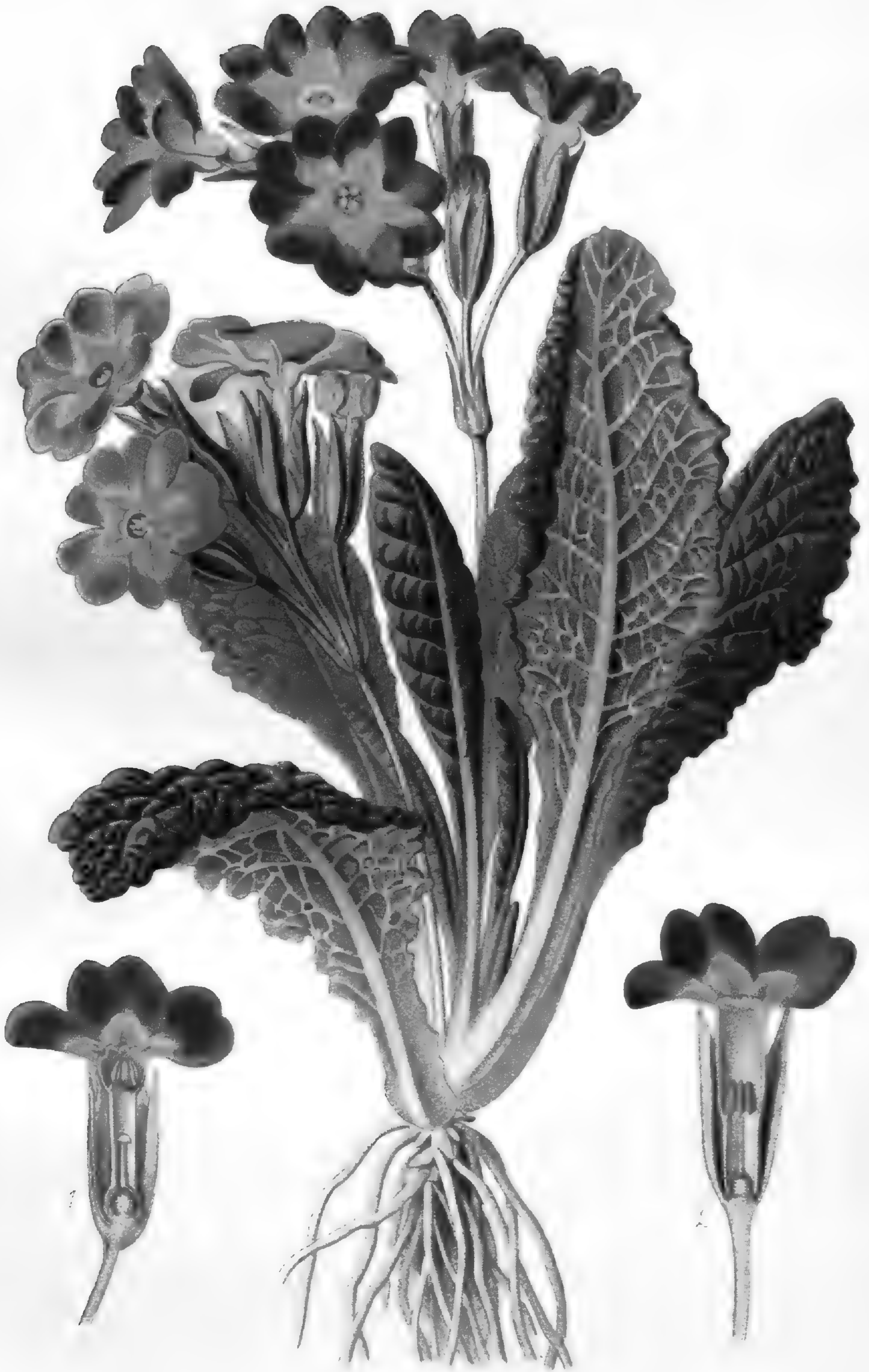
POLYANTHUS (PRIMULA VARIABILIS)