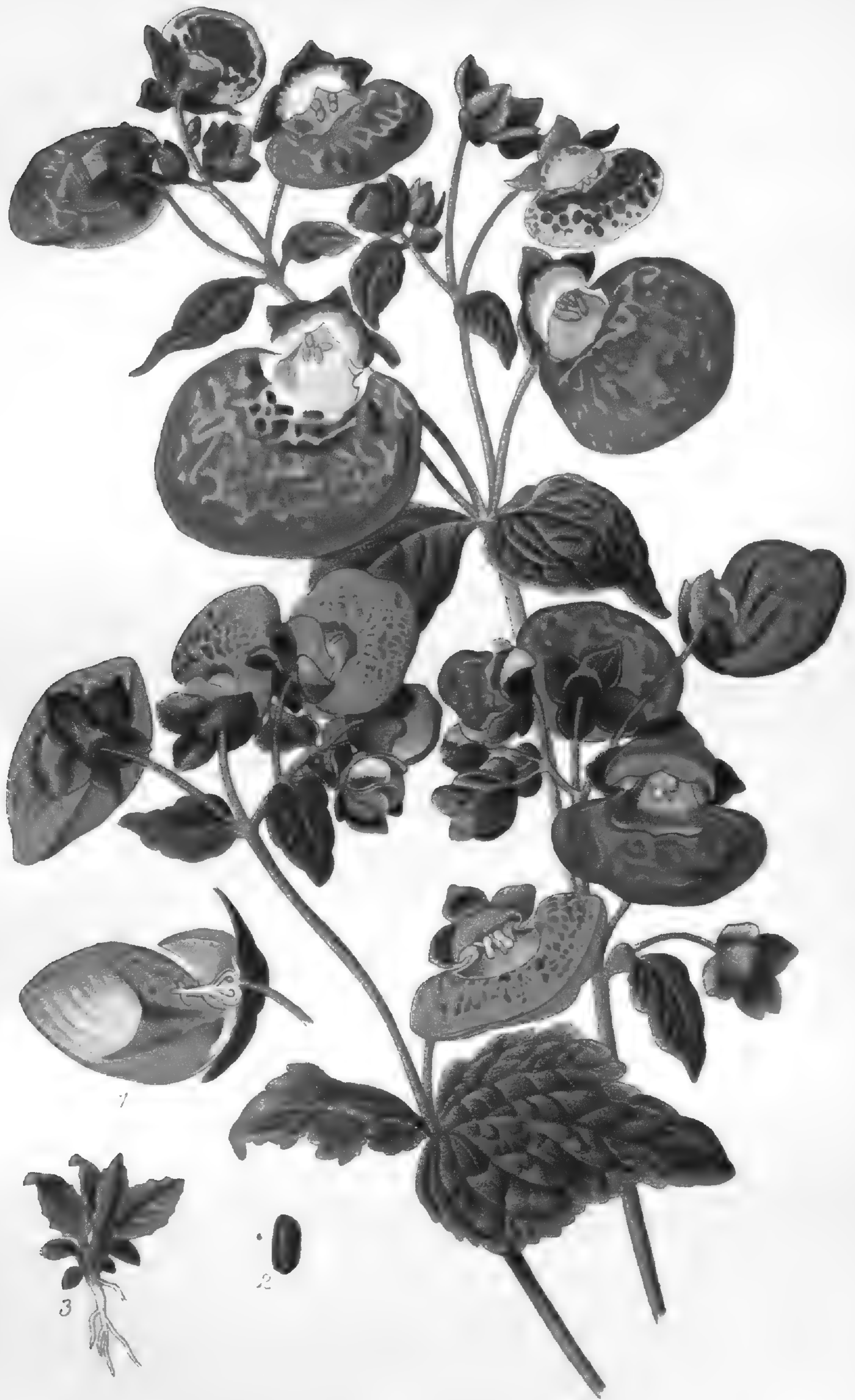
HERBACEOUS CALCEOLARIA (CALCEOLARIA HYBRIDA)