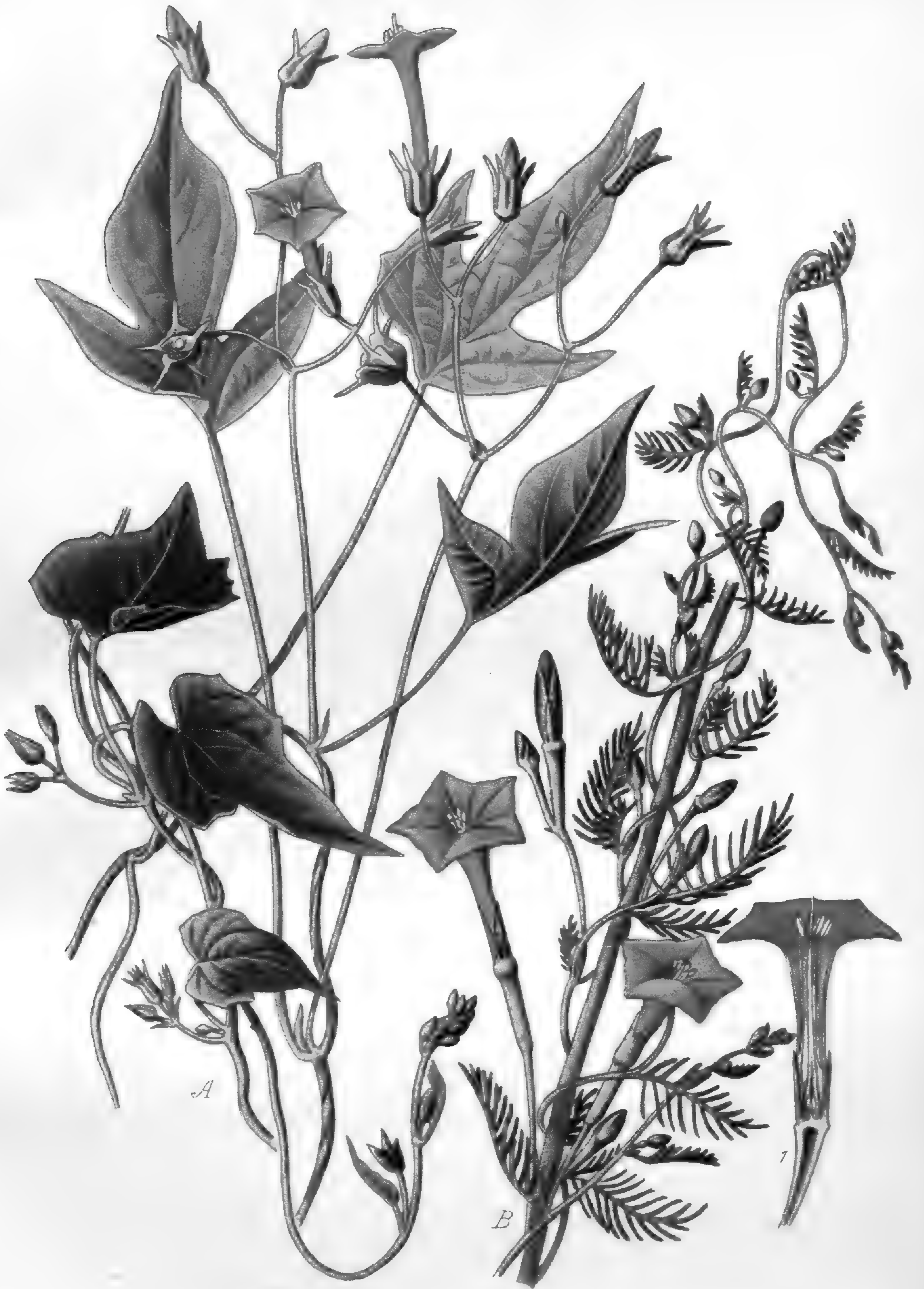
(A) I POMÆA COCCINEA