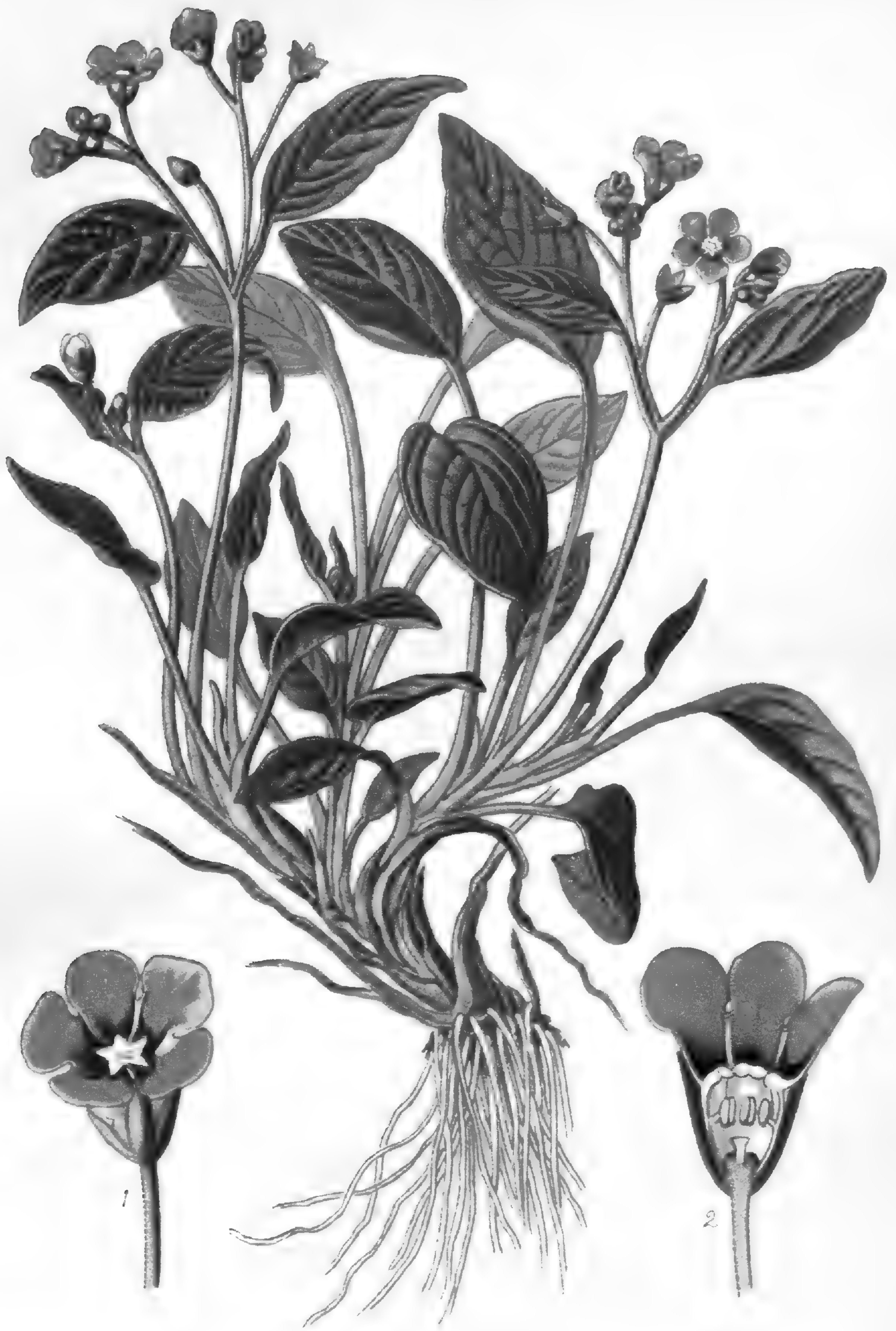
VENUS' NAVELWORT ( OMPHALODES VERNA )