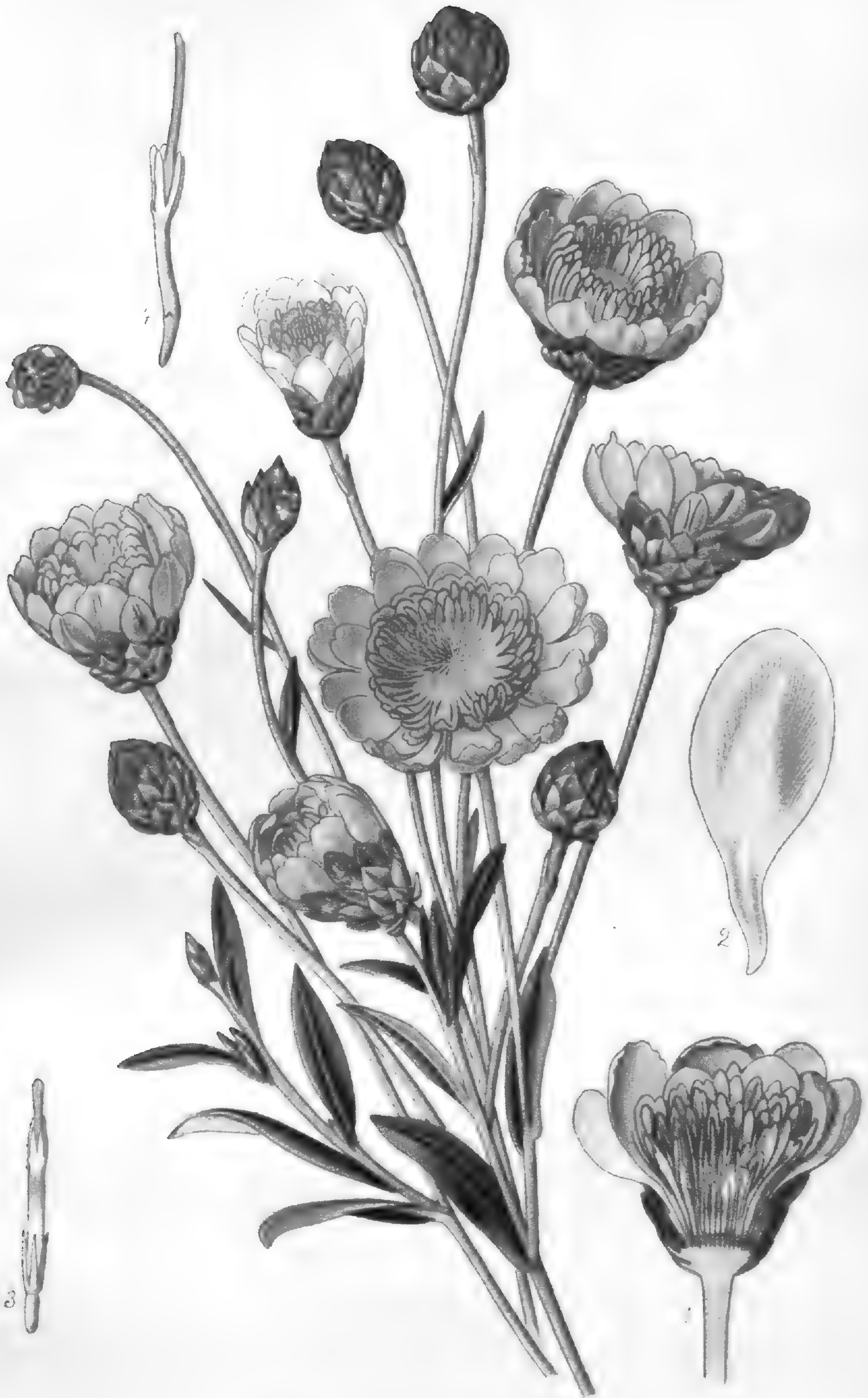
ANNUAL IMMORTELLE (XERANTHEMUM ANNUUM)