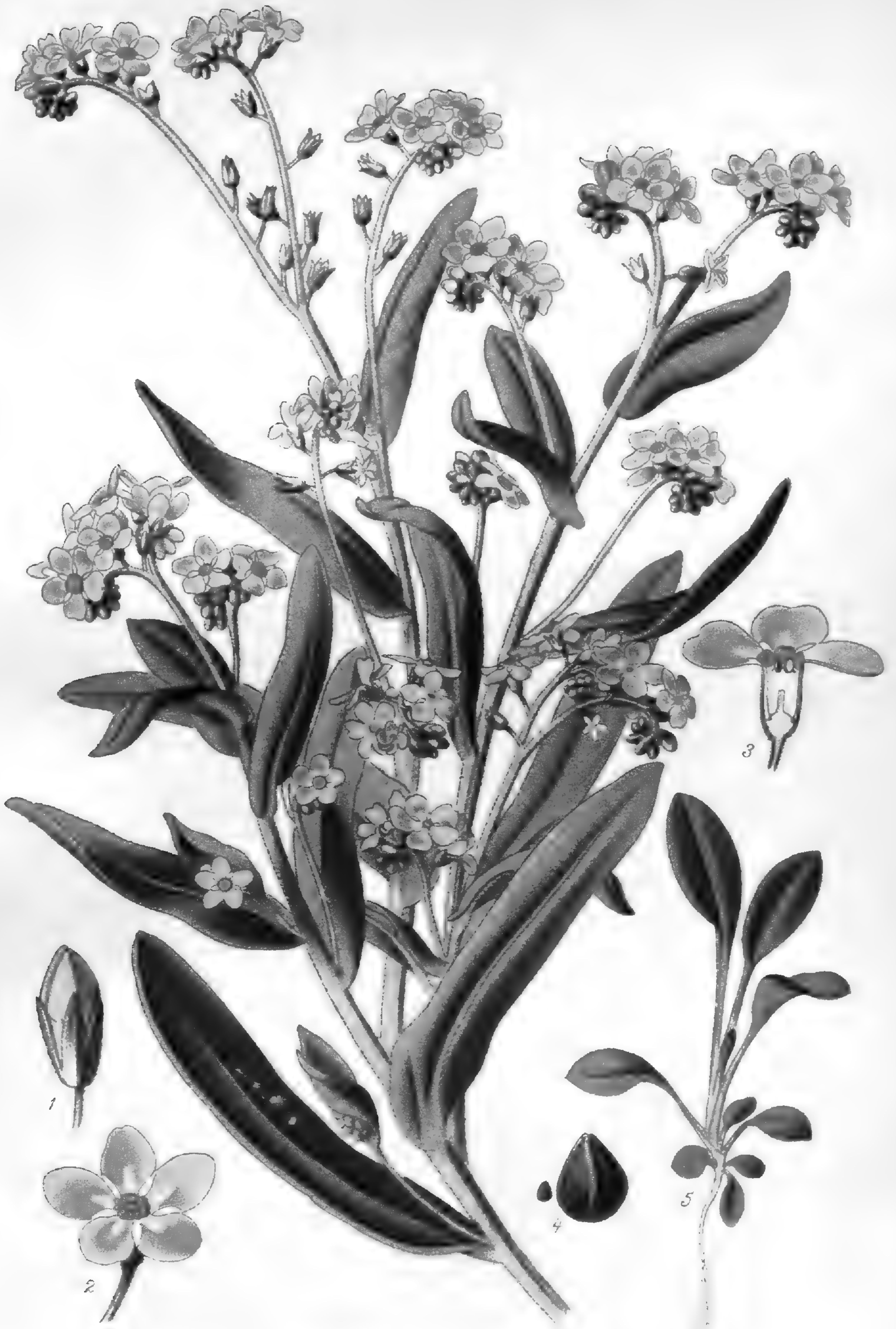
ALPINE FORGET-ME-NOT ( MYOSOTIS ALPESTRIS )