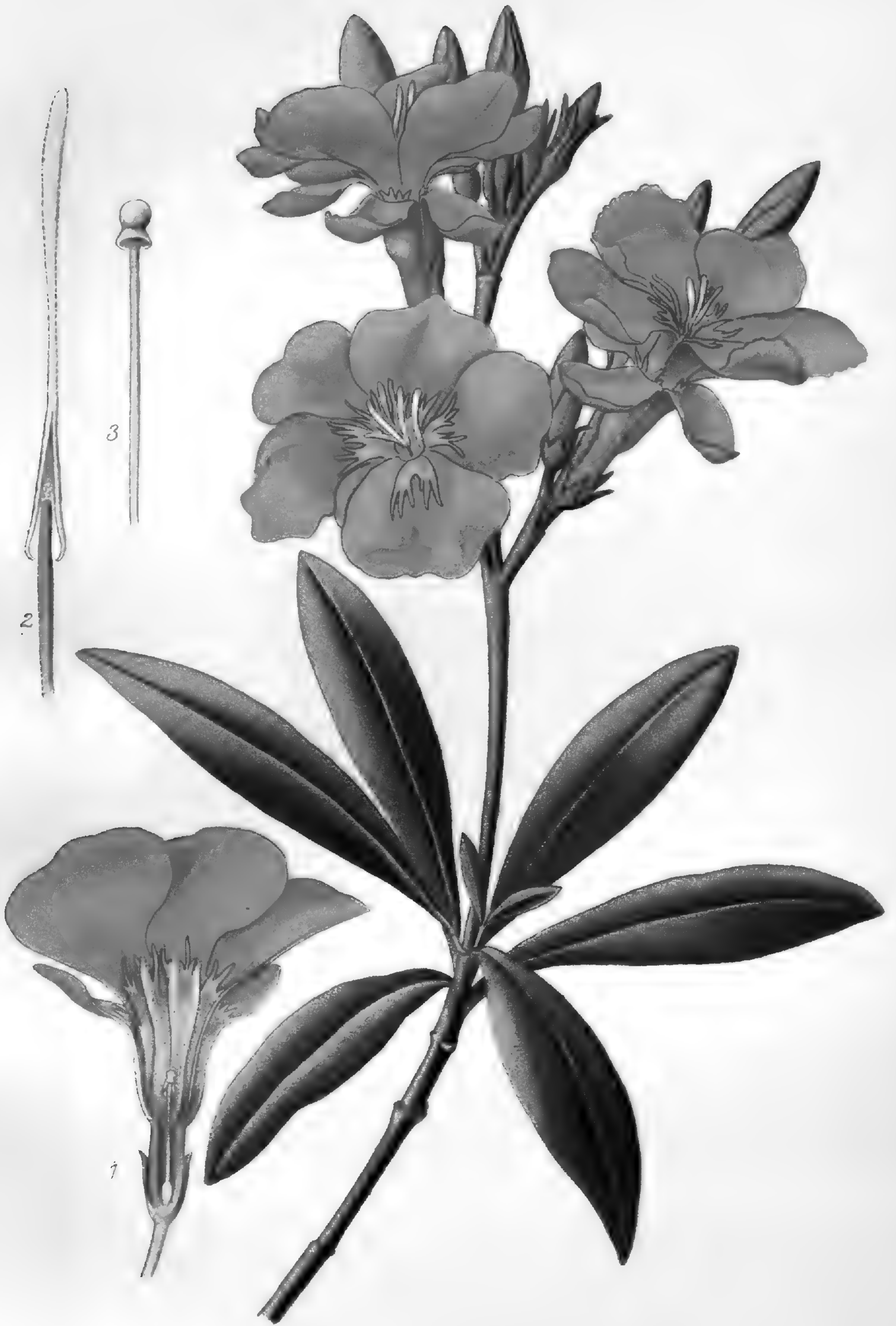
OLEANDER (NERIUM OLEANDER)