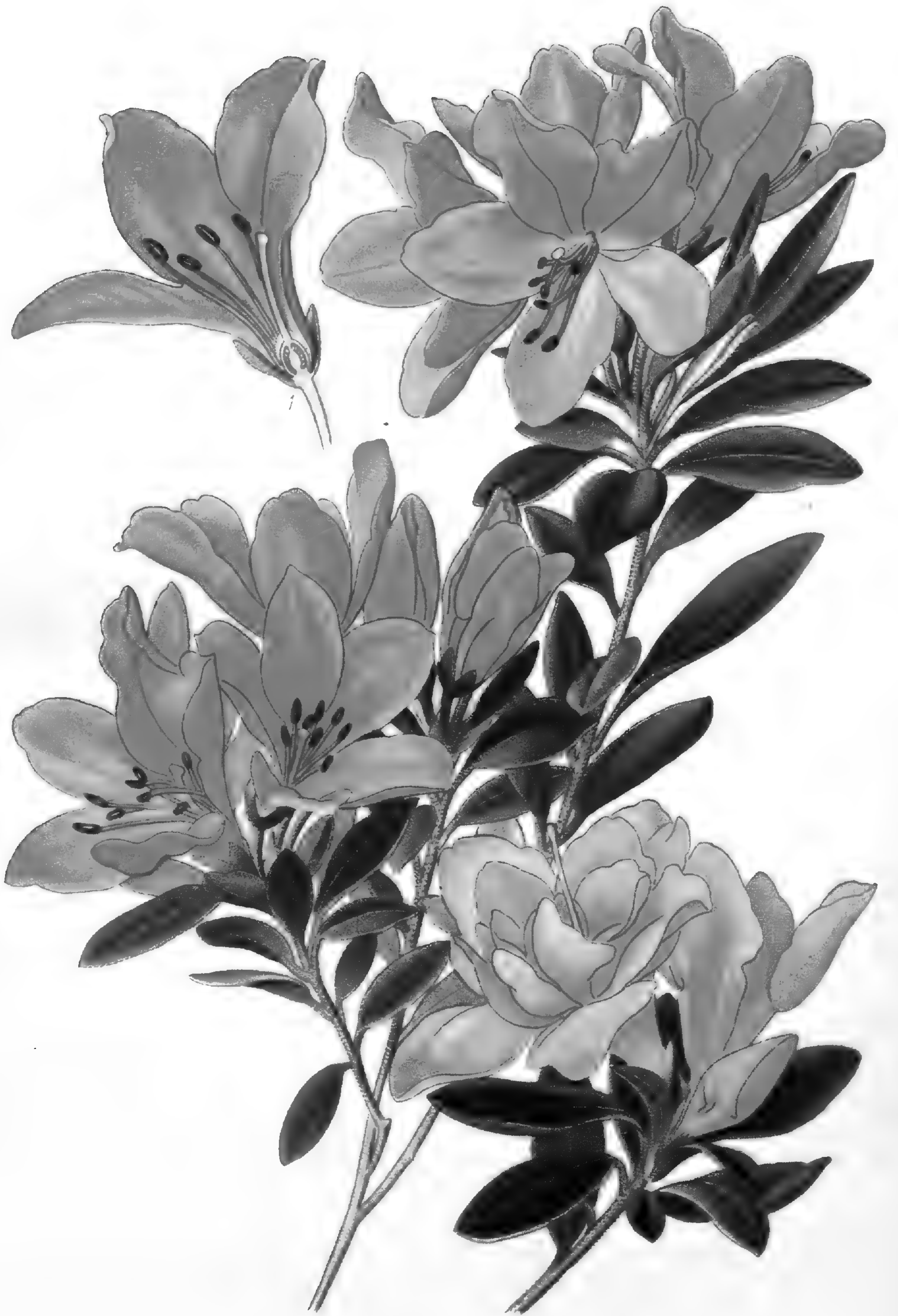
AZALEA (AZALEA INDICA)