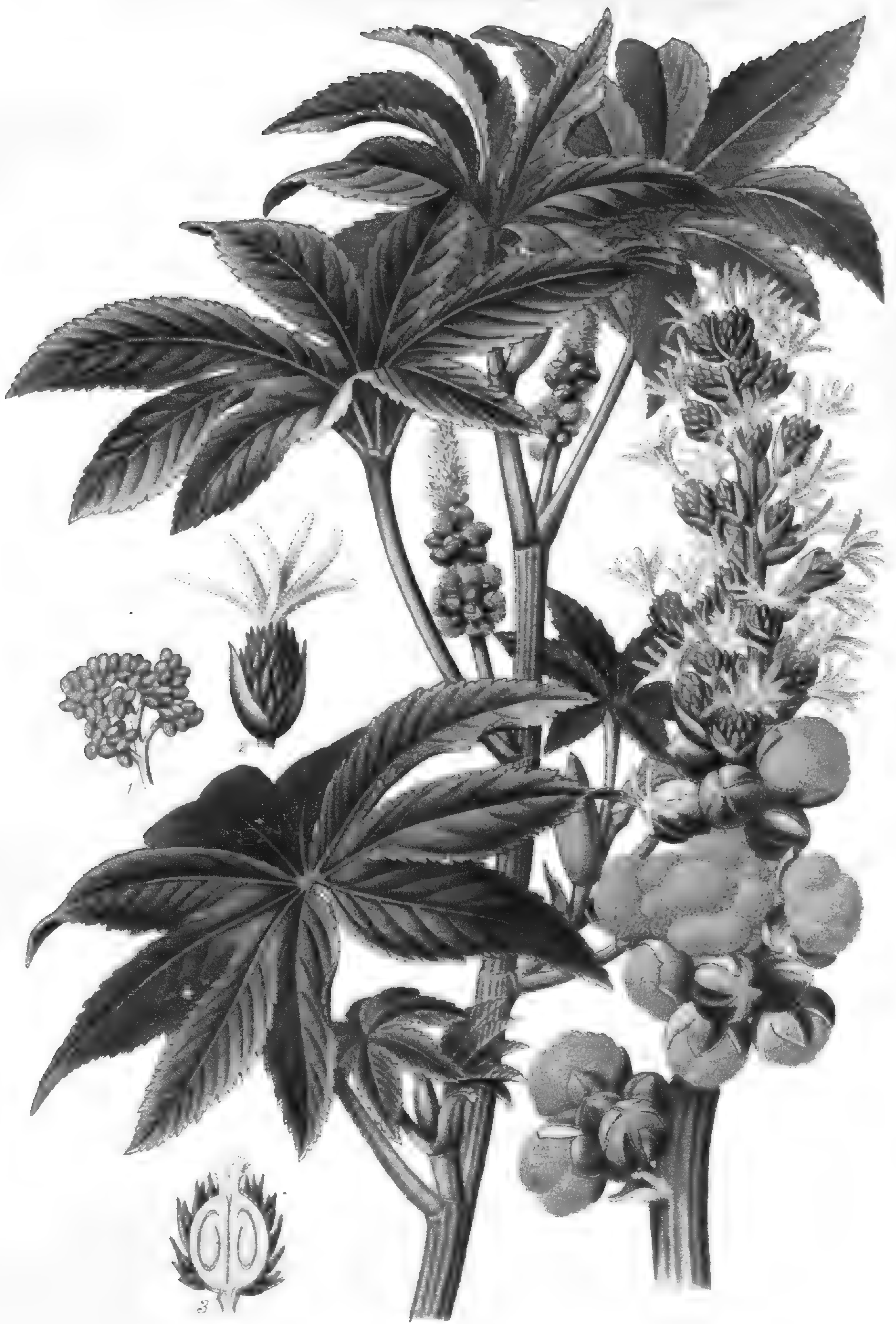
CASTOR-OIL PLANT ( RICINUS COMMUNIS )