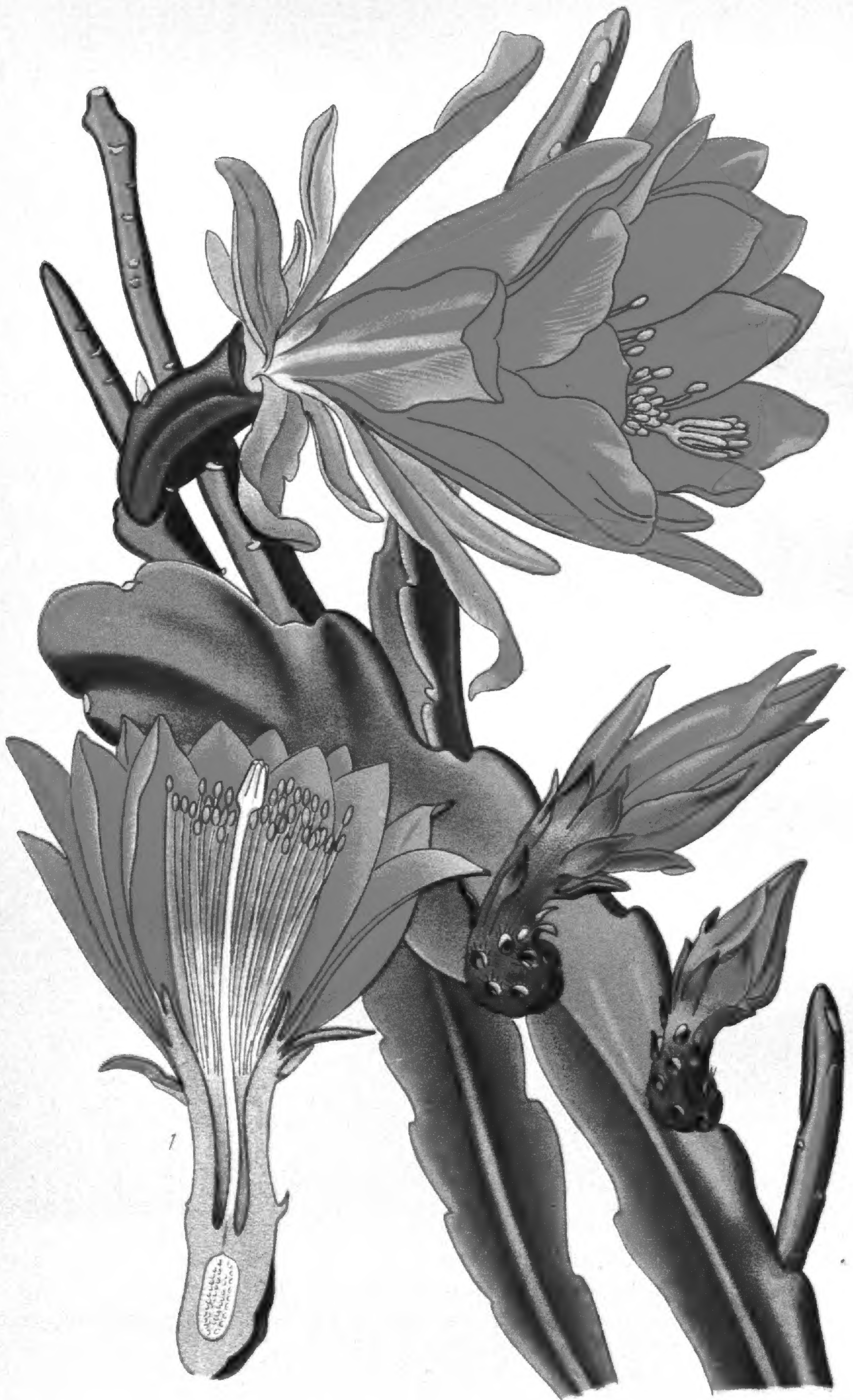
LEAF-STEMMED CACTUS ( PHYLLOCACTUS PHYLLANTHOIDES )