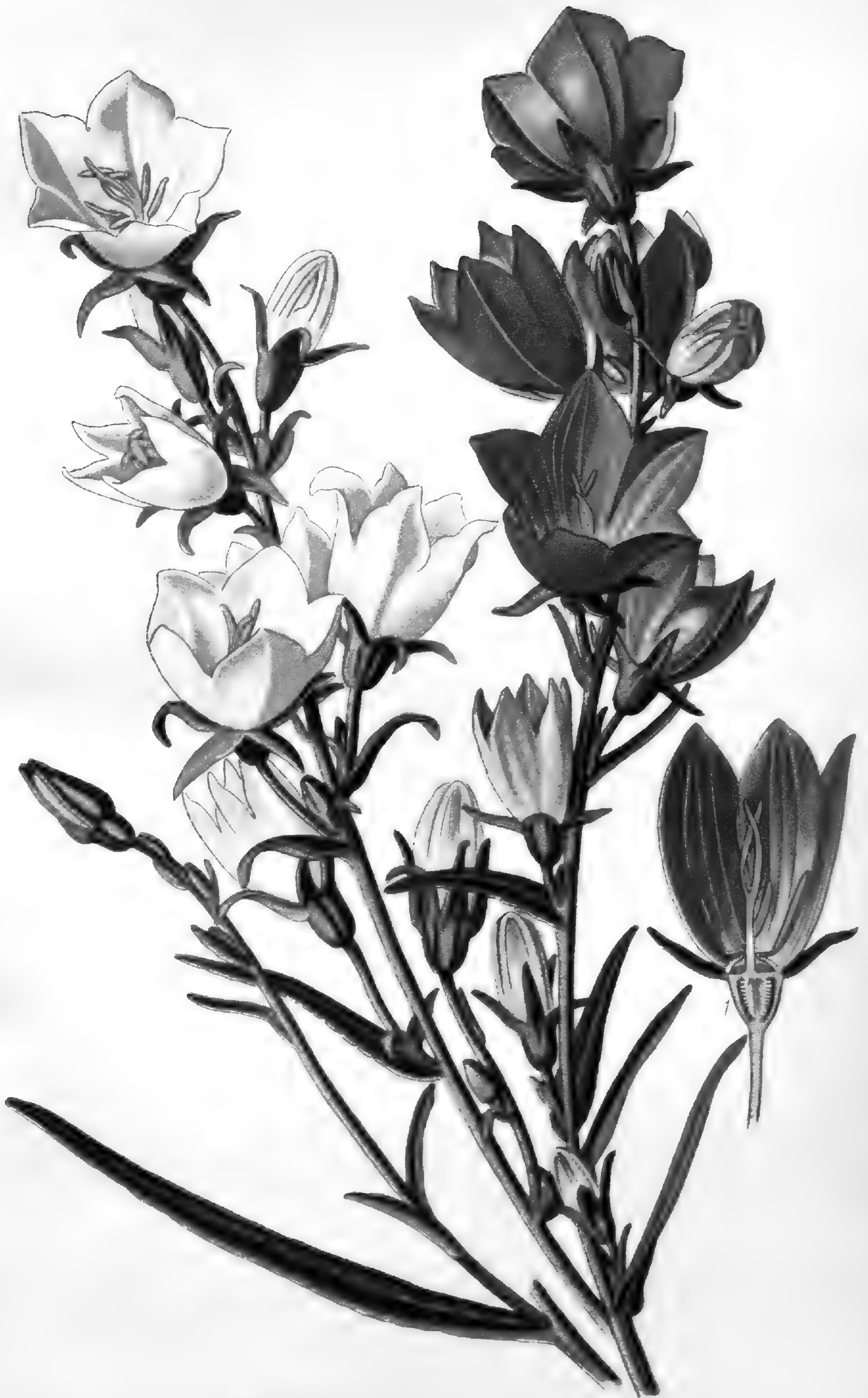
PEACH-LEAVED BELL-FLOWER ( CAMPANULA PERSICIFOLIA )