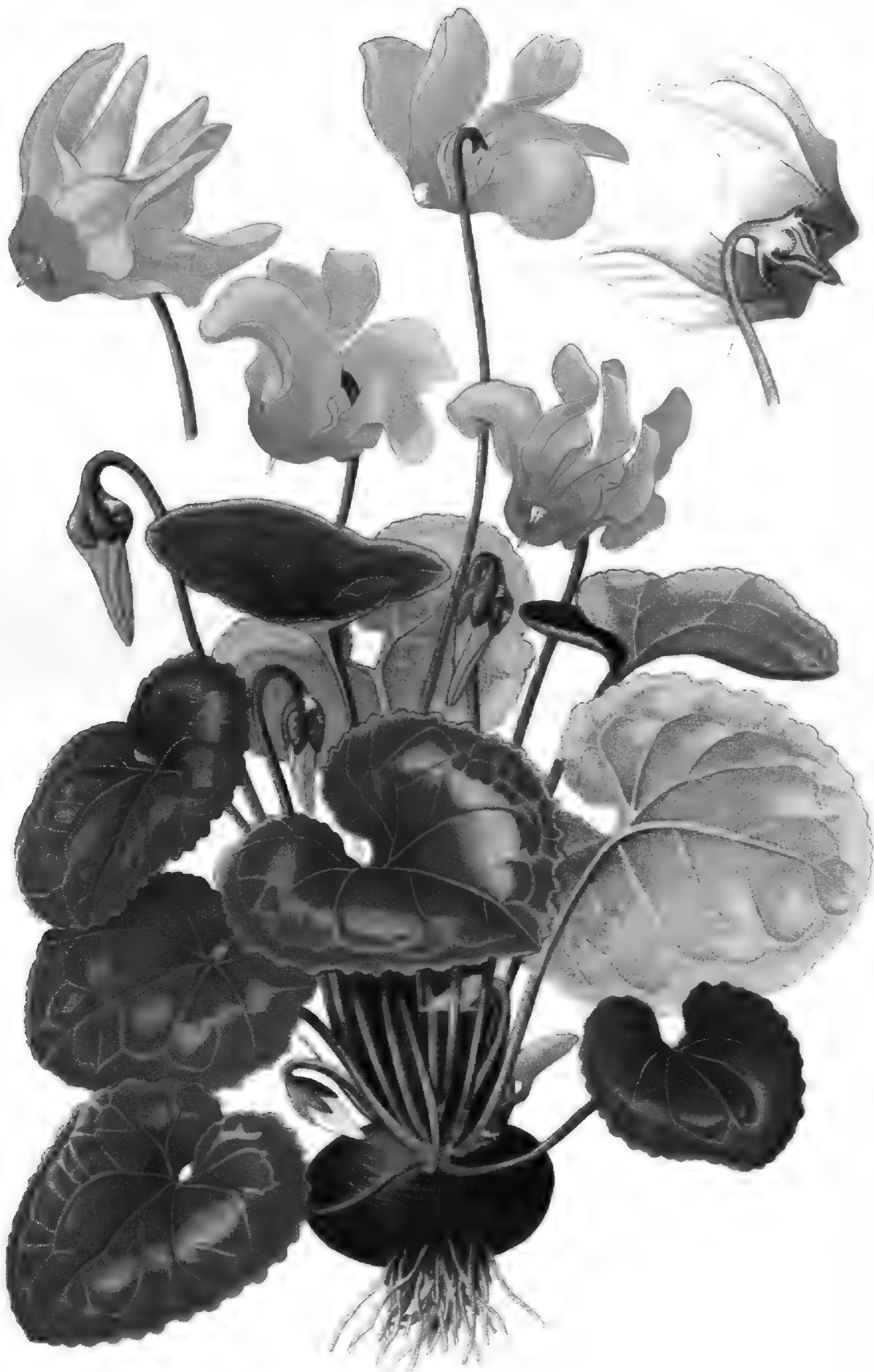
PERSIAN CYCLAMEN (CYCLAMEN PERSICUM)