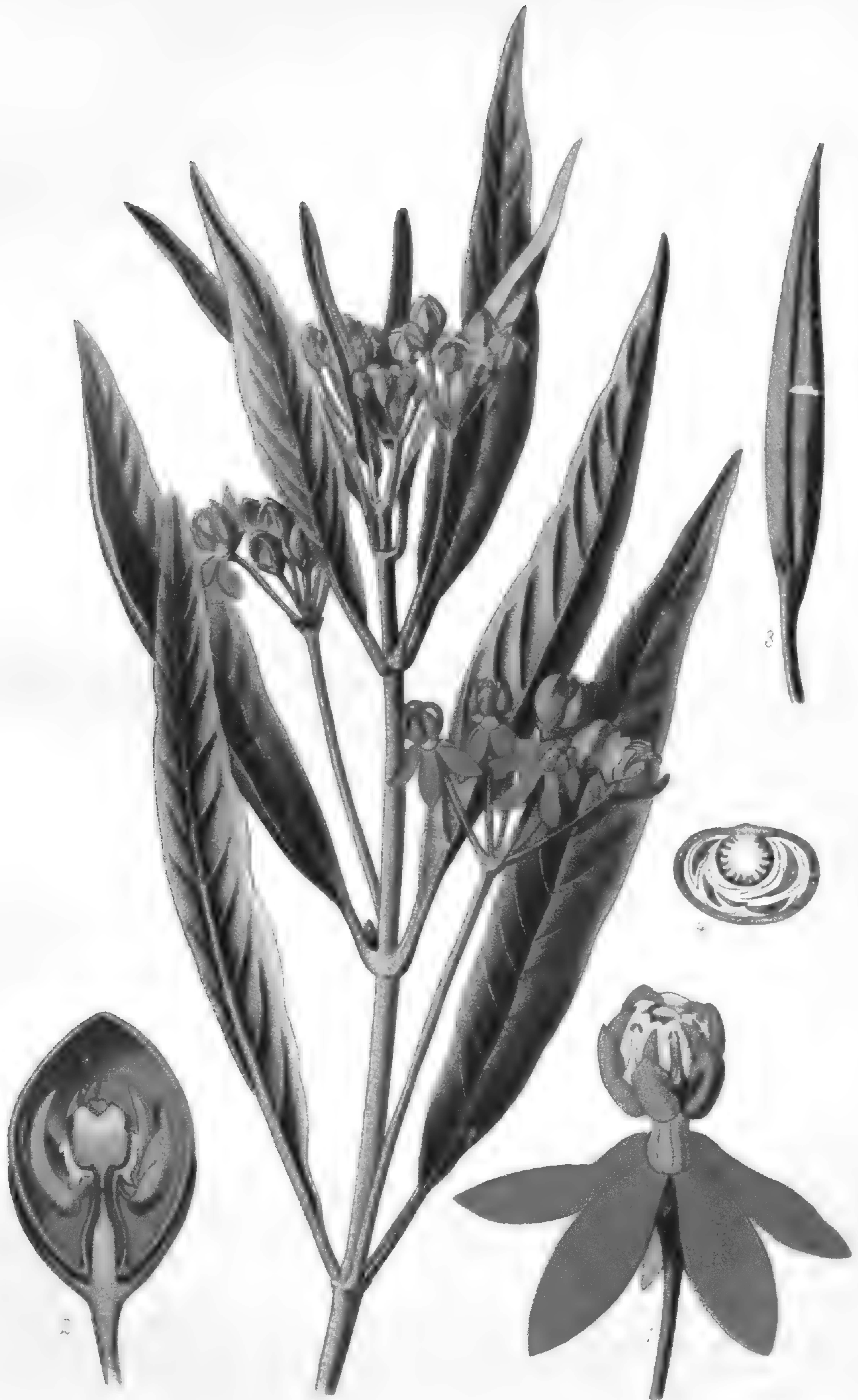
REDHEAD (ASCLEPIAS CURASSAVICA)