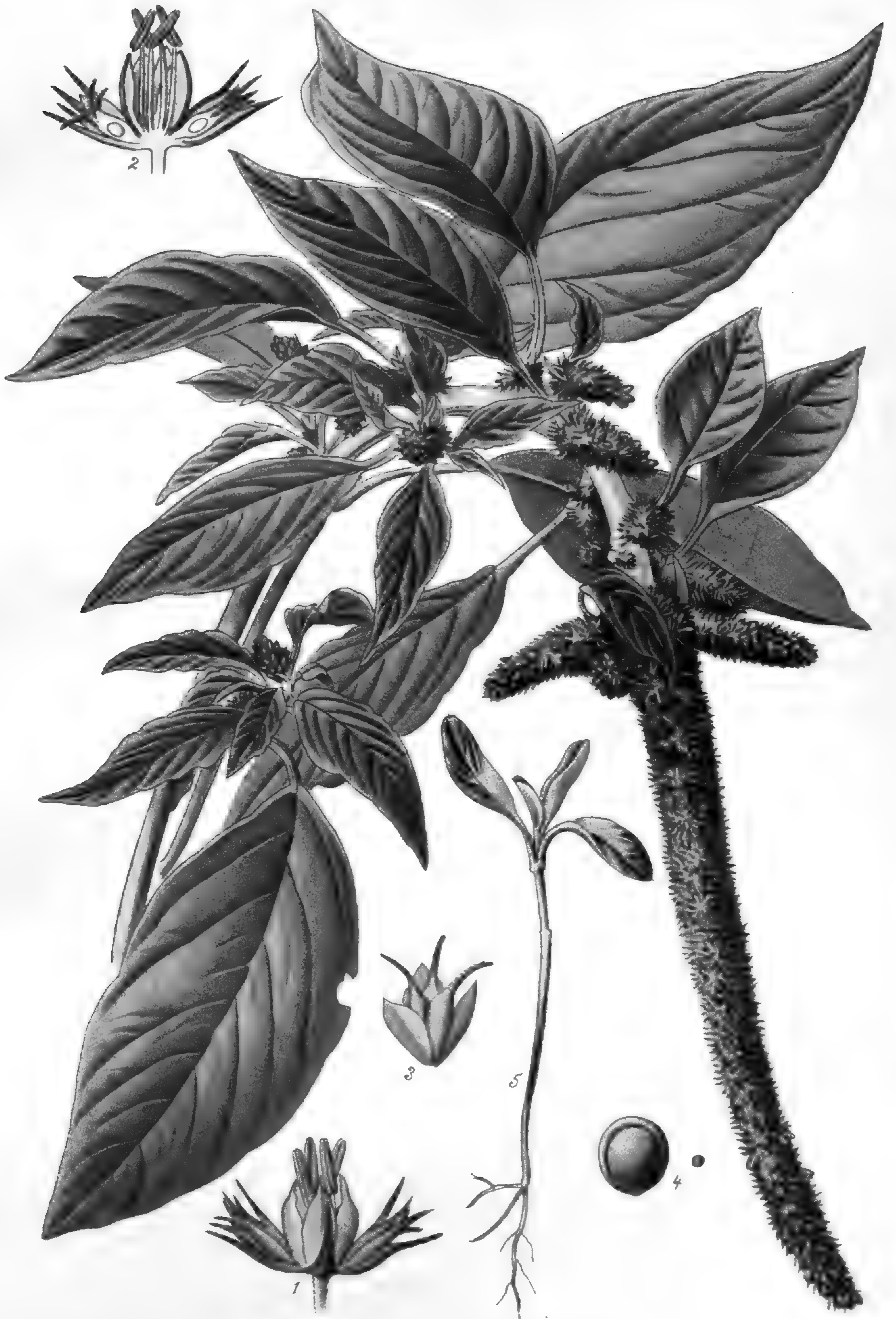
LOVE-LIES-BLEEDING (AMARANTUS CAUDATUS)