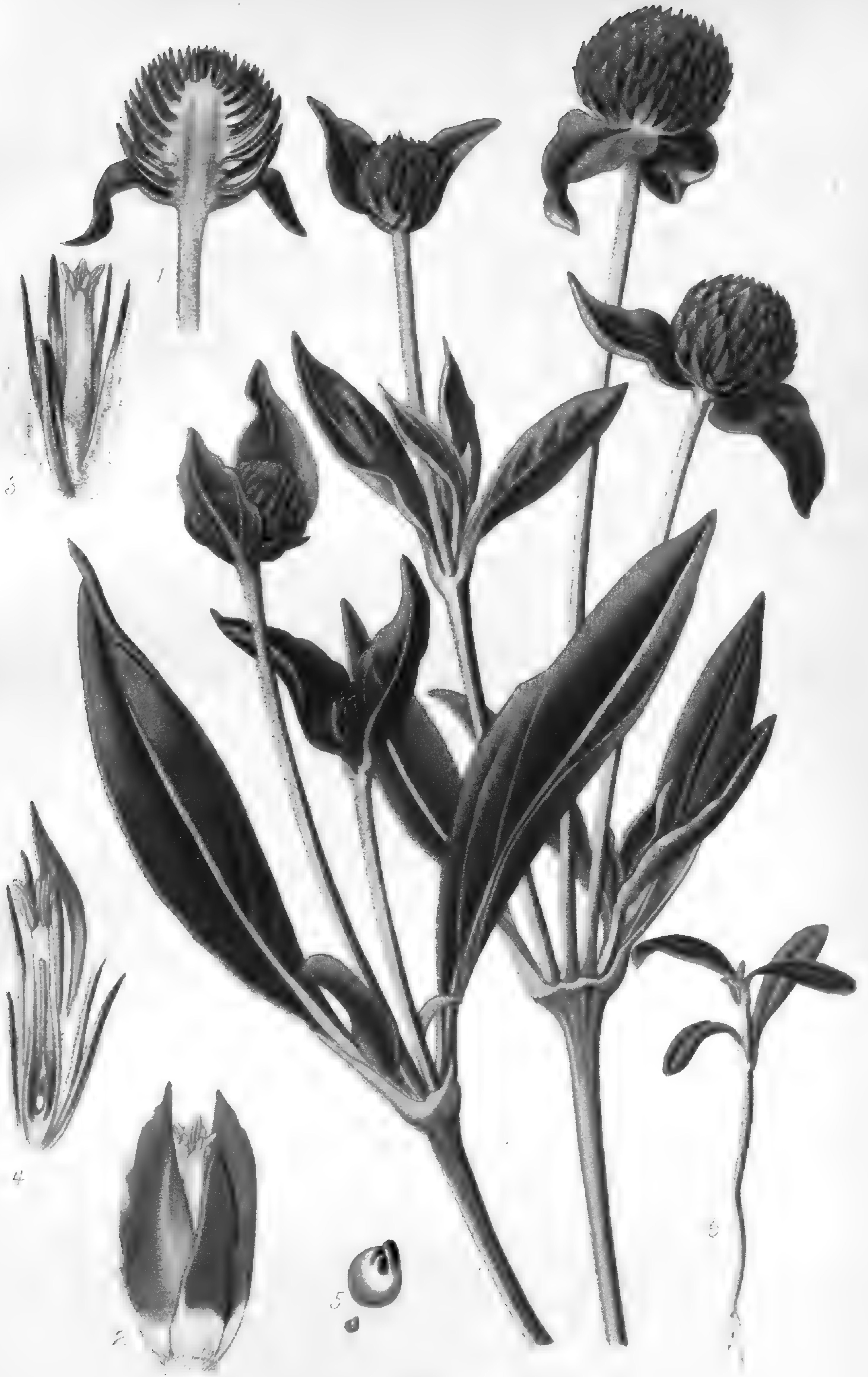
GLOBE AMARANTH (GOMPHRENA GLOBOSA)