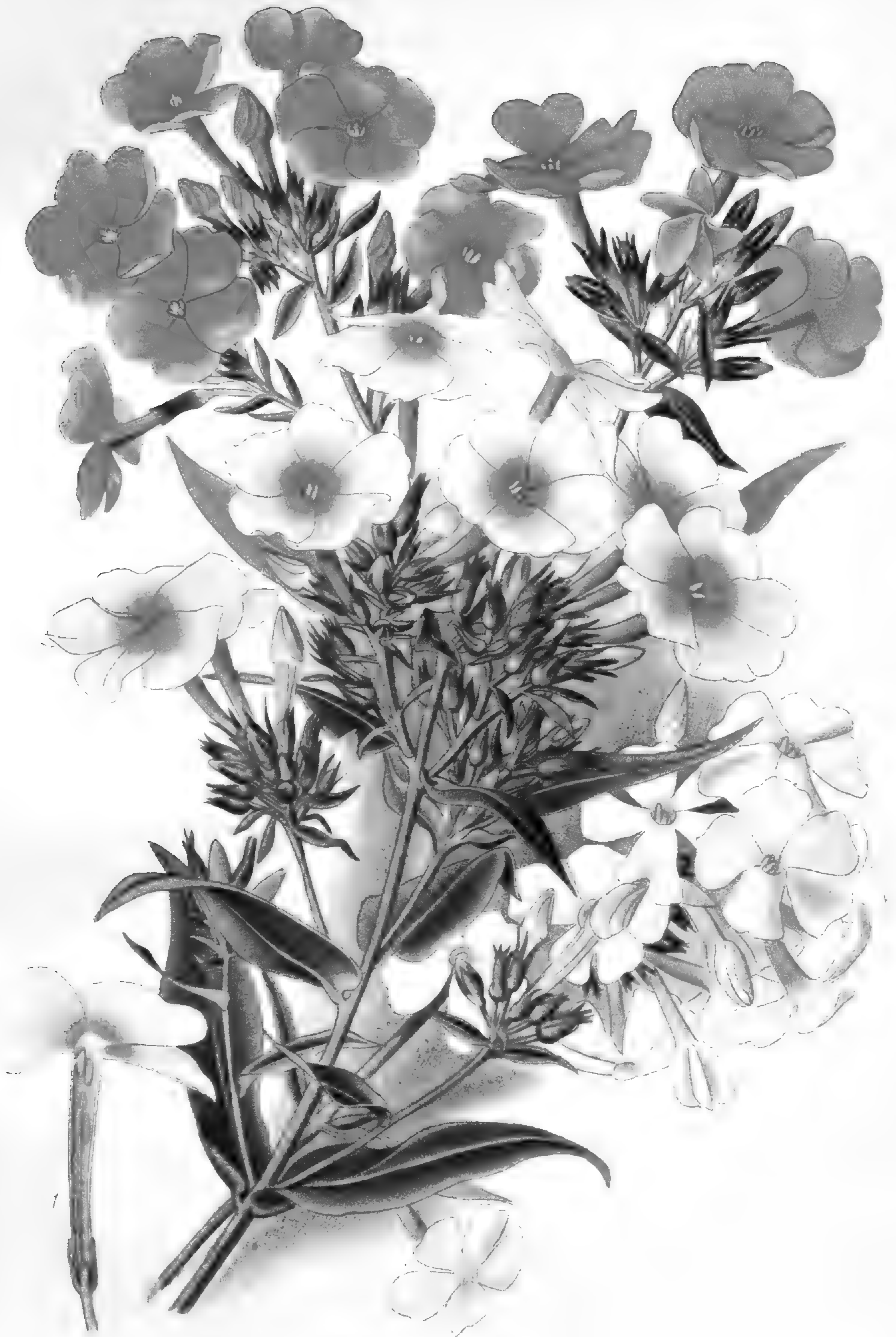
PERENNIAL PHLOX (PHLOX PANICULATA, var. )