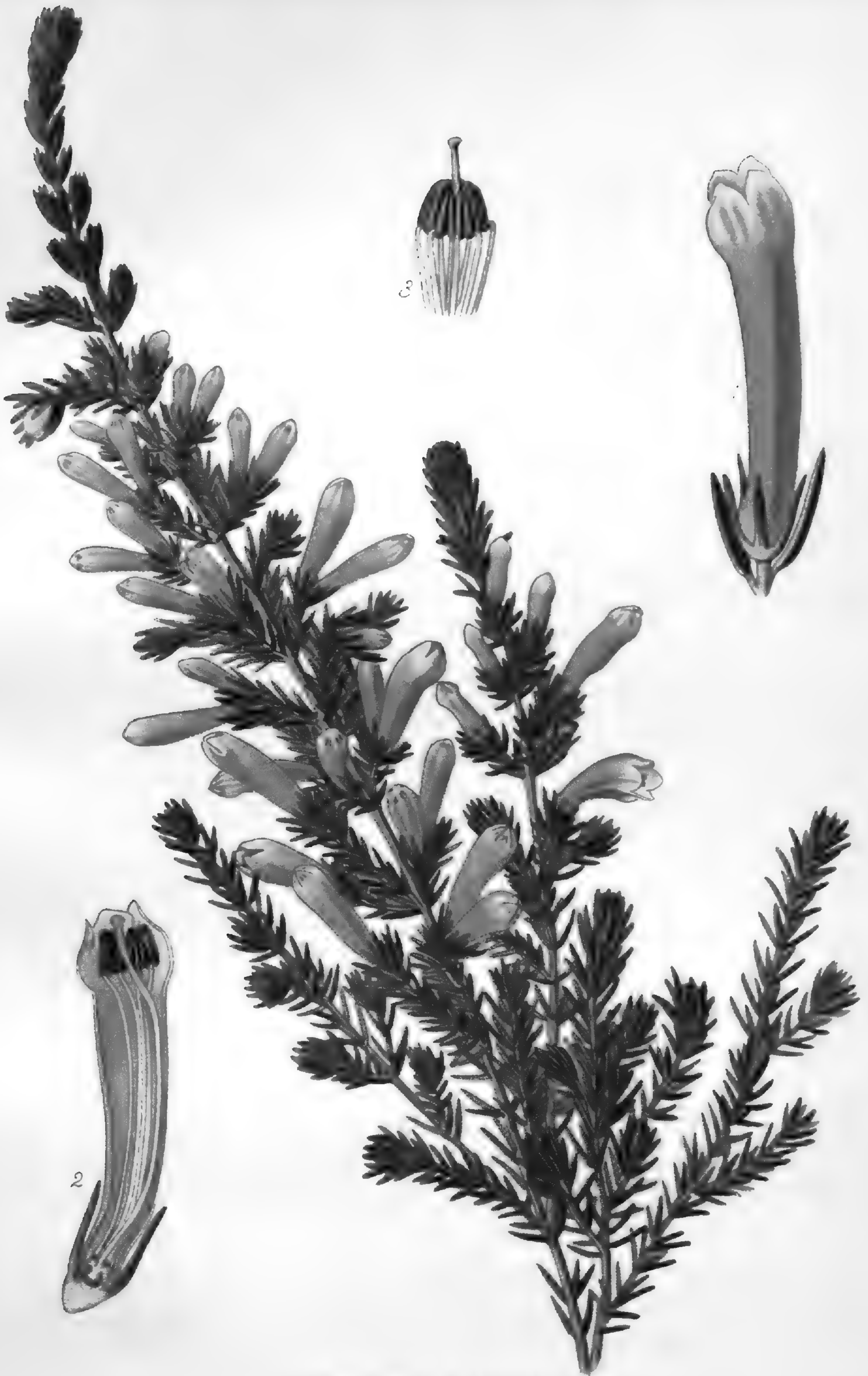
WILMORE'S HEATH ( ERICA WILMOREANA )