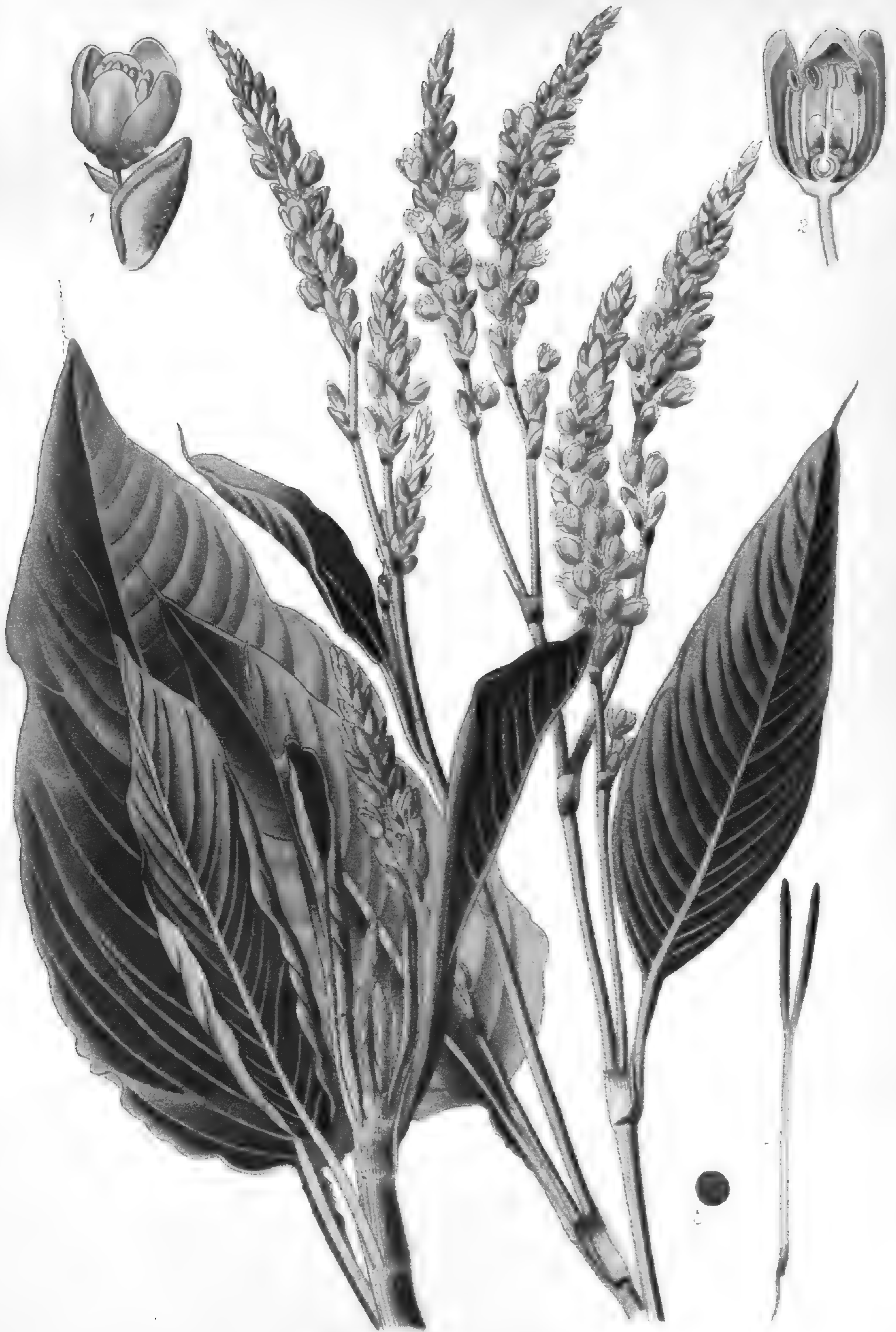
EASTERN KNOTWEED (POLYGONUM ORIENTALE)