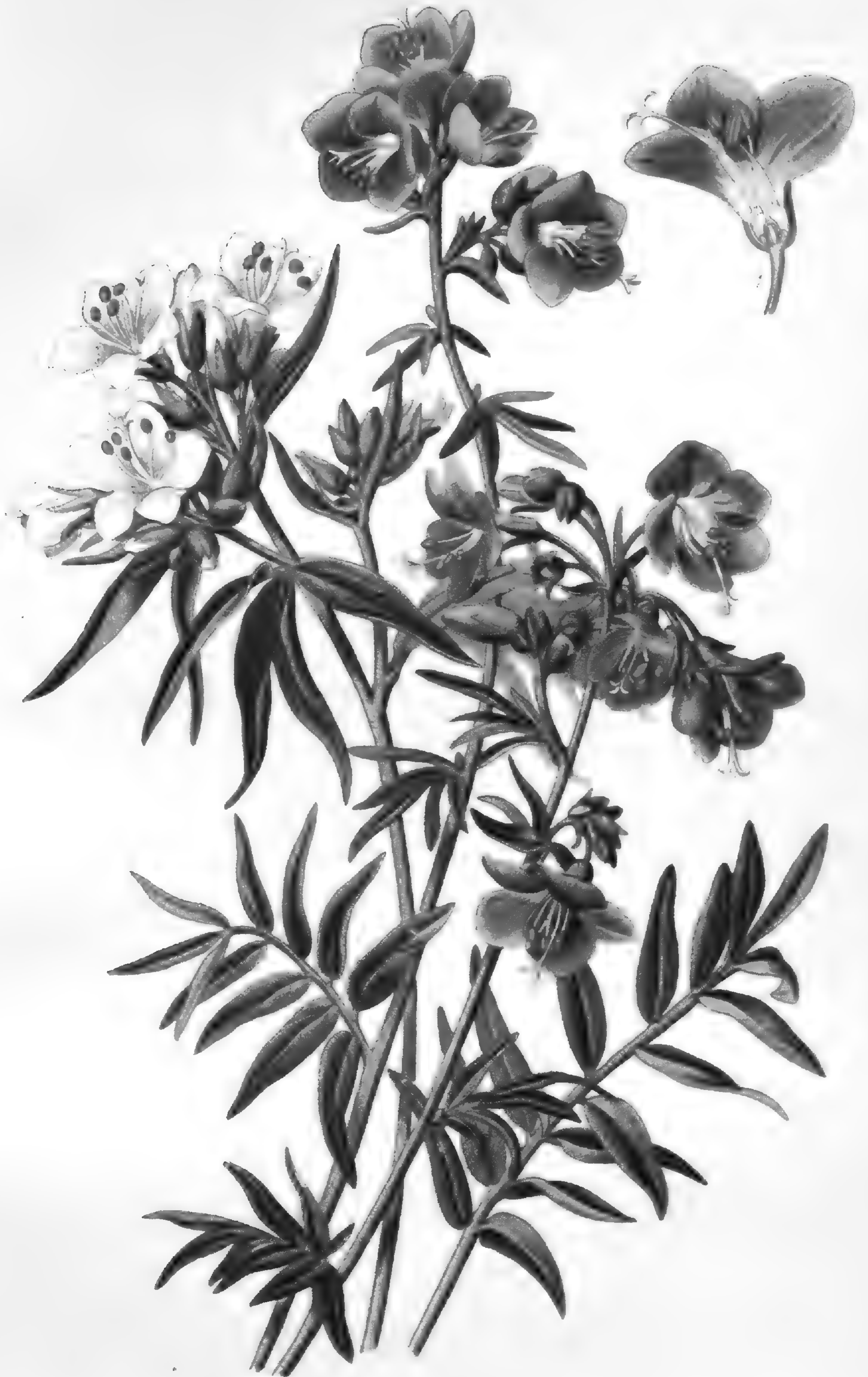
JACOB'S LADDER (POLEMONIUM CÆRULEUM)