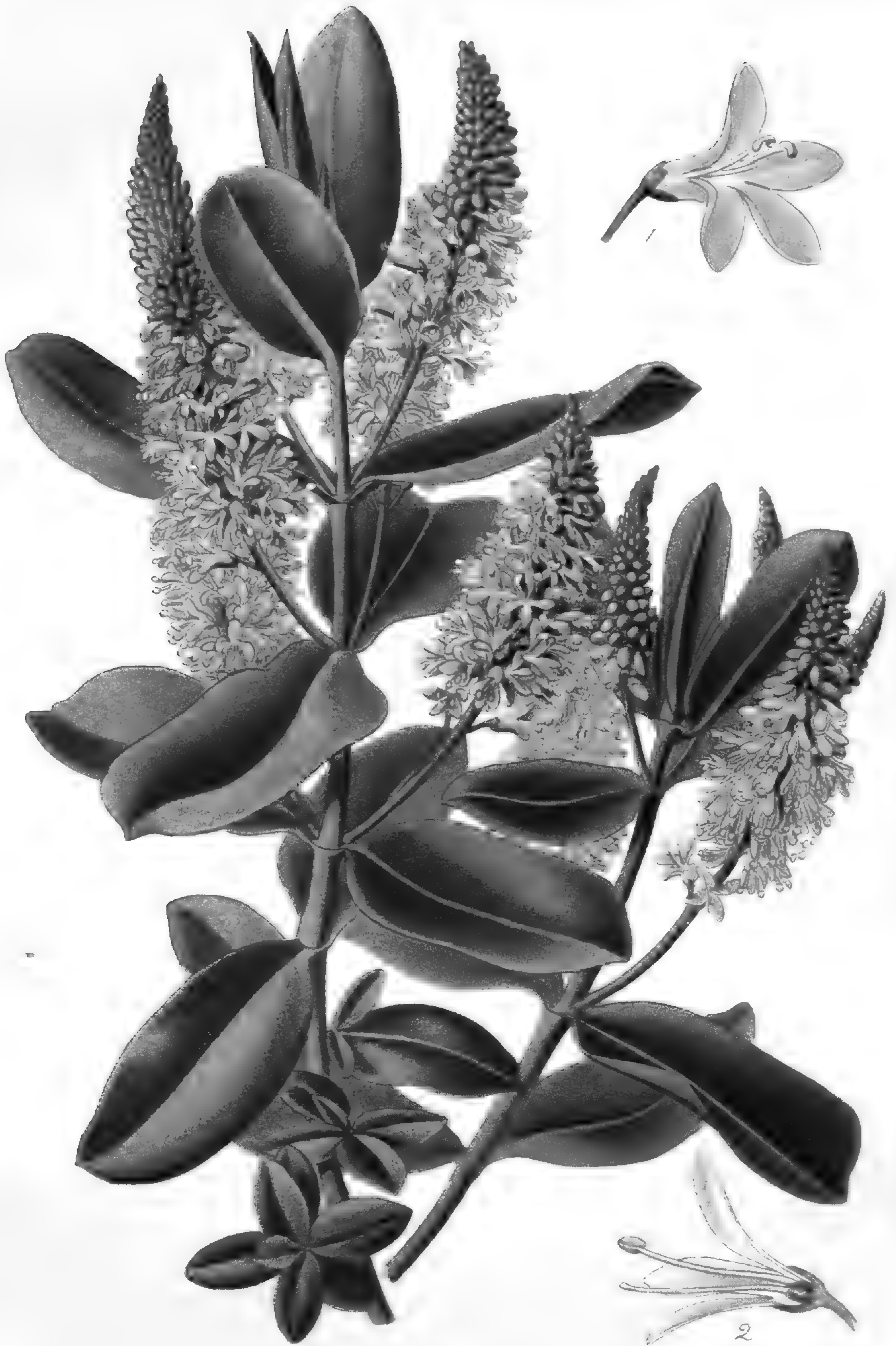
SHRUBBY SPEEDWELL ( VERONICA SPECIOSA )