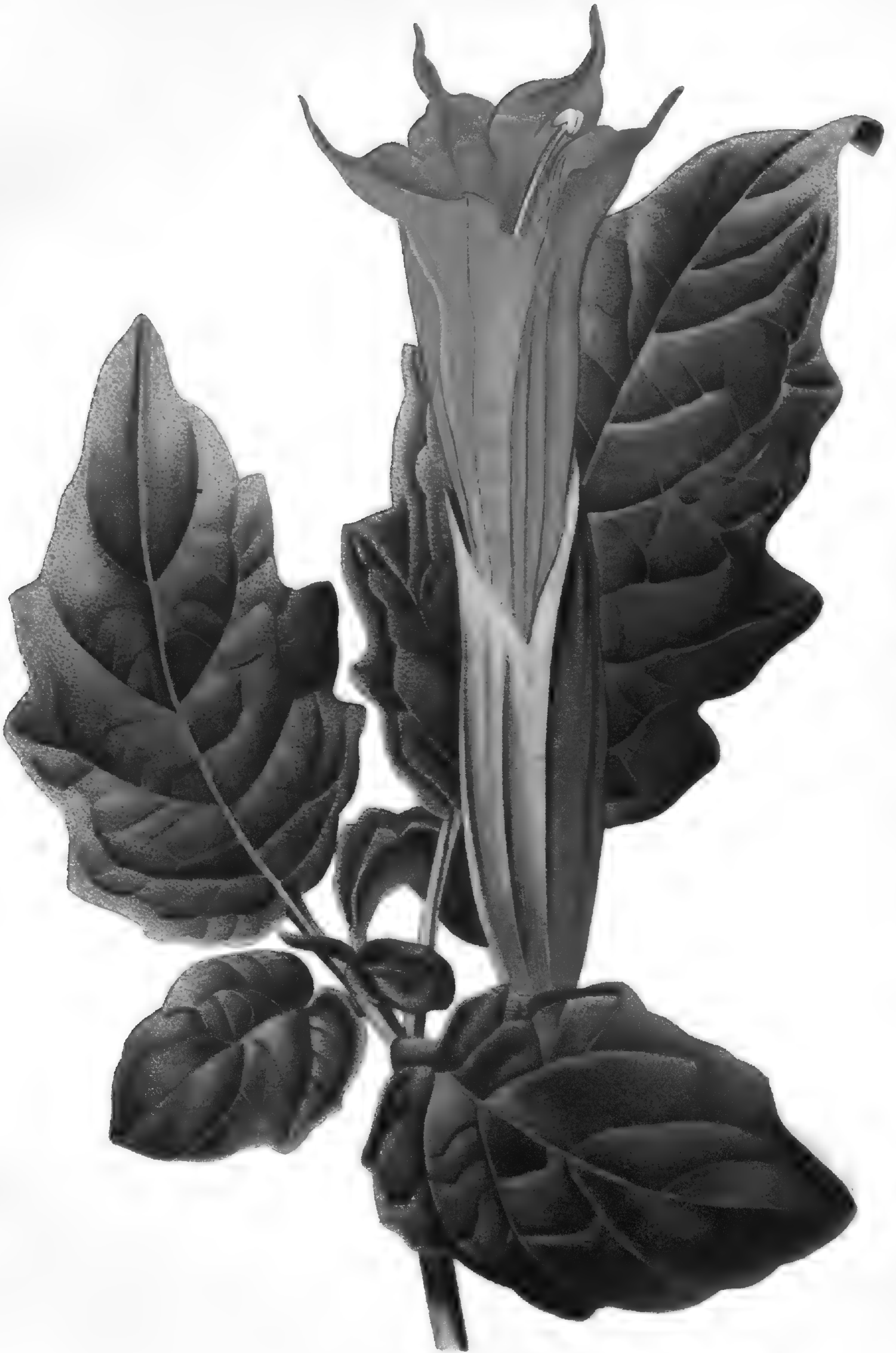
D ATURA SANGUINEA