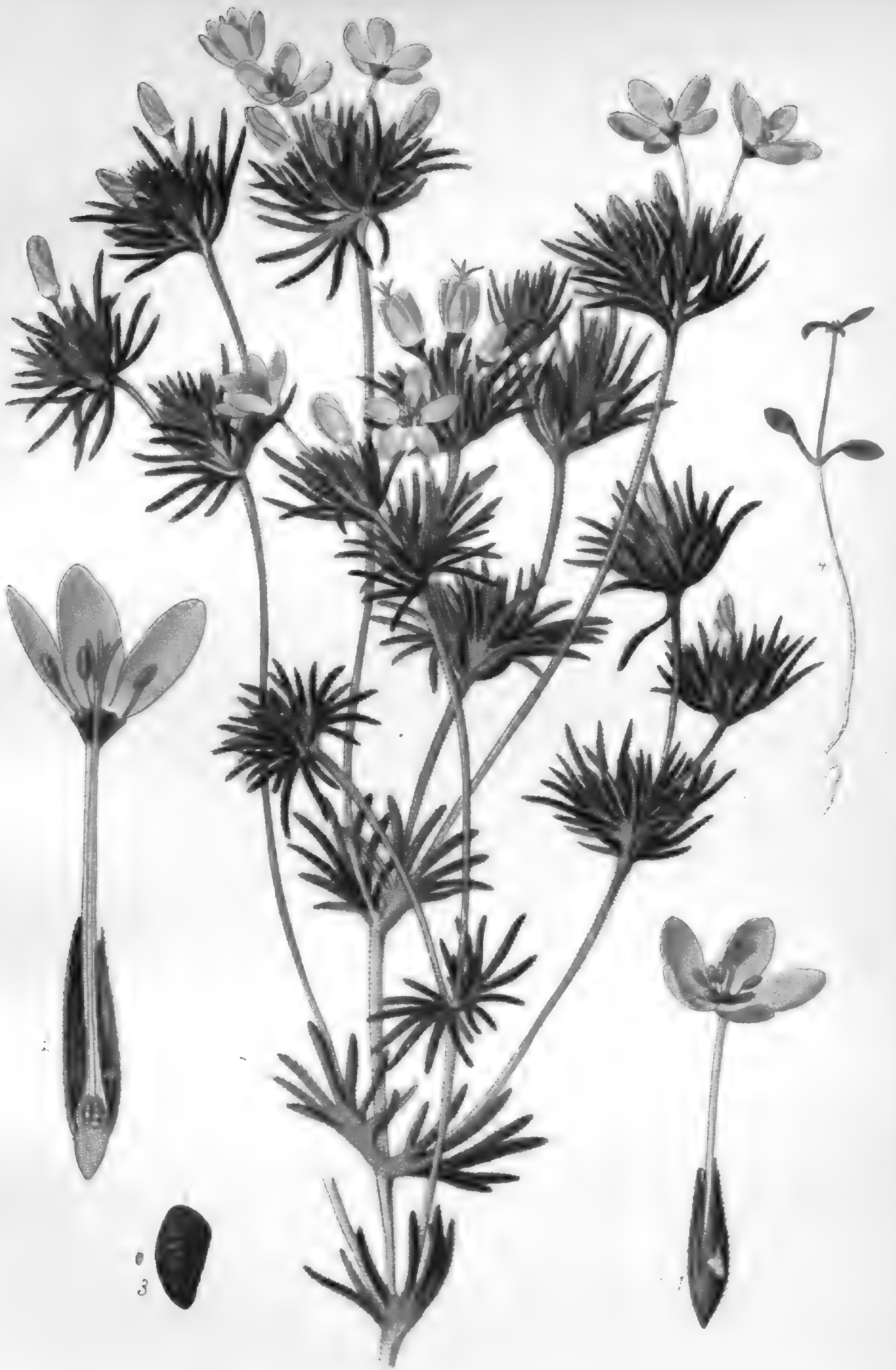
GILIA (LEPTOSIPHON) ANDROSACEA