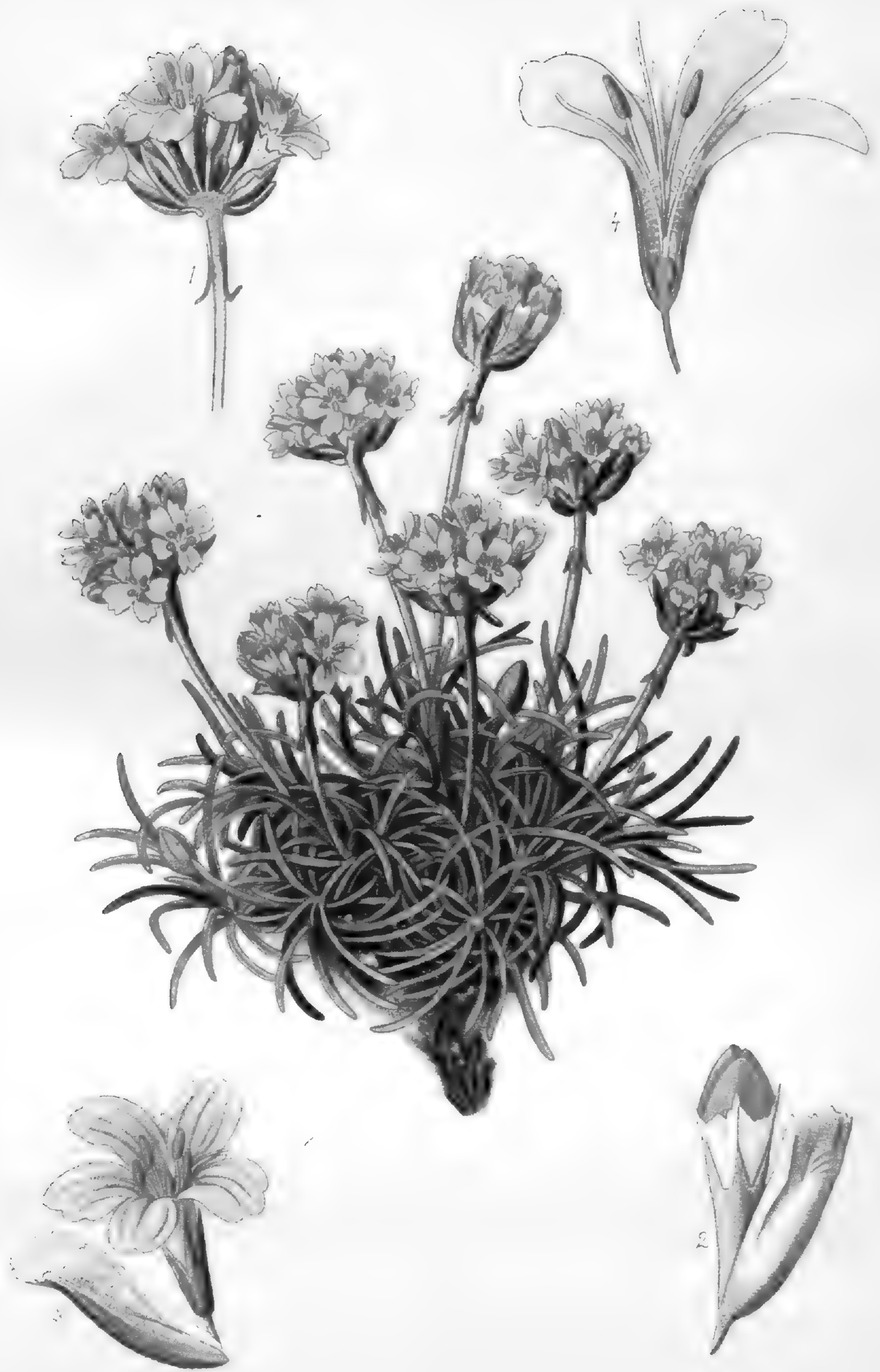
THRIFT OR SEA-PINK ( ARMERIA MARITIMA )