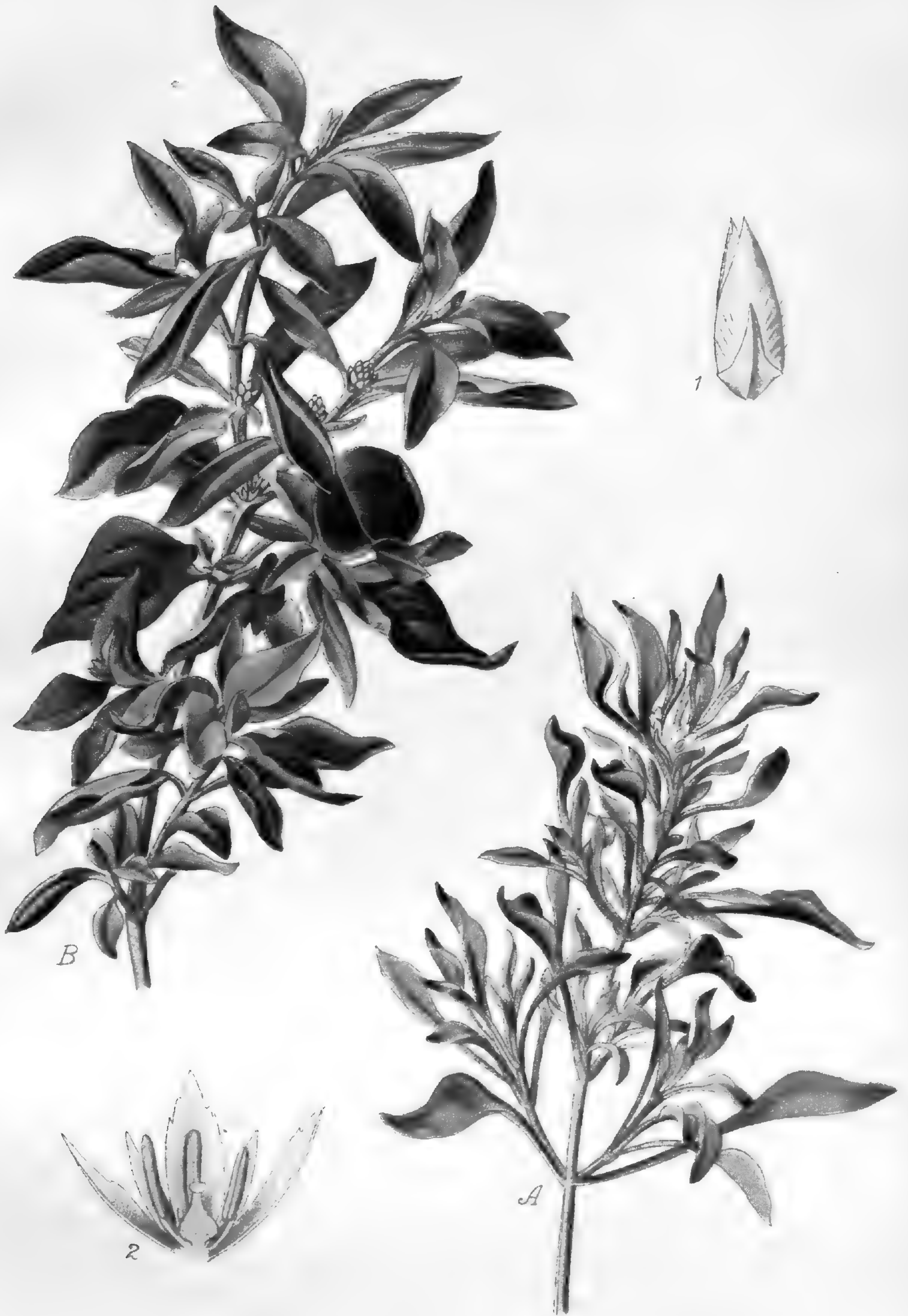
(A) TELANTHERA AMÆNA