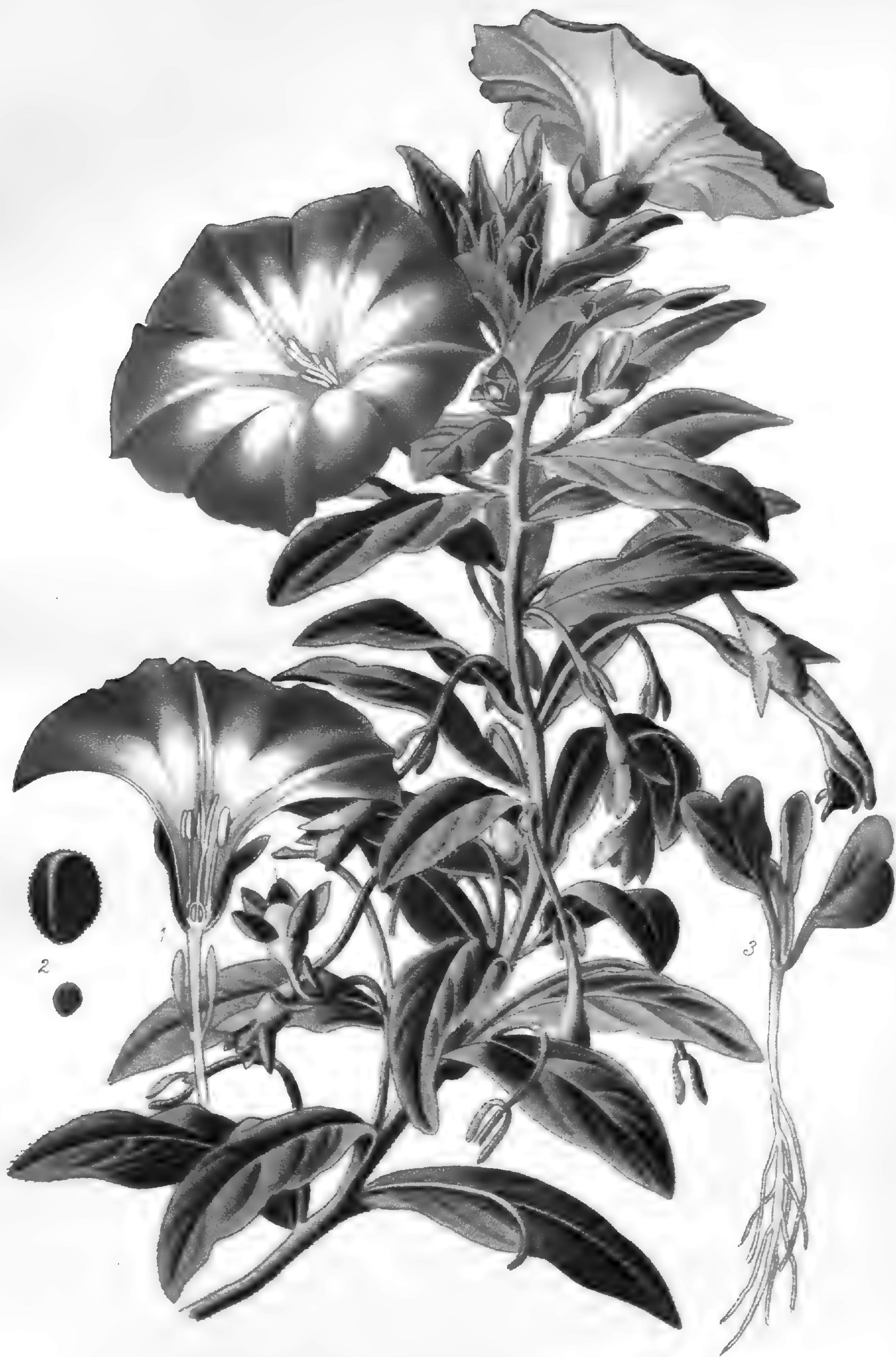
MINOR CONVULVULUS (CONVOLVULUS TRICOLOR)