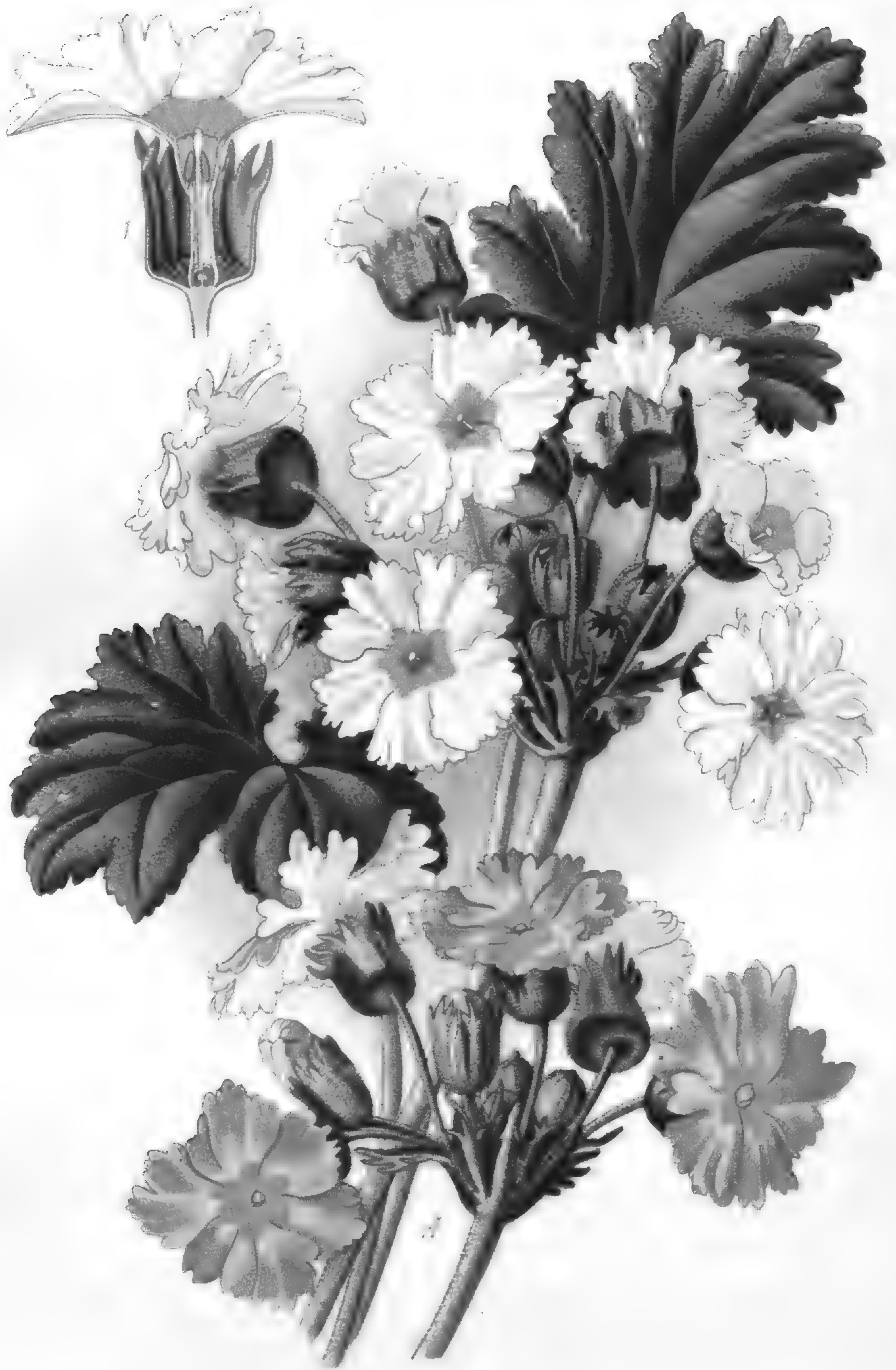
CHINESE PRIMROSE (PRIMULA SINENSIS)