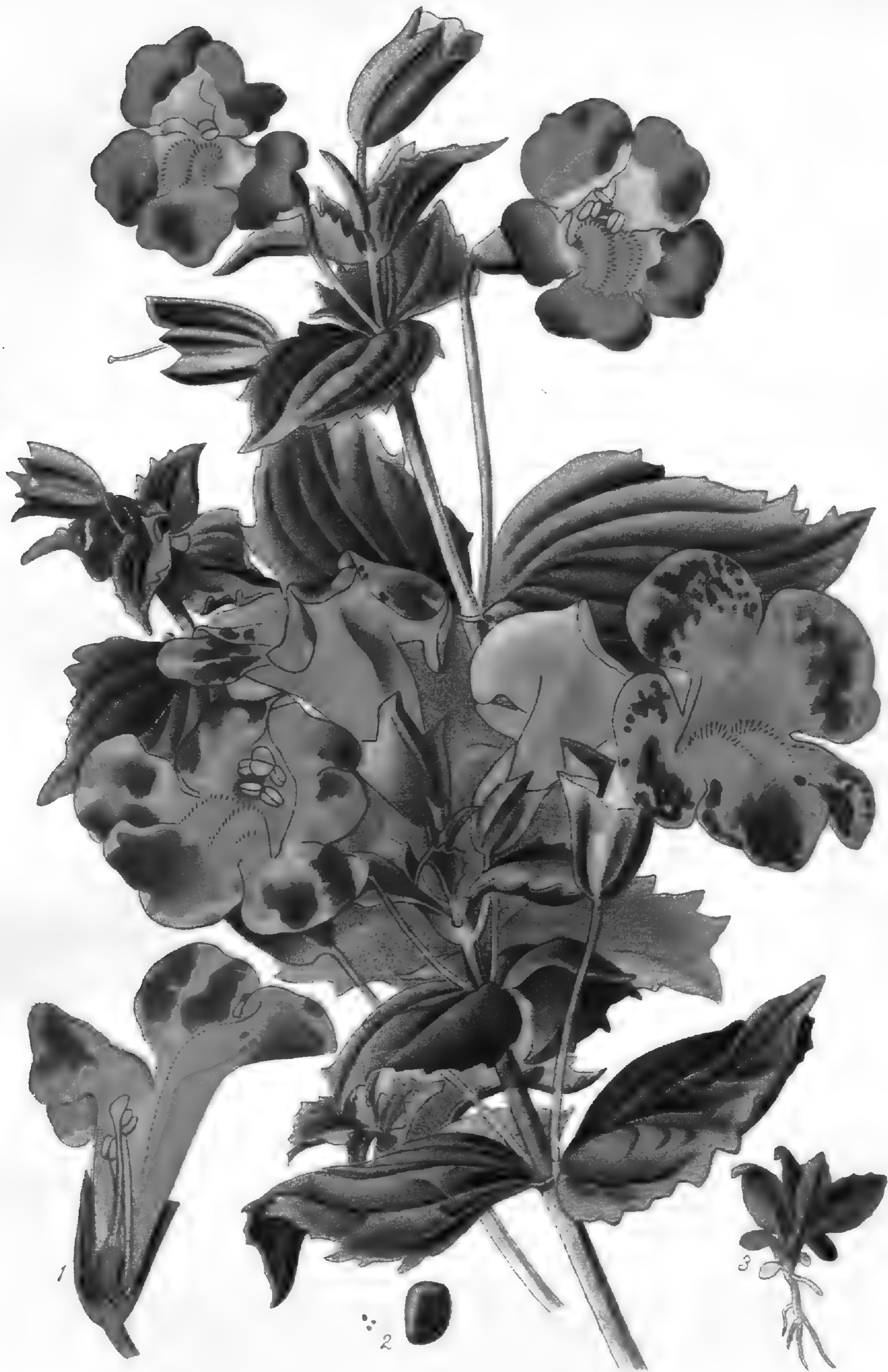
HARLEQUIN MONKEY FLOWER ( MIMULUS LUTEUS VARIEGATUS )