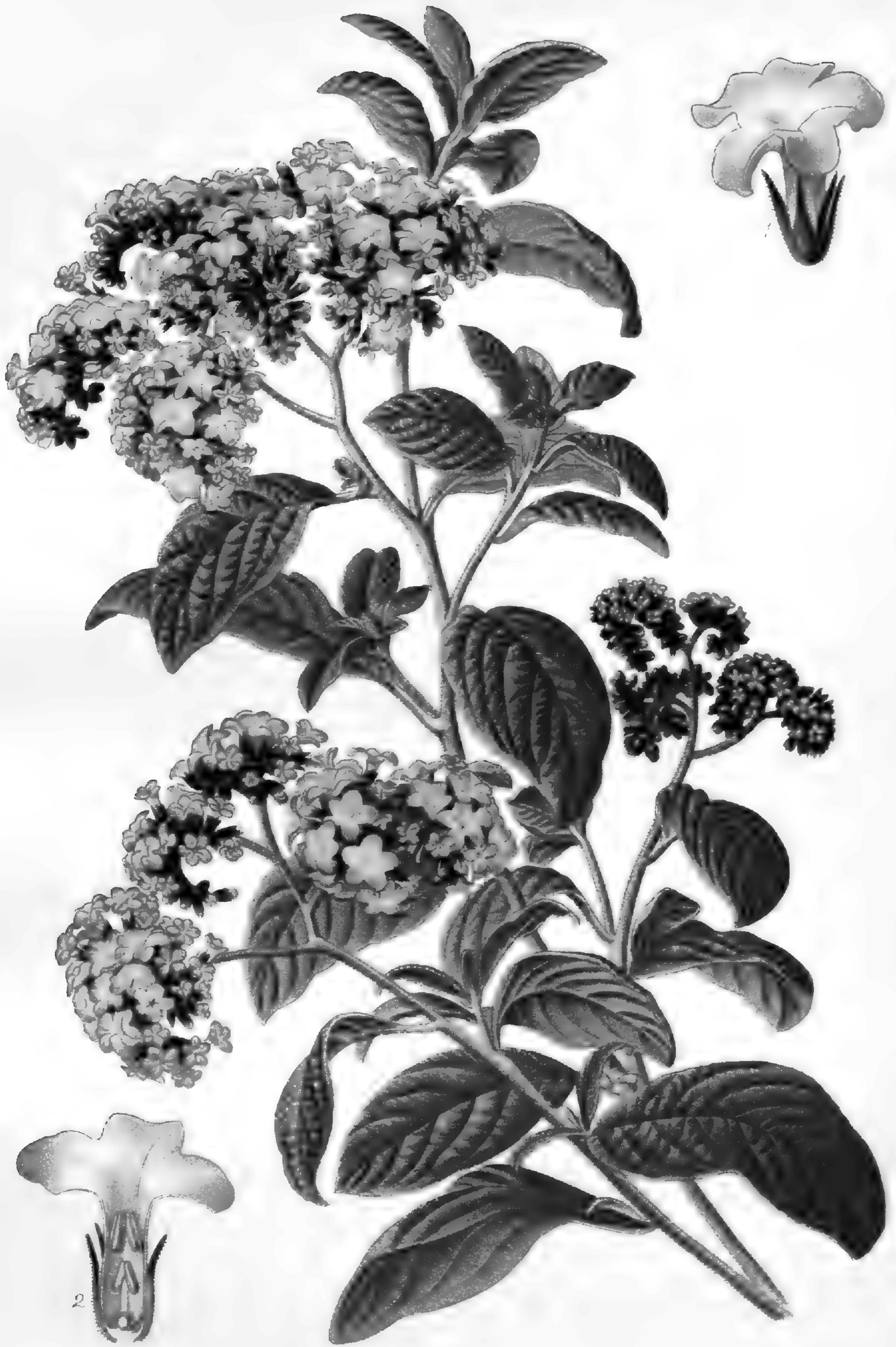
CHERRY PIE ( HELIOTROPIUM PERUVIANUM)