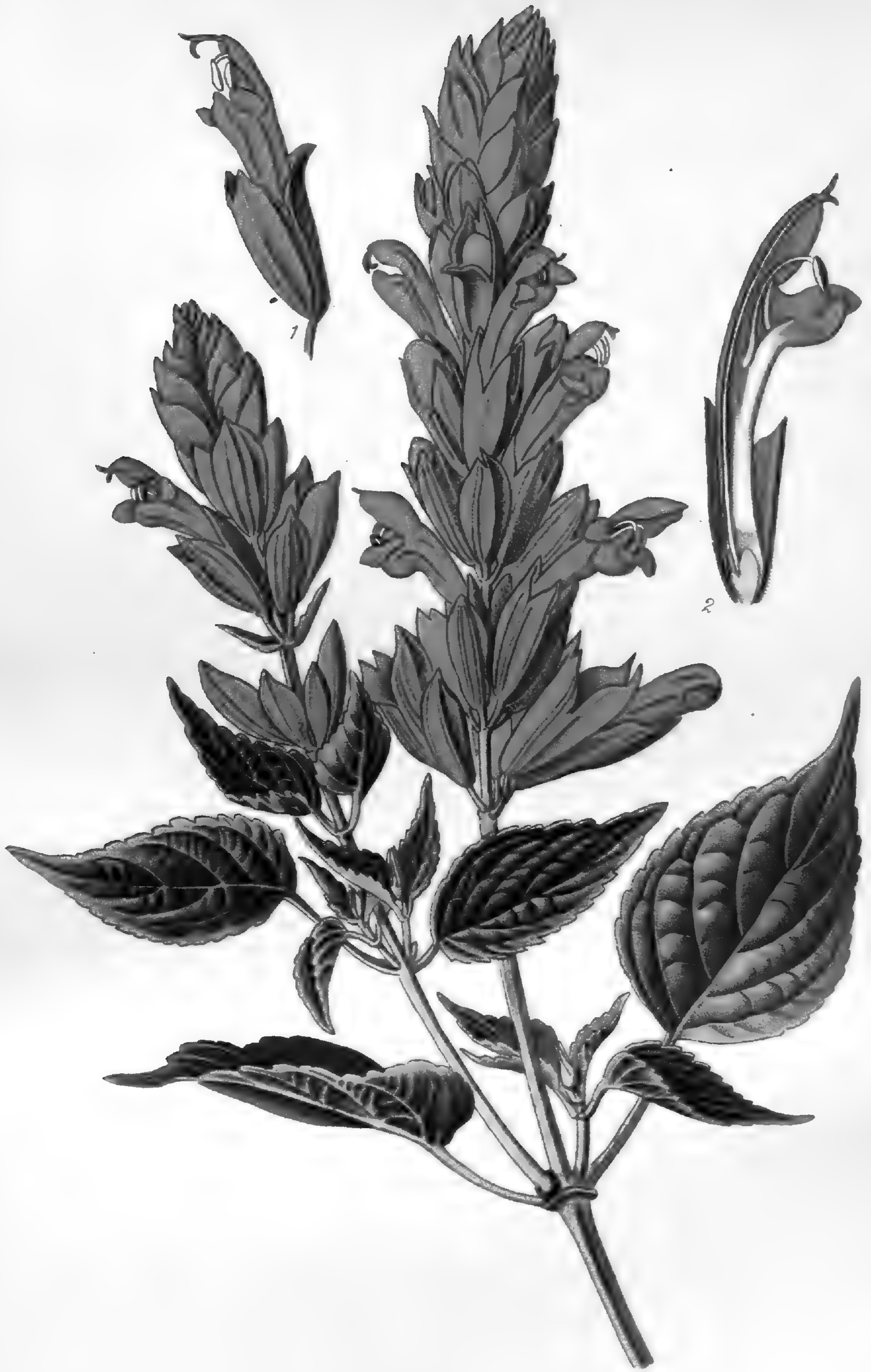
SCARLET SAGE ( SALVIA SPLENDENS )