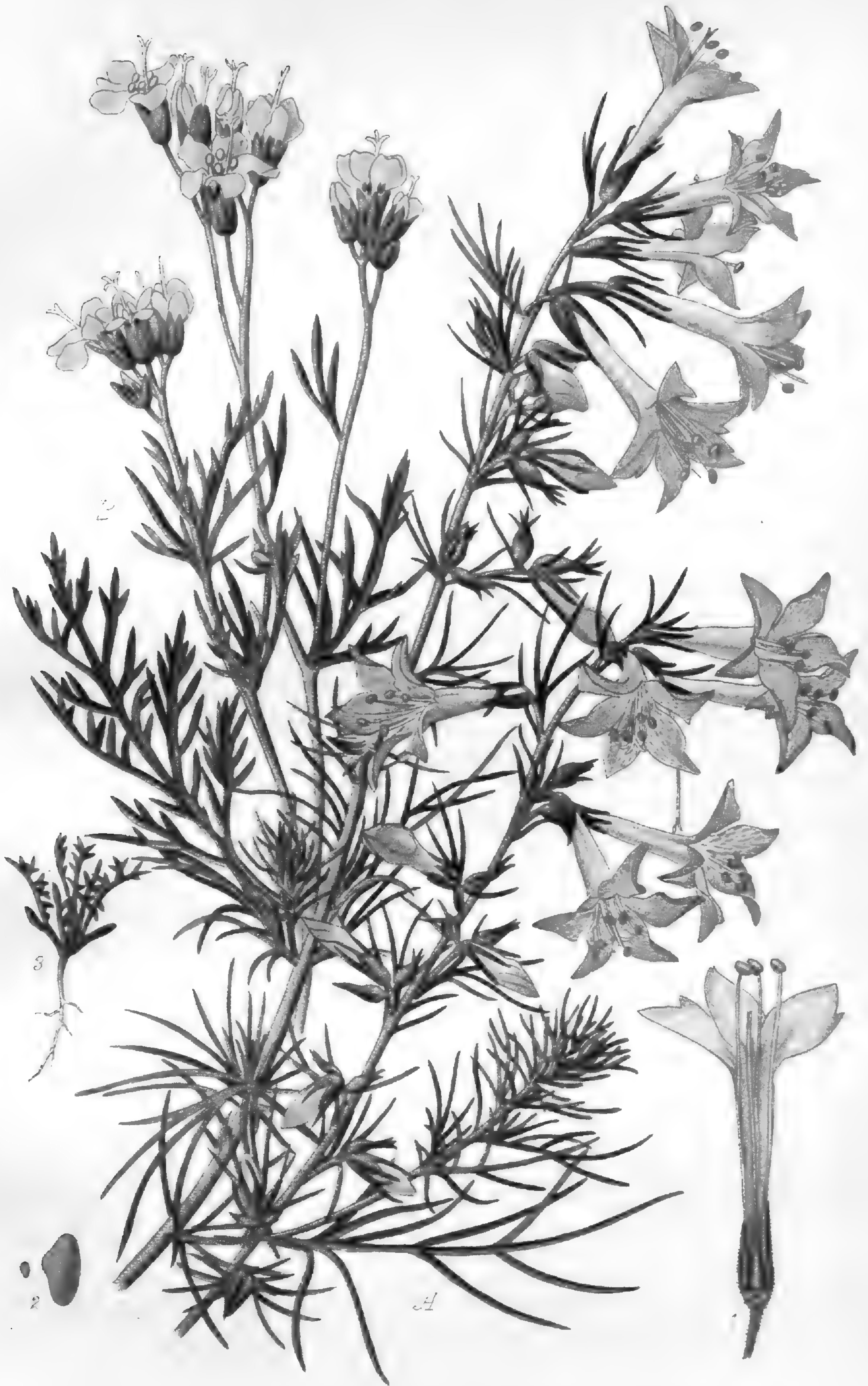
(A) GILIA CORONOPIFOLIA (B) GILIA TRICOLOR