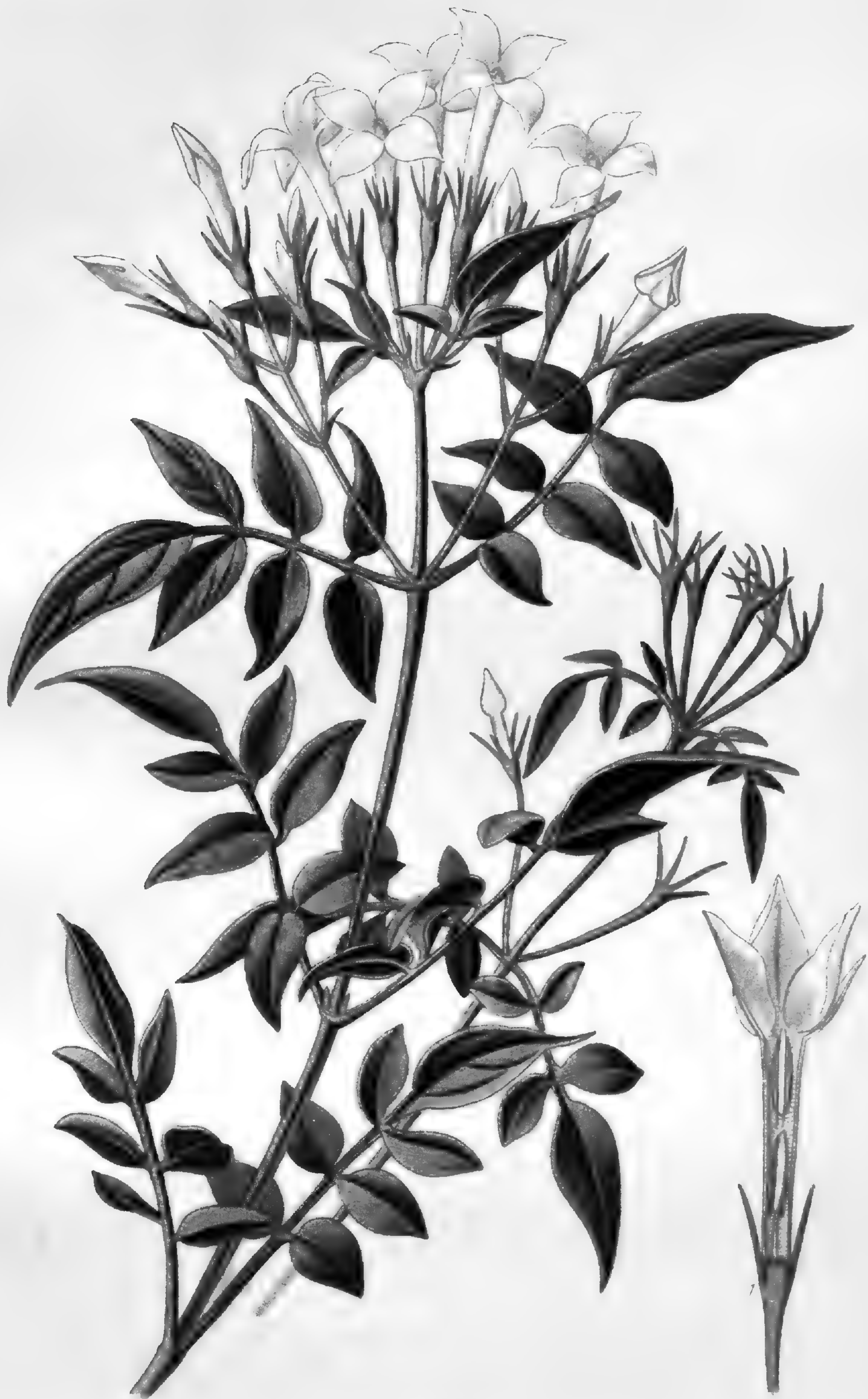
JASMINE (JASMINUM OFFICINALE)