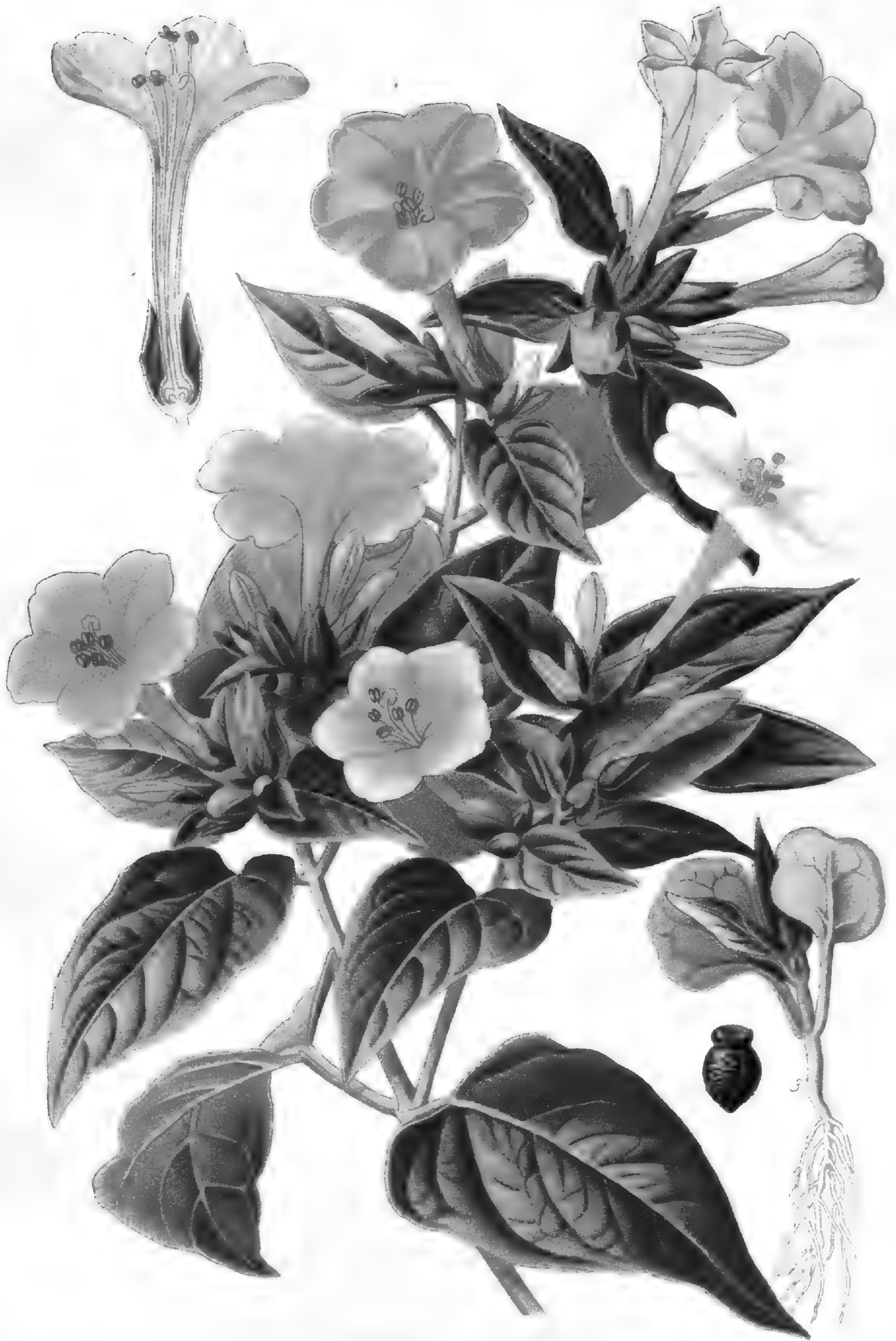
MARVEL OF PERU (MIRABILIS JALAPA)