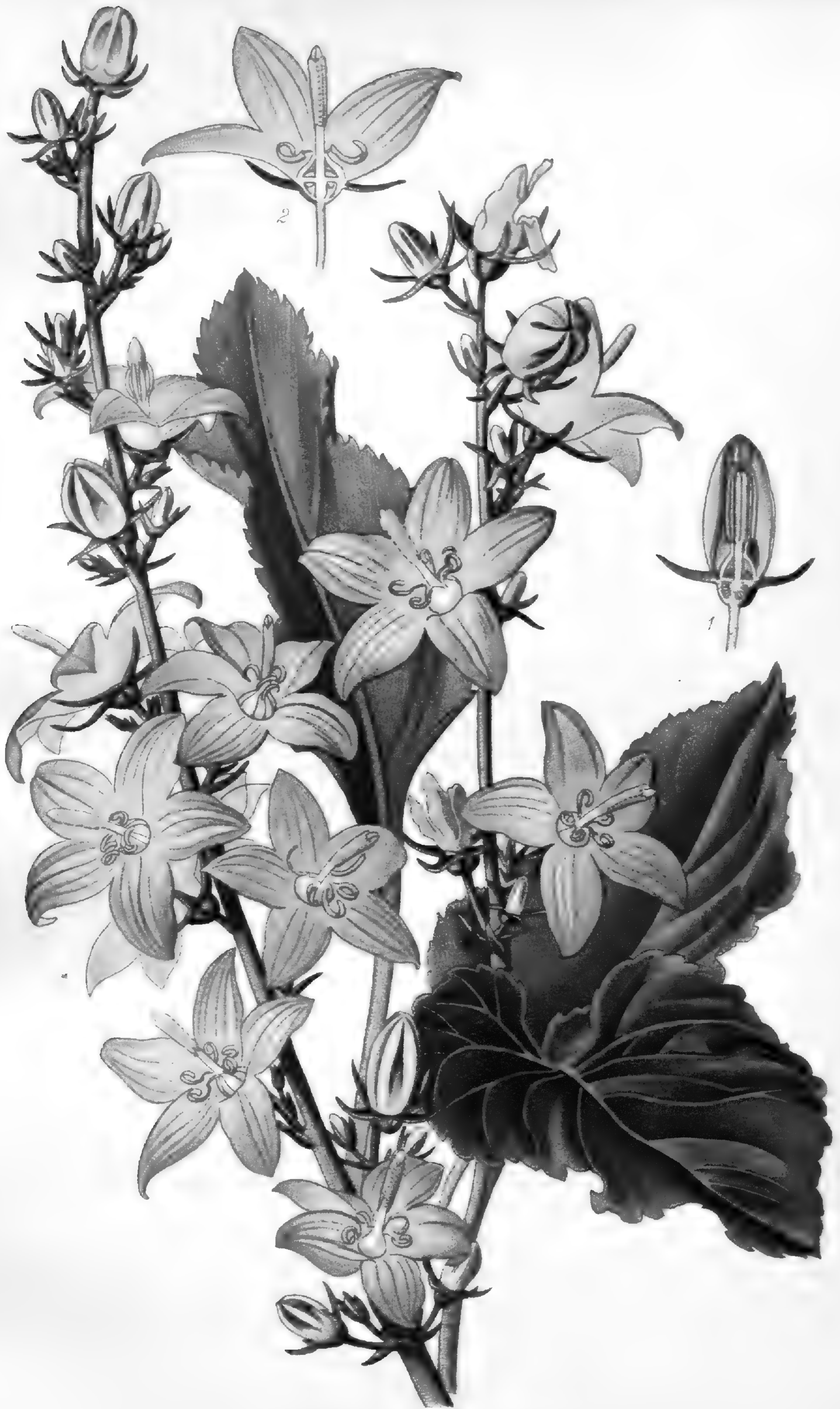
CHIMNEY BELL-FLOWER ( CAMPANULA PYRAMIDALIS )