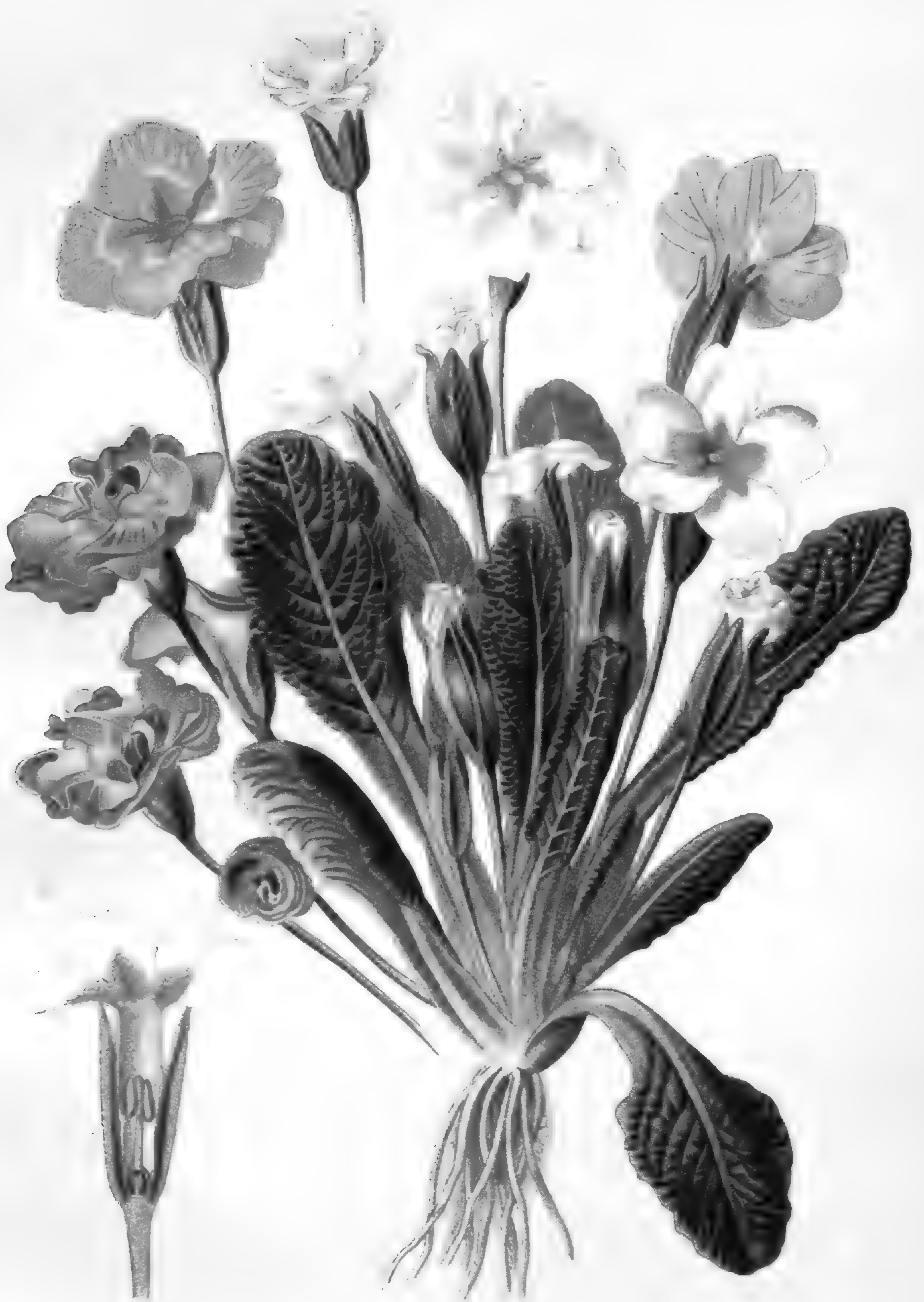
PRIMROSE ( PRIMULA VULGARIS , and vars. )