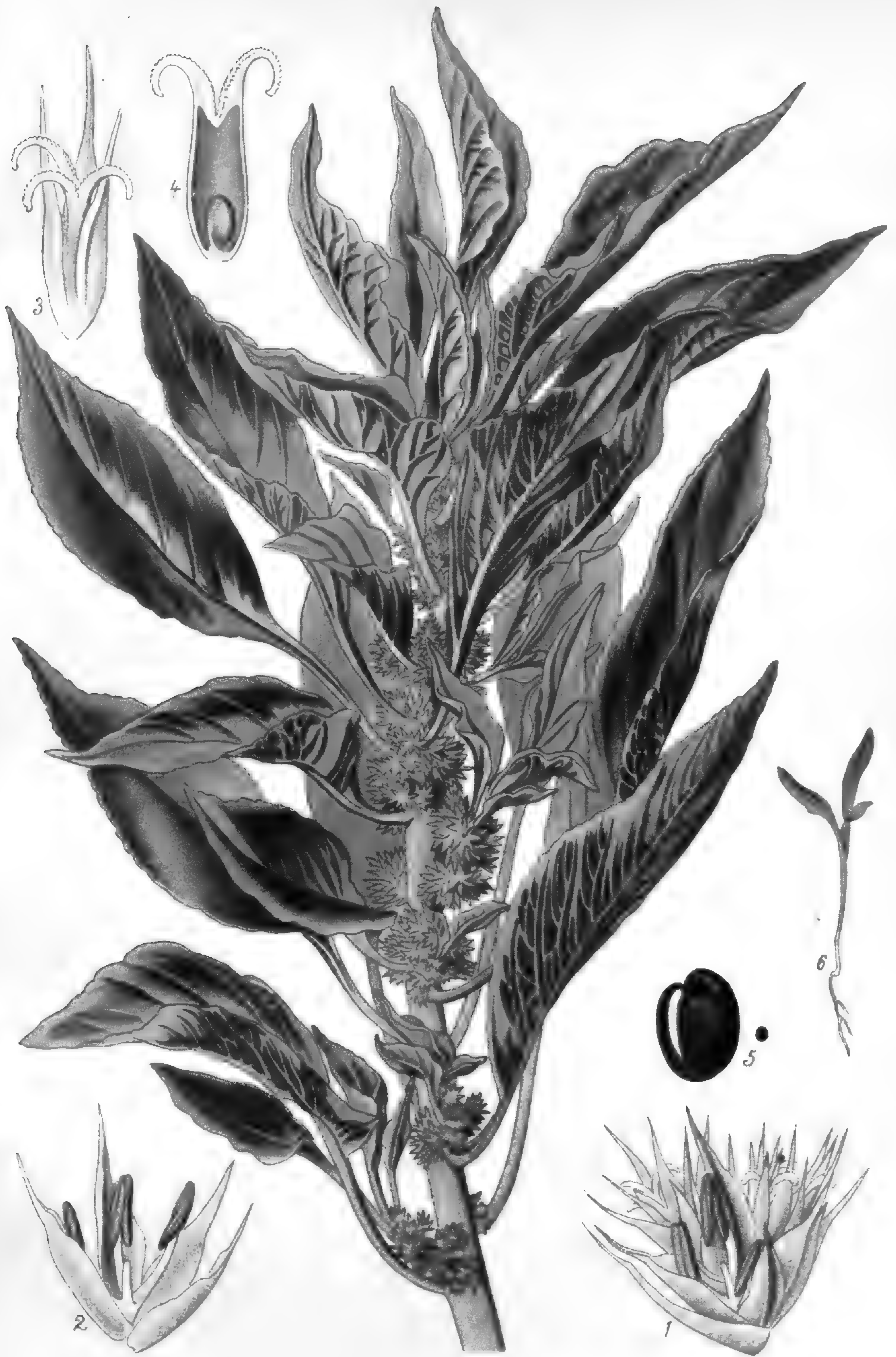
VARIEGATED AMARANTH (AMARANTUS TRICOLOR)