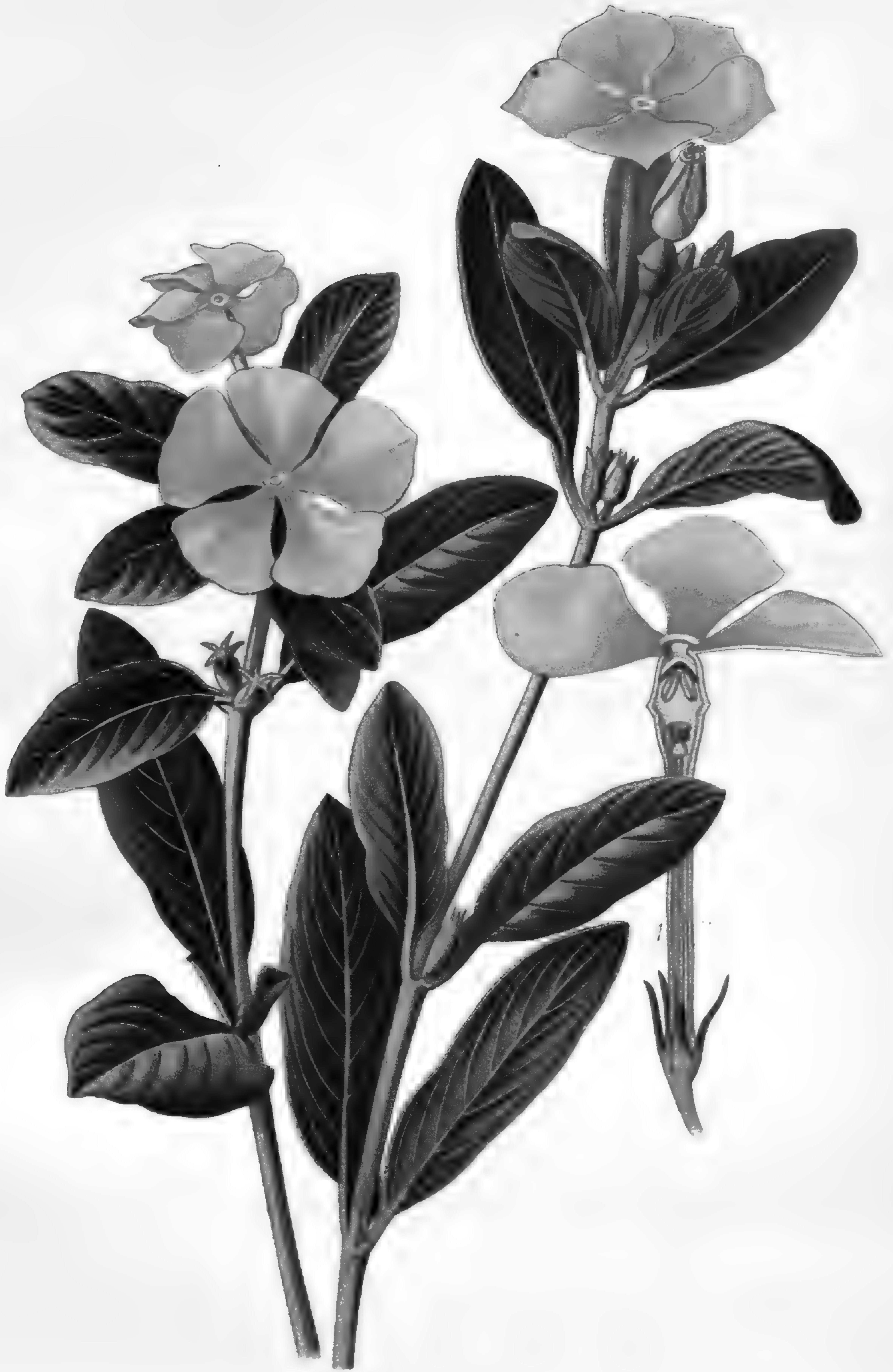
OLD MAID (VINCA ROSEA)