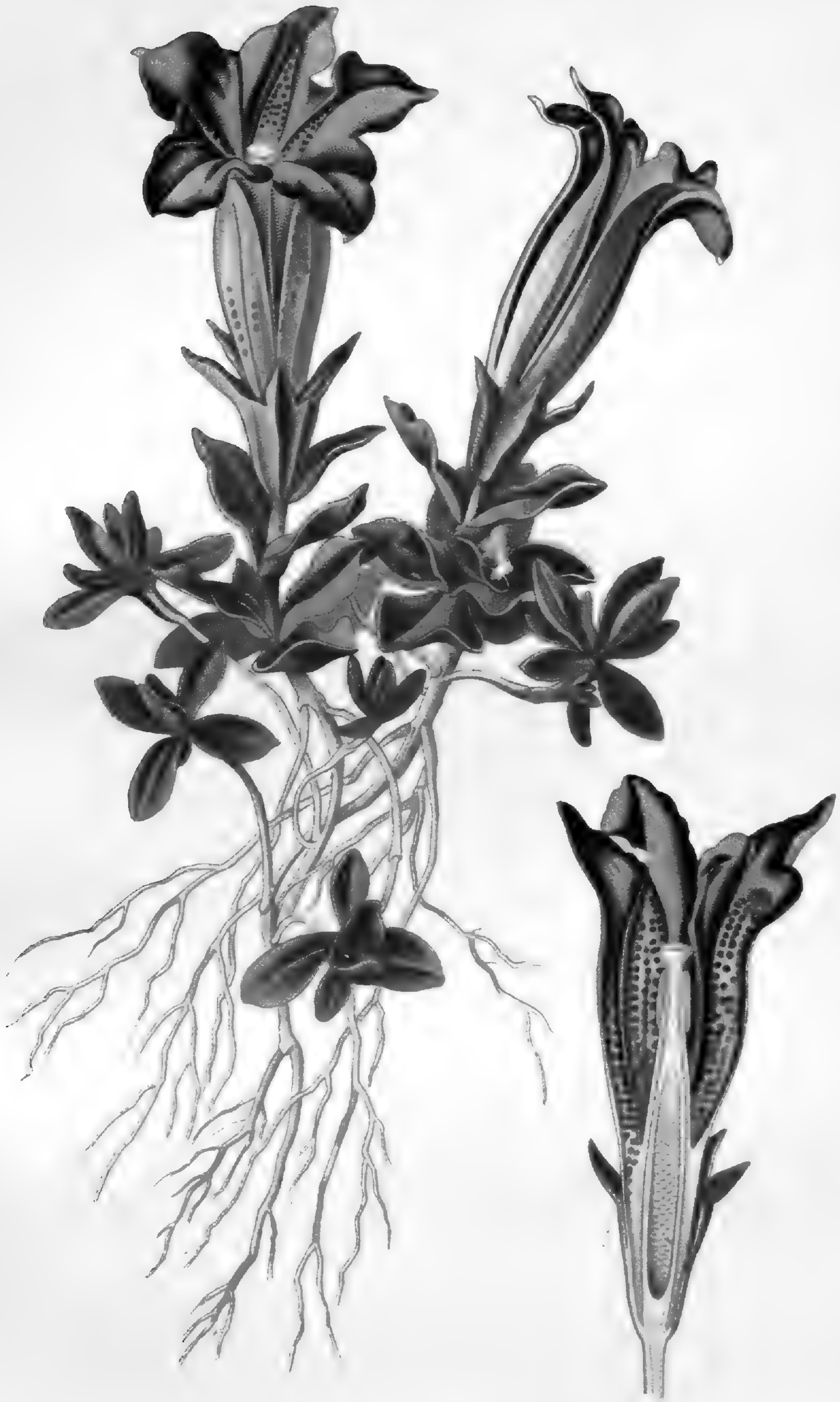
GENTIANELLA (GENTIANA ACAULIS)