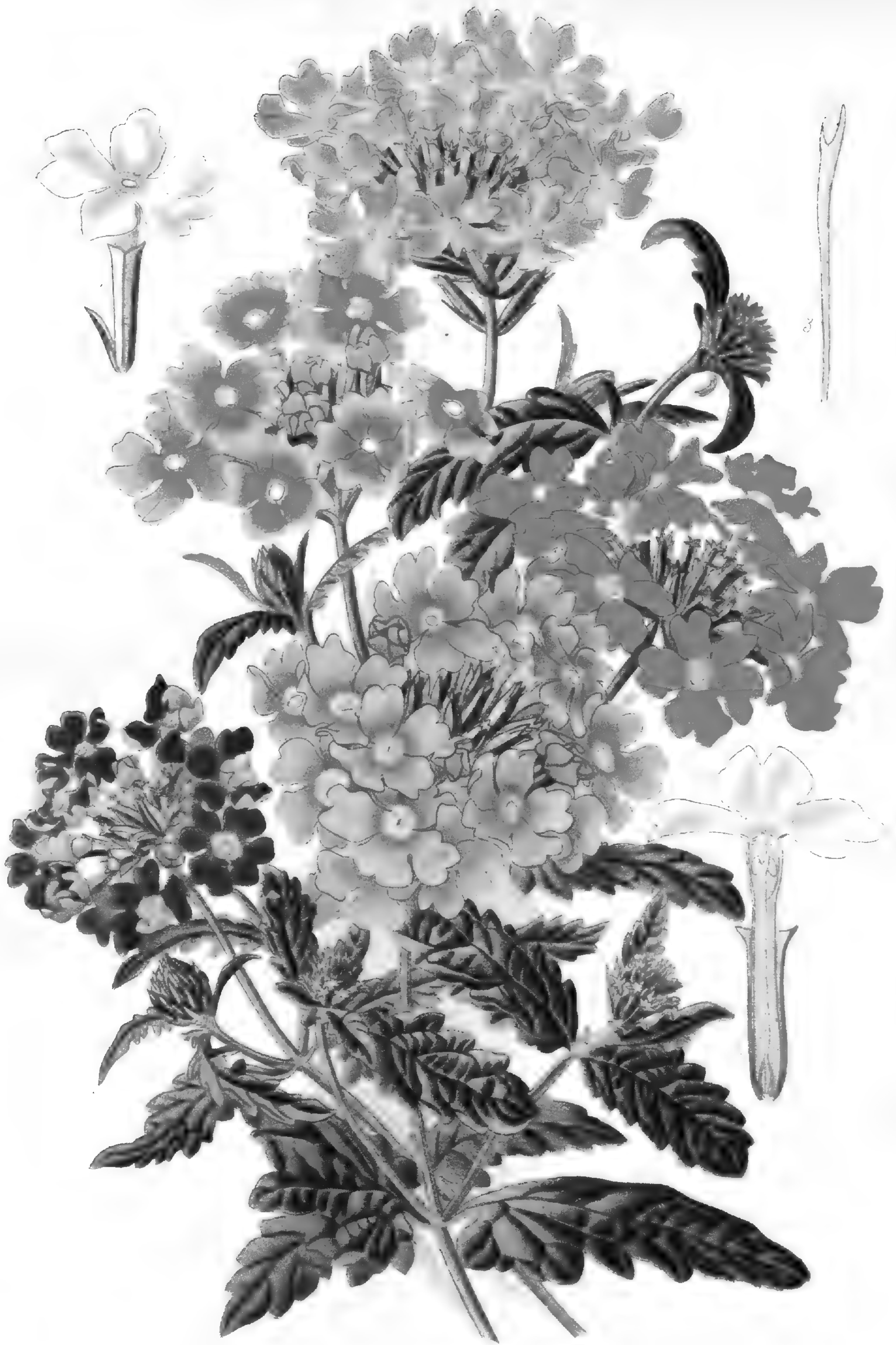
BEDDING VERBENAS ( VERBENA HYBRIDA )