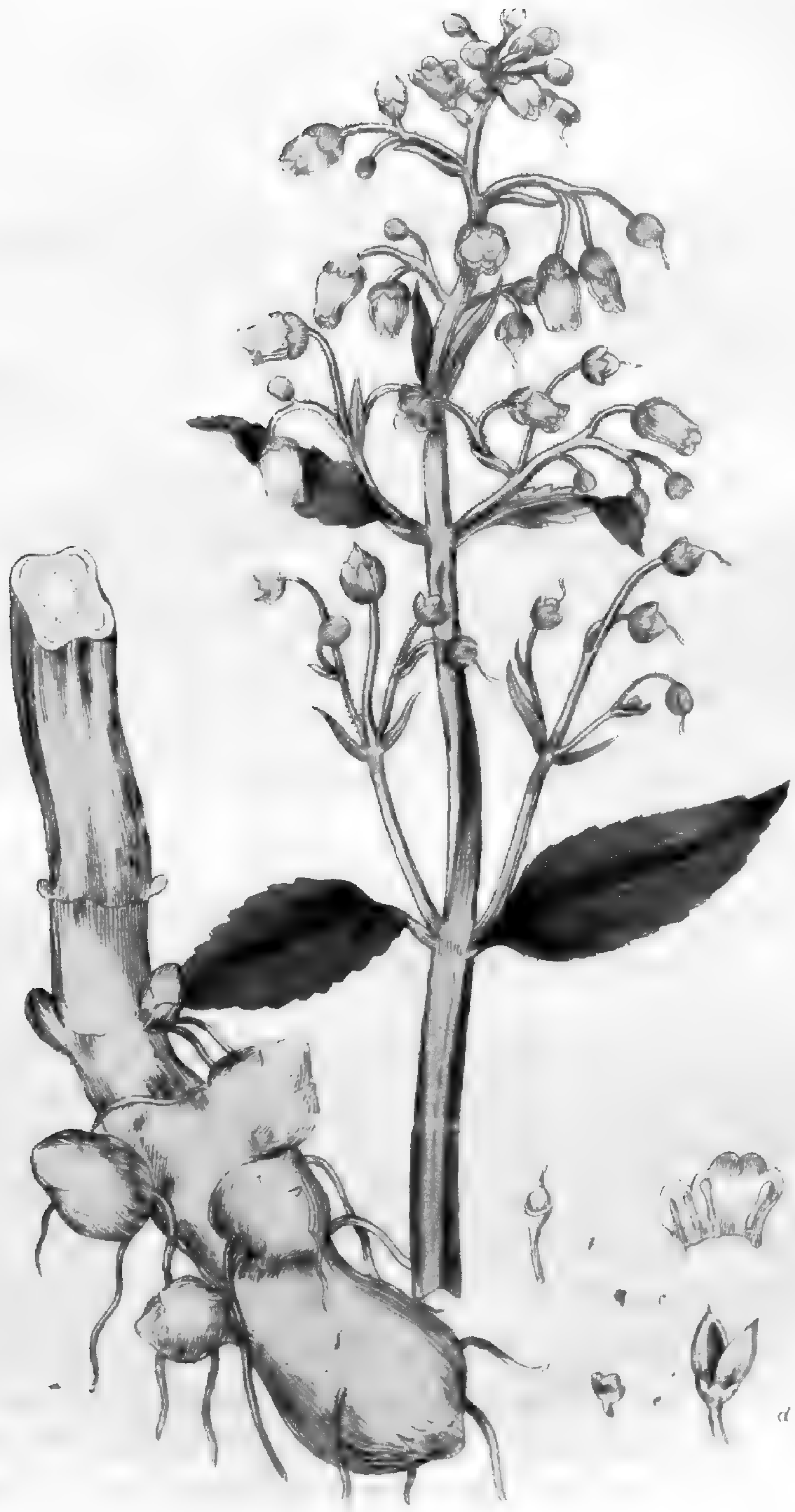
Perofibularia - nodosa.