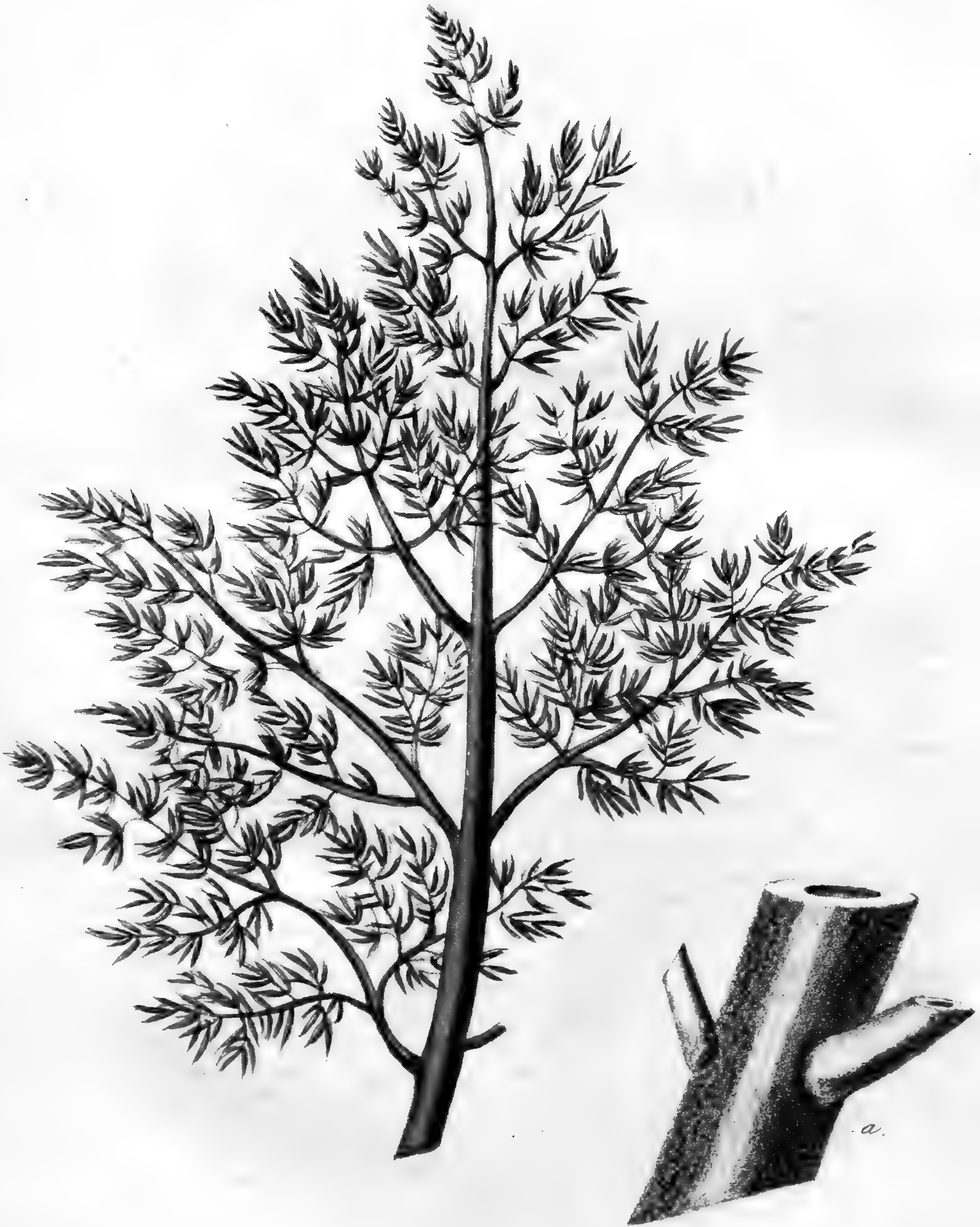
Bashook, or Gum Ammoniac Plant.