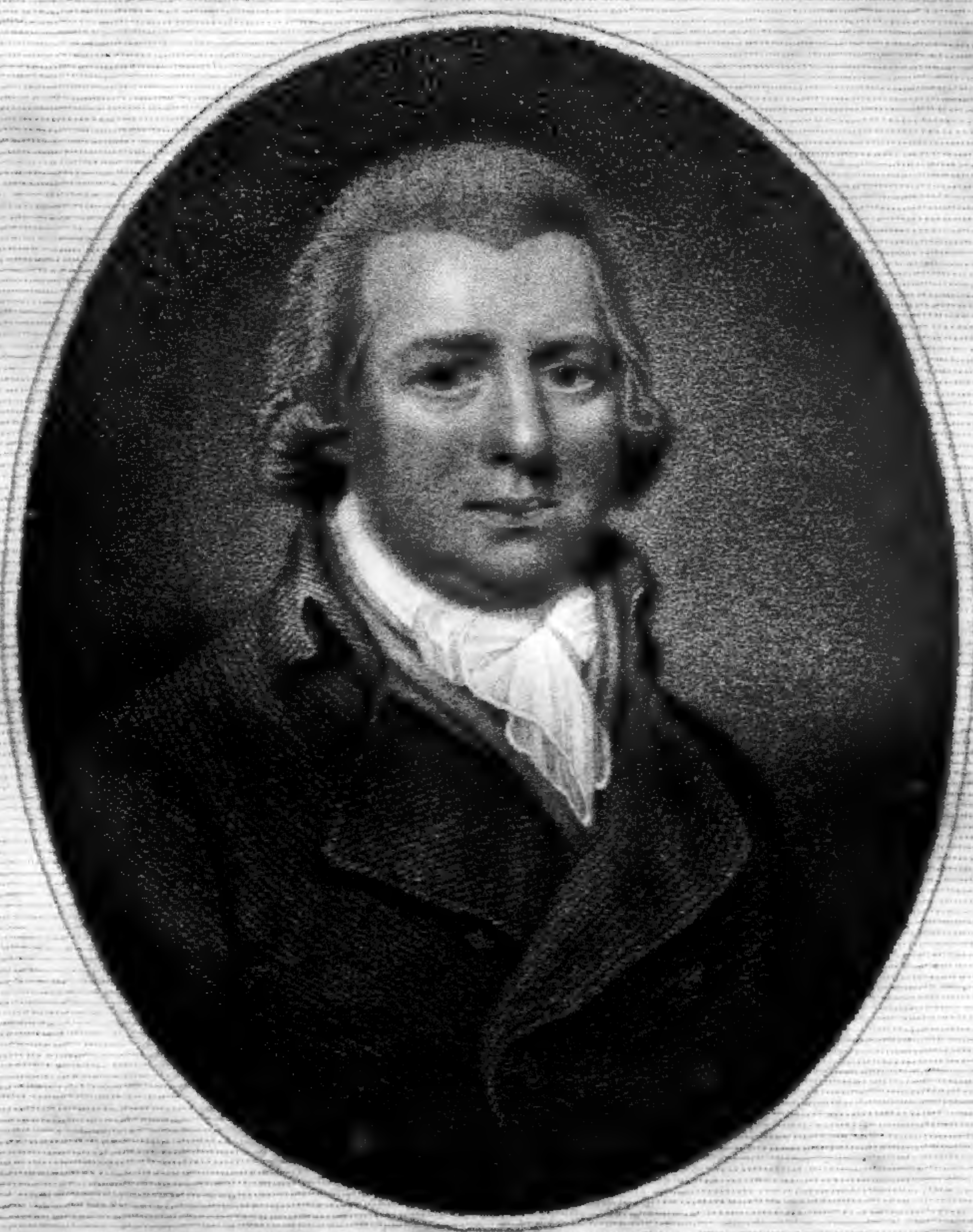
WILLIAM CURTIS AUTHOR OF THE FLORA LONDINENSIS BOTANICAL MAGAZINE &c.