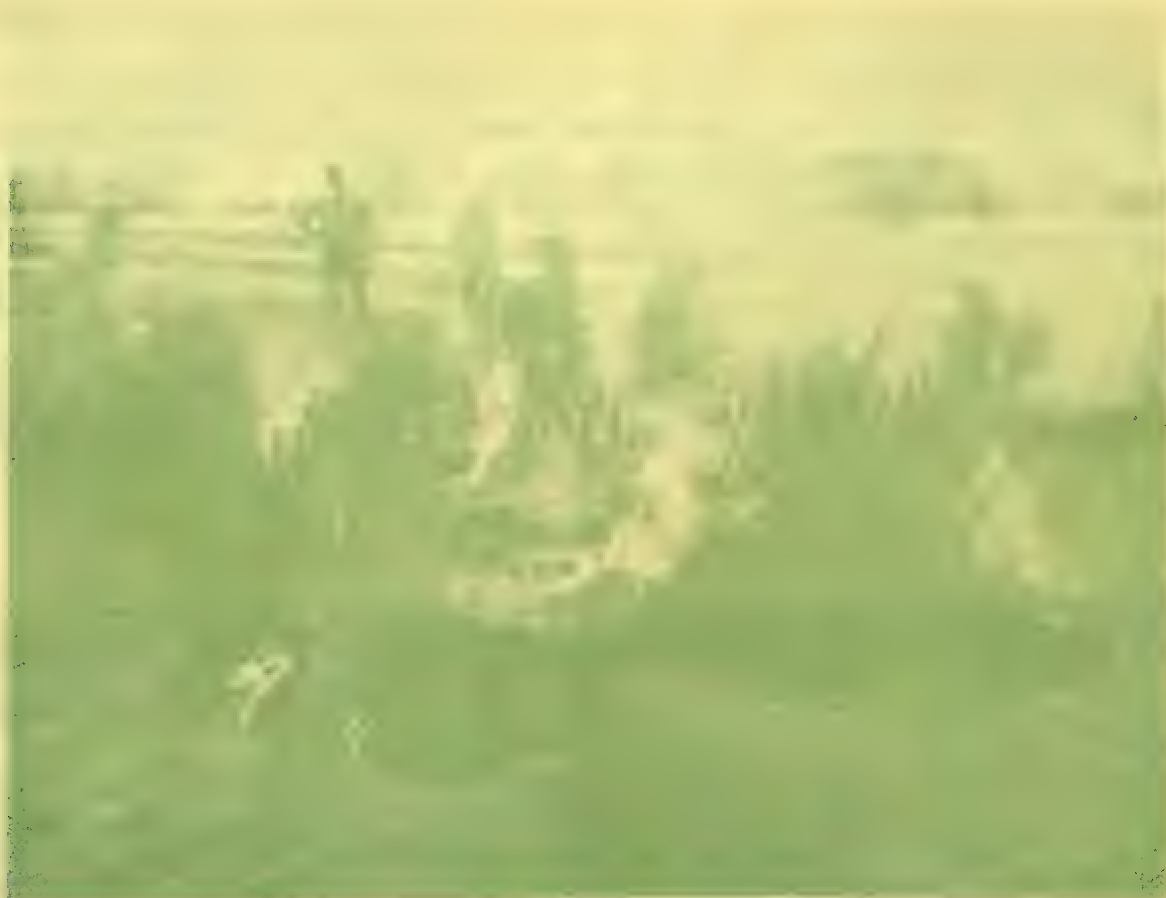
Experimental burning of Cistus to determine most fire resistant species

IN ADDITION TO CISTUS , OTHER PLANTS ALSO SHOW ADAPTABILITY TO USE ON THE FOOTHILLS AS INDICATED IN THE LUX ARBORETUM ANNEX IN THE MONROVIA FOOT-HILLS. THESE PLANTS ARE: