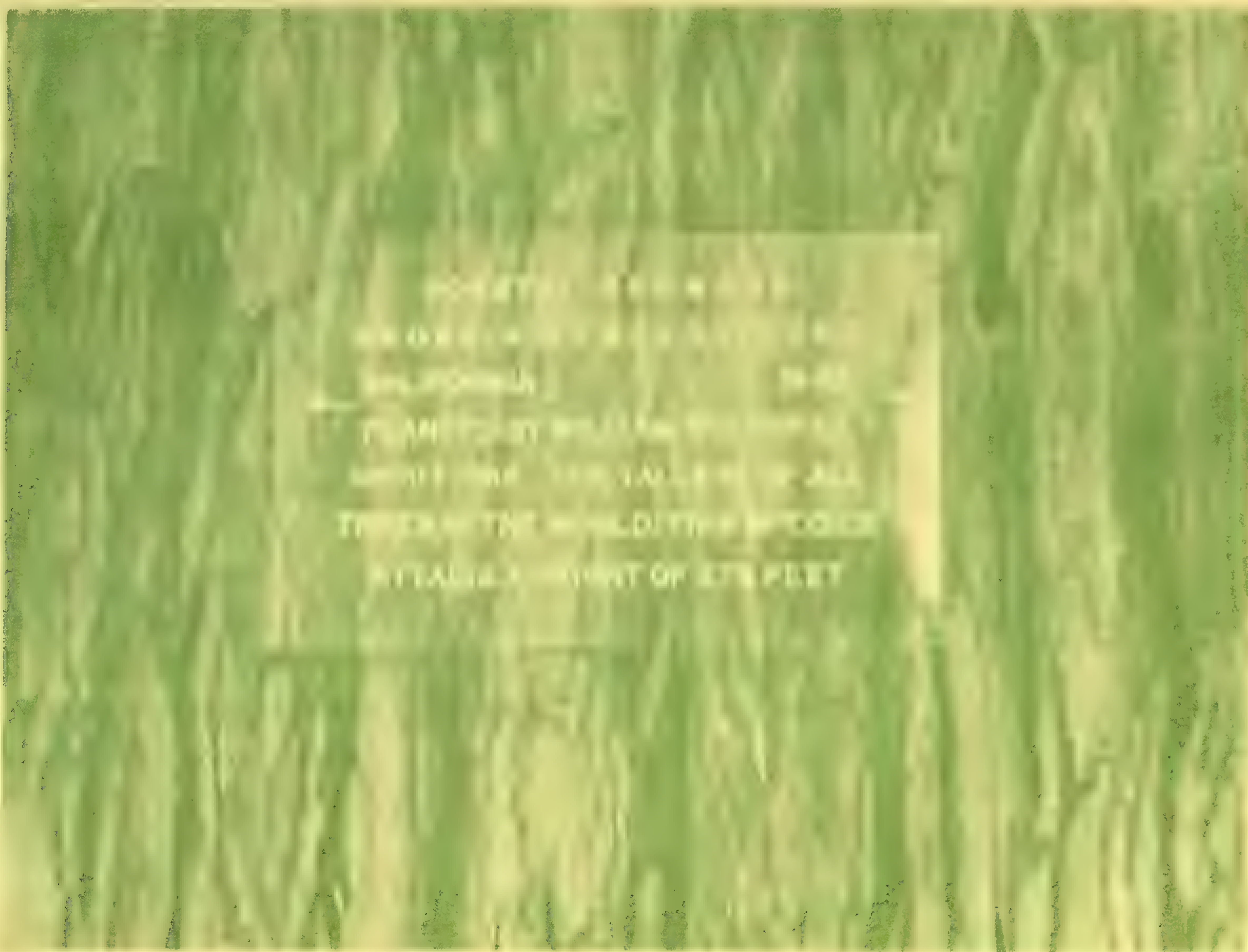
Engraved transparent plastic label used at the Arboretum

THESE LABELS IN MOST INSTANCES CARRY THE COMMON NAME, SCIENTIFIC NAME AND HABITAT, AND MAKES A THREE LINE WORKER. WE ARE WORKING ON A SERIES OF LABELS A BIT LARGER, 2 1/2 X 6" THAT WILL TAKE FOUR LINES. THE ADDITIONAL LINE TO BE A SORT OF "THOUGHT PROVOKER", OR "INTEREST AROUSER" FOR FUTURE ARBORETUM VISITORS. ONE SMALL AREA NEAR THE OFFICE IS BEING USED AS A TEST AREA, AND SOME OF THE FIRST MENTIONED THREE LINE LABELS ARE IN POSITION THERE. THEY ATTRACT A GOOD DEAL OF ATTENTION FROM THOSE VISITING THE ARBORETUM GROUNDS.