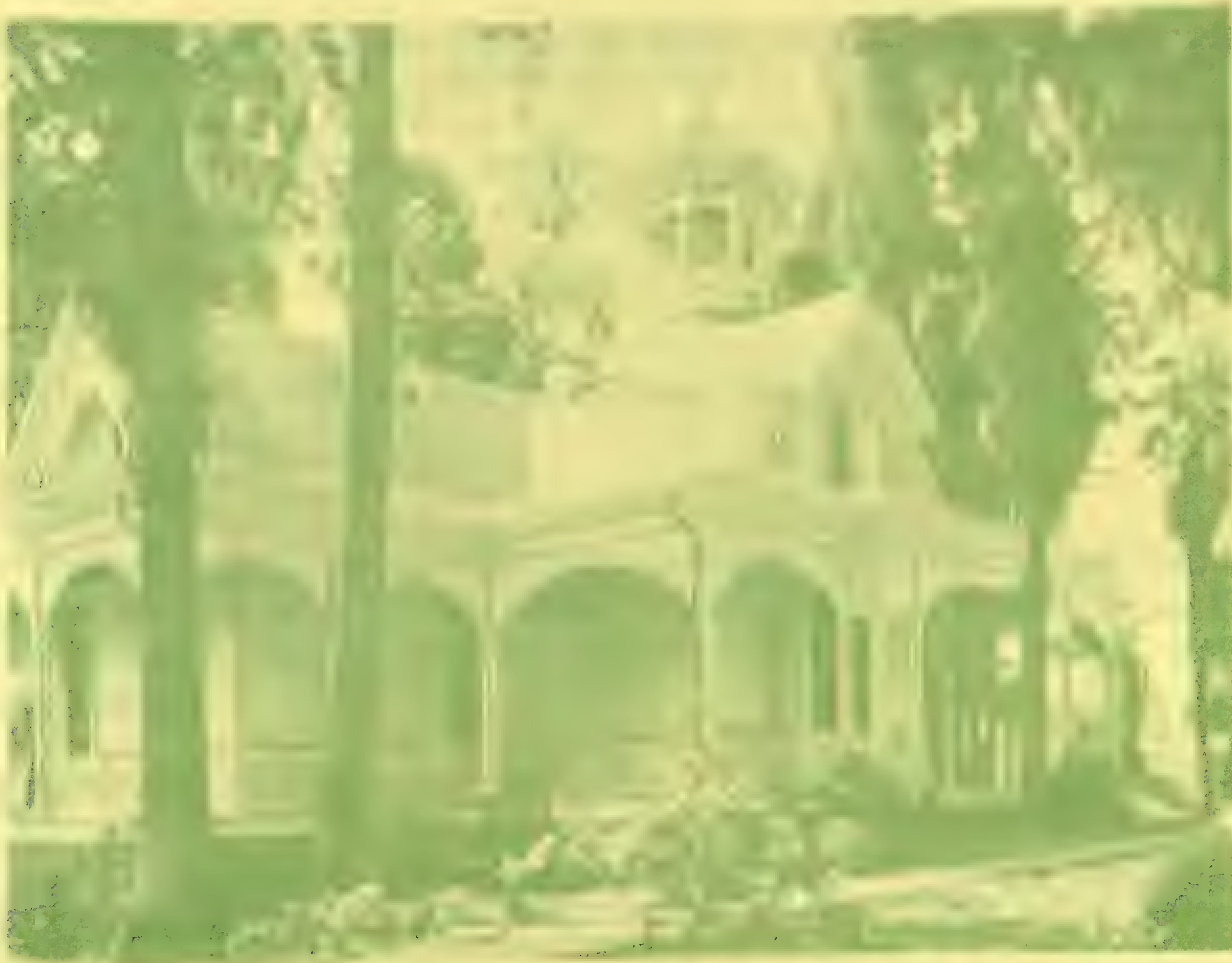
The newly restored "Queen Anne Cottage" within the Historical Preserve of the Arboretum.

THE LANDSCAPING OF THE NEWLY RESTORED "QUEEN ANNE COTTAGE" IS WELL ON ITS WAY TO COMPLETION. THE OLD PLANTINGS IN THIS PRESERVE ARE GRADUALLY BEING REJUVENATED AND AUGMENTED TO CREATE THE PROPER HISTORICAL SETTING FOR THE OLD BUILDINGS.