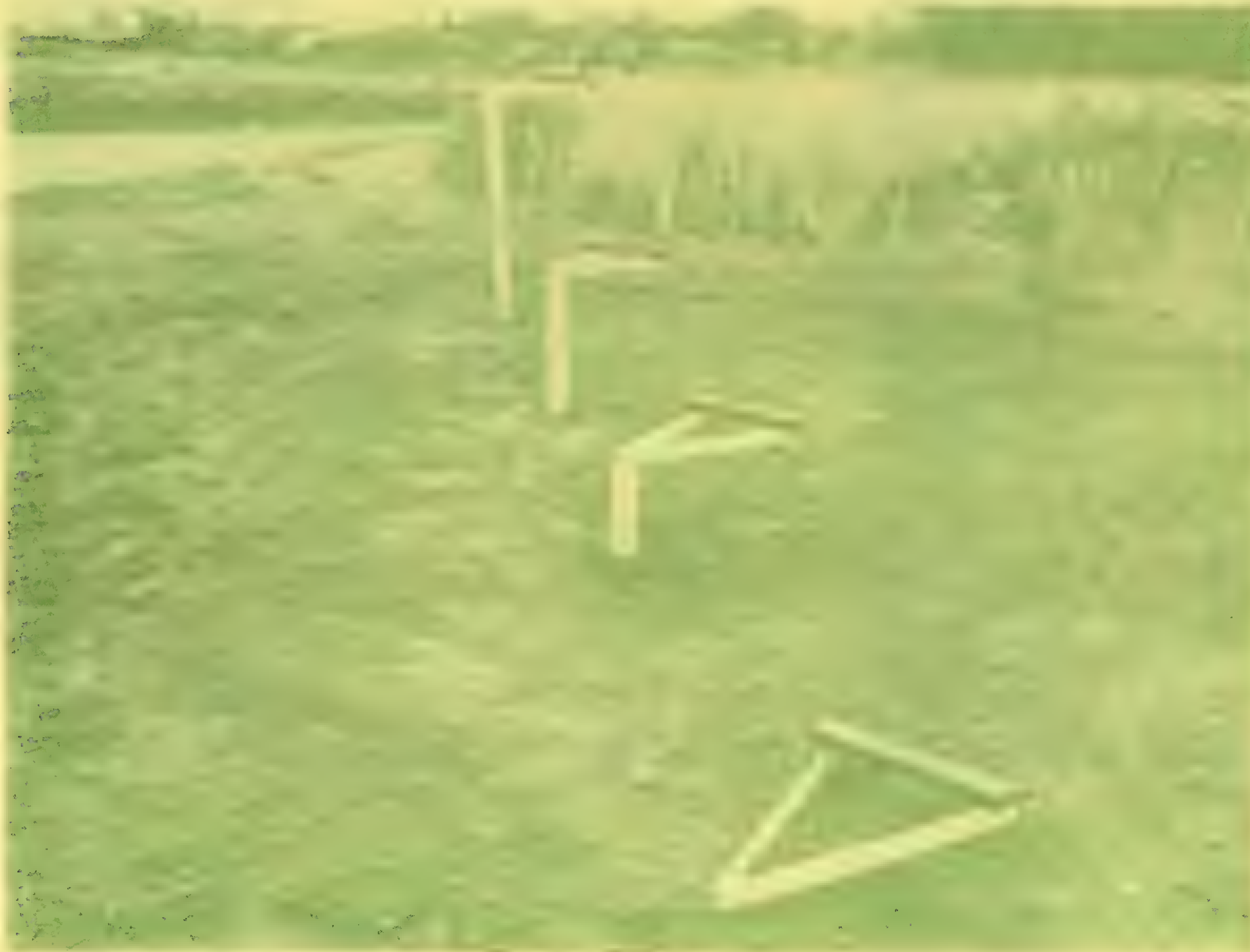
Dew gauges in position for recording the amount of dew precipitation at varying elevations above ground level