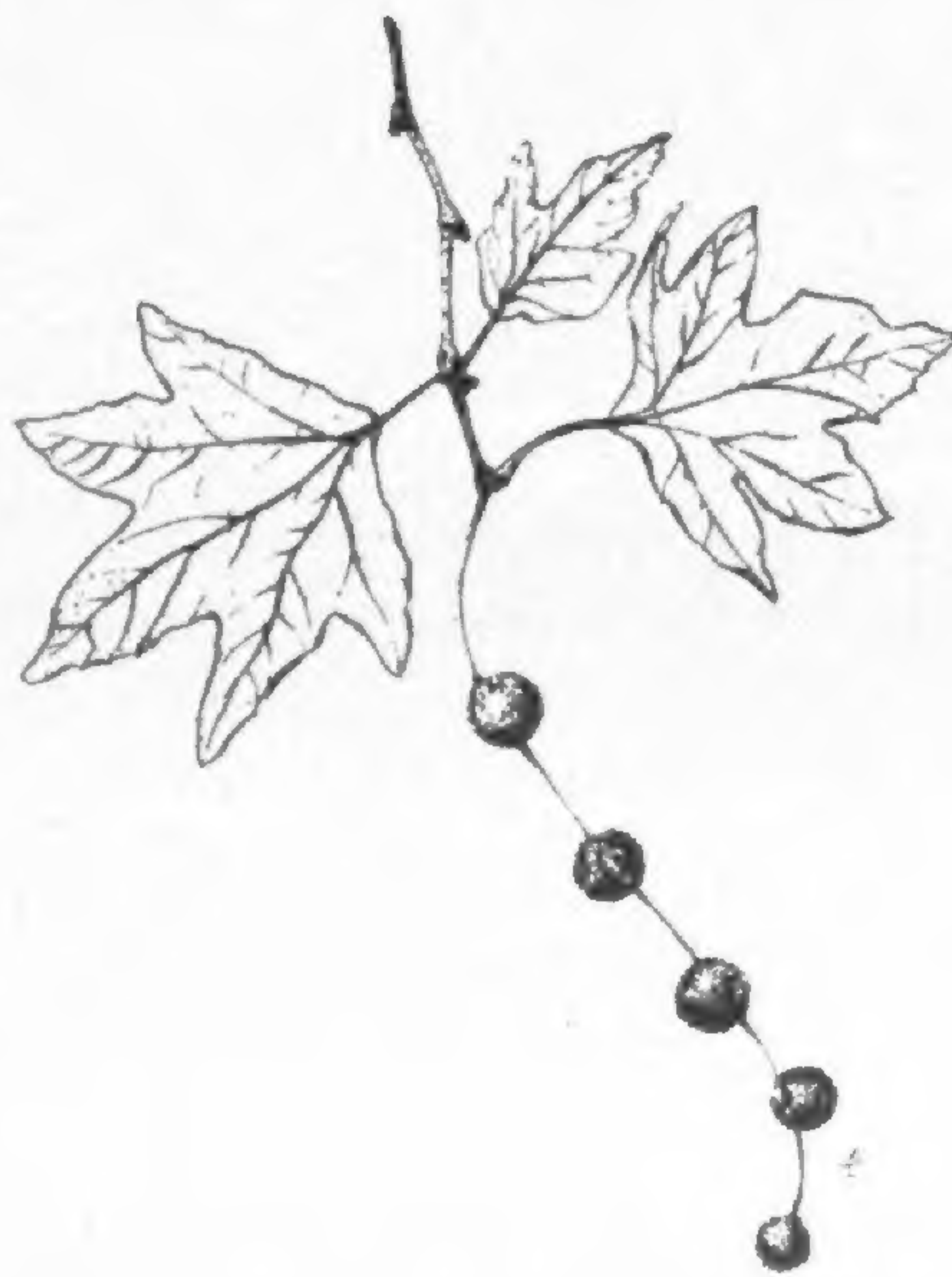
P. racemosa . Drawing by Patty Lawson.

Platanus is the only genus in its family, the Platanaceae, and there are only seven or eight species in the genus. All of the species have dangling, spherical clusters of unisexual flowers; large, palmately lobed (maple-like) leaves; and smooth, mottled bark.