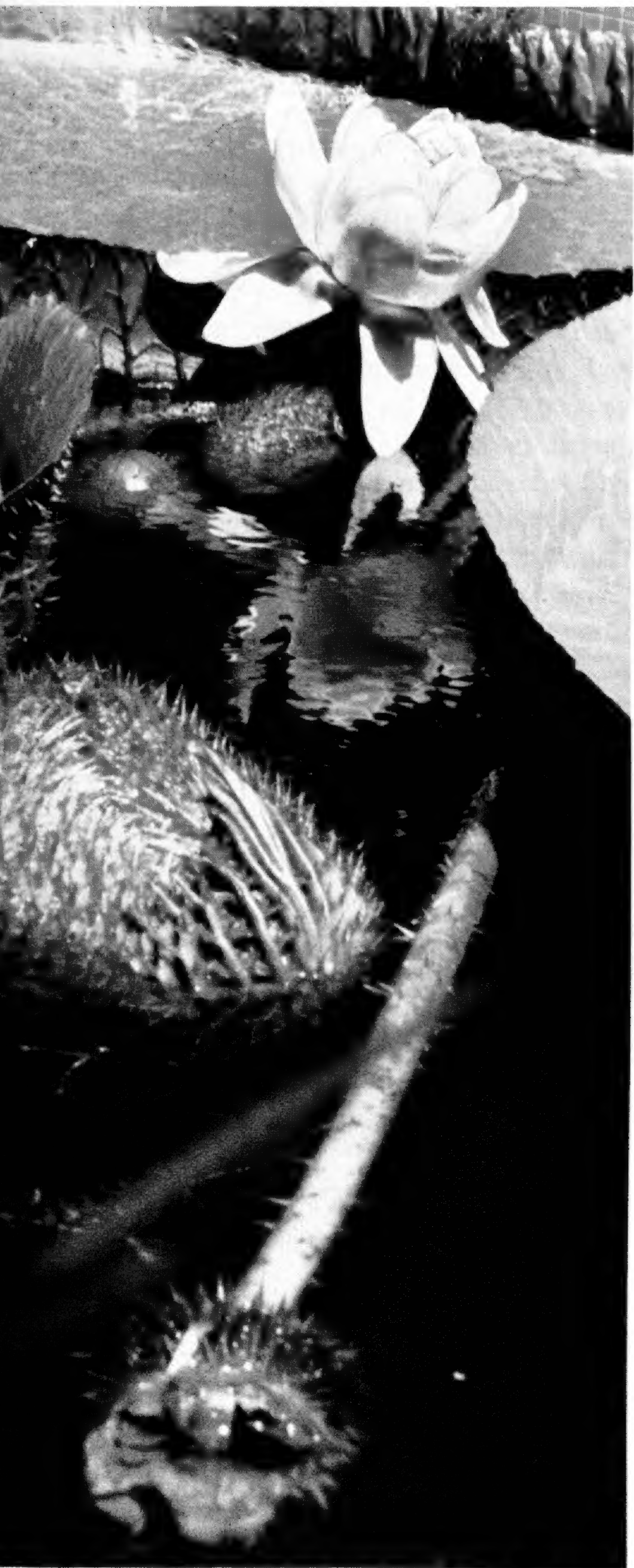
A newly opened flower rises above a bud, a furled leaf (center) and a pollinated seed pod.

The plants are adapted in several ways to the heavy rainfall of their habitat in quiet streams and backwaters of equatorial South America.