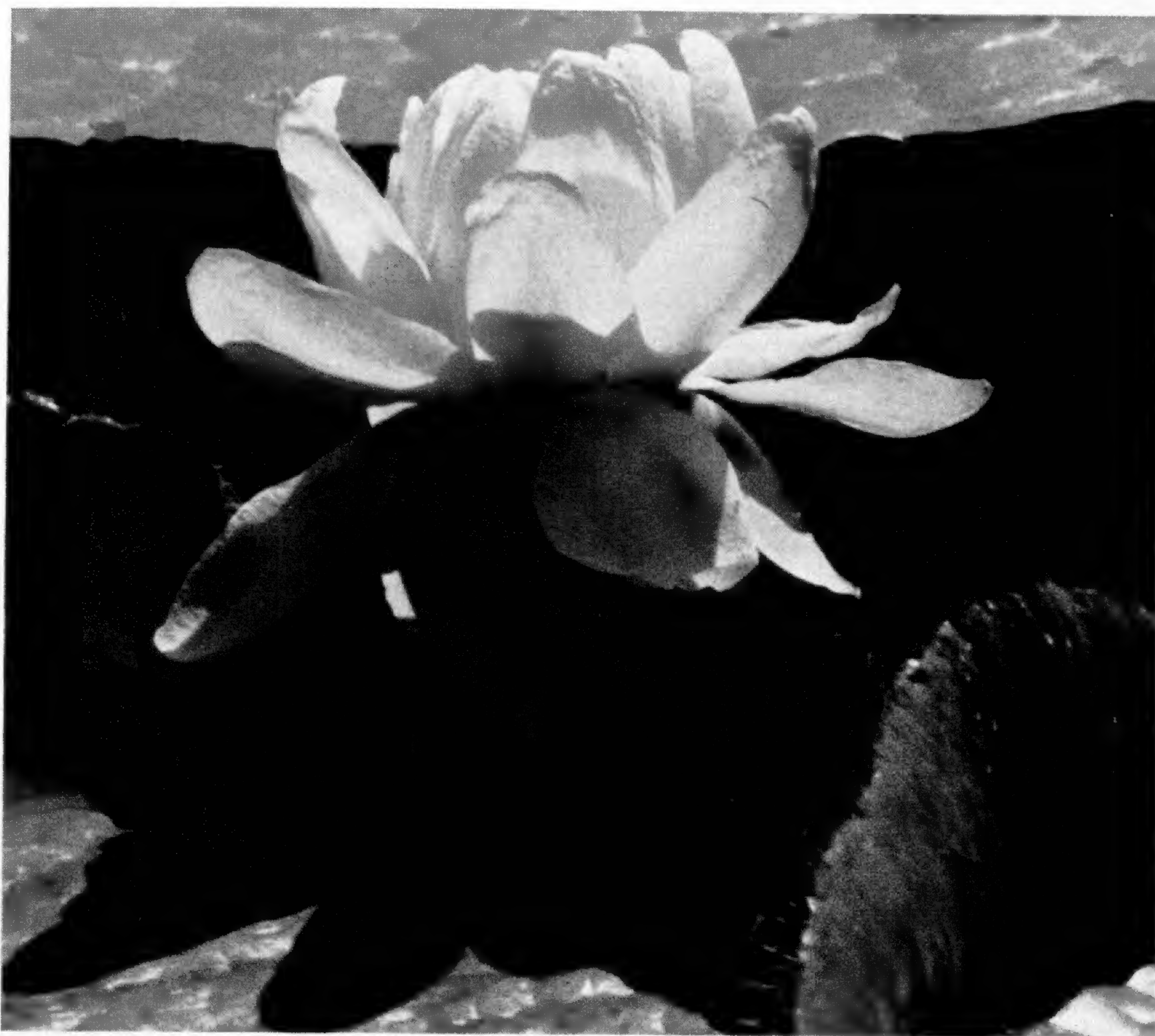
A flower of the giant water lily opens white and turns cerise on the second day.

rate of almost an inch an hour, it looks much like a heavily armored, floating football. Some botanists speculate that the thorns may have evolved as protection against fish and aquatic herbivores such as the manatees native to tropical rivers. Unfortunately, the spines proved ineffective against the resident Ar-