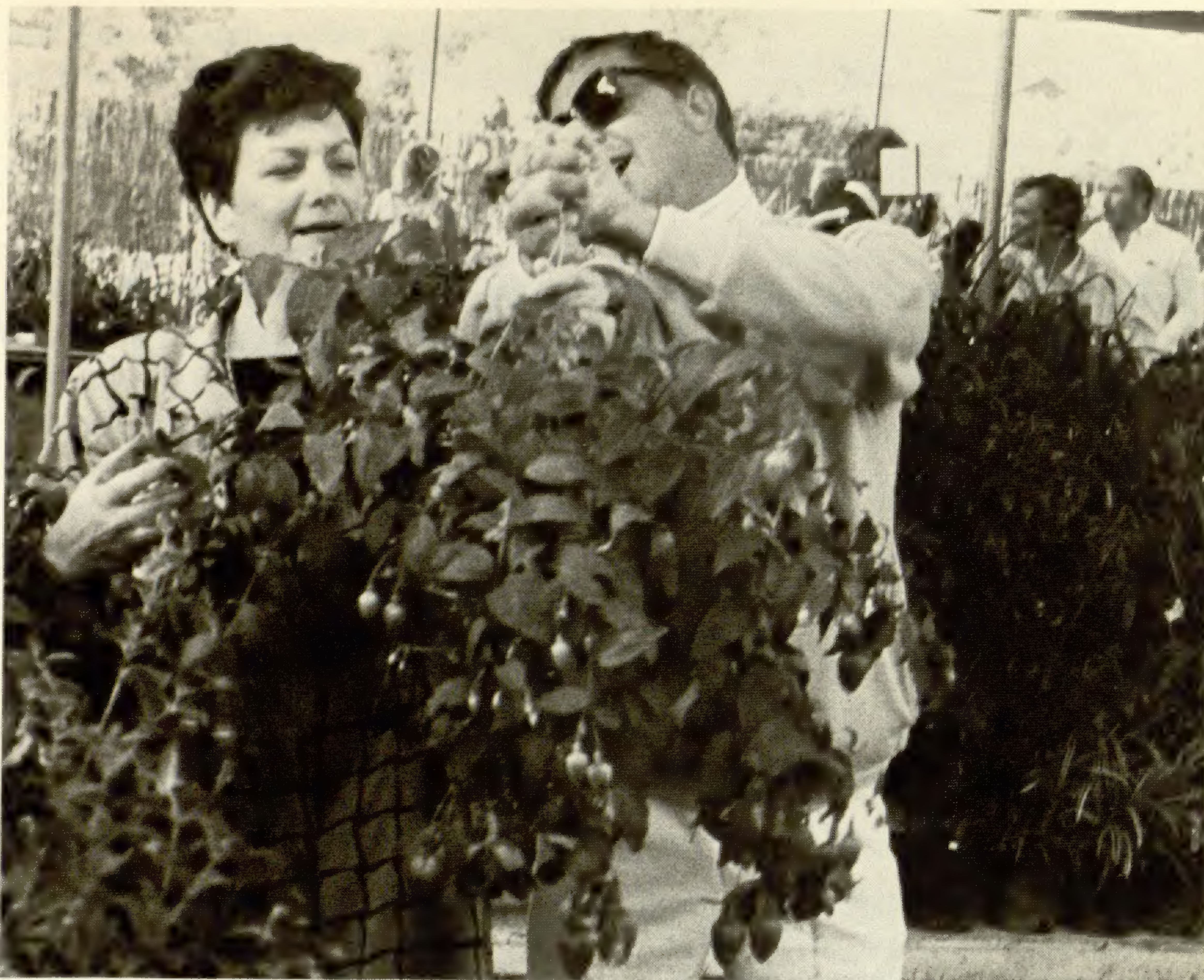
Choosing the perfect fuchsia basket from among the hundreds for sale takes careful evaluation.