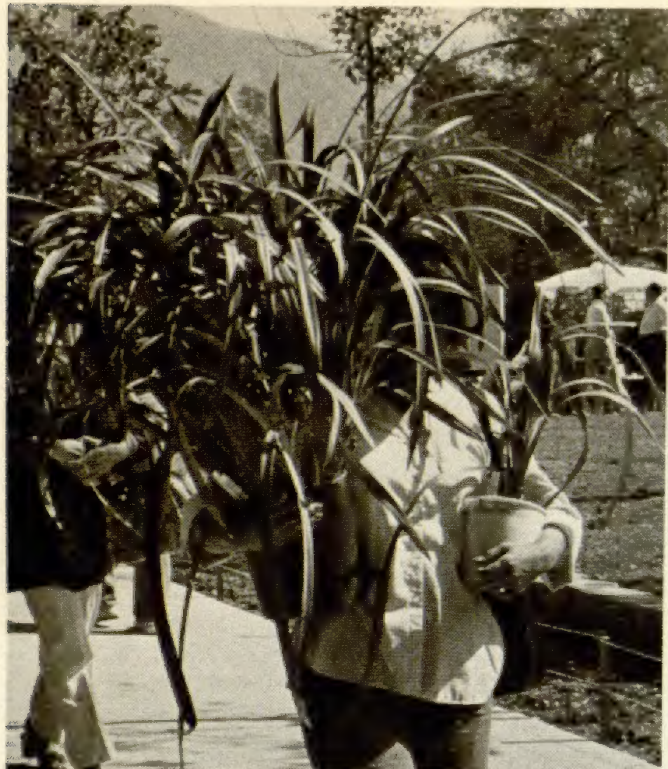
Cymbidiums are always popular at the annual benefit plant sale.