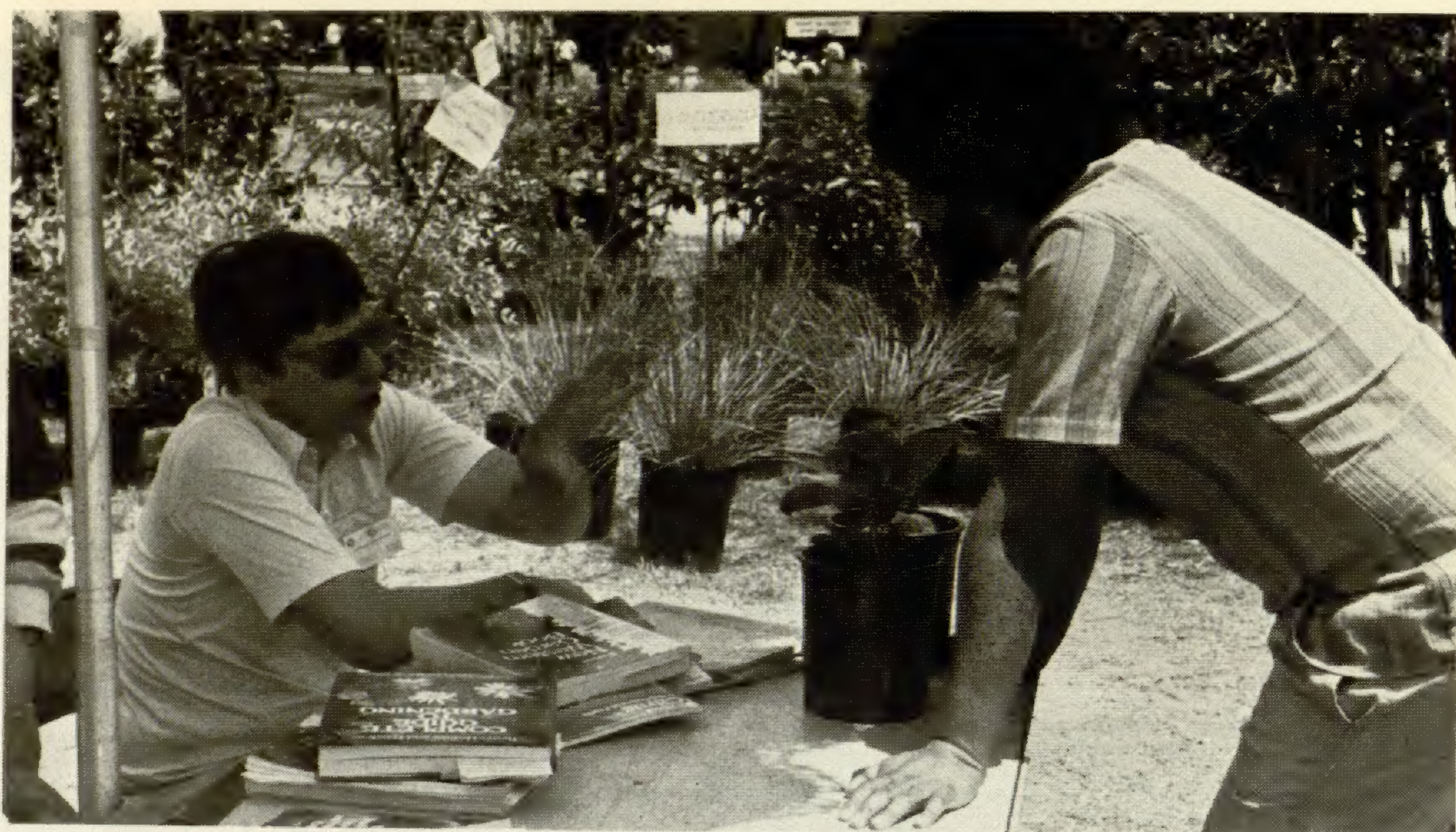
A shopper visits the plant consultant booth to get advice on growing his purchases.