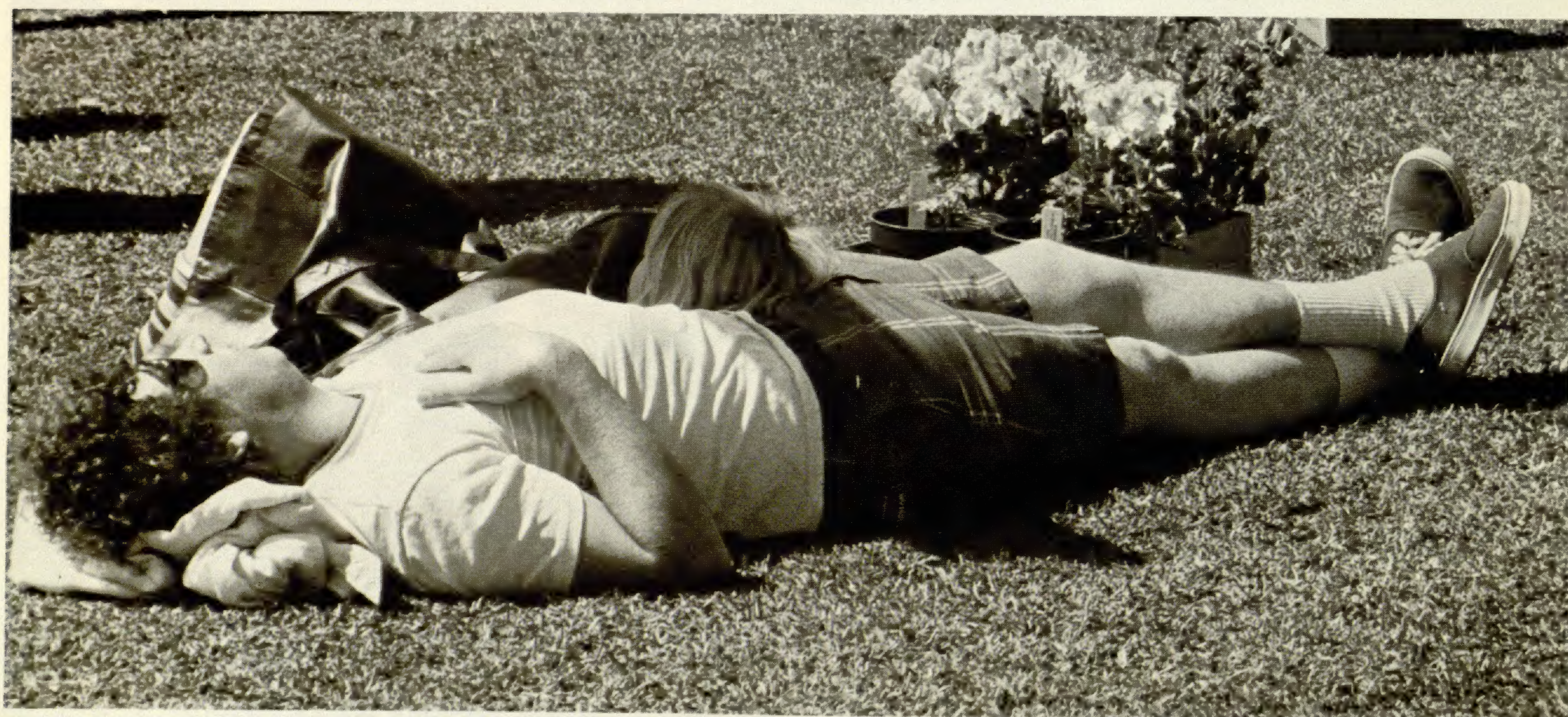
The junior member of this father-daughter team claims the only strip of shade as they take time out from shopping.