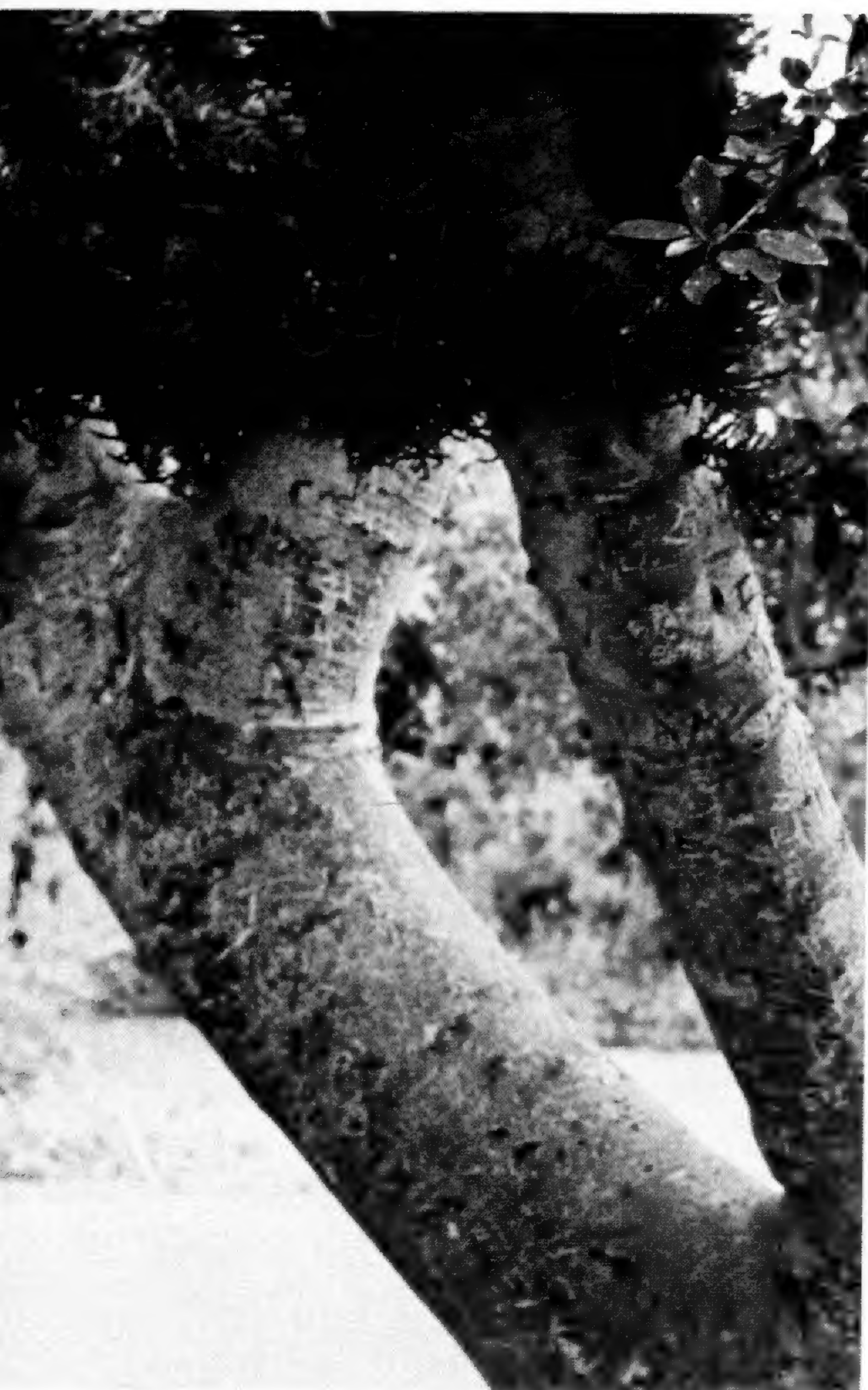
The stout branches of the sycamore fig ( Ficus sycomorus ) on Tallac Knoll are feathered with immature fruits that will never develop further because the wasp that pollinates them does not live in Southern California.

cultivar, F. benjamina 'Variegata,' which should be more widely grown because most of the leaves are cream with some green variegation or mottling. This makes for a very striking color contrast against the background of preponderant greens in the landscape.