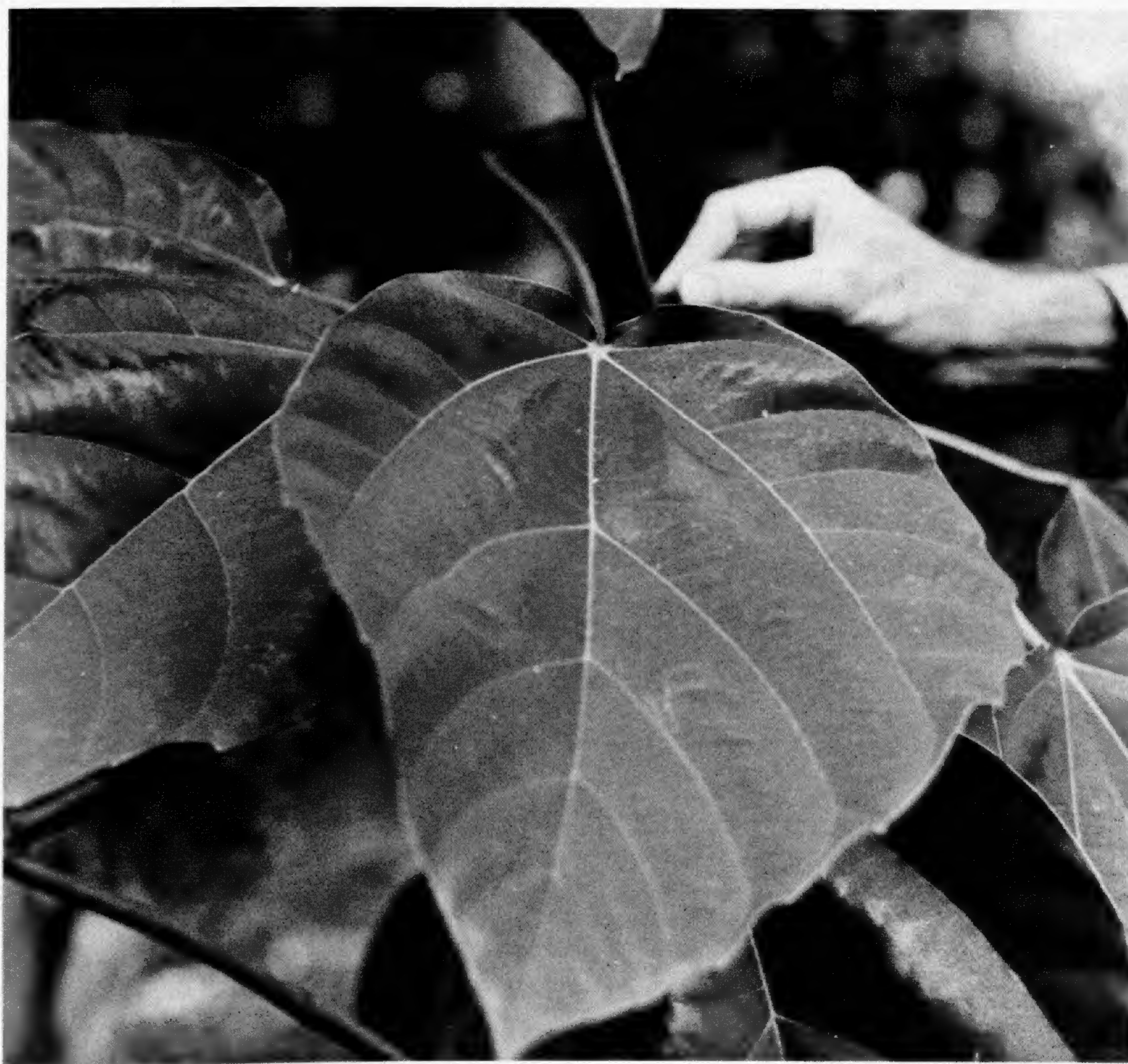
The asymmetrical leaves of Roxburgh's fig (Ficus auriculata) are about one and one-half feet long by a foot wide.

The tree form is the most common within the genus. One of the most popular weeping trees is the Benjamin fig ( F. benjamina ). Actually it is the cultivar 'Exotica' that is most often noticed in Los Angeles County. There is another, more handsome