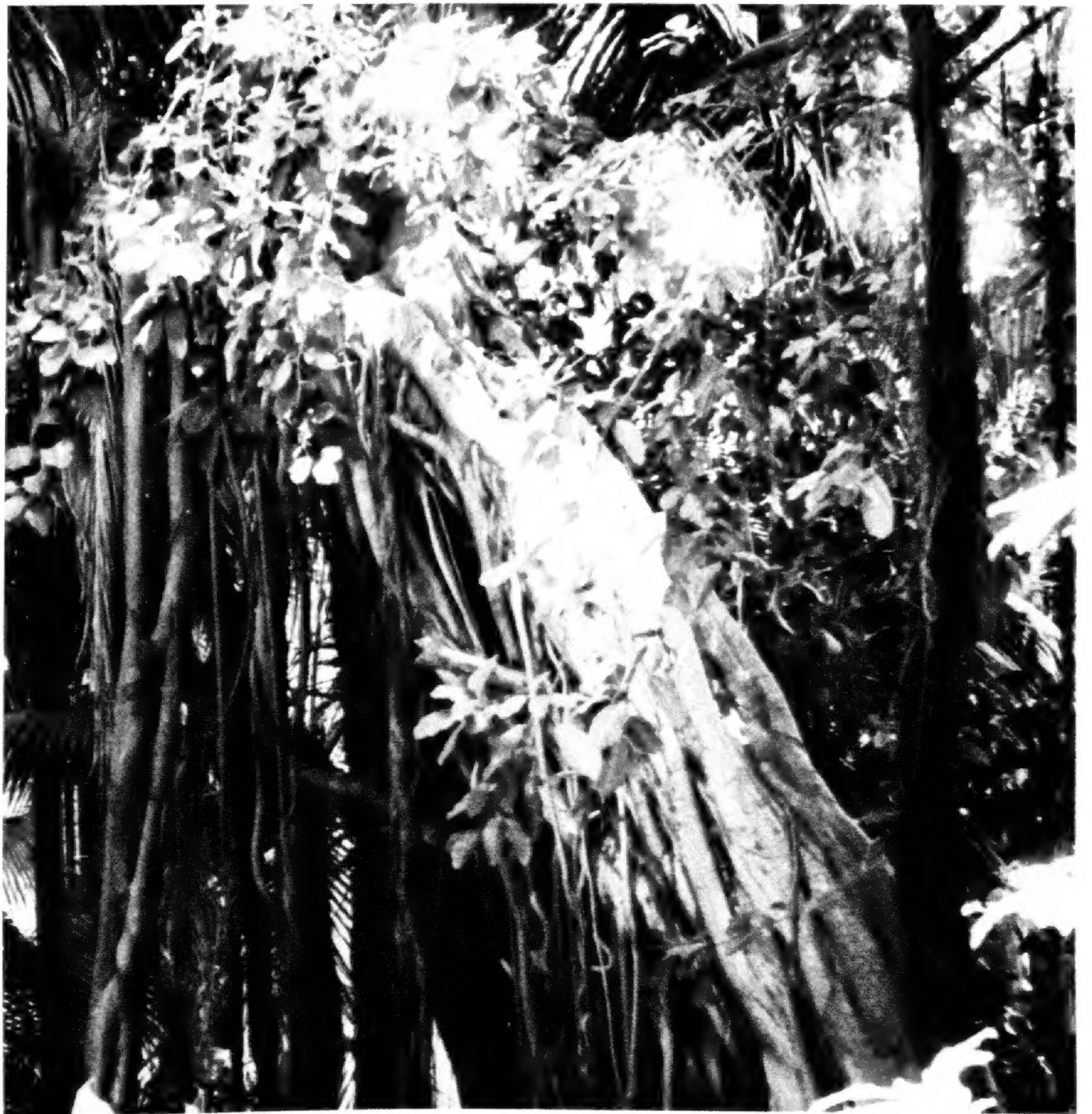
Below: Aerial roots of a fig that is probably Ficus watkinsiana.

A visit to Tallac Knoll to see the variety of fig trees would be very rewarding. The figs are located along the tram road west of the grove of native oak trees.