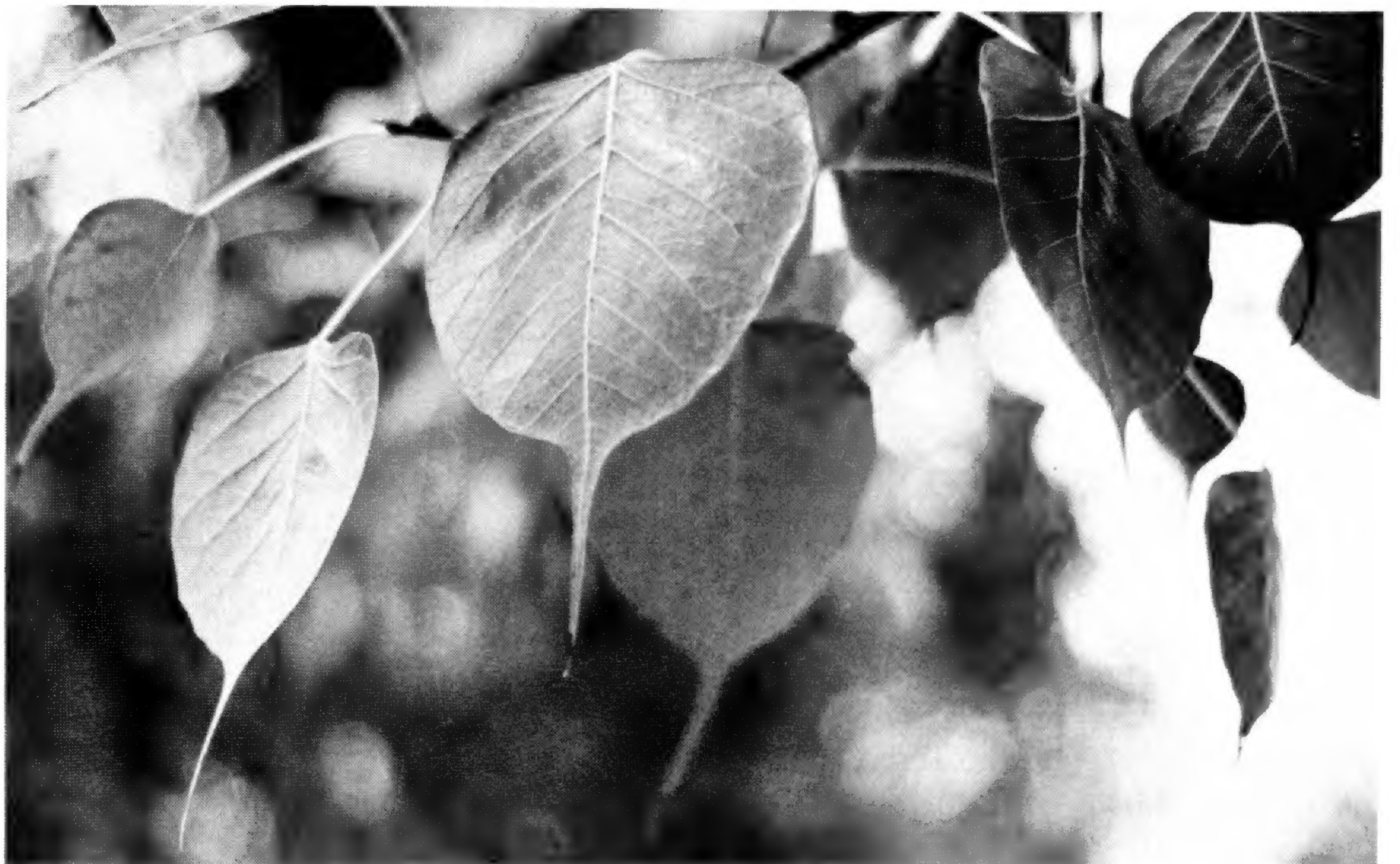
Above: Leaves of the Bo tree (Ficus religiosa).