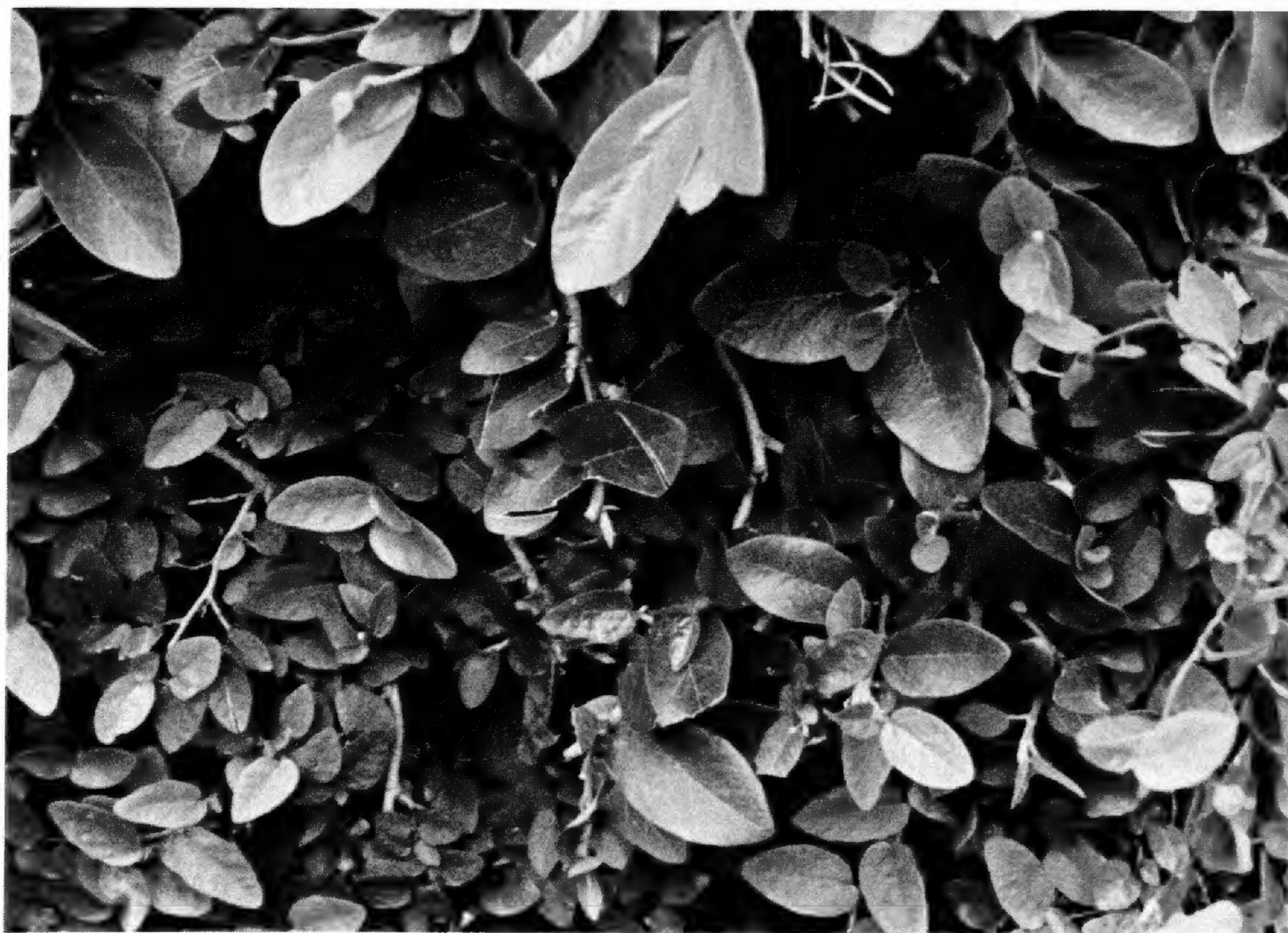
As the climbing fig ( Ficus pumila ) clammers upward, coarse adult foliage replaces the smaller, round juvenile leaves.

Roxburgh's fig ( F. auriculata ) is a small to medium-sized tree whose immense leaves have a few small teeth along the leaf margin. These ever-green leaves create a bold, tropical look. There is no confusing this large-leaved fig with the other trees in the fig collection.