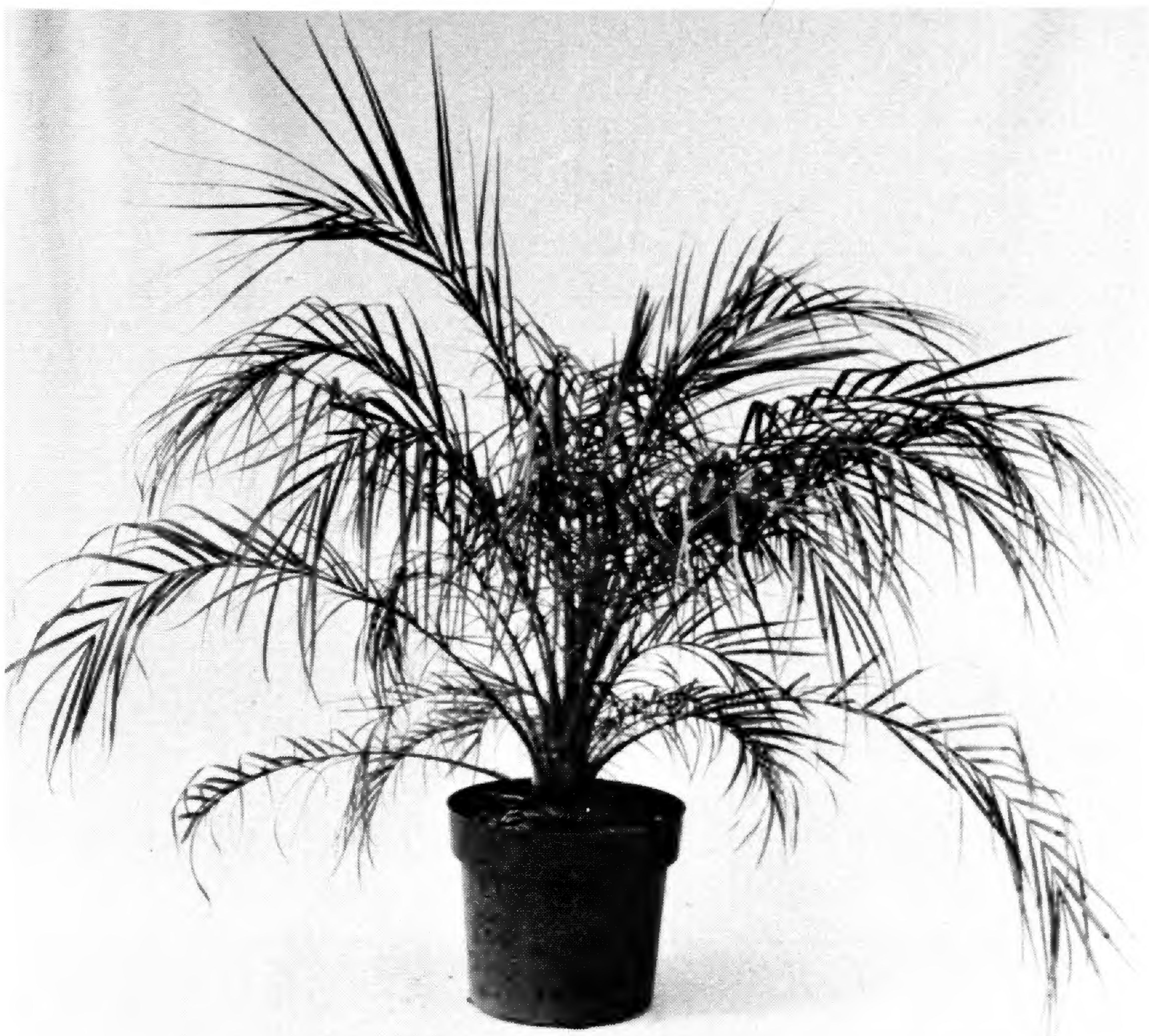
Finely divided foliage of the pygmy date palm (Phoenix roebelenii) tops a slender trunk that will grow to about 6 feet tall.