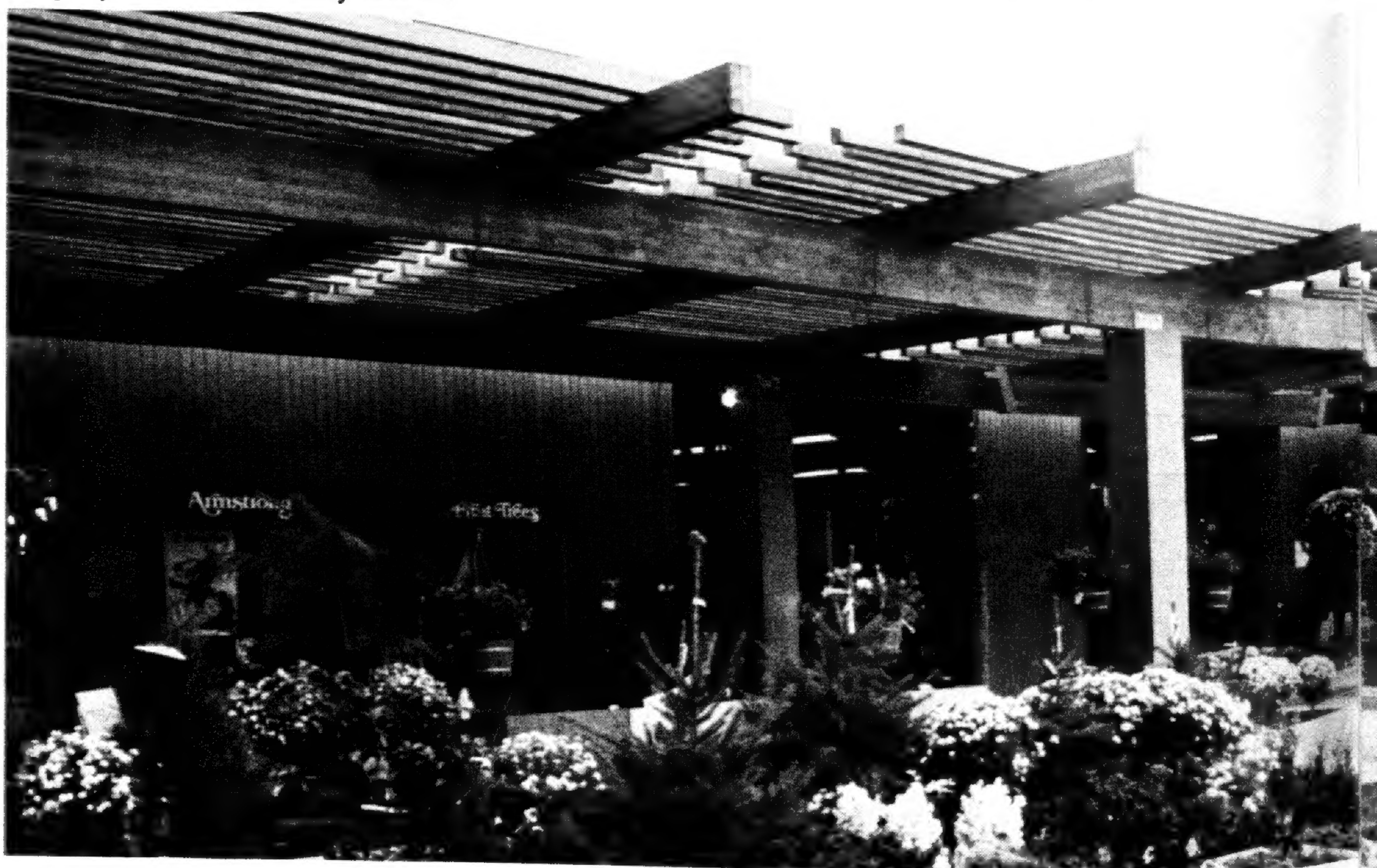
Right The new ramada adds 24,000 square feet of outdoor display space to the Hall of Environmental Education.