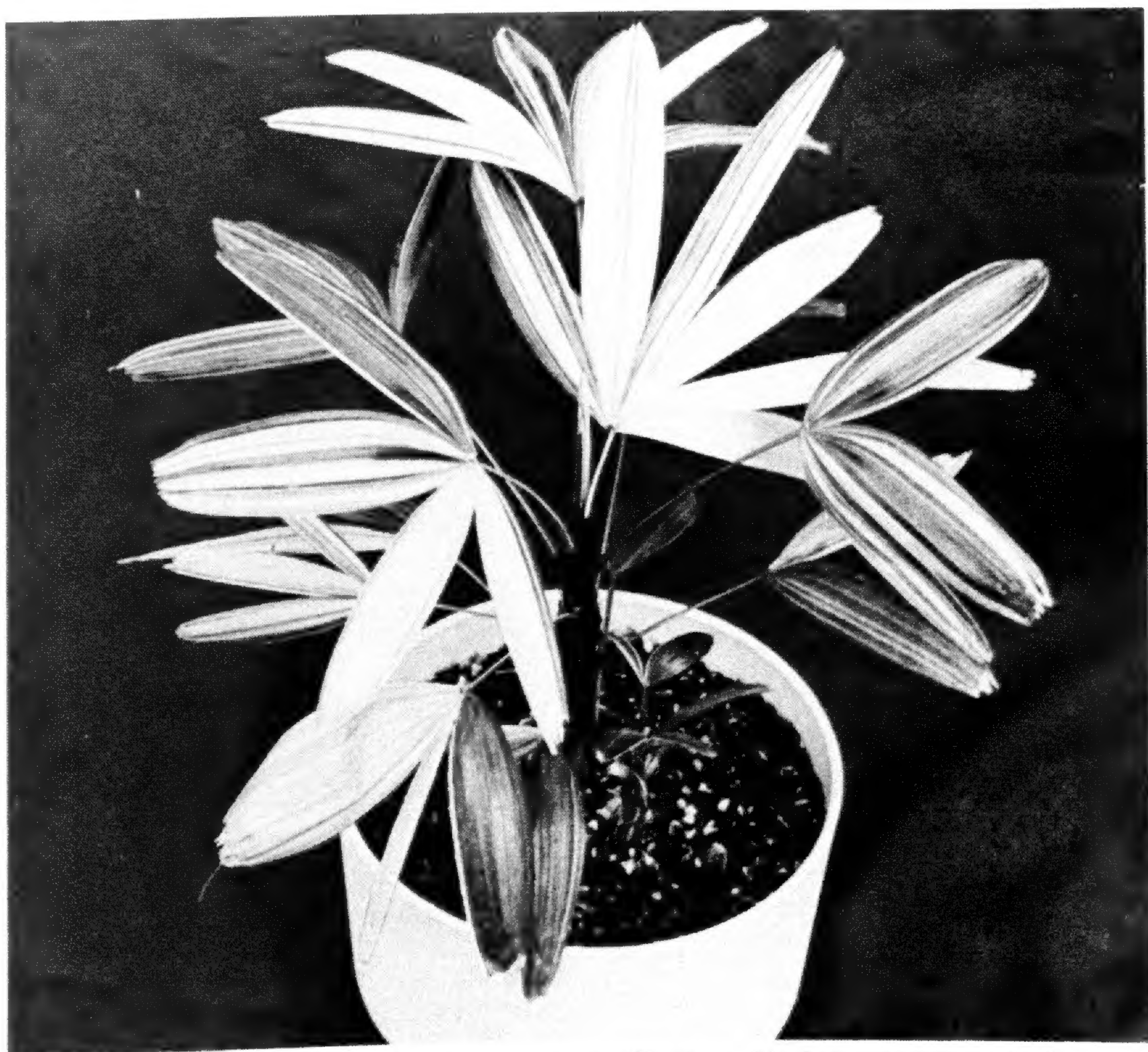
The dwarf lady palm (Rhapis excelsa) 'Zuikon-Nishiki' is one of the rare palms for sale at Baldwin Bonanza XII.