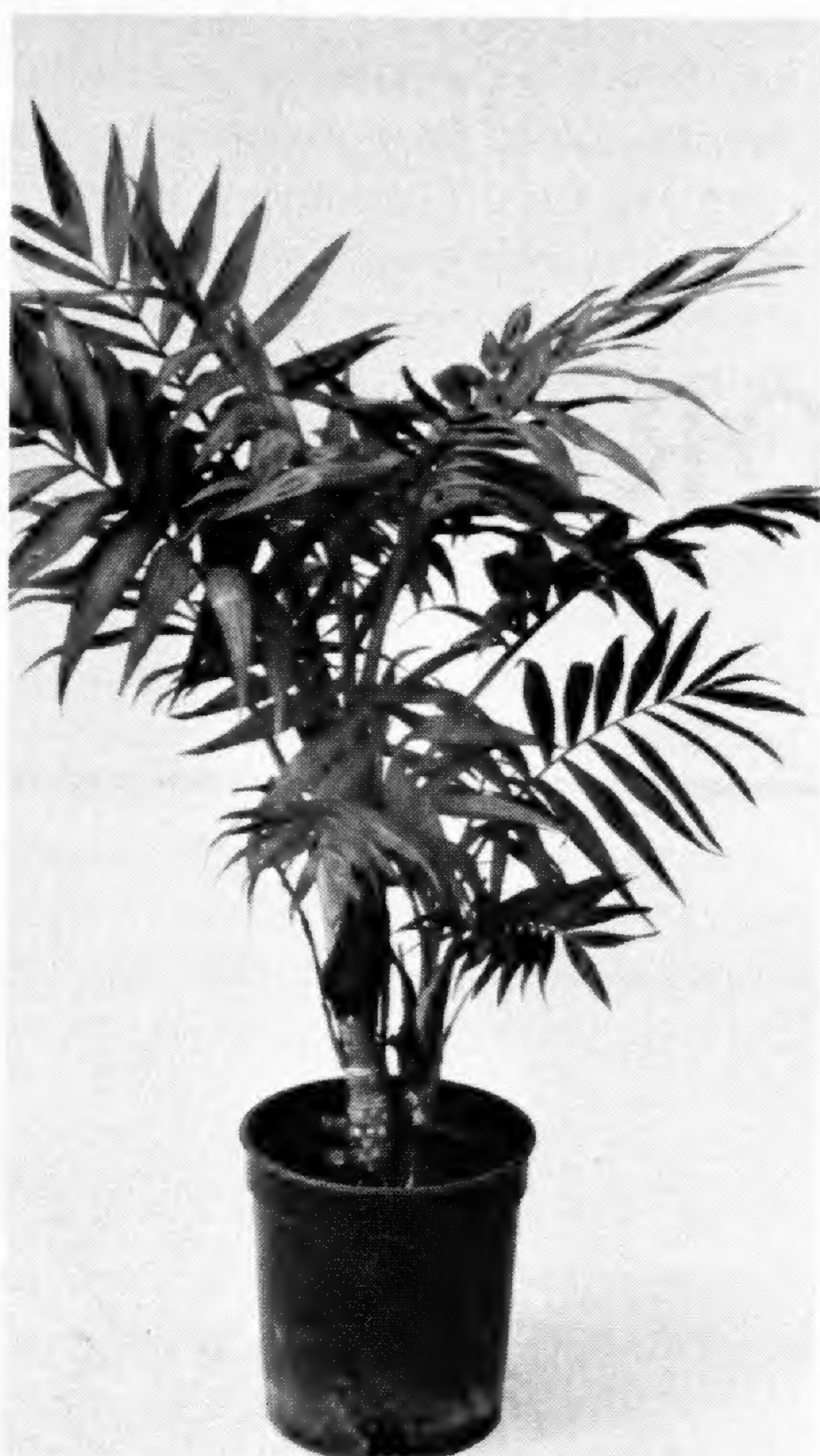
Deep green foliage and adaptability to low light situations earn Chamaedorea elegans the common name of "parlor palm." This well-mannered palm grows to about 4 feet at maturity.

Palms are monocots, that is, related to bamboos and grasses, so they have a quite different trunk structure from the typical forest