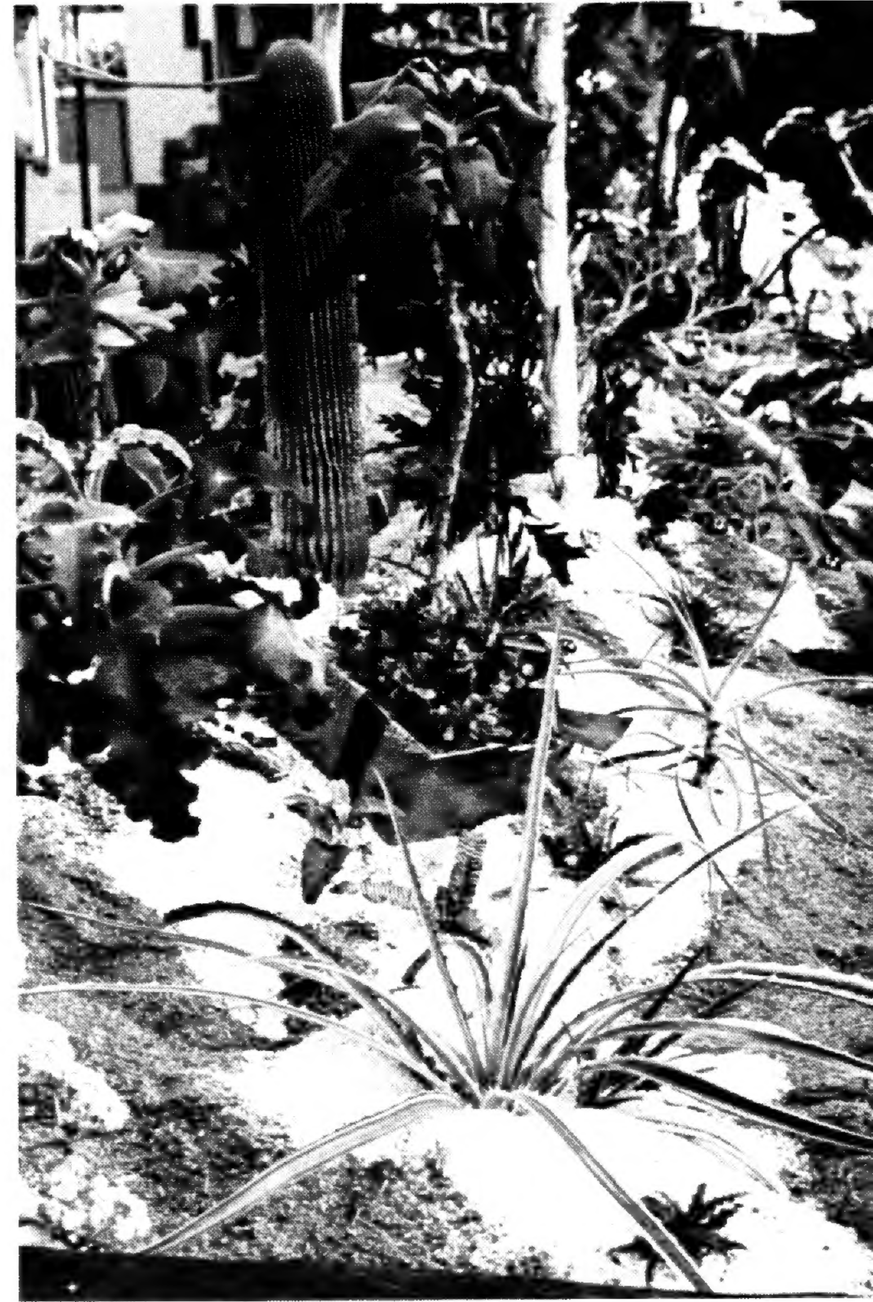
Chrysanthemums, succulents, reindeer and bromeliads highlight some of the imaginative gardens at the Santa Anita Flora and Garden Exposition at the Arboretum. Exhibits by 16 specialty plant growers filled the Hall of Environmental Education and the front patio.