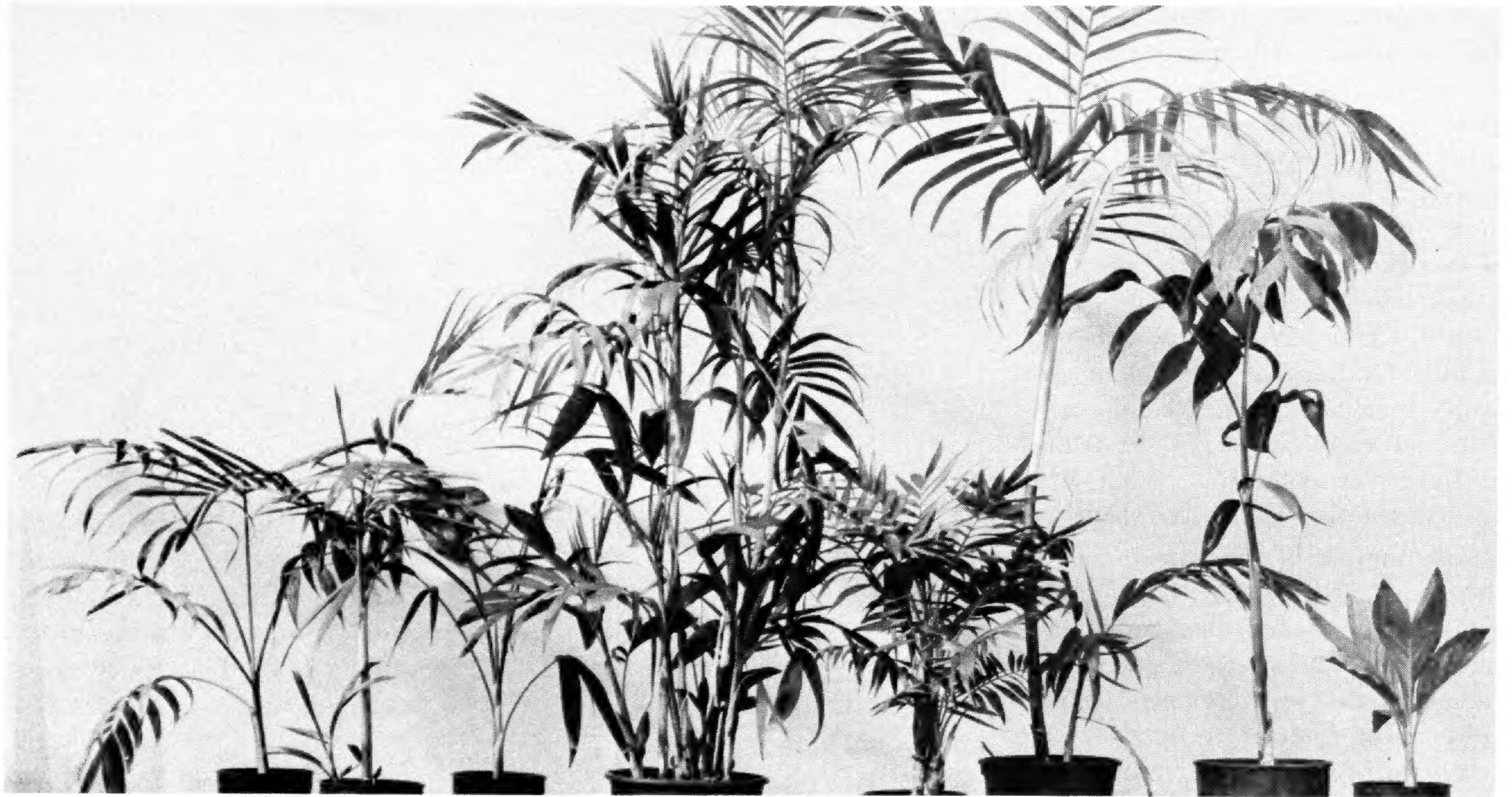
Eight species of chamaedorea palms will be for sale at Baldwin Bonanza XII.