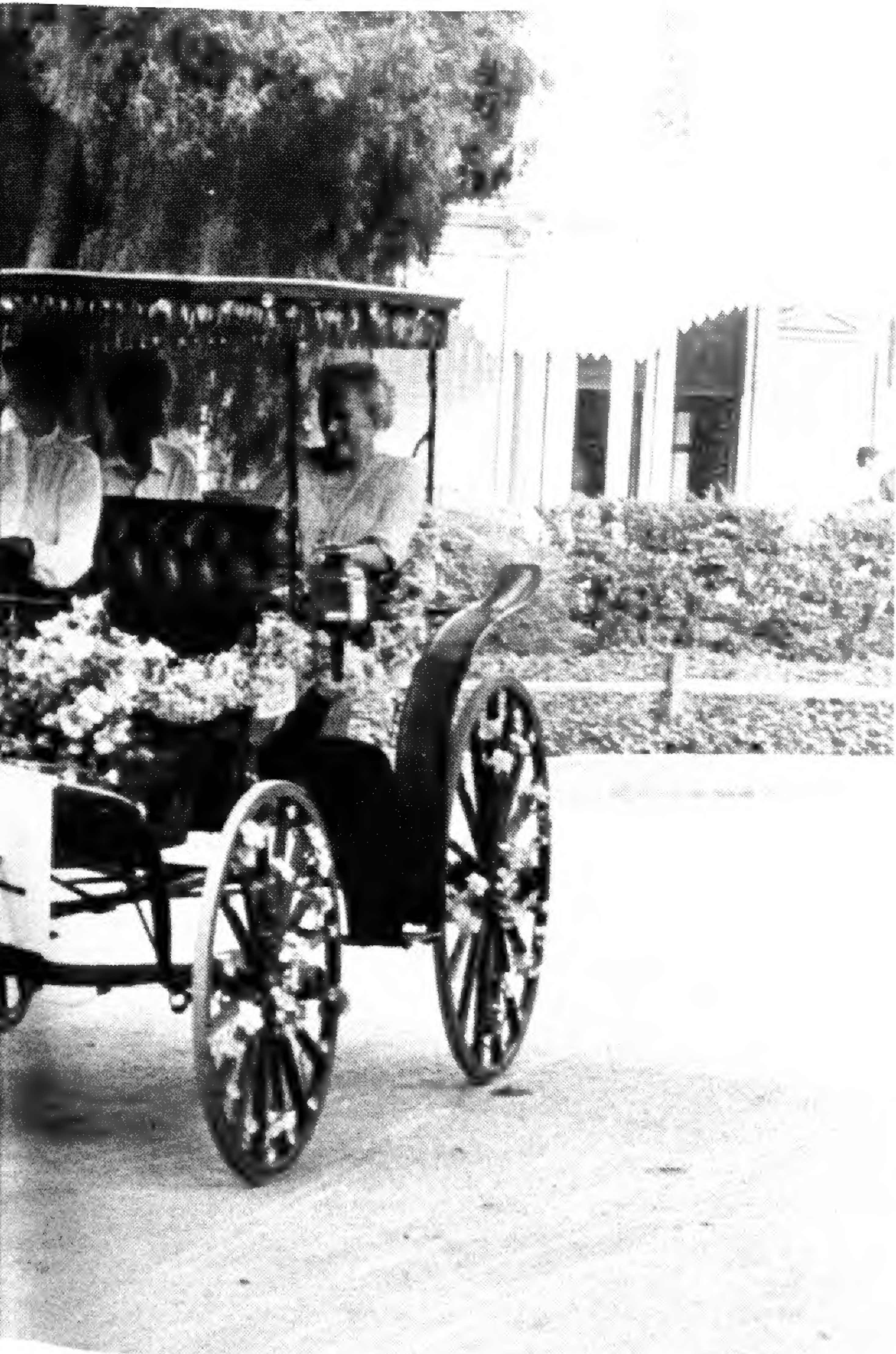
BELOW Guests enjoy trips through the Arboretum in a horse-drawn carriage.