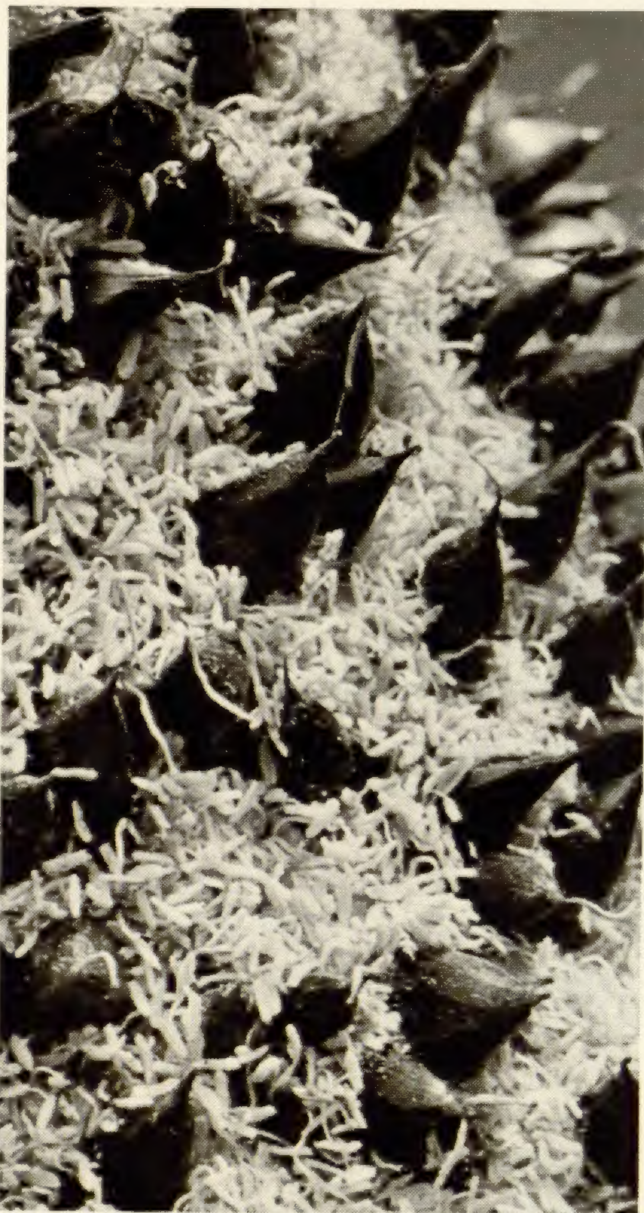
Hundreds of dark brown fruits of X. quadrangulata jut like small bird beaks from the surface of the spike. Each leathery capsule is about one-half inch long by one-fourth inch wide and contains small black seeds.

and narrow with broad bases. They may be spreading or somewhat recurved. Leaf length and width range from three or four feet long by one-fourth inch wide in X. arborea to one or two feet long by one-twelfth inch wide in X. minor . Leaf shape in cross-section may be flat, triangu-