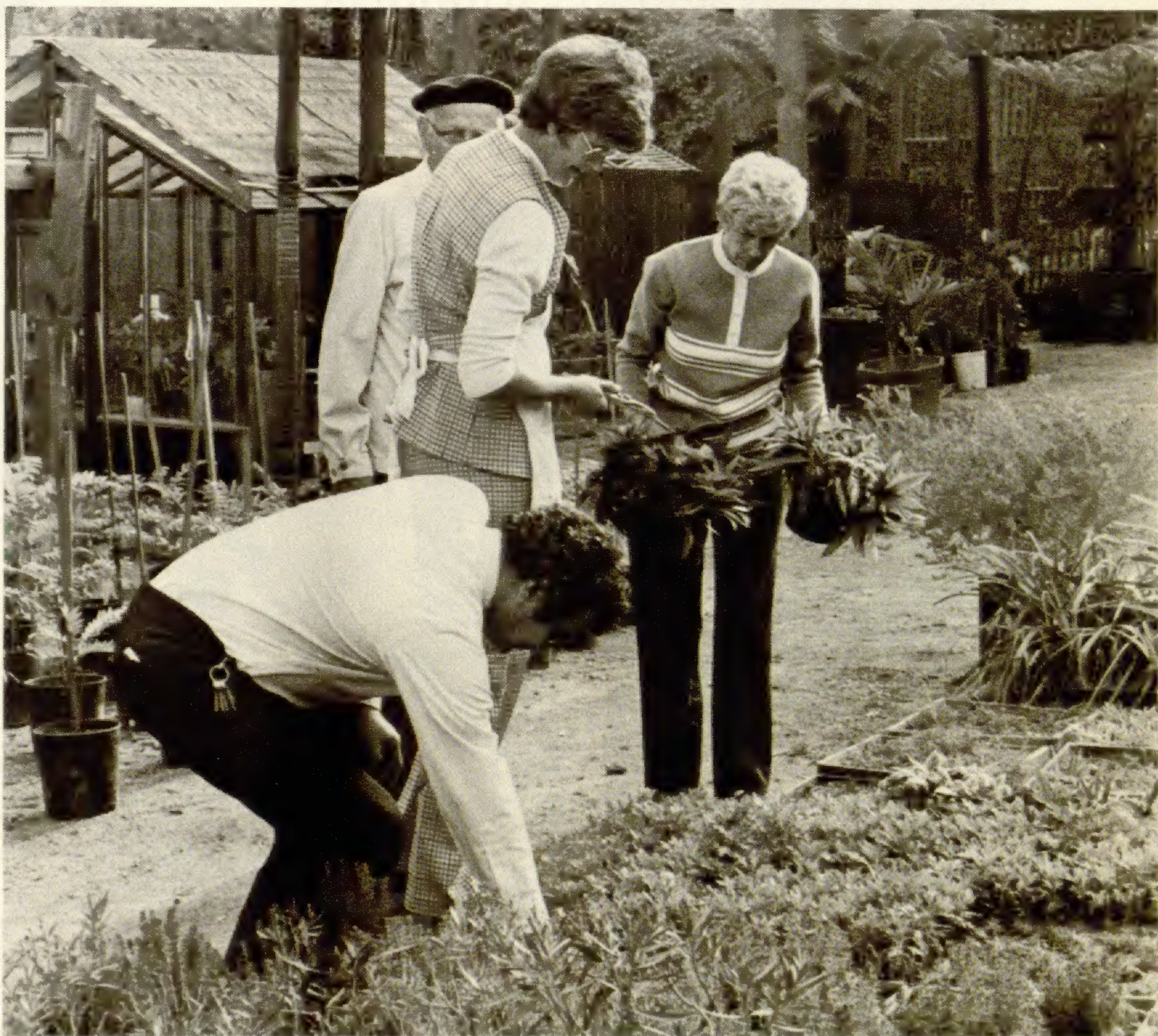
South Coast Botanic Garden staff and Foundation members collected thousands of plants for the Fiesta de Flores May 17 and 18. The sale this year was the most profitable one to date.