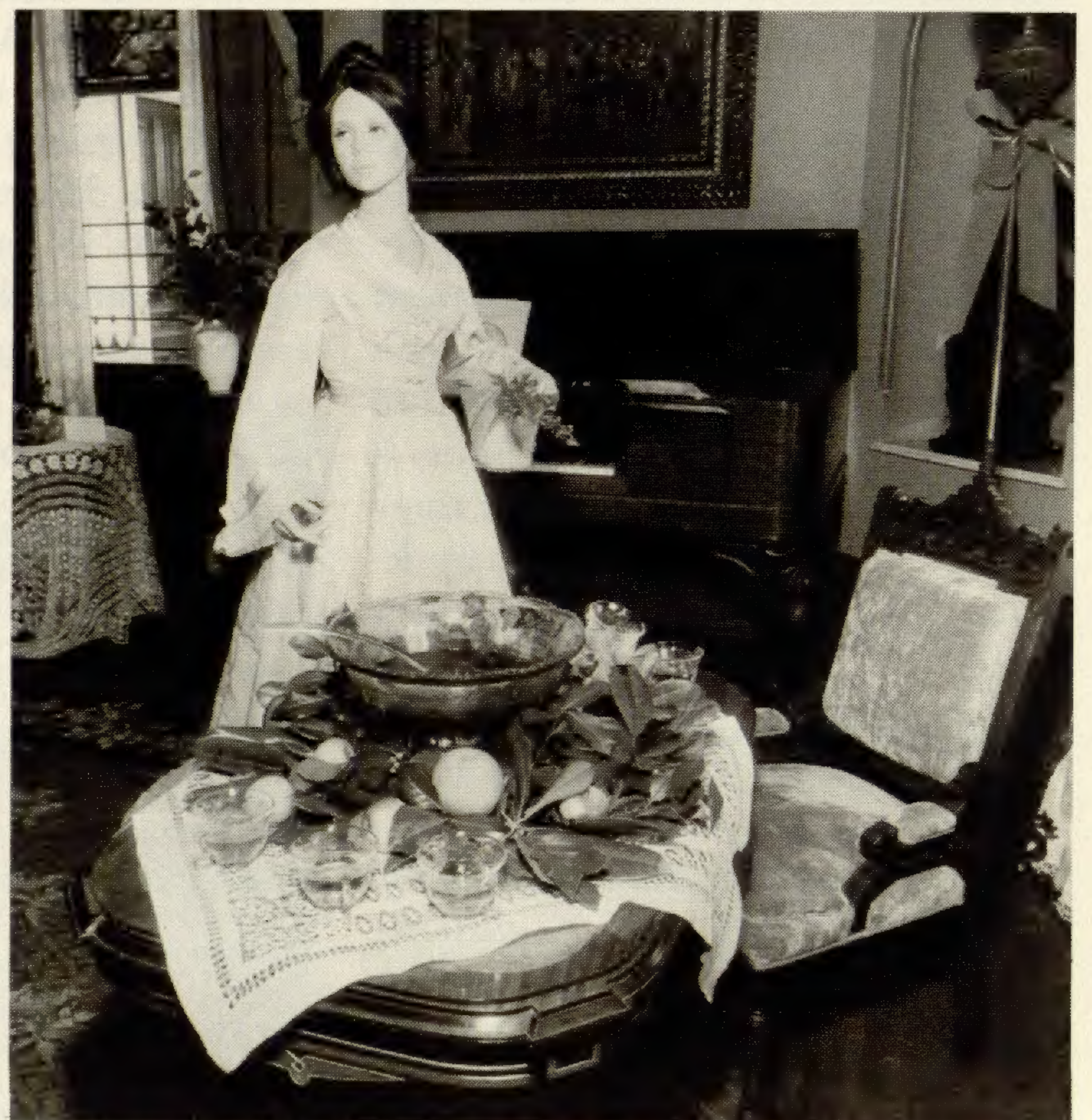
Happy Holidays — Christmas trees, a brimming punch bowl, and toys from the Victorian era will evoke the spirit of Christmas as it may have been celebrated in the Queen Anne Cottage almost a century ago. Foundation