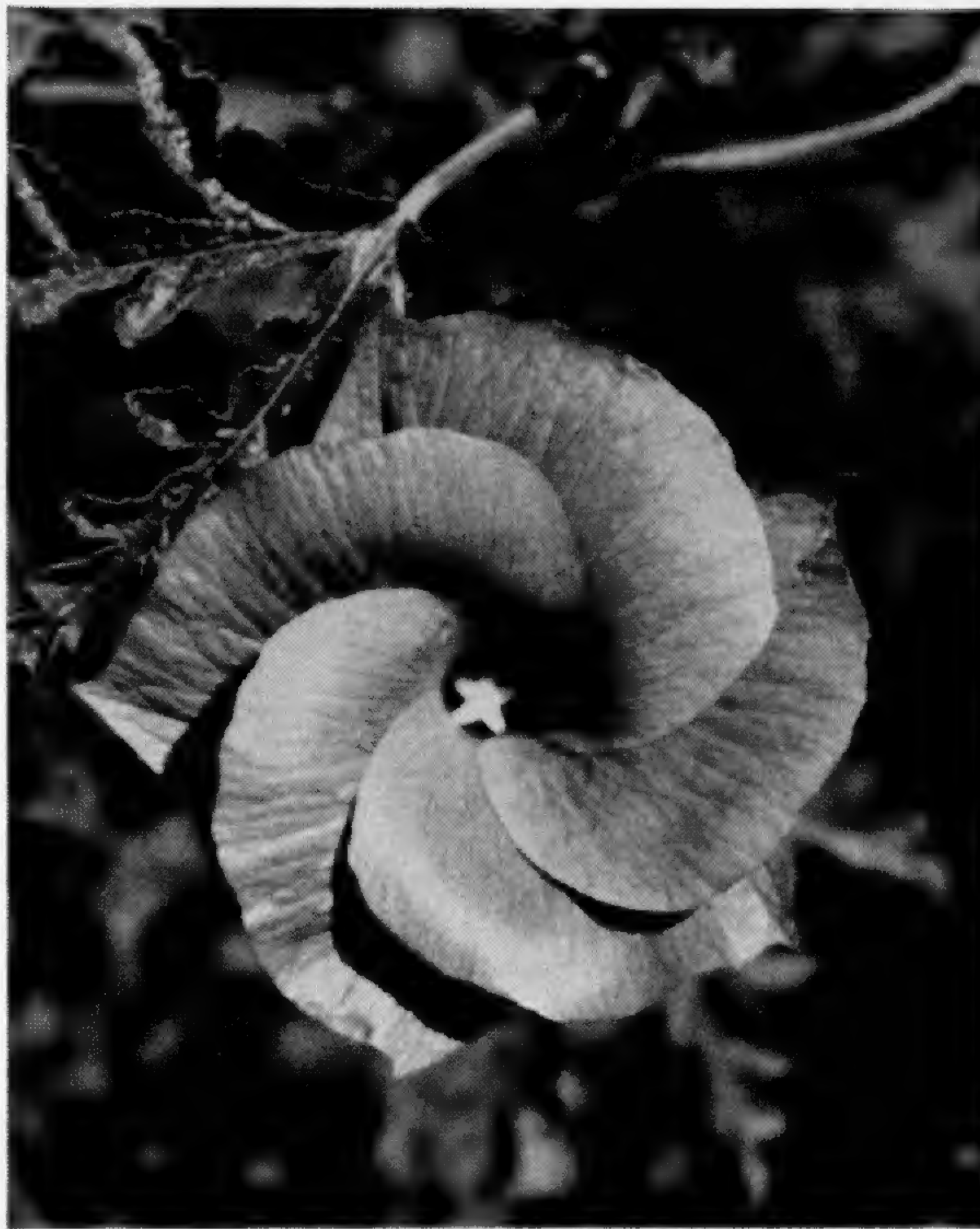
The Blue Hibiscus, Alyogyne huegelii, native to Australia was introduced by the Los Angeles State and County Arboretum in 1968.