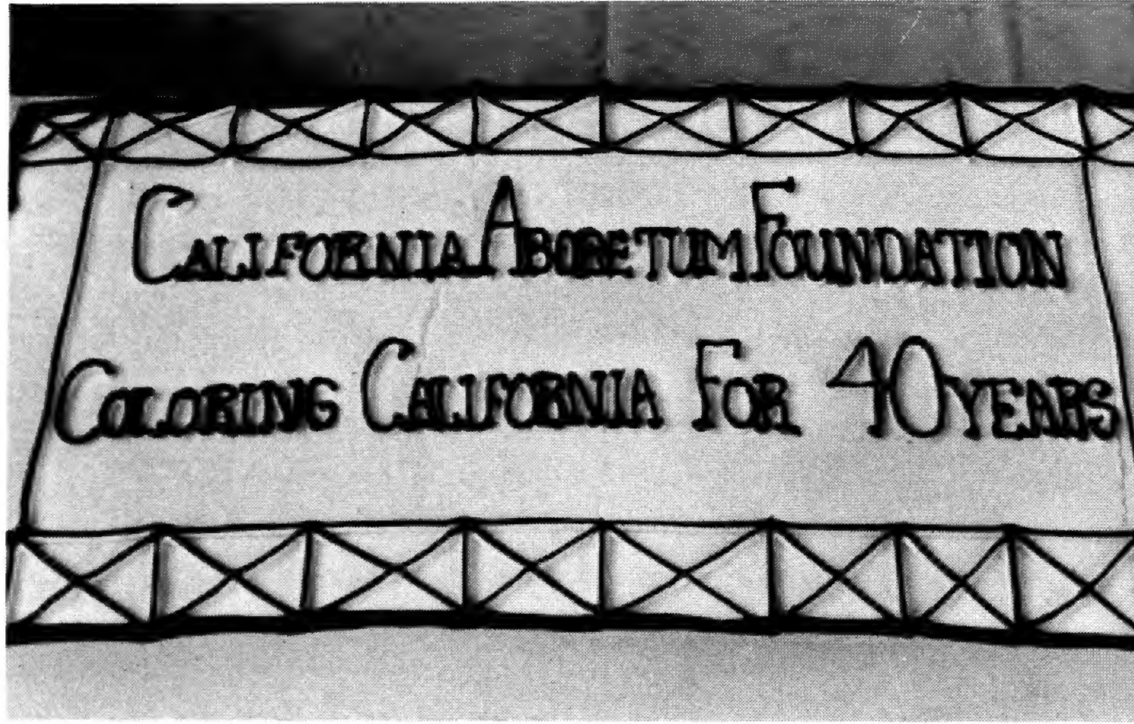
The Foundation's fortieth anniversary logo on our birthday cake at the Annual Meeting.