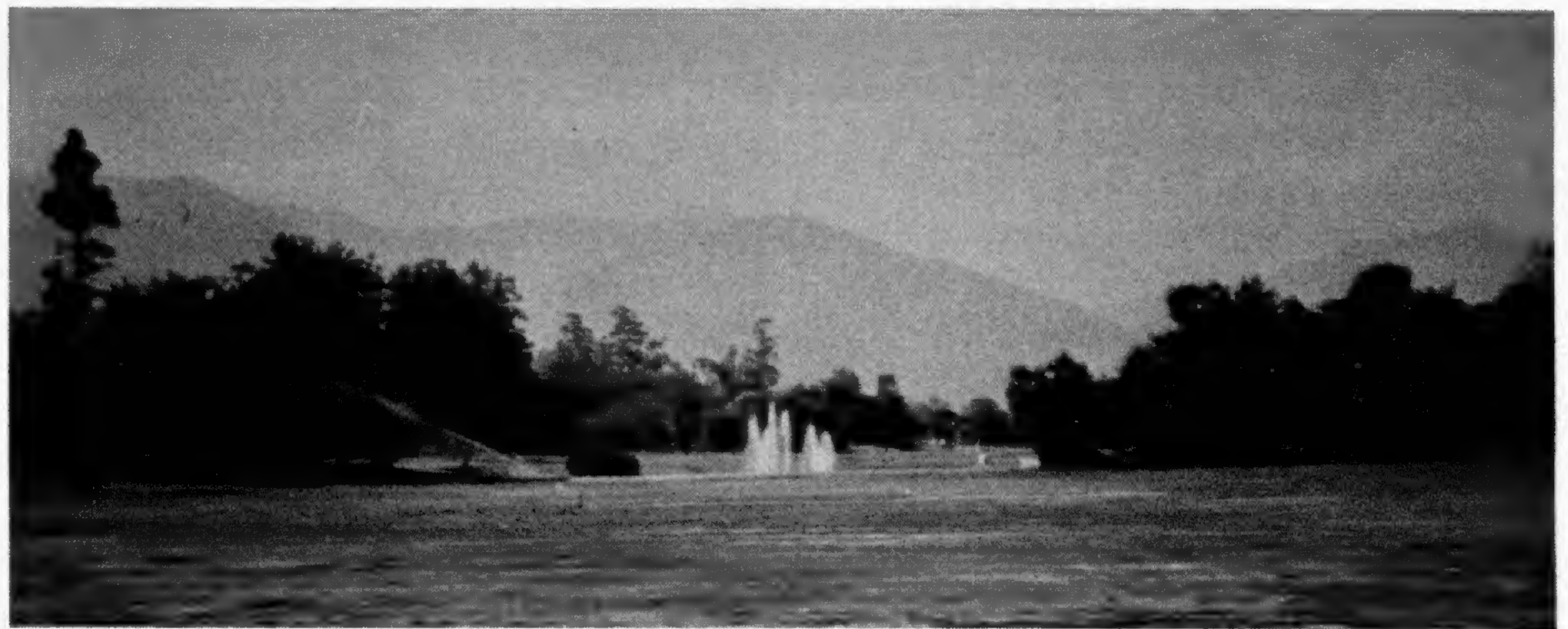
Concert guests will enjoy an evening on the lawn facing the Bauer pool and the mountains.

Country and Western singer Louise Mandrell will be the star of the 1988 Summer Concert on Saturday evening, August 20. Co-sponsored by the California Arboretum Foundation and the Arcadia Chamber of Commerce, the performance will take place on the grounds of the Arboretum. The evening will begin with a "Picnic in the Park," a competition for the best picnic setting, from 6:00 to 8:00 P.M. Bring your own picnic supper and join the fun of the contest! The concert will begin at 8:00 following the picnic. Tickets at $15 per person, may be purchased at the CAF Office, the Arcadia Chamber of Commerce Office at 388 West Huntington Drive, and at Hinshaw's Department Store, Arcadia. Come enjoy an evening under the stars and support the Arboretum!