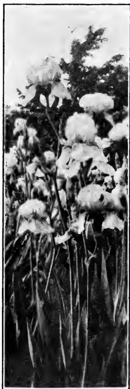
Iris Old Ivory (Sturtevant). Ivory toned with bronze-veined haft. Three feet.