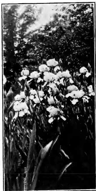
Iris Flutterby (Sturtevant). A low, soft cream yellow for garden effect.