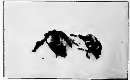
Mallards starved and found in the snow in western Montana.

In the lower Flathead valley the snow was reported four to 14 feet deep. Two assistants were employed by the Commission to aid Deputy Goldsby. Ranchers in the Valley View region fed large numbers of game birds gathered on hay stacks and sheltered spots.