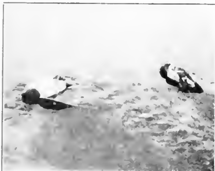
Dead mallards found floating on Spring Creek, near Ronan.