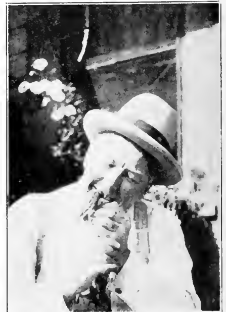
This wee canary is another of the trained feathered friends of the Grass Range druggist who teaches birds to understand and visit with him.