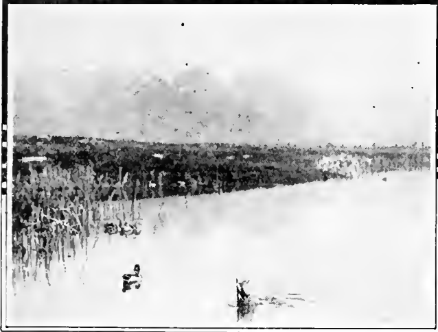
◇ MALLARDS NEAR NINE PIPES RESERVOIR ◇