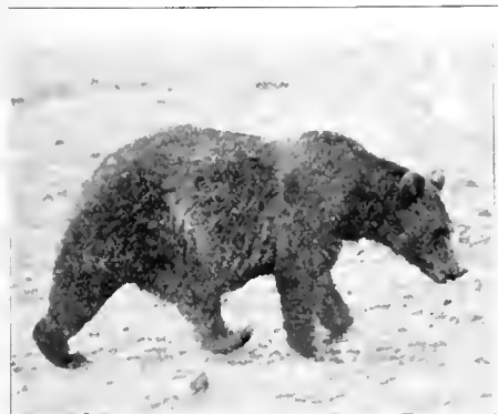
He's on the run and knows where he's going.

The bear should not be exterminated because they destroy the young of some of the other animals, no more so than the elk should be killed off because they eat the food of the deer or mountain sheep. All are game animals and should be managed so that all can ex-