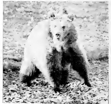
No love lost here.

to roar and the whole bunch of them started our way as fast as they could come, the old one with one shoulder shot away. We retreated a little to our rear to a large boulder and had not long to wait until they came, the crippled she-bear and one other running along the brink of the canyon. My partner made a deadly shot that rolled the big bear over the brink into the canyon where she tumbled for five hundred feet and then crawled to within two yards of the water's edge before stopping.