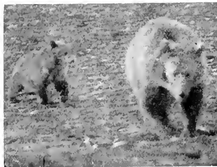
Here they come, straight for the photographer.

Dismounting, we crept to a little ridge and shot the old female. She started