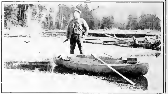
◇ A VICTIM OF DUCKITIS ◇