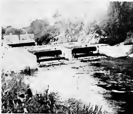
Front view of fish wheel in big ditch leaving the Madison river near Ennis, showing paddle wheels and concrete work. Screened wheels are installed immediately back of the protecting paddle wheels.

Salvation Army Girl (to Scotchman): "Will you give a quarter for the Lord?" "How and are ye, Lassie?" "Eighteen." "Ah, well, I'm seventy-five. I'll be seem' Him afore you, and I'll hand it to Him myself."