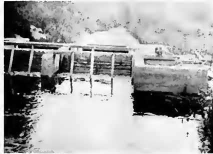
Reverse view of the fish screen wheels on the Madison river ditch, showing the screened wheels and protection against floating debris. The wheel is arranged in such manner that chips and branches pass over without damage.

Similar work is being conducted in the state by the United States Bureau of Fisheries. Plans of the federal department call for installation of wheels on the Jocko project and in the Sun river area near Great Falls, the pre-