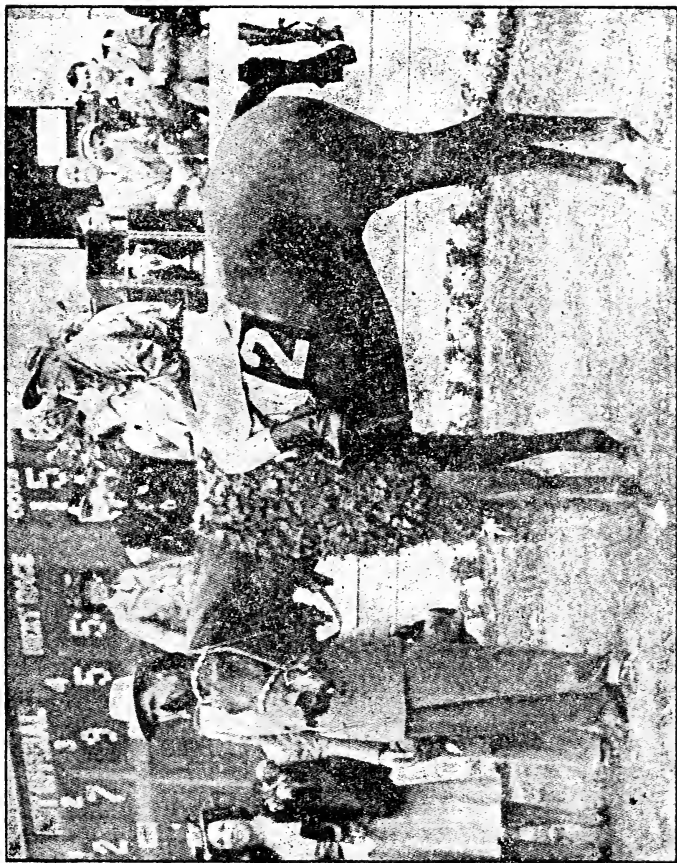
HOOP, Jr., 1945 Kentucky Derby Winner Jockey Eddie Arcaro up