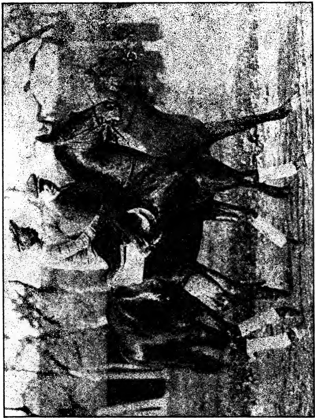
MORVICH IN FOREGROUND WITH STABLE BOY UP. OTHER FIGURE THAT OF CHARLEY WHITE, MORVICH'S ASSISTANT TRAINER