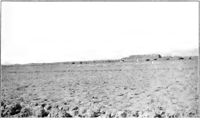
FIG. 2.—GULLS DESTROYING FIELD MICE IN THE ALFALFA FIELDS OF HUMBOLDT VALLEY.