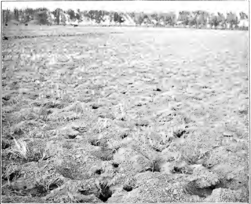
FIG. 1.—ALFALFA FIELD DESTROYED BY FIELD MICE. GENERAL CONDITION OF FIELDS IN HUMBOLDT VALLEY, NEVADA, IN NOVEMBER, 1907.