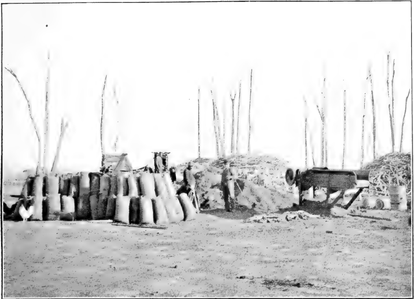
FIG. 1.—PREPARATION AND SACKING OF ALFALFA HAY, INDICATING THE EXTENT TO WHICH IT WAS USED IN POISONING OPERATIONS IN HUMBOLDT VALLEY, NEVADA.