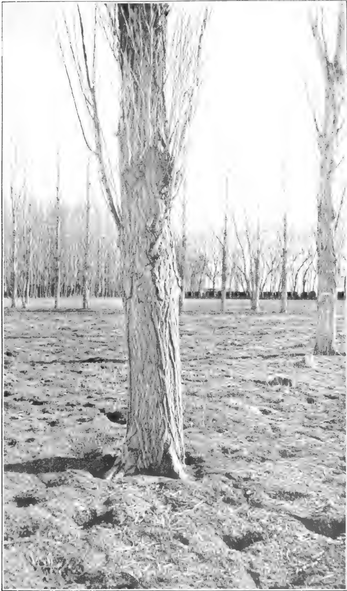
LOMBARDY POPLAR GIRDLED ABOUT THE BASE BY FIELD MICE. MOUSE HOLES UNDER THE TREES.