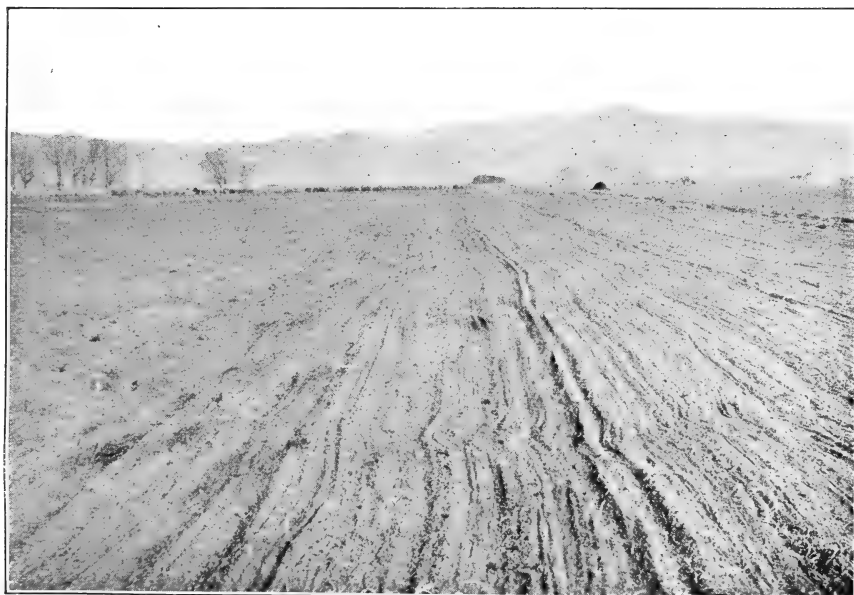
FIG. 2.—EFFECT OF BRUSH DRAG.