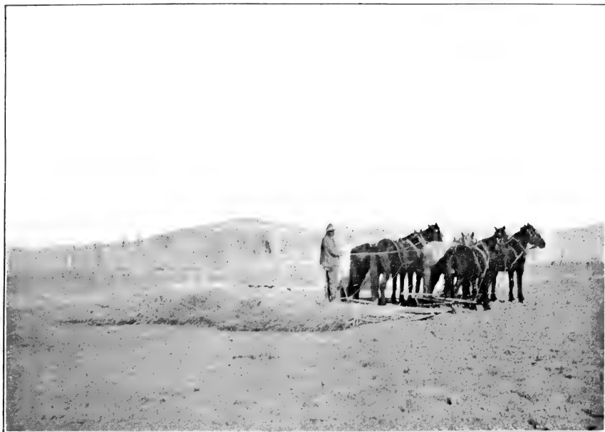
FIG. 1.—BRUSH DRAG USED TO OBLITERATE MOUSE BURROWS.