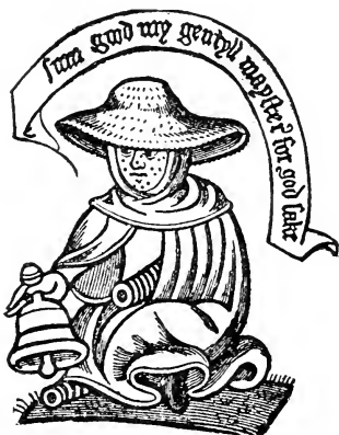
From a MS. Pontificale ad usum Ecclesiae Romanae et Anglicanae. XIVth Cent.

V. i. 16. ' Bid sorrow wag, cry hem! ' The Quarto and the first and second Folios read, ' And sorrow wadge, crie hem '; Folio 3, ' And hallow, wag, cry hem '; Folio 4, ' And hollow wag, cry hem. ' Many emendations have been suggested. Capell's ' bid sorrow wag, ' is now generally adopted. Johnson proposed ' Cry, sorrow wag! and hem. ' ('Sorrow wag,' like 'care away,' was probably a proverbial phrase.) One other suggestion is perhaps noteworthy:—' And, sorry wag, cry hem. '