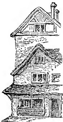
From an engraving of an old timber-house in the market place at Stratford-on-Avon.

Picty , Dogberry's blunder for "impiety"; IV. ii. 78.