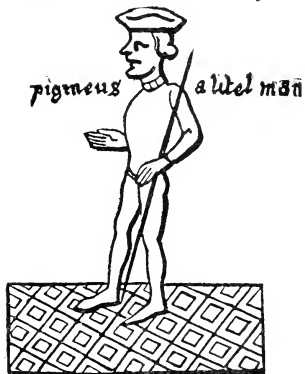
This curious fanciful representation is reproduced from MS. Bibl. Reg. 17 c. 38.

Pigmies , a race of dwarfs fabled to dwell beyond