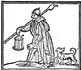
Watchman with bill, lantern, bell and dog. (From a woodcut in Decker's English Villanies , six severall Times prest to Death by the Printers.)