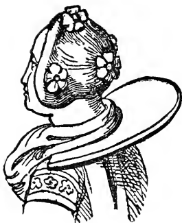
From a Monument in Ashford Church, Kent.

Reasons (punning, according to some commentators, upon "reasons" and "raisins"); V. i. 209.