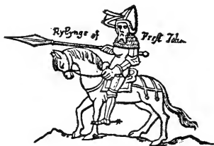
From a MS. (Bibl. Reg. 17 c. 38 of Mandeville of the XVth Cent.)

Prester John , Presbyter John, a mythical Christian King of