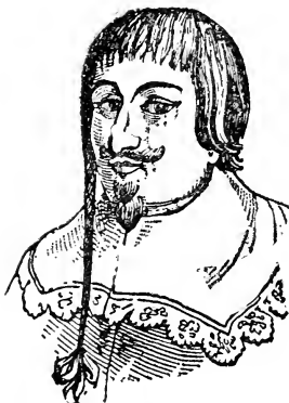
From a portrait of Christian IV. of Denmark.

Lock ; "he wears a key in his ear, and a l. hanging by it," a quibbling allusion to the "love-locks" worn at the time, and perhaps to the fashion of wearing roses in the ears; V. i. 316.