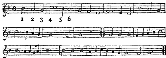
From Naylor's Shakespeare and Music.

stir, "the devil to pay"; V. ii. 98. Coldly , quietly; III. ii. 128. Commodity , any kind of merchandise; III. iii. 183. Company , companionship; V. i. 191. Comprehended , blunder for "apprehended"; III. v. 49. Conceit , conception; II. i. 300. Conditions , qualities; III. ii. 65. Confirmed , unmoved; V. iv. 17. Consummate , consummated; III. ii. 1. Contemptible , contemptuous; II. iii. 181.