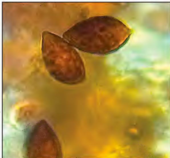
Figure 2. Cortinarius spores using the Newton NM1 and an iPhone.

For a powerful, well-made microscope at a great price, to easily carry to forays etc or even use in the field you need look no further than this amazing unit. I wish the company every success with this remarkable product.