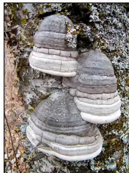
Fomes fomentarius

The presence of antibacterial, antiviral and antifungal activity in amadou has long been recorded (Brandt & Pirano 2000). A recent study (Seniuk et al 2011) looked at the water-soluble melanin-glucan complex (MCG) in Fomes fomentarius . In vitro, MCG completely depressed growth of Candida albicans . It showed antimicrobial effect on Helicobacter pylori identical to erythromycin at all concentrations. High anti-HIV-1 activity, along with weak toxicity against blood cells, make it a great adjunct therapy for these difficult infectious pathologies. Work by Suay et al (2000) showed amadou's inhibition of two opportunistic bacteria, Pseudomonas aeruginosa and Serratia marcescens . The former is showing increasing antibiotic resistance and is a leading cause of hospital-acquired infections in the United States and Canada. Serratia marcescens causes pulmonary disease and septicemia in immune-compromised patients.