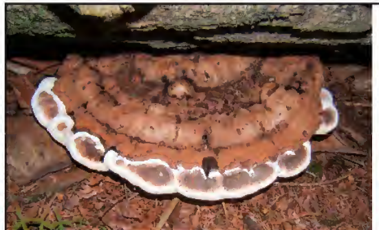
Ganoderma applanatum

Take one part by weight of finely chopped conk and cover with five parts by volume of 95% alcohol. For example, 100 g of material is covered with 500 mL of 198 proof Everclear. Let this sit for two weeks, shaking daily. Then strain and squeeze, preserving the marc. Take this well pressed material and make a 1:20 decoction at a slow simmer. Reduce volume by half, squeeze, strain and combine this decoction with the alcoholic preparation you made earlier. Bottle and label. Therapeutic dosage is 3–5 mL daily in divided doses.