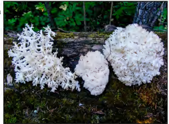
Hericium coralloides

In one Japanese study, 50 of 100 patients in a rehabilitation hospital received 5 g of dry, powdered lion's mane mushroom in soup. The other 50 patients received placebo powder. All patients were elderly and suffering from cerebrovascular disease, Parkinson's disease, spino-cerebellar degeneration, diabetic neuropathy, spinal cord injury, and various degenerative orthopedic diseases. After six months, six of seven patients with severe dementia taking the daily mushroom dose demonstrated improvement in perceptual