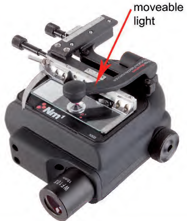
Figure 1. The Newton NM1 Portable Microscope

The biggest challenge with any portable microscope is of course to reduce the size of the instrument and this is achieved in this case by bouncing the light path backwards and forwards using a series of highly reflective mirrors. Cambridge Optronics, one of the distributors of the microscope have an excellent visual of this on their website www.cambridgeoptronics.com .