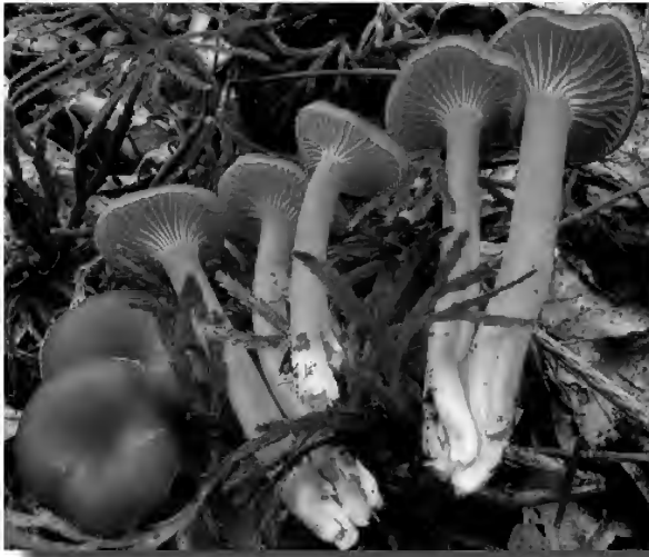
Walt Sturgeon: Hygrocybe appalachiensis