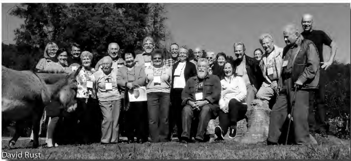
Trustees meeting participants at the NAMA Arkansas Foray and a burro on the left, who insisted it be in the picture!