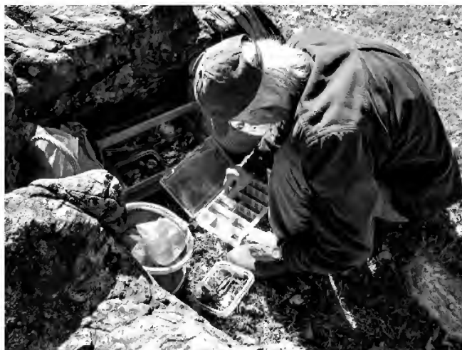
Collector of tiny fungi from the NAMA Foray in Arkansas, 2013