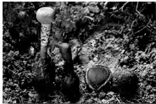
Todd Elliott: Pseudotulostoma volvata