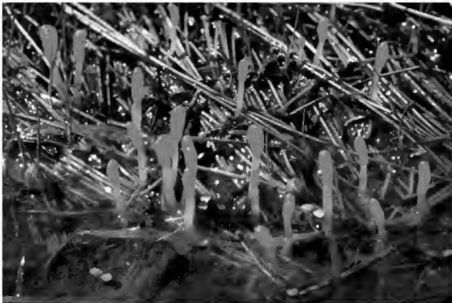
Figure 2. Fen near Salvage, June 17, 2006