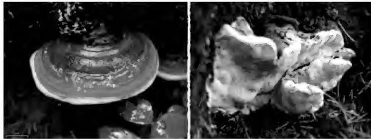
Fig. 2. Left: The mushroom species most commonly found in this study, Fomitopsis pinicola . Source. Right: The second most common mushroom species in this study, Heterobasidion sp. Shown here is a representative of this genus, H. annosum . (See Reference)

Ovaskainen O, Schigel D, Ali-Kovero H, Auvinen P, Paulin L, Nordén B, & Nordén J (2013). Combining high-throughput sequencing with fruit body surveys reveals contrasting life-history strategies in fungi. The ISME journal, 1709, 1696-709 PMID: 23575372