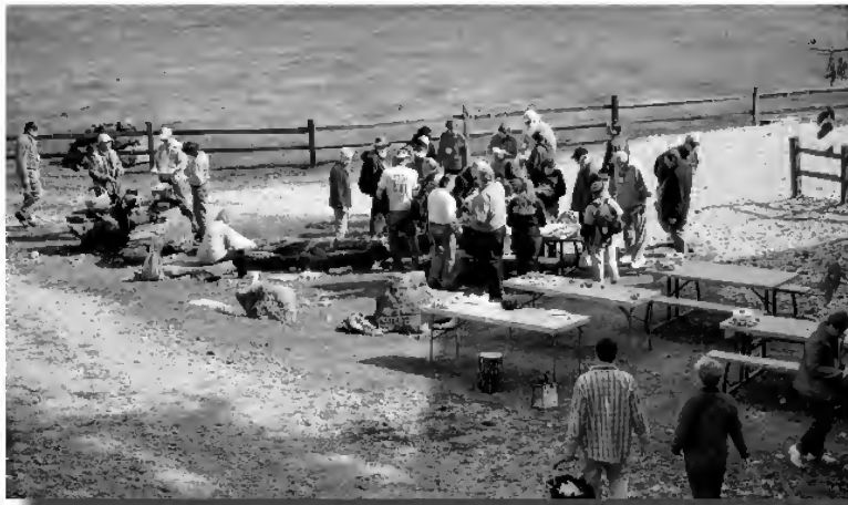
Sorting incoming fungi at the Arkansas Foray

Bottom line: people in the retail grocery business are at the mercy of the folks who sell them wild mushrooms. They have to trust that no mistakes are made, and that all matsutakes (and other mushrooms) they purchase and offer for sale are in fact what the buyer certifies. No oversight. No fact checks. I know this was a harmless error, but what if it had been an unopened Amanita smithiana , which can cause renal failure or an Amanita ocreata , which can cause death. Hey, they look a lot like a matsutake, don’t they?