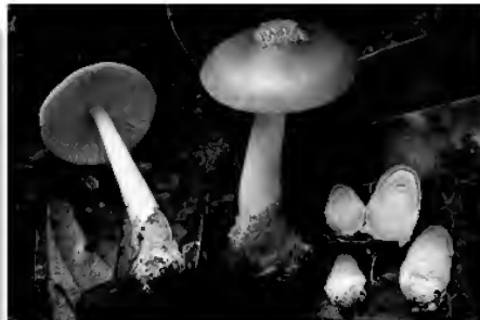
Amanita lanivolva