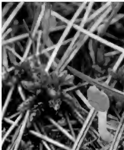
Figure 3. Fen leading to Gillams bog, June