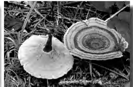
Coltricia perennis