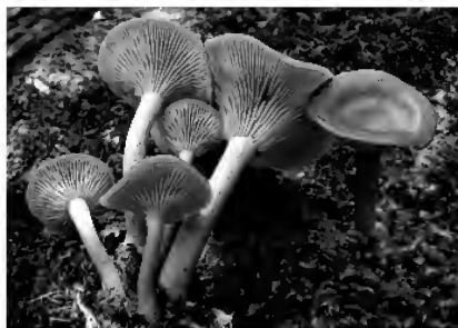
Walt Sturgeon: Pseudoclitocybe cyathyformis