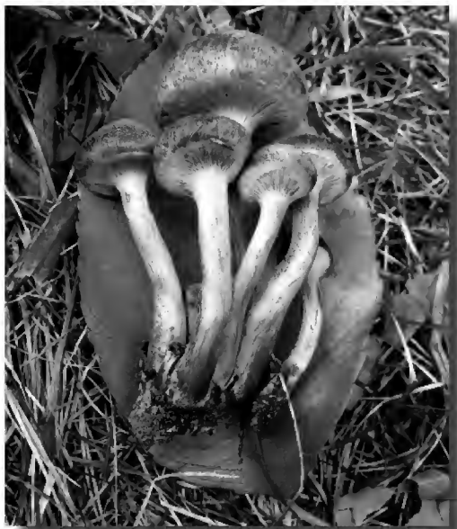
Photo and description are by Tom Bigelow of the New York Mycological Society.

Gymnopilus luteofolius , New York City, October 5, 2013