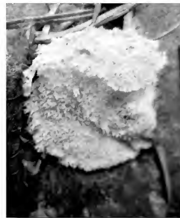
Laetiporus mollis

At home, I cut out three little pieces of the polypore and placed them in a spot plate. A drop of KOH turned the first piece dark red. The second piece got a drop of Melzer's reagent – no reaction. Since I study Ramaria species, I tried a drop of FeSO 4 , an important reagent for that genus, and the third piece with FeSO 4 turned dark green. I could find nothing in the books I had on hand about a dark green reaction of polypores with FeSO 4 , but a dark red reaction to KOH brought to mind a 2001 paper from Mycologia about Hapalopilus . They mention a cherry red reaction for the European Hapalopilus rutilans (Pers.) Murr. and their DNA work demonstrated that the European species is the same as the American species that we call Hapalopilus nidulans (Fr.) Karst. (Ko, et al, 2001). They also mention that Hapalopilus nidulans contains up to 40% by dry weight polyporic acid and that that compound is responsible for the reaction with KOH. More importantly, polyporic acid (a dihydroquinone derivative) causes damage to kidneys and central nervous system function. Three people were poisoned in Germany in two separate incidents, one in 1986 and one in 1987. Had I found Hapalopilus nidulans ? I did the microscopy, the hyphae were right; the spores looked like they fit. But I was worried that my mushroom was far more hairy than the description seemed to indicate for Hapalopilus nidulans . I couldn't find a good picture.