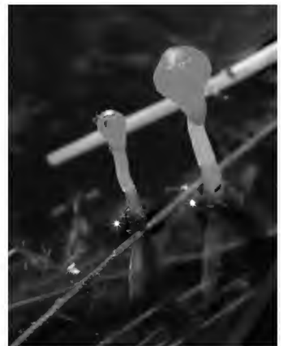
Figure 4. Fen by Doyle's, June 12, 2011

10-20 spores of one mushroom from each collection were measured under oil immersion (1,000 x magnification) using a calibrated microscope. Microscopy gave a clear