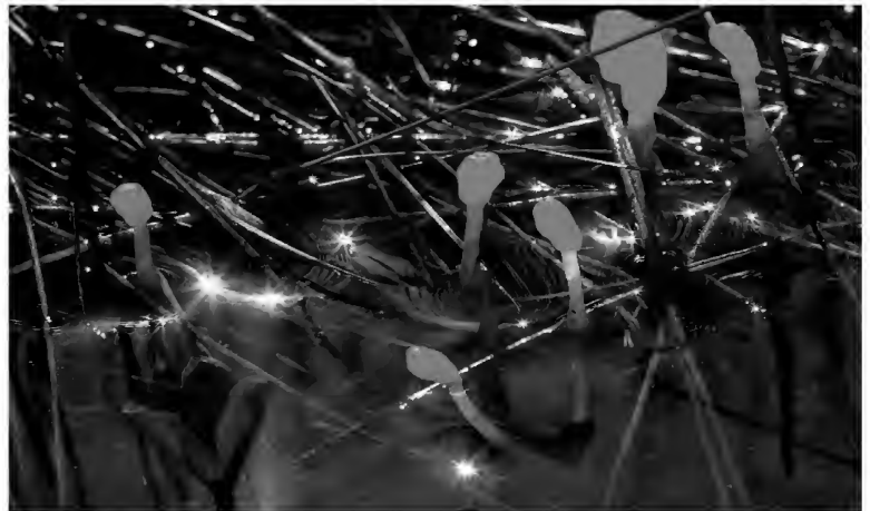
Rocky Harbour bog, June 11, 2010

(From Omphalina , 0-IV-11, December 17, 2008, newsletter of Foray Newfoundland)