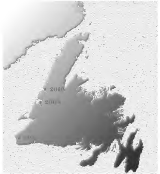
Figure 1. Location and year of my four collections