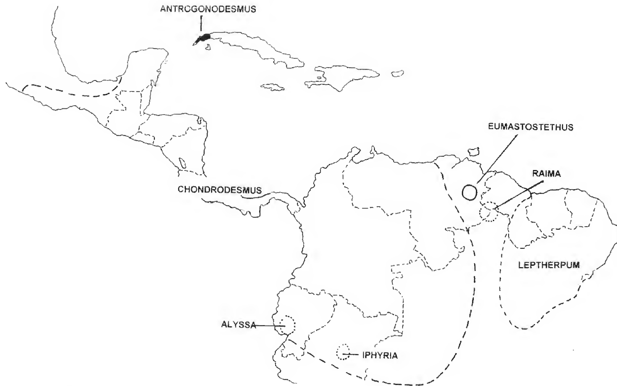
Fig. 9. Central America, the Greater Antilles, and northern South America, showing the approximate distribution of the seven genera of Chondrodesmini. The dashed line encloses the range of Chondrodesmus , to which the other genera are distinctly peripheral.