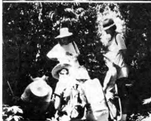
Members enjoy collecting in the creek (top) and in the rainforest (Bottom) on the ESQ excursion to Booloumba Creek in October.