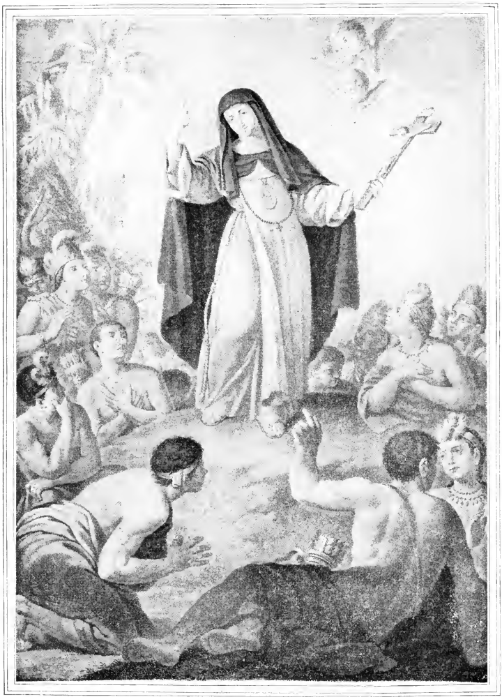
MARY OF AGREDA IS KNOWN TO HAVE BEEN FAVORED WITH THE MIRACLE OF BILOCATION: ALWAYS REMAINING IN HER CONVENT AT AGREDA, SHE WAS FOR A NUMBER OF YEARS THE FIRST MESSENGER OF THE TRUE FAITH SENT BY GOD TO THE INDIANS IN ARIZONA AND NEW MEXICO, U. S.