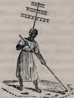
A WOMAN WITH IRON HORNS AND BELLS ON, TO KEEP HER FROM RUNNING AWAY.