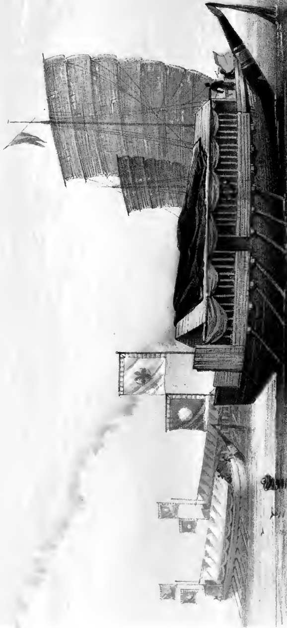
Illustration of a Junk Boat on a River, with a Bridge in the Background.