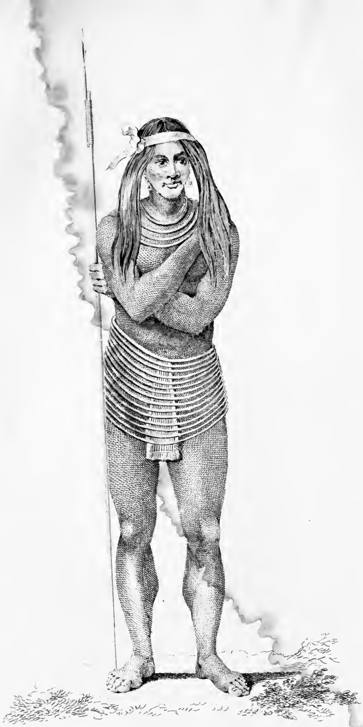
Dusun Dyak .